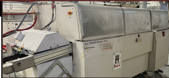
SPEEDLINE WAVE SOLDER MACHINE

VIEW COMPLETE CATALOG CHARLESTONAUCTIONS.COM