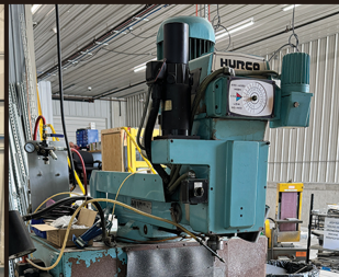
HURCO MILLING MACHINE