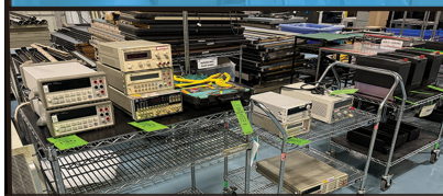
LRG QTY OF ELECTRONIC TEST EQUIPMENT