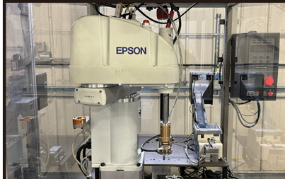
(6) EPSON ROBOT CELLS