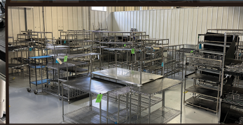
LRG QTY OF WIRE CARTS