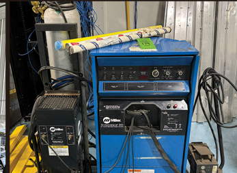
MILLER SYNCROWAVE 351 WELDER