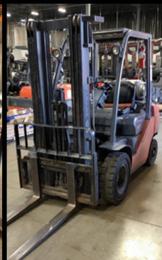
2013 TOYOTA FORKLIFT MODEL 8FGU25 HOURS 4793 SERIAL NUMBER 47038