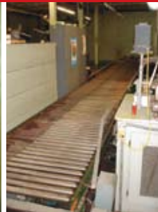
HUGE QTY. OF POWER ROLLER & SKATE CONVEYOR