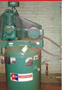
CHAMPION 5 HP VERTICAL AIR COMPRESSOR