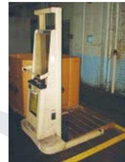
VARIOUS PALLET TRUCKS AND MATERIAL HANDLING