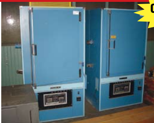
(2) BLUE M LAB OVENS