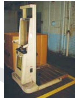
VARIOUS PALLET TRUCKS AND MATERIAL HANDLING