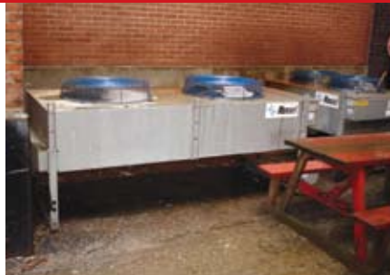
CHILLER UNIT TO GO WITH 10 HP AIR DRYER