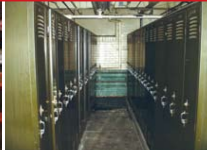
LG. QTY. OF LOCKERS