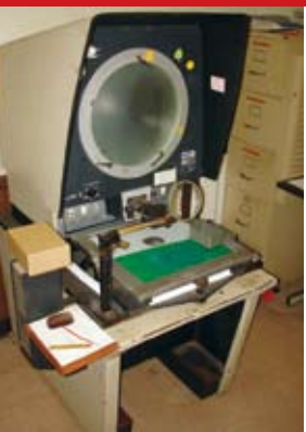
OPGI OPTICAL COMPARATOR