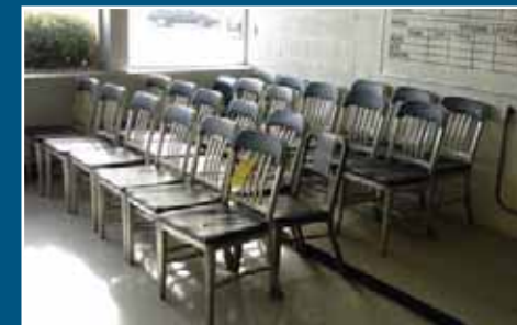
LG QTY OF CAFE & OFFICE CHAIRS