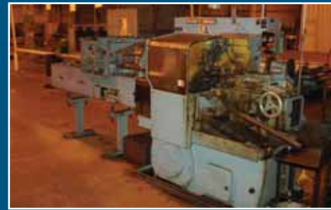
BROWN & SHARPE SCREW MACHINE