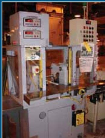
(1 OF 3) PULLY PRESSES