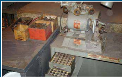
BLACK DIAMOND DRILL SHARPENER