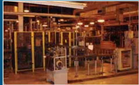
(1 OF 3) AUTOMATION ENGINEERING NO LOAD TEST STATIONS