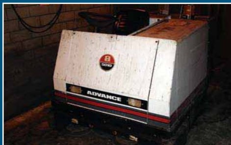
ADVANCE FLOOR SCRUBBER