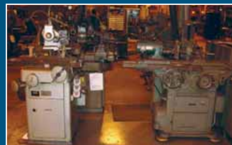
VARIOUS TOOL CUTTER GRINDERS