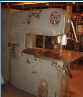
DOALL 36" VERTICAL BAND SAW