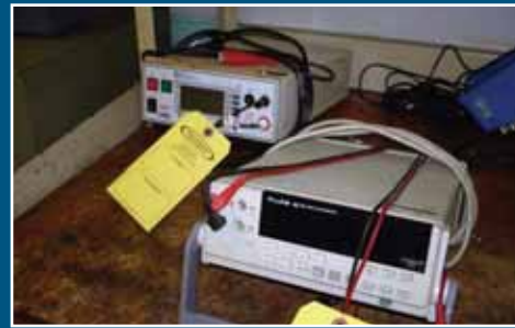
VARIOUS FLUKE & SLAUGHTER TESTERS