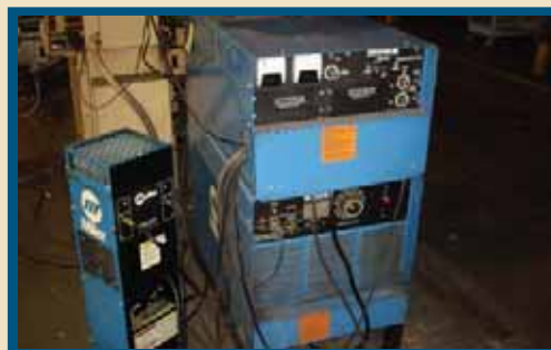
VARIOUS MILLER TIG WELDING MACHINES