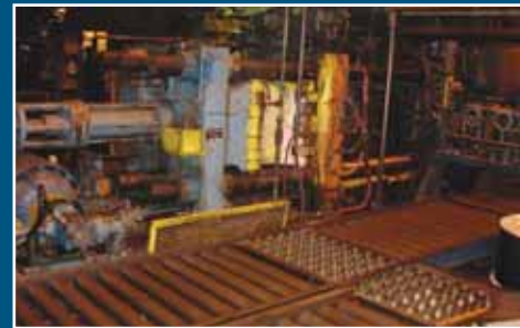
(1 OF 3) CASTMASTER 400 TON DIECASTERS