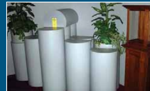
DISPLAY CASES & STANDS