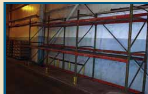
VARIOUS PALLET RACKING