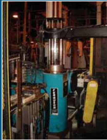
(1 OF 3) FERGUSON PICK AND PLACE ROBOTS