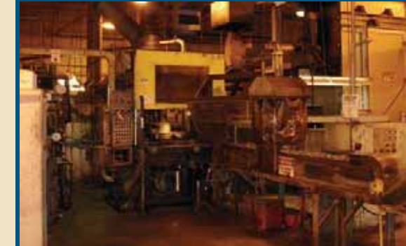
COMPLETE ROTOR CORE CAST SYSTEM

VIEW OUR INTERACTIVE CATALOG AT www.charlestonauctions.com