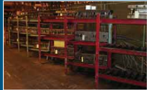
LG. QTY. OF DIES (SALVAGE ONLY) & RACKS