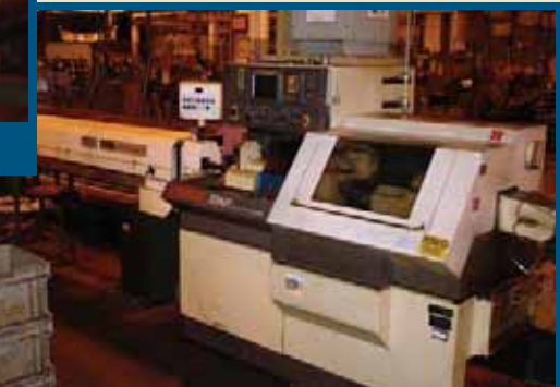
STAR CNC LATHE W/ STOCK FEEDER