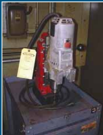
MILWAULKEE MAG BUSS DRILL