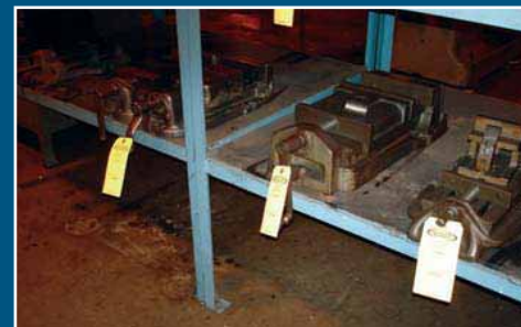
VARIOUS MACHINE TOOLING