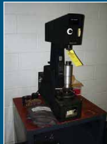
ROCKWELL HARDNESS TESTER