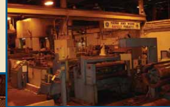
COMPLETE STAMCO SLITTING LINE

VIEW OUR INTERACTIVE CATALOG AT www.charlestonauctions.com