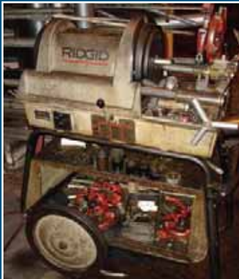
RIDGID POWER THREADER