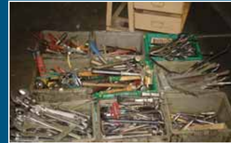
HUGE QTY. OF HAND & AIR TOOLS