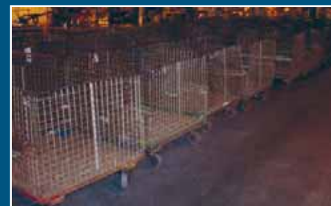
LG. QTY. OF ROLL AROUND WIRE BASKETS

BUFFALO Drill Press w/Electro Arc, Metal Disintegrator Head (3) MILLER 60M Series 24 Volt Wire Feeders Lg. Qty. of Machine Tooling (i.e. Machine Vises, Rotary Tables, Collets, Set-up Sets & Tie Downs, Rotary Cross-Slide Tables, Chucks, Wrenches, Tool Posts & Holders, Table Vises, Speed Chucks, Tapping Heads, ect.) LASSY Hand Tapper w/Tooling Lg. Qty. of Perishable Tooling (i.e. Carbide Inserts, End Mills & Dbl. End Mills, Cutters, Drills, Reamers, Broach & Key Way Cutters, Taps, Dies, Stamps, ect.) DAKE 50 Ton H-Frame Shop Press NIAGARA No. 66 Shear, 3/16" - 1/8" Mild Steel Capacity, 6' Manual Back Gage, S/N 55461 BROWN & SHARPE No. 2 Automatic Screw Machine, 3/4" Capacity, 4 Speed, S/N 542-2-7436-3/4, w/ Auto Bar Feed, Model 37, S/N 10120 MUBEA Universal Ironworker, Size KBL 1/2, Copper-Notcher - 7/16" Th x 3" D x 2" W, Bar Shear - Bar Round 1 5/8", Square 1 1/2", Angle 3 x 3/8, Flat 2 3/8 x 3/4, Plate 1/2 - 5 1/2 x 5/16, Section Shear 1/2", Punch 1" - 5/8" or 3/4" - 3/4", S/N 133/12/98/16 CHICAGO 3' Finger Brake, Model L, S/N 10388 NIAGARA 3' Manual Slip Rolls, Model 349P, 10-11 Ga. Capacity, S/N 59521 (2) MILLER Tig-Rig Welders, Model Tig-Rig, 3 Phase, 230/460 Volts, 19.8 KW, 76/38 Amps, w/MILLER Watermate 1 A Cooling System, S/N JH274376 & JH274375 (9) MILLER Maxtron 450 Arc Welders CC/CV Dc Inverters, (ALL) Have MILLER 60m Series 24 Volt Wire Feeders, S/N's KG252974, KG295438, KG295437, KG295440, KG295445, KG295453, KG295447, KG2955448, KG252971