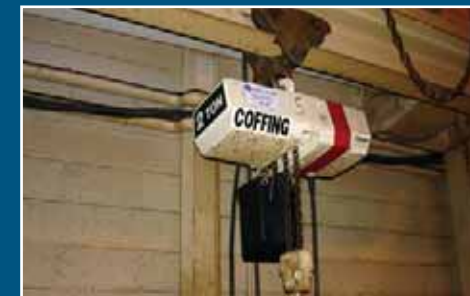
COFFING 2 TON ELECTRIC CHAIN HOIST