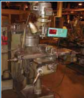
BRIDGE PORT VERTICAL MILLING MACHINE