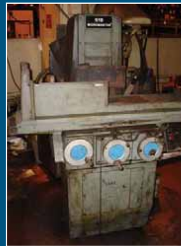
BROWN & SHARPE 618 MICROMASTER SURFACE GRINDER