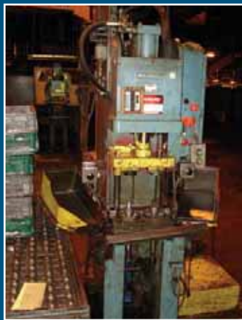
(1 OF 4) DENNISON MULTIPRESSES