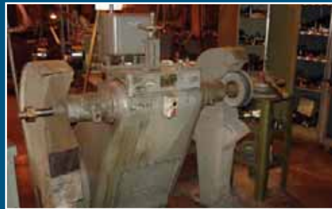
HAMMOND PEDESTAL BUFFER