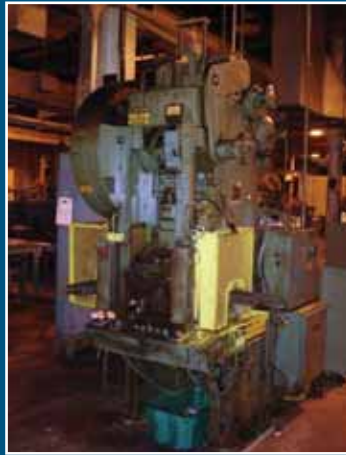
MINSTER 50 TON OBI PRESS