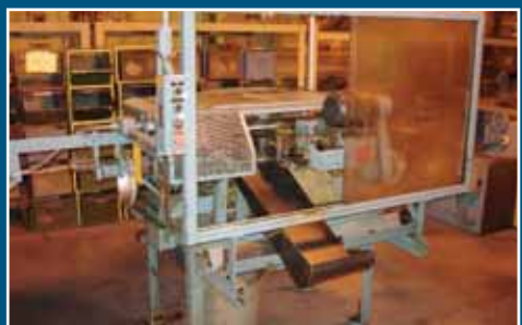
VARIOUS ARTOS WIRE MACHINES