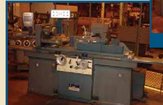
JONES & SHIPMAN O.D. GRINDER