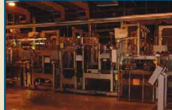
1 OF 3 COMPLETE AUTOMATION ENGINEERING MOTOR ASSEMBLY LINES