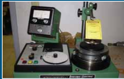
FEDERAL PNEUMO-CENTRIC MARK II TEST UNIT