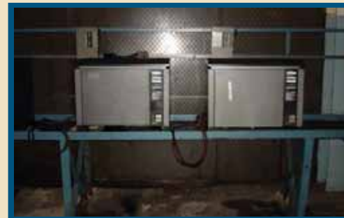
VARIOUS 24 & 36 VOLT BATTERY CHARGERS