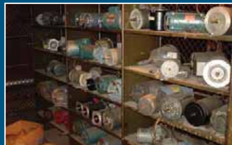
LG QTY OF VARIOUS MOTORS