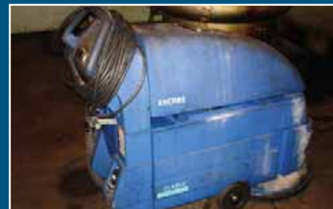
CLARKE ELECTRIC SCRUBBER