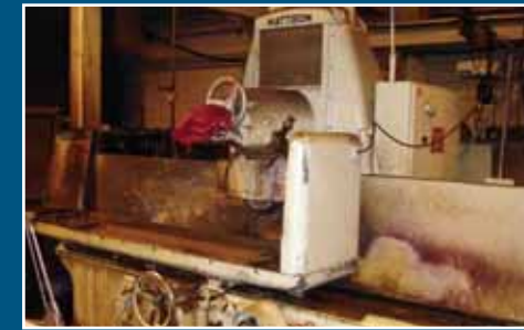
MATTISON 24" X 48" SURFACE GRINDER