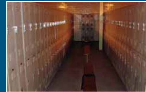
LG. QTY. LOCKERS