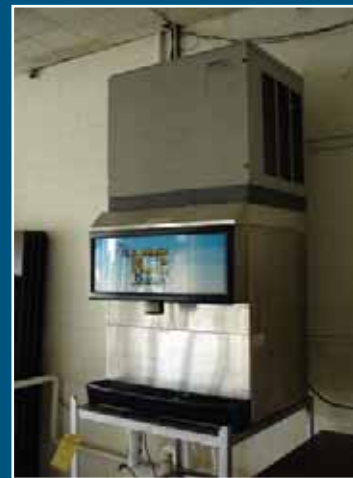
(1 OF 2) ICE STATIONS