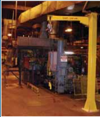
(1 OF 3) CASTMASTER DIECASTERS, 400 TON