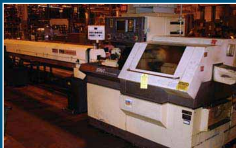
STAR CNC LATHE W/ BARLOADER