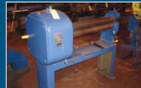
NIAGARA POWER ROLLS