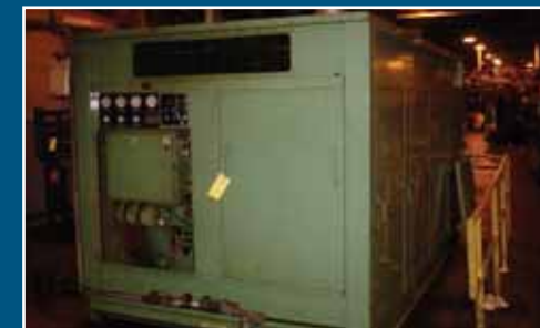
SULLAIR 400 HP AIR COMPRESSOR