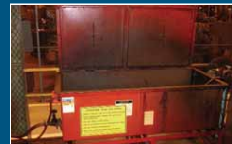
VARIOUS PARTS WASHING SYSTEMS