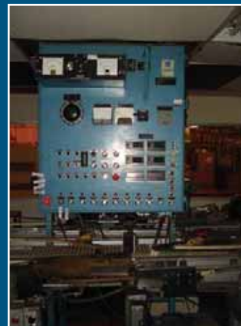
HYPOT & SLAUGHTER TEST UNITS

Nashville International Airport 1 Terminal Dr # 501, Nashville, 37214 - (615) 275-1600