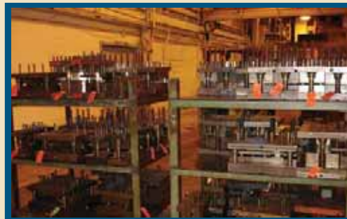
200,000+ LBS VARIOUS DIES (SALVAGE ONLY)