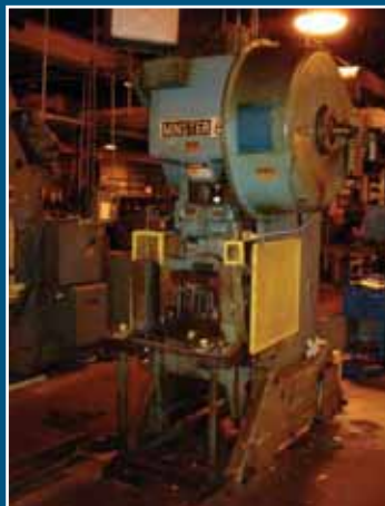
MINSTER 60 TON OBI PRESS