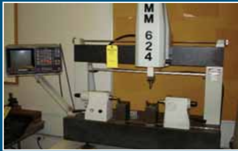
(1 OF 2) CMM SYSTEMS