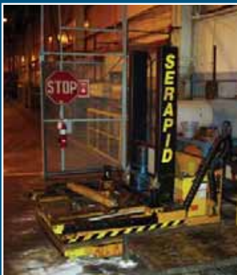
VARIOUS DIE HANDLING TRUCKS