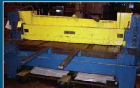
NIAGARA 6' POWER SHEAR