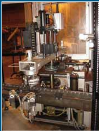
(1 OF 3) AMT STATOR INSULATOR VERIFICATION STATIONS