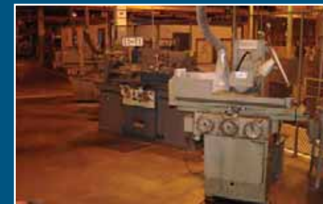
VARIOUS SURFACE & O.D. GRINDERS