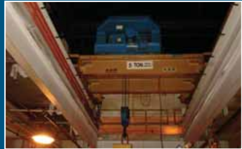
A & M 5 TON BRIDGE CRANE