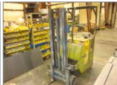
CLARK STAND UP FORK TRUCK