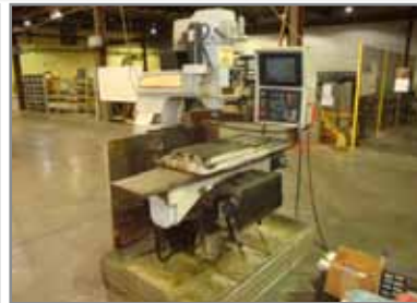
BRIDGEPORT SERIES II MILL