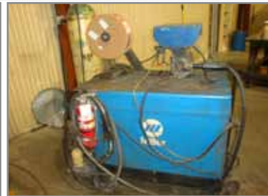
VARIOUS MILLER WELDERS