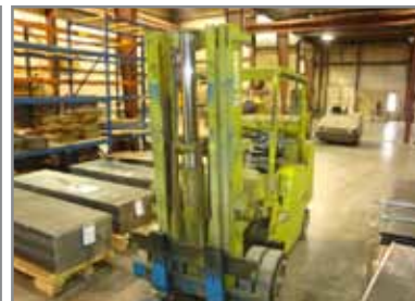
CLARK 10,000 LB FORK TRUCK