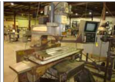
(1 OF 2) BRIDGEPORT SERIES II MILLS