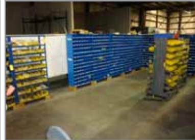
HARDWARE CABINETS AND HARDWARE