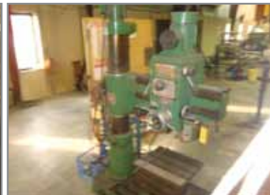
ENCO RADIAL ARM DRILL