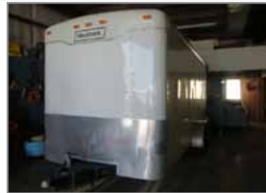
1999 HAULMARK TANDEM AXLE TRAILER