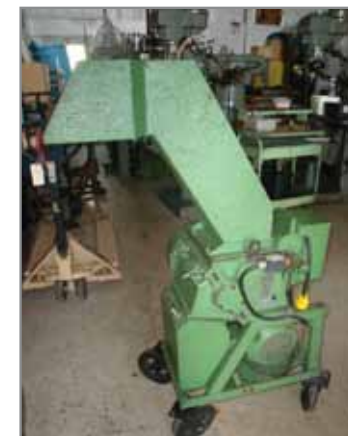
1989 RAPID PLASTIC GRANULATOR