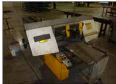
CLAUSING HORIZONTAL BAND SAW