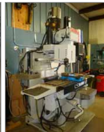
EAGLE CNC VERTICAL MILLING MACHINE