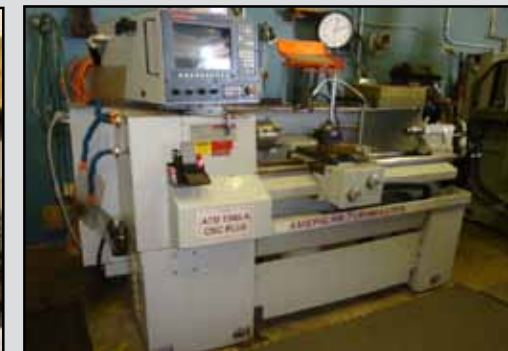
1999 AMERICAN TURNMASTER 1340 CNC LATHE