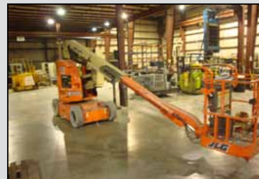
2001 JLG BOOM LIFT

1336 West Wiley Avenue, Bluffton, IN 46714