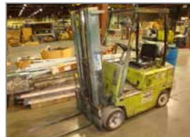
CLARK 3500 LB FORK TRUCK