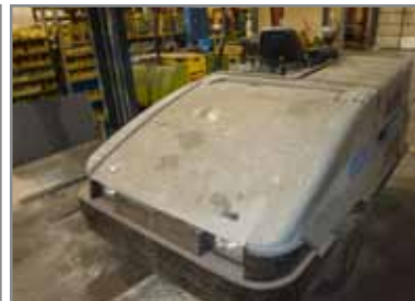
1997 AMERICAN LINCOLN FLOOR SWEEPER