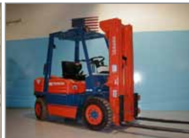
TOYOTA 5000 LB FORK TRUCK