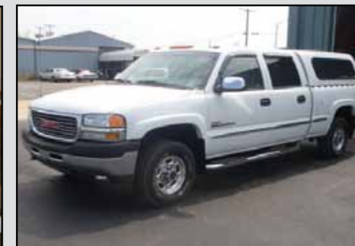
2002 GMC PICKUP TRUCK