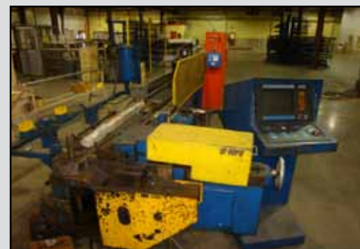
EAGLE CNC BENDER