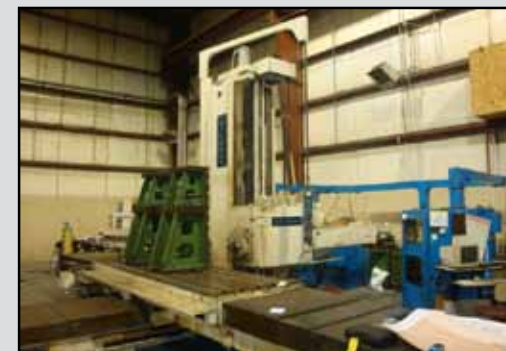
CINCINNATI GILBERT 5 INCH BORING MILL