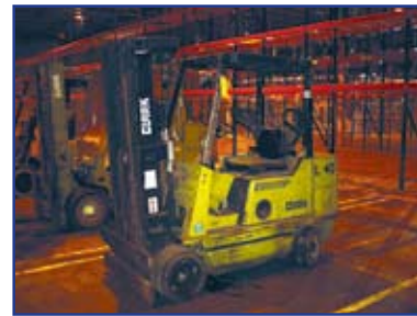
(1 OF 3) VARIOUS CLARK 5- 10,000 LB. FORK TRUCKS