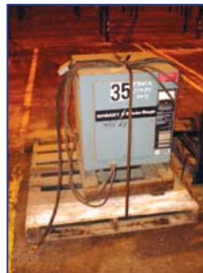
(1 OF 3) HOBART 36 & 48 VOLT CHARGERS

Live Internet Bidding BidSpotter.com www.bidspotter.com to register