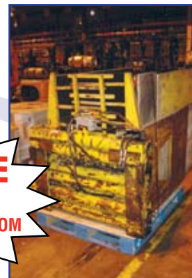
(1 OF 4) CLAMP TRUCK ATTACHMENTS