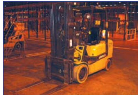
2003 CAT. LP 5,000 LB FORK TRUCK

Various Dock & Rail Car Dock Plates, Barrel Attachments, Manlift Cages, Forks, Cascade Systems, Clamp Truck Attachments, Masts, Etc.