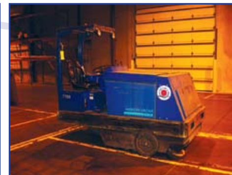
(1 OF 2) AMERICAN LINCOLN FLOOR SCRUBBERS