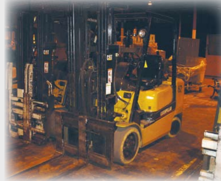
(1 OF 5) 2004 CAT. 5,000 LB. FORK TRUCKS

View complete on-line catalog at www.charlestonauctions.com Watch for additional items to be added daily.