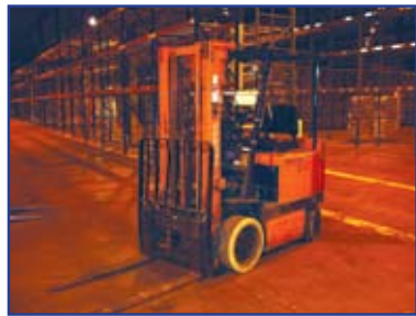
(1 OF 2) TOYOTA EE TYPE ELECTRIC FORK TRUCKS