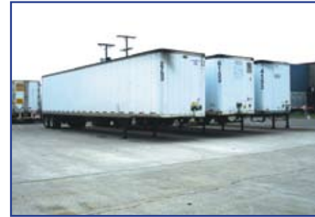
(3) VARIOUS MANF. 53 FT. BOX VAN TRAILERS