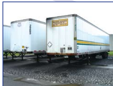
(1 OF 3) MONON 53 FT. TRAILERS

Huge Qty. Of Office Furniture (I.E. Lockers, Desks, Chairs, Mats, Trash Cans, Typewriters, Copiers, Fax Machines