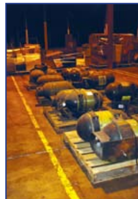
(13) COMPRESSED NATURAL GAS FUEL SYSTEMS