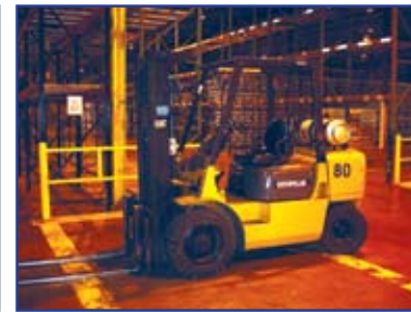
2003 CAT. 5,000 LB. INDOOR OUTDOOR FORK TRUCK