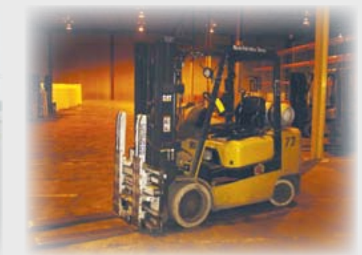
2003 CAT. 5000 LB. FORK TRUCK W/ CASCADE ATTACHMENT