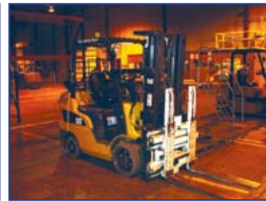
(1 OF 6) 2007 CAT 6,000 LP FORK TRUCKS