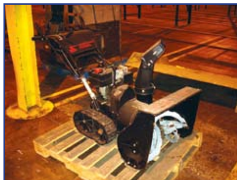
NOMA SP SNOWBLOWER

THINKING OF HAVING AN AUCTION? Call a Charleston Representative Today to Schedule a Confidential Meeting.