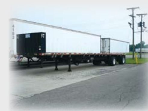
2000 TRANSCRAFT (53') FLATBED TRAILER