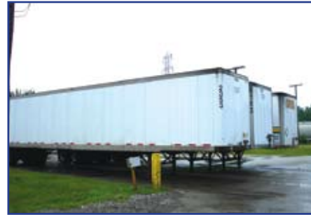
(3 OF 6) FRUEHAUF 53 FT. TRAILERS