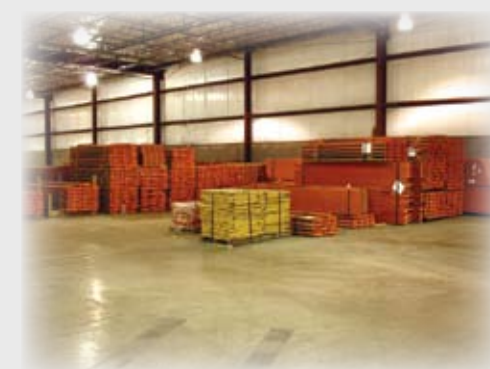
(OVER 200) SECTIONS OF HEAVY DUTY PALLET RACKING