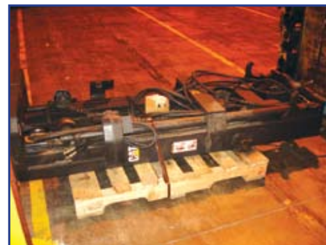
HUGE SPARE PARTS INVENTORY