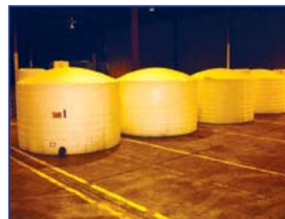
(4) 1,500 GAL. PLASTIC WATER TANKS