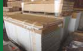
PALLETS OF NAILS