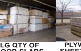
PLYWOOD AND SHEET MATERIAL