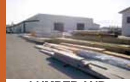
LUMBER AND SMARTSIDE SIDING