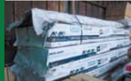
TIMBERSTRAND TRUS JOIST