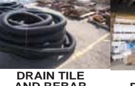
LG QTY OF DOOR SLABS