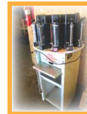
PAINT MIXING EQUIPMENT