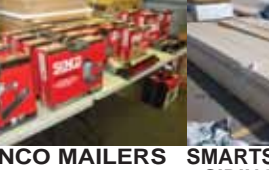
SMARTSIDE EXTERIOR SIDING AND SOFFIT