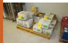
HUNDREDS OF LBS OF NAILS