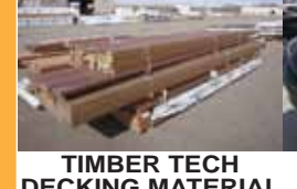
DRAIN TILE AND REBAR