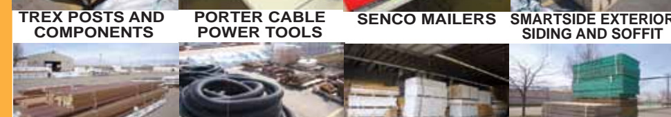
TIMBER TECH DECKING MATERIAL DRAIN TILE AND REBAR LG QTY OF DOOR SLABS PLYWOOD AND SHEET MATERIAL