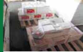
STEEL DOOR SLABS