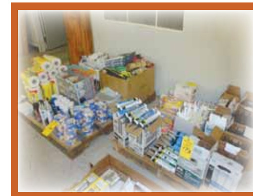
PAINTING SUPPLIES, CAULKS, SILICONES, AND SEALANTS