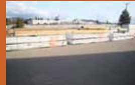
OVER 15 NEW BUNKS OF TREX DECKING