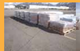
DECORATIVE LANDSCAPE BLOCKS