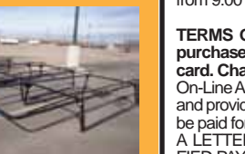
PICK UP LADDER RACKS