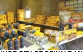
HUGE QTY OF DEWALT AND VARIOUS POWER TOOLS