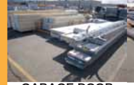
GARAGE DOOR PANELS