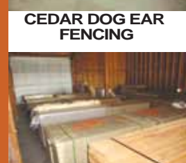
LG QTY OF CEDAR FENCING