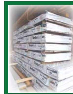
HUGE QTY OF COMPOSITE DECK MATERIAL