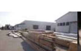
TRUS AND I-JOIST MATERIAL