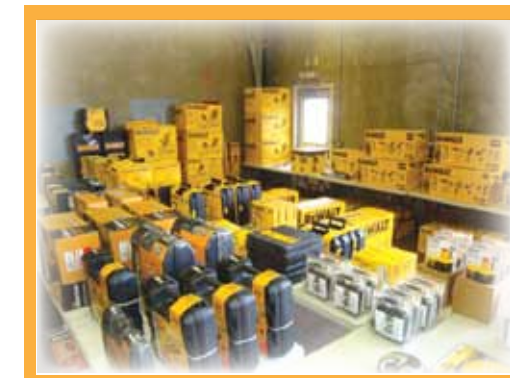
HUGE QTY OF NEW DEWALT POWER TOOLS