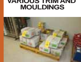
HUNDREDS OF LBS OF NAILS