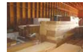
VARIOUS BI-FOLD DOORS