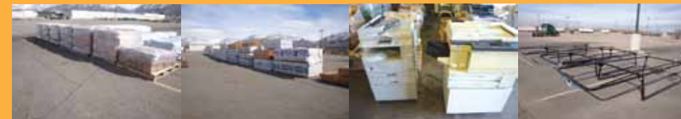
DECORATIVE LANDSCAPE BLOCKS 2X4,6,10 AND 12 LUMBER COPIERS AND OFFICE EQUIPMENT PICK UP LADDER RACKS