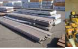
GREY TIMBER TECH