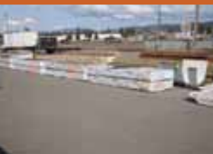
NEW TREX DECKING