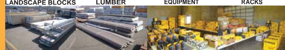
GARAGE DOOR PANELS GREY TIMBER TECH HUGE QTY OF DEWALT AND VARIOUS POWER TOOLS