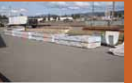
NEW TREX DECKING