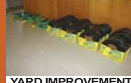
YARD IMPROVEMENT SUPPLIES