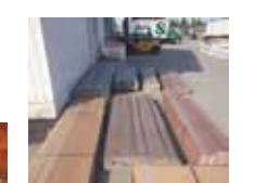
LG SELECTION OF COMPOSITE DECK MATERIAL