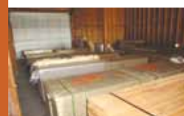
LG QTY OF CEDAR FENCING