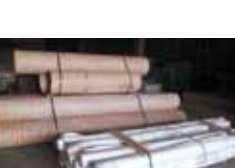
HOUSE WRAP AND CONCRETE FORMS