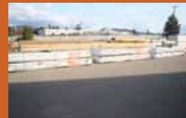
OVER 15 NEW BUNKS OF TREX DECKING