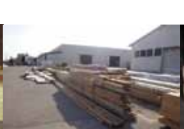
TRUS AND I-JOIST MATERIAL