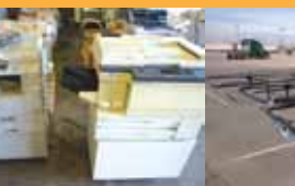
COPIERS AND OFFICE EQUIPMENT