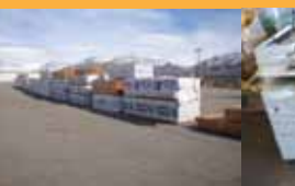
2X4,6,10 AND 12 LUMBER