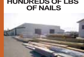
LUMBER AND SMARTSIDE SIDING