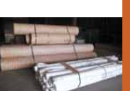
HOUSE WRAP AND CONCRETE FORMS