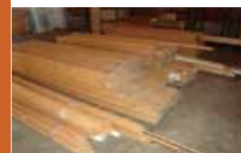
VARIOUS TRIM AND MOULDINGS