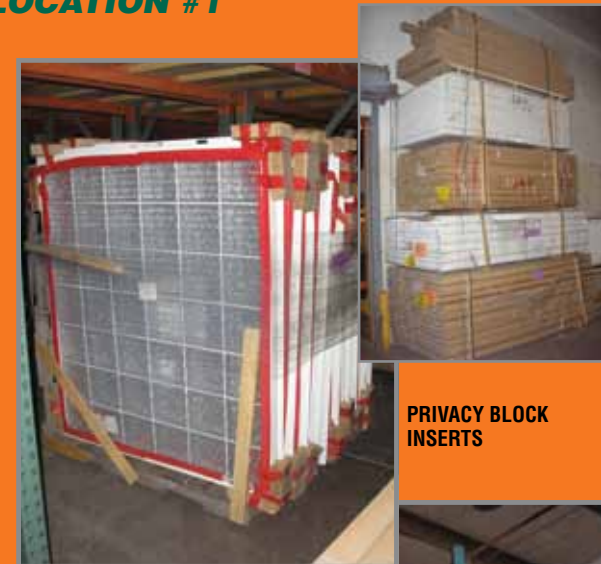
PRIVACY BLOCK INSERTS