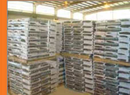
(OVER 200) PALLETS OF SHINGLES