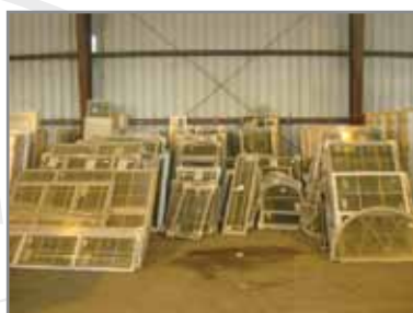
HUGE QTY. OF VARIOUS WINDOWS