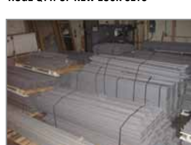
HUGE QTY. OF STEEL DOOR FRAME MATERIAL