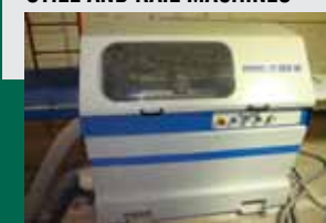
OMGAGI 2010 CNC UPCUT CHOPSAW