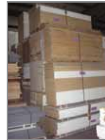
HUGE QTY. OF VARIOUS DOOR SLABS