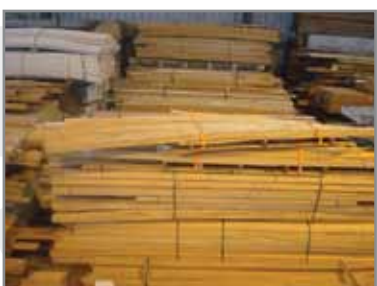
LG. QTY. OF TRIM & JAMB