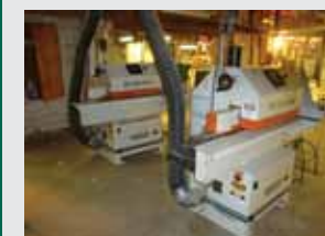
(2) 2007 VOORWOOD A15 STILE AND RAIL MACHINES