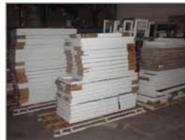
DOOR GLASS INSERTS