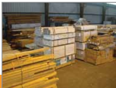
PRIMED TRIM & JAMBS