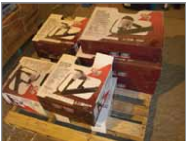
(10) VARIOUS GRIP RITE NAIL GUNS