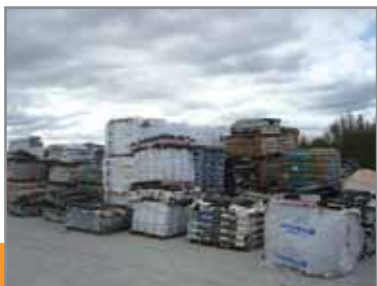
SHINGLES & ROOFING MATERIALS