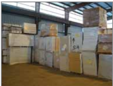
(100) PALLET'S OF VARIOUS DOOR SLABS