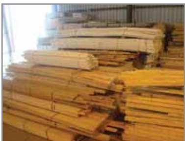
HUGE QTY. OF VARIOUS TRIM