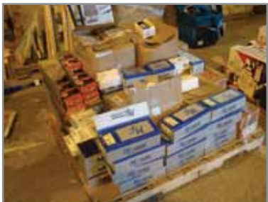
HARDWARE & FASTENERS