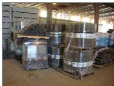
HUGE QTY. OF ROOFING SUPPLIES