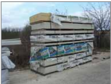
HARDIE TRIM / EXTERIOR SIDING