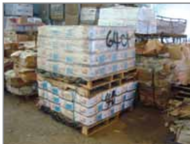
(5) PALLET'S PLASTIC CAP ROOFING NAILS