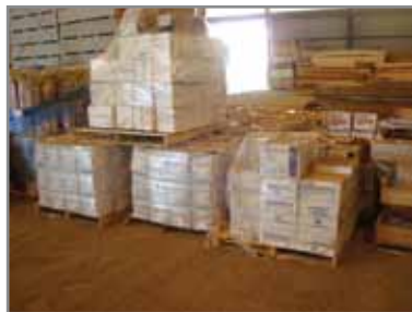
(10) PALLET'S OF JOINT COMPOUND