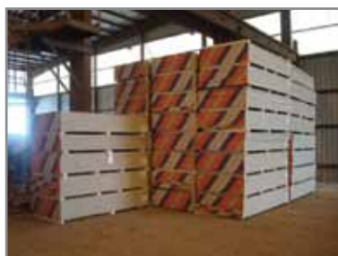
(OVER 100) BUNKS OF DRYWALL