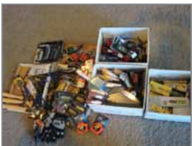
HUGE QTY. OF VARIOUS HAND TOOLS