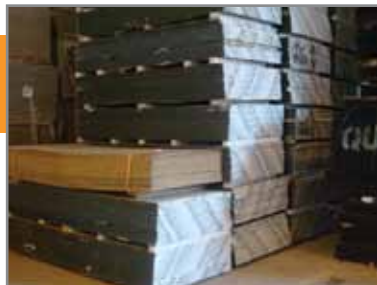
DRYWALL & SHEET ROCK