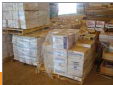
READY MIX JOINT COMPOUND