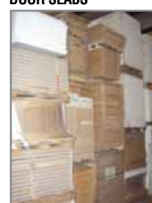
HUGE QTY. OF VARIOUS STYLE DOOR SLABS