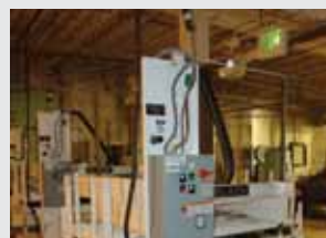
2007 BLACK BROTHERS 4X7 COLD PRESS