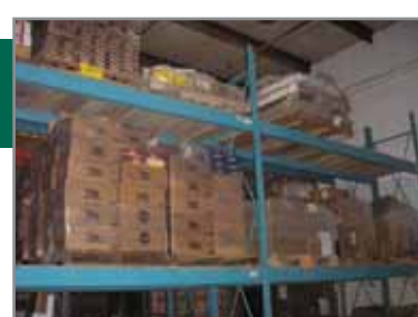
HUGE QTY. OF NEW LOCK SETS