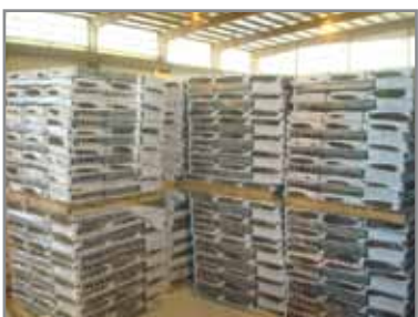
(OVER 200) PALLET'S OF SHINGLES