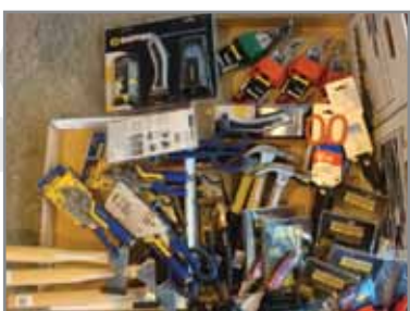
NEW TOOL INVENTORY