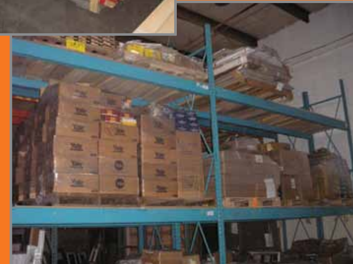
HUGE QTY. OF NEW LOCK SETS