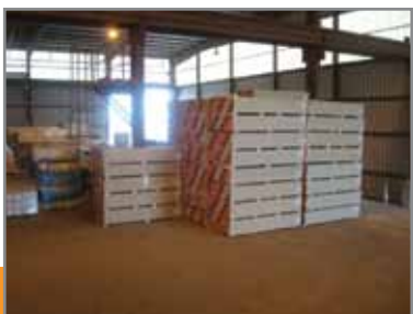
VARIOUS DRY WALL