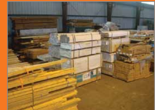
PRIMED TRIM & JAMBS