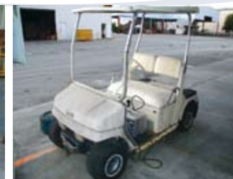
YAMAHA ELECTRIC GOLF CART