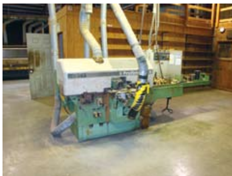
WEINIG PROFIMAT 22N MOLDING MACHINE

Call a Charleston Representative Today to Schedule a Confidential Meeting.