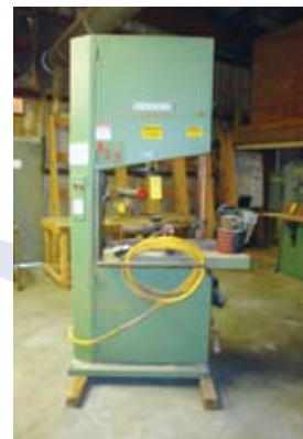
GRIGGIO VERTICAL BAND SAW W/ POWERFEED