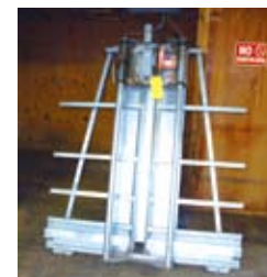
MILWAUKEE PANEL SAW