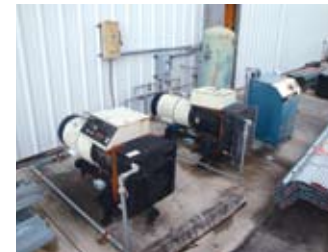
(2) KELLOGG 25 HP AIR COMPRESSORS