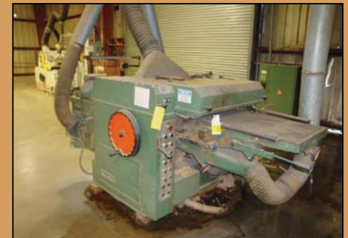
1986 MAQUINAS PLANER