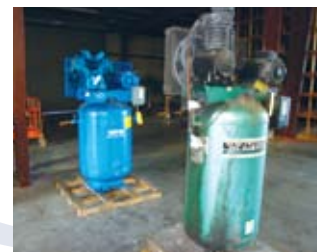
(OVER 6) VARIOUS AIR COMPRESSORS