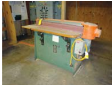
CROUCH EDGE SANDER