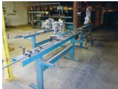
(2) NORFIELD AND FULL HOUSE DOOR STRIKE MACHINES