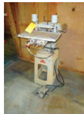
NEWTON 2-SPINDLE HORIZONTAL DRILLING MACHINE