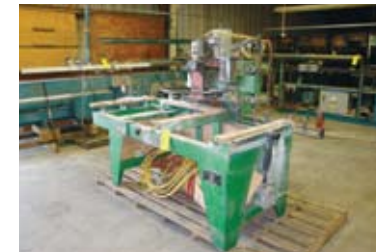
RUVO METAL DOOR MACHINE

INGERSOLL RAND Horizontal Air Compressor, Model T30, 2-Stage, 3-Phase, 15 HP