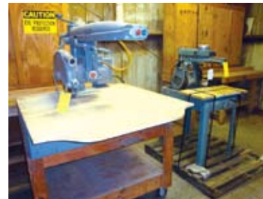
(OVER 7) VARIOUS RADIAL ARM SAWS