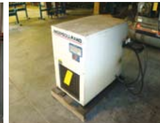
INGERSOLL RAND AIR DRYER