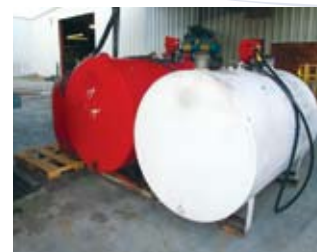
VARIOUS FUEL TANKS