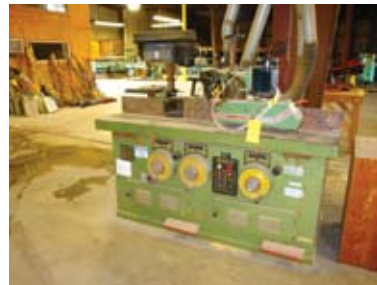
MAGGI MOLDING MACHINE W/ POWERFEED