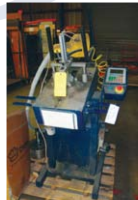
MITRE-MITE DOOR CASING MITRE MACHINE