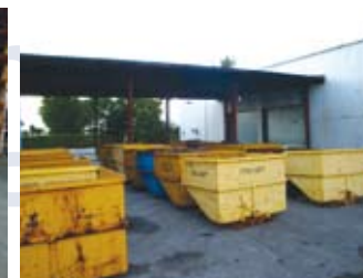
(OVER 30) VARIOUS SIZE DUMP HOPPERS