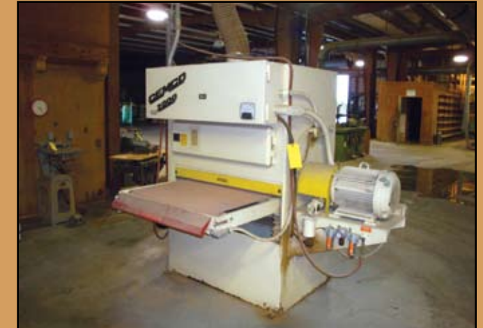
CEMCO 2000 VERTICAL BELT SANDER