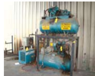
(2) KELLOGG AIR COMPRESSORS