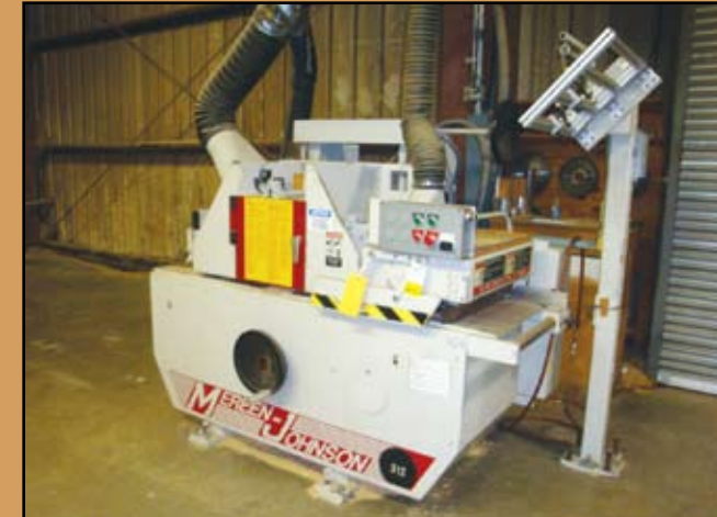
MEREEN JOHNSON GANG SAW

SATURDAY, JANUARY 17 th • BEGINNING AT 10:00 A.M. LOCAL TIME