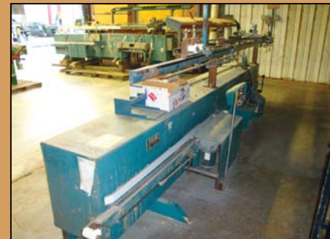
(1 OF 2) NORFIELD VERTICAL DOOR MACHINES