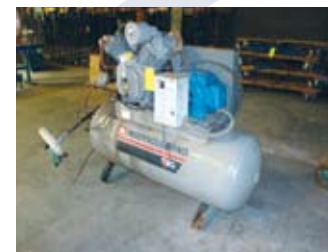
INGERSOLL RAND T30 AIR COMPRESSOR

Huge Qty. Of Office Furniture & Furnishings (I.E. Desks, File Cabinets, Chairs, Stands, Racks, Computer & Printer Tables, White & Cork Boards, Microwaves, Storage Racks, Pan Shelving, Etc.)