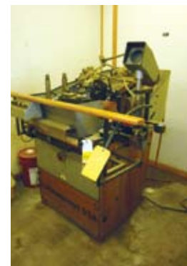
1994 RONDAMAT 934 WET SAW