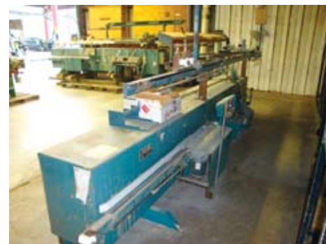
(1 OF 2) NORFIELD VERTICLE DOOR MACHINE