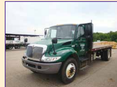
INTERNATIONAL FLATBED TRUCK