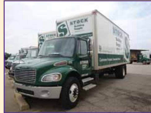
(1 OF 5) FREIGHTLINER BOX TRUCKS