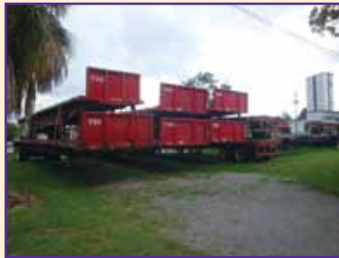
(OVER 50) TRUSS & FLATBED TRAILERS