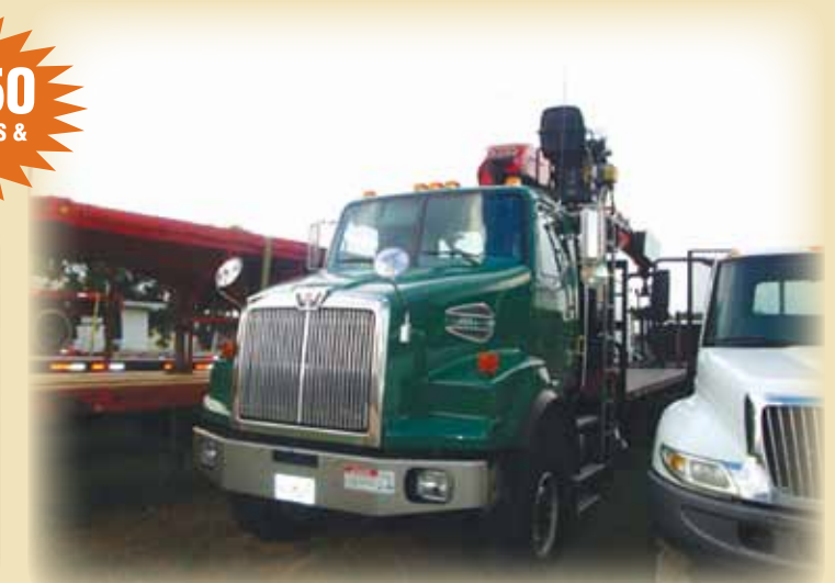
2007 WESTERN STAR BOOM TRUCK, 25,000 MILES

ON-SIGHT & ONLINE AUCTION BID LIVE @ www.bidspotter.com