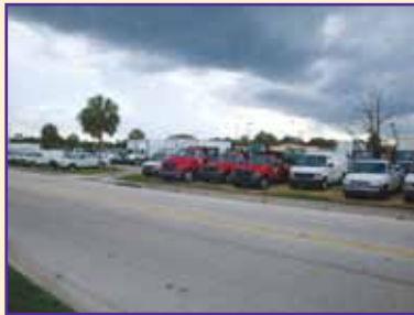
HUGE QTY. OF LIGHT TRUCKS & VANS