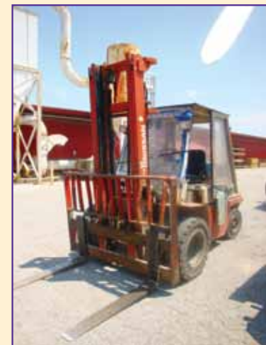
(1 OF 5) NISSAN DIESEL FORK TRUCKS

No items—no matter how small—may be removed until the conclusion of the auction on Day 2. SPECIAL CIRCUMSTANCES WILL NOT APPLY!