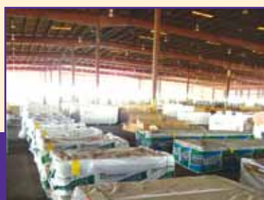
HUGE QTY. OF VARIOUS INTERIOR & EXTERIOR TRIM & SIDING