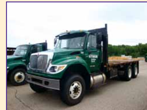
LATE MODEL INTERNATIONAL FLATBED TRUCK