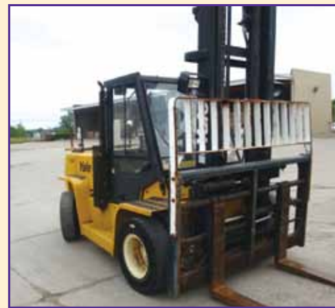
(OVER 10) YALE 6 -12,500 FORK TRUCKS

PHOTOS REPRESENT EQUIPMENT FOR SALE. ACTUAL EQUIPMENT NOT SHOWN.