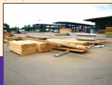
HUGE QTY. OF VARIOUS TREATED & EXOTIC LUMBER