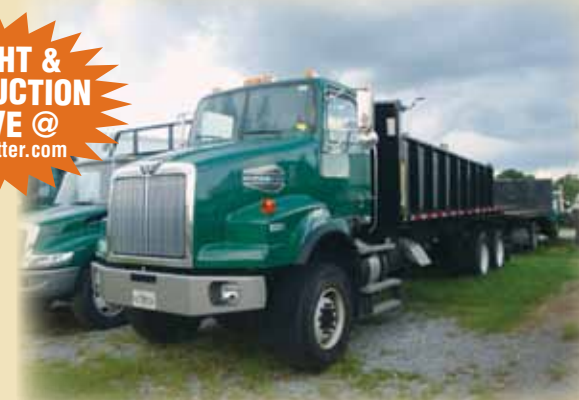
2007 WESTERN STAR DUMP TRUCK

ON-SIGHT & ONLINE AUCTION BID LIVE @ www.bidspotter.com