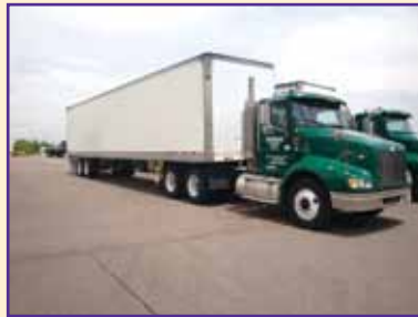
(1 OF 10) VARIOUS SEMI-TRACTORS