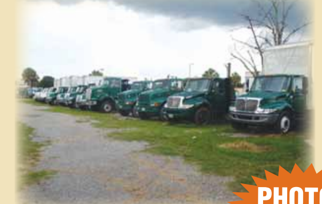
(OVER 75) FLATBED & BOX TRUCKS

PHOTOS REPRESENT EQUIPMENT FOR SALE. ACTUAL EQUIPMENT NOT SHOWN.