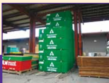
HUGE QTY. OF PLYWOOD & OSB SHEETING

PHOTOS REPRESENT EQUIPMENT FOR SALE. ACTUAL EQUIPMENT NOT SHOWN.