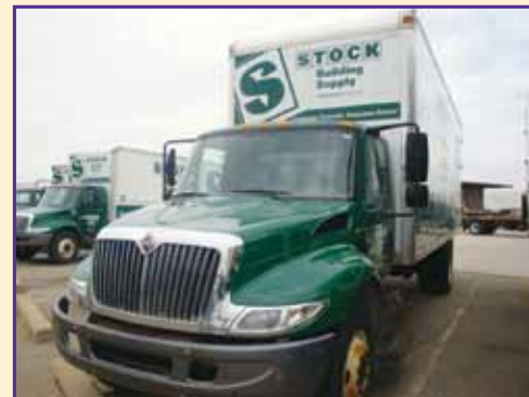
LATE MODEL INTERNATIONAL BOX TRUCK