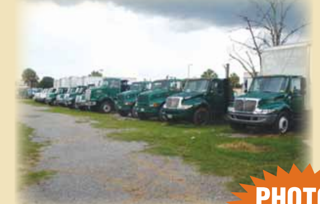
(OVER 75) FLATBED & BOX TRUCKS

PHOTOS REPRESENT EQUIPMENT FOR SALE. ACTUAL EQUIPMENT NOT SHOWN.