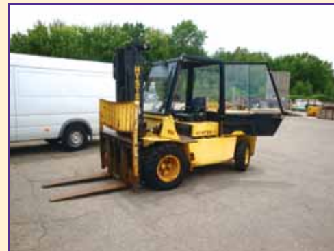
(1 OF OVER 25) VARIOUS FORK TRUCKS & PIGGYBACK LOADERS