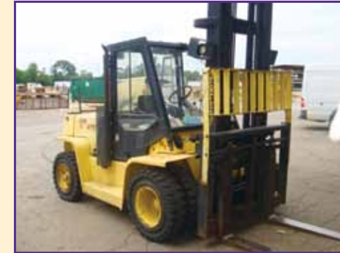
(1 OF 20) VARIOUS HYSTER & TOYOTA FORK TRUCKS