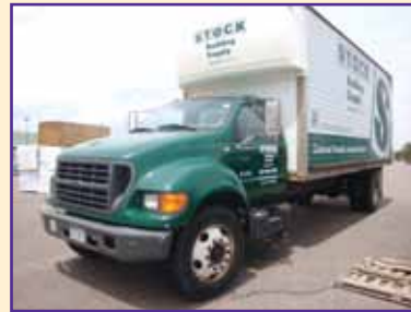
FORD F-650 FLATBED TRUCK