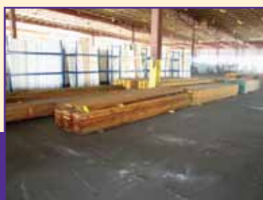
HUGE QTY. OF VARIOUS HARDWOOD LUMBER