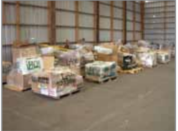
HUGE QTY. OF RETAIL INVENTORY