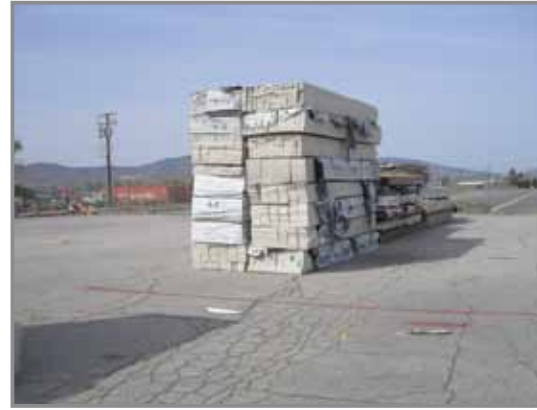
EXTERIOR TRIM, SIDING & SOFFIT