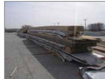
LG. QTY. OF TRUS JOIST