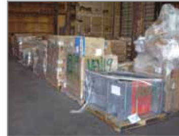
HUGE QTY. OF SIMPSON TIES & HANGERS