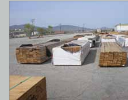
2 X 6 LUMBER