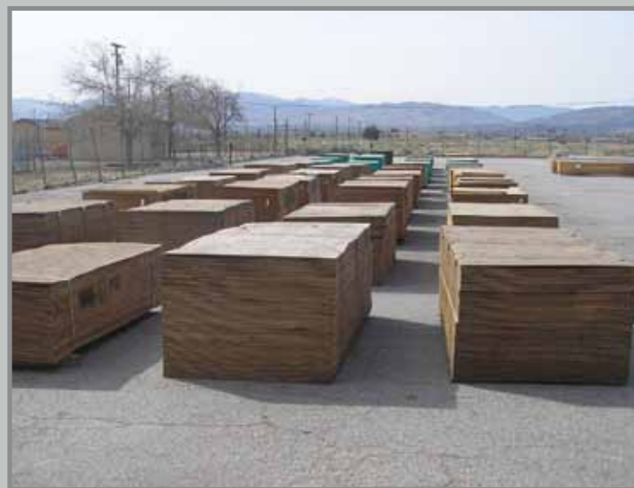
HUGE QTY. OF PLYWOOD & SHEET MATERIAL

PREVIEW INSPECTION: Wednesday, April 28 th from 9:00 AM - 5:00 PM Local Time