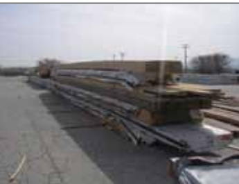
LG. QTY. OF TRUS JOIST