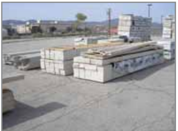
LG. QTY. OF SMARTSIDE TRIM & SIDING