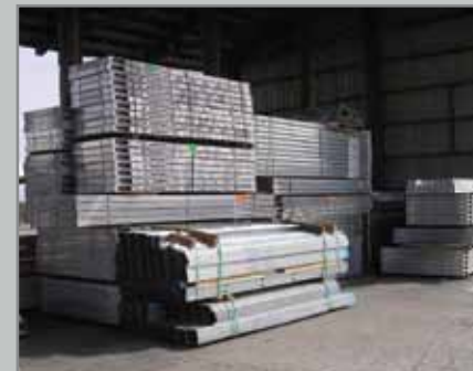
STEEL BUILDING MATERIAL