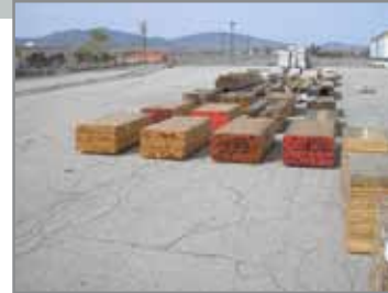
BUILDING MATERIALS ... FAR TOO MUCH TO LIST