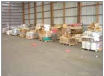
RETAIL & HOME IMPROVEMENT INVENTORY