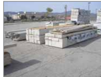
LG. QTY. OF SMARTSIDE TRIM & SIDING