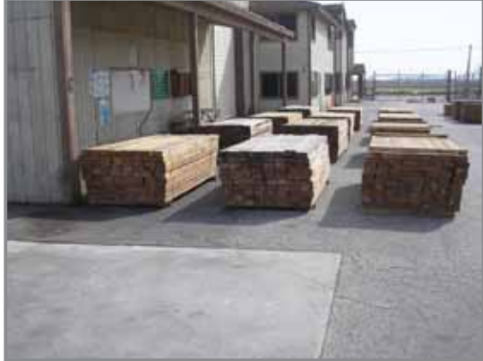
LG. QTY. LUMBER