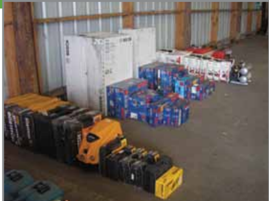
BOSTITCH, BOSCH & GRIPRITE POWER TOOLS