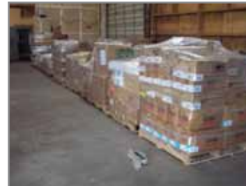
SIMPSON TIES & HANGERS