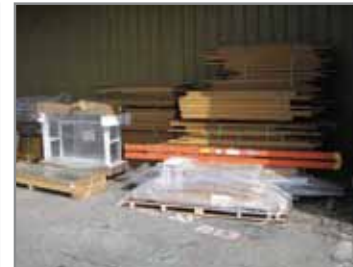
TRIM & MOULDING