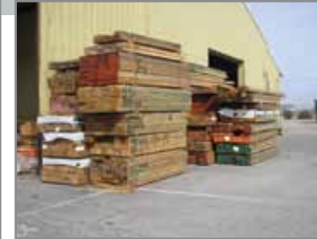
HUGE QTY. OF LUMBER