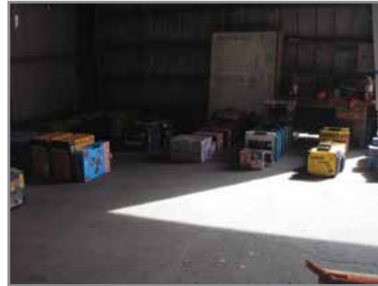
OVER 250 LOTS OF POWER TOOLS