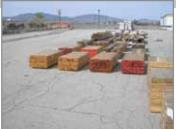
BUILDING MATERIALS ... FAR TOO MUCH TO LIST