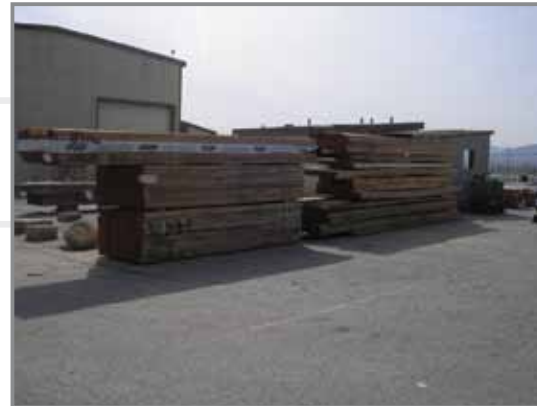
HUGE AMOUNTS OF VARIOUS TRUS JOIST & LUMBER