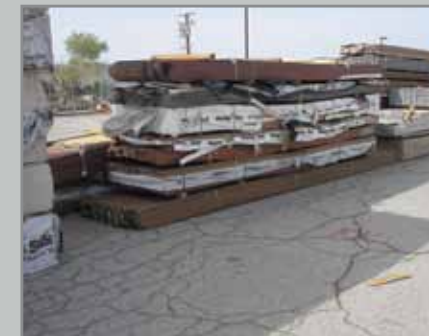
VARIOUS TREX COMPOSITE DECKING