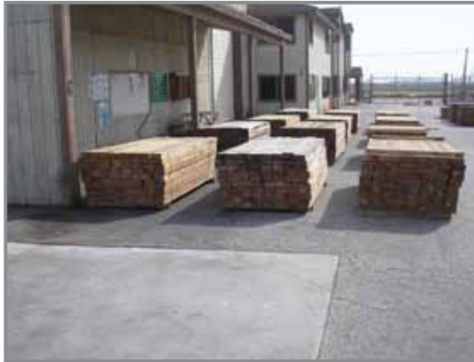
LG. QTY. LUMBER