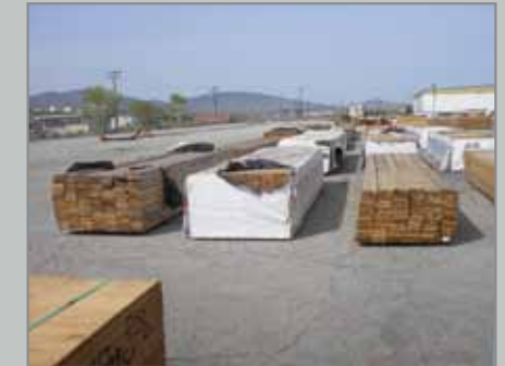
2 X 6 LUMBER