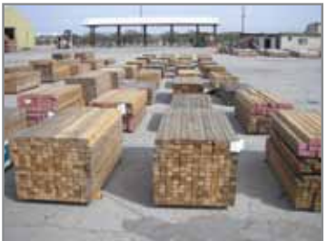
VARIOUS POSTS & LUMBER