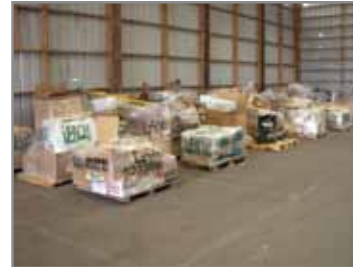
HUGE QTY. OF RETAIL INVENTORY