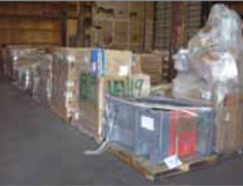
HUGE QTY. OF SIMPSON TIES & HANGERS