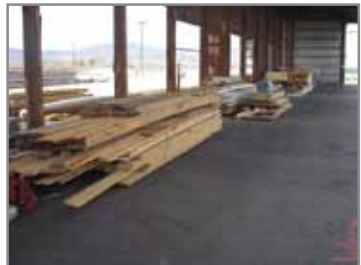
VARIOUS SPECIES OF LUMBER & HARDWOODS