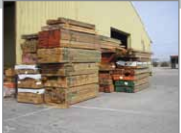
HUGE QTY. OF LUMBER