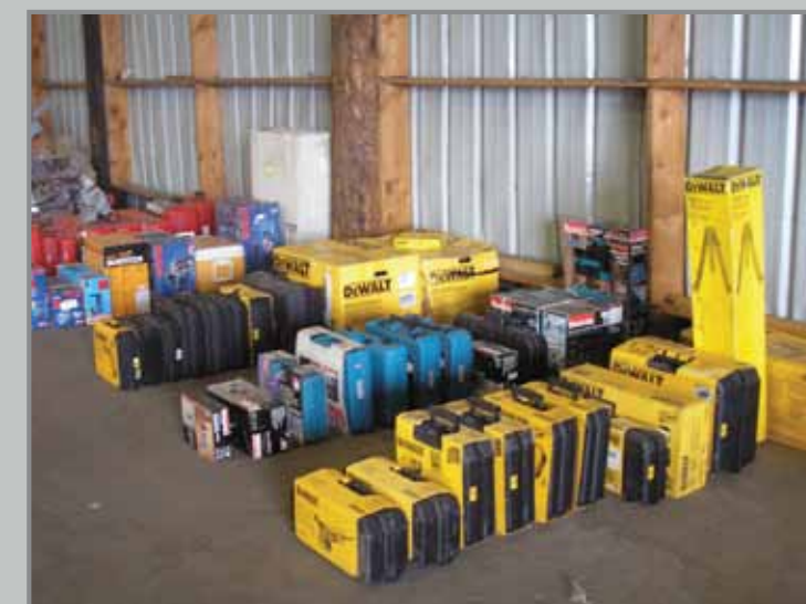
LG. QTY. OF BRAND NAME POWER TOOLS