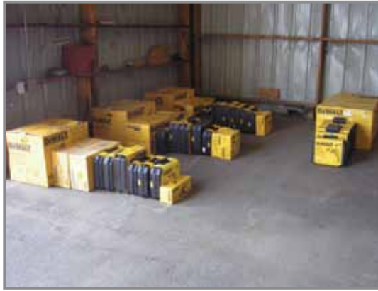
DEWALT POWER TOOLS