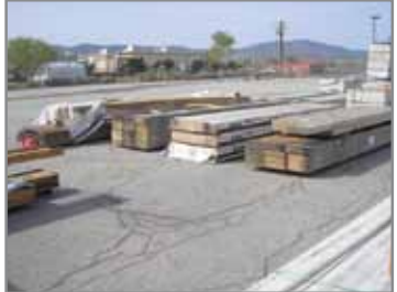
LAMINATED MATERIAL & TRUS JOIST