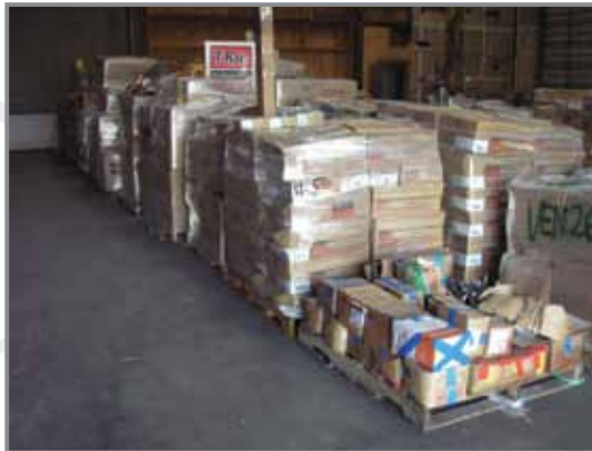
HARDWARE & VARIOUS SIMPSON COMPONENTS