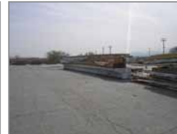
VARIOUS DIMENSION TRUS JOIST