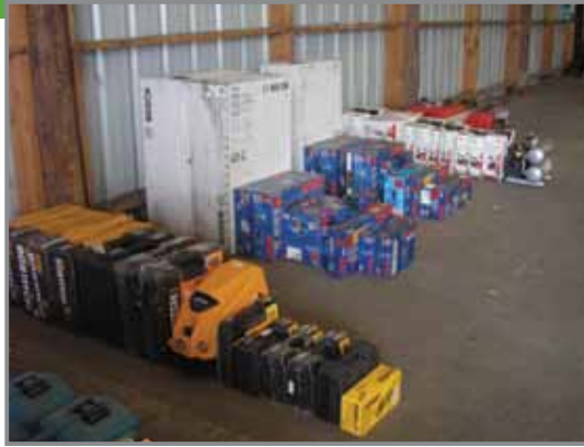
BOSTITCH, BOSCH & GRIPRITE POWER TOOLS