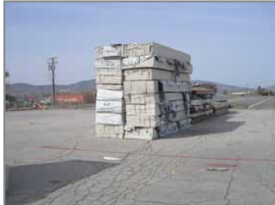
EXTERIOR TRIM, SIDING & SOFFIT