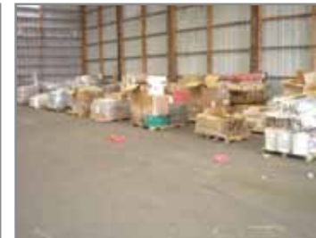
RETAIL & HOME IMPROVEMENT INVENTORY