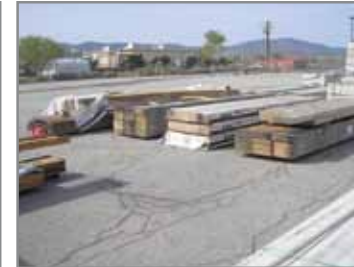
LAMINATED MATERIAL & TRUS JOIST