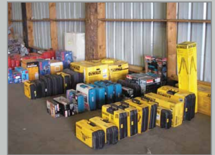
LG. QTY. OF BRAND NAME POWER TOOLS