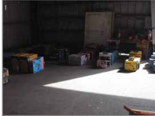
OVER 250 LOTS OF POWER TOOLS