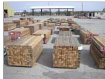
VARIOUS POSTS & LUMBER