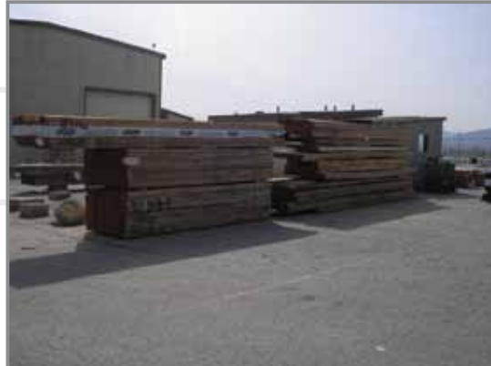
HUGE AMOUNTS OF VARIOUS TRUS JOIST & LUMBER