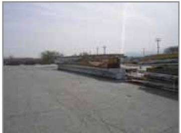
VARIOUS DIMENSION TRUS JOIST