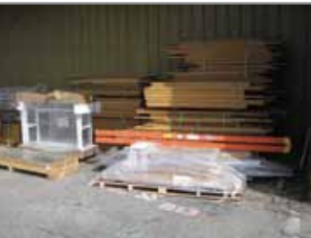
TRIM & MOULDING