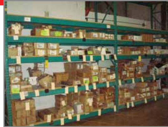
HINGES & DOOR HARDWARE