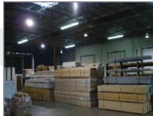
LUMBER & SHEETING