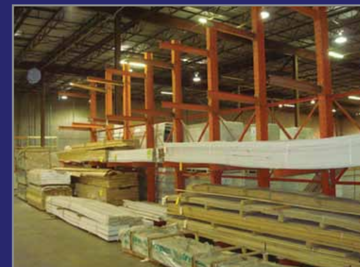
TRIM, CASING & MOULDING