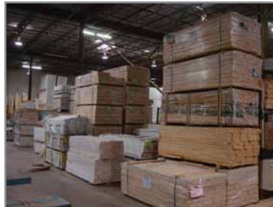
HUGE QTY. OF TRIM