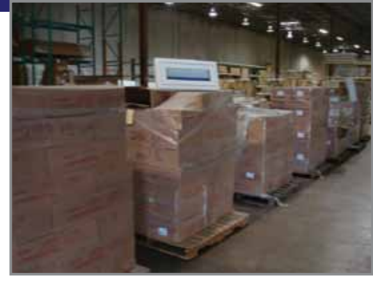
(7) PALLET OF FIRE EXTINGUISHERS CABINETS