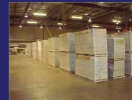
THOUSANDS OF STEEL DOOR SLABS