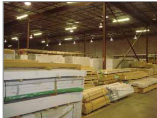
THOUSANDS OF BOARD FEET OF TRIM