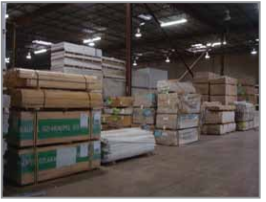
VARIOUS LUMBER & MOULDING