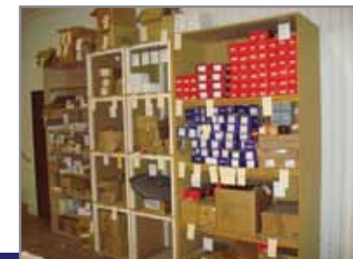
BATHROOM & DOOR HARDWARE