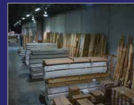
LG. QTY. OF DOOR CASING & TRIM