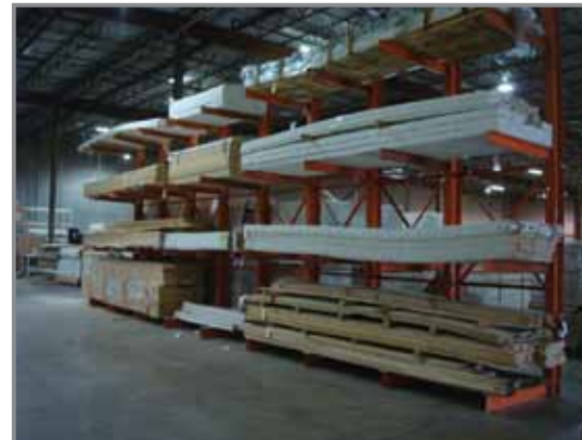
HUGE QTY. OF VARIOUS DOOR TRIM