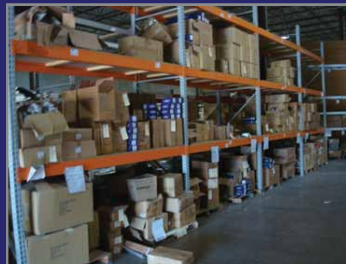
THOUSANDS OF DOOR LOCKS

PREVIEW INSPECTION: Tuesday, May 4 th from 9:00 AM - 5:00 PM Local Time