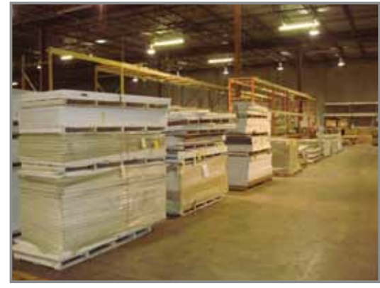
THOUSANDS OF INTERIOR & EXTERIOR DOOR SLABS