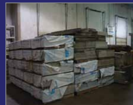
HUGE QTY. OF HARDIE & SMARTSIDE EXTERIOR SIDING & SOFFIT