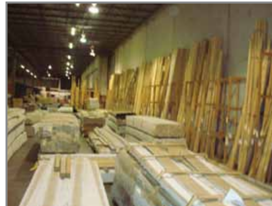
TRIM & MOULDING