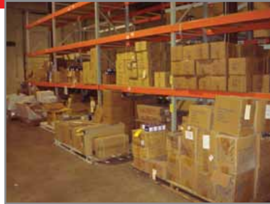
DOOR LOCKS & HARDWARE