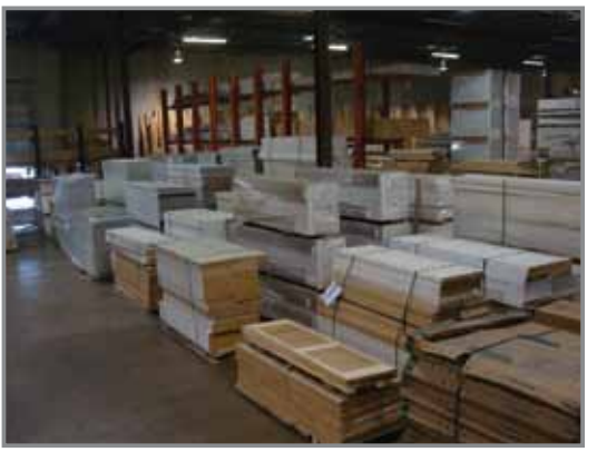
THOUSANDS OF DOOR SLABS & PRE-HUNGS