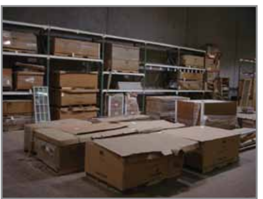
HUGE QTY. OF WINDOWS & GLASS INSERTS