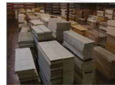
VARIOUS 2, 4 & 6 PANEL DOORS