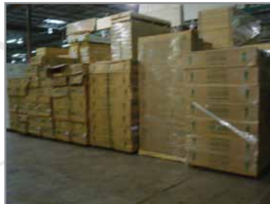
Lg. QTY. OF ATTIC LADDERS