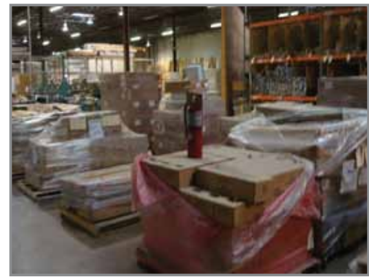
Lg. QTY. OF VARIOUS FIRE EXTINGUISHERS