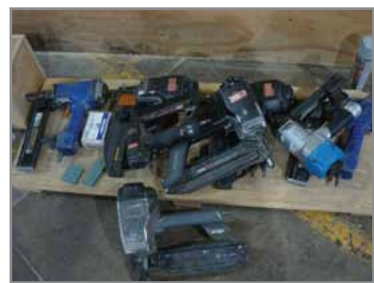
LARGE QTY. OF AIR & HAND TOOLS