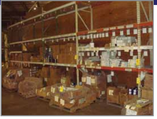
DOOR LOCKS & HARDWARE