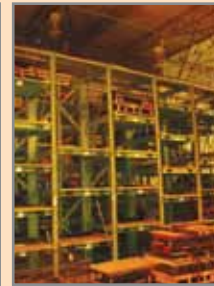
COMPLETE AUTOMATED STANLEY VIDMAR STORAGE SYSTEM