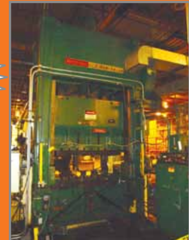
1975 NIAGARA 250 TON STRAIGHT SIDE PRESS