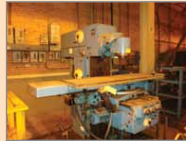
HECKERT UNIVERSAL MILLING MACHINE