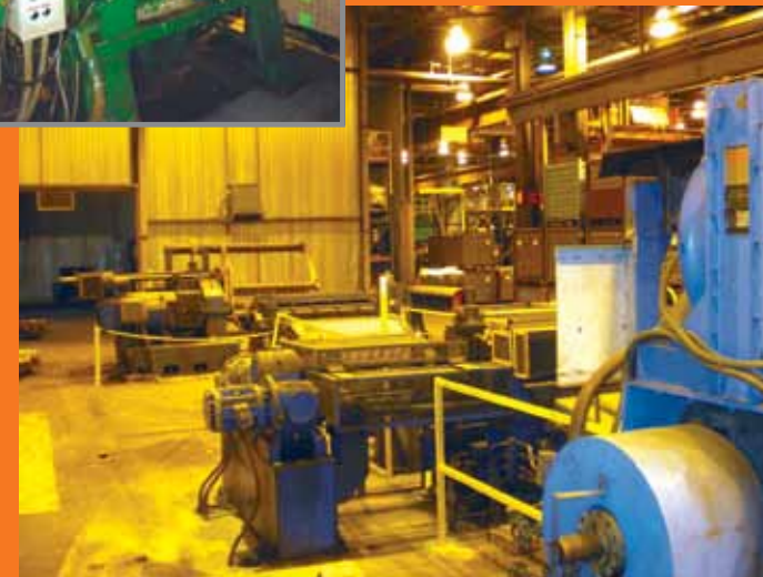
1975 B & K SLITTING LINE