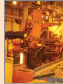
BULLARD VERTICAL TURRENT LATHE