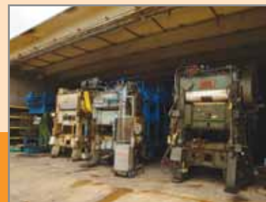
VARIOUS TRIM & PUNCH PRESSES