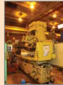
MATTISON SURFACE GRINDER