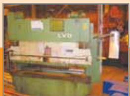
(1 OF 2) LVD PRESS BRAKES