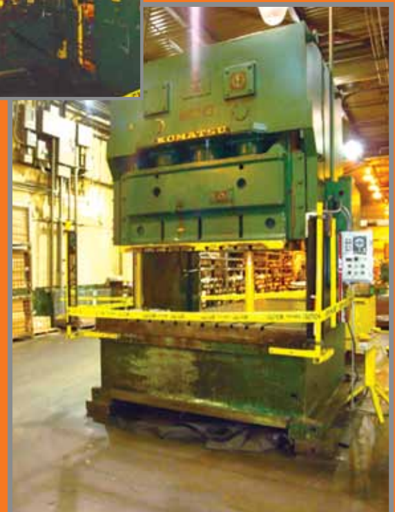
1989 KOMATSU 200 TON C FRAME PRESS