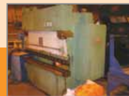
(1 OF 2) LVD BRAKE PRESSES

Visit the marketplace of Charleston Auctions to buy and sell used industrial equipment ... www.charlestonauctions.com