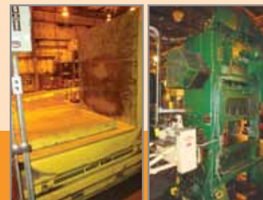
LH PIC: WESTBEND COIL FLIPPER