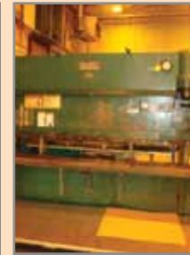
PACIFIC 10 FT. SHEAR