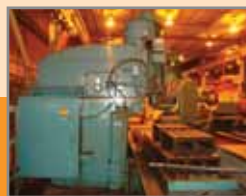
CINCINNATI MILICRON 28 X 120 VERTICAL HYDROTEL