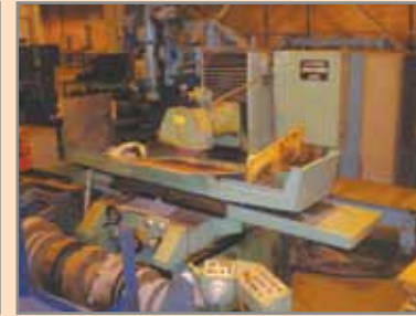
CLAUSING HYDRAULIC SURFACE GRINDER