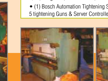
RH PIC: MINSTER 60 TON PIECE MAKER PRESS