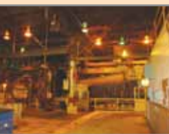
2 COMPLETE SMELTING OPERATIONS