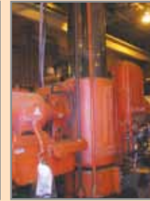
CARLTON RADIAL ARM DRILL