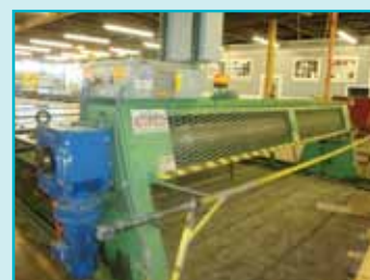
TEE-LOK FINISH PRESS