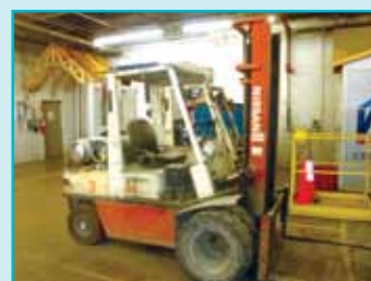
NISSAN LP 6,000 LB. FORK TRUCK