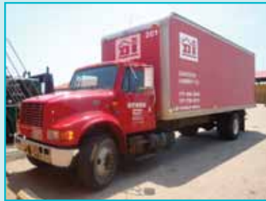
(1 OF OVER 10) VARIOUS BOX TRUCKS