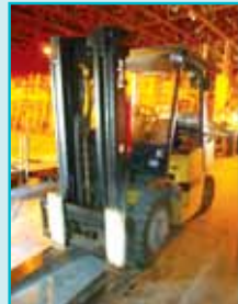
RH SIDE: YALE 5000 LB. LP. FORK TRUCK