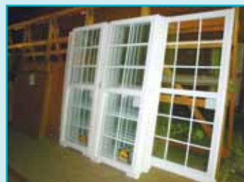
LG. QTY. OF (LIKE NEW) WINDOWS