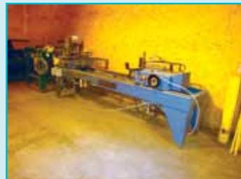
NORFIELD DBL. MITRE SAW