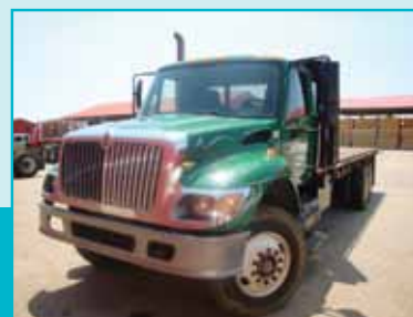
INTERNATIONAL FLATBED TRUCK