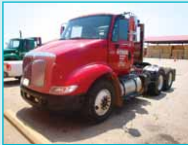
(1 OF 5) LATE MODEL SEMI TRACTORS