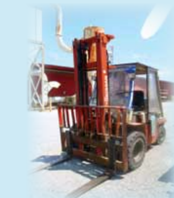
(1 OF 5) NISSAN DIESEL FORK TRUCKS

ON-SIGHT & ONLINE AUCTION BID LIVE @ www.bidspotter.com