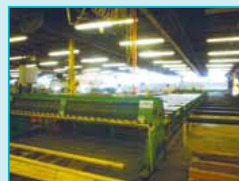
COMPLETE TEE-LOK TRUSS LINE