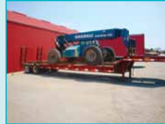
GRADALL 534DS-45 4X4 MATERIAL HANDLER