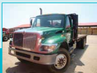
INTERNATIONAL FLATBED TRUCK