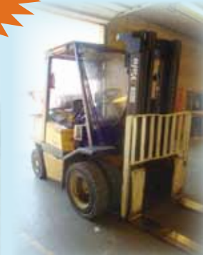
YALE FORK TRUCK