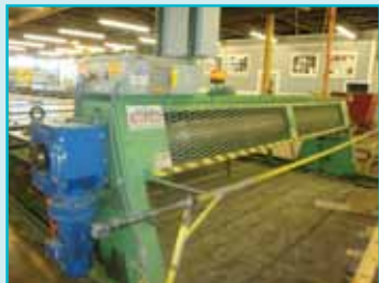
TEE-LOK FINISH PRESS