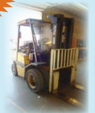
YALE FORK TRUCK