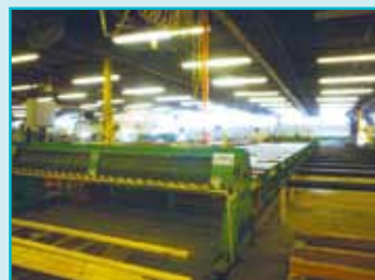
COMPLETE TEE-LOK TRUSS LINE