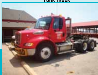
LATE MODEL SEMI TRACTORS