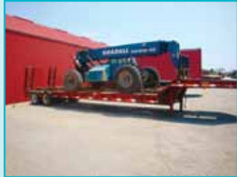
GRADALL 534DS-45 4X4 MATERIAL HANDLER