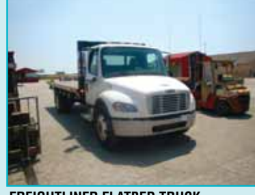
FREIGHTLINER FLATBED TRUCK