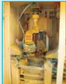
RH SIDE: CNC SPEED CUT SAW