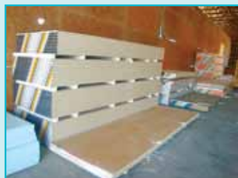
DRYWALL & SHEETING