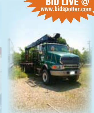
LATE MODEL STERLING BOOM TRUCK