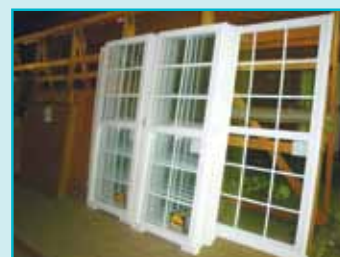
LG. QTY. OF (LIKE NEW) WINDOWS