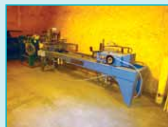
NORFIELD DBL. MITRE SAW