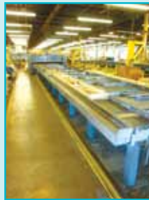
LH SIDE: (1 OF 4) LATE MODEL TRUSS MANF. LINES COMPLETE