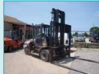
HYSTER 15,500 LB. DIESEL FORK TRUCK