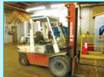
NISSAN LP 6,000 LB. FORK TRUCK