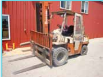
NISSAN 9,000 LB. DIESEL FORK TRUCK