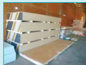
DRYWALL & SHEETING