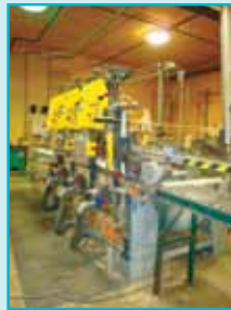
LH SIDE: LATE MODEL DOOR EQUIPMENT