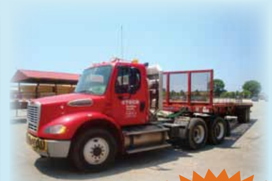
SEMI TRACTOR & TRAILER

FOR A COMPLETE LISTING PLEASE VISIT: www.charlestonauctions.com