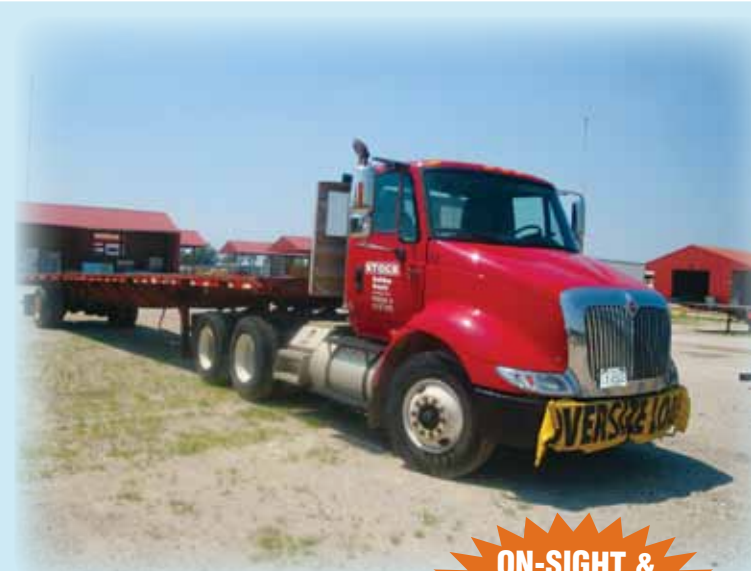
(1 OF MANY) SEMI TRACTORS & TRAILERS

Super 8—(317) 738-0888 Comfort Inn—(317) 736-0480 Howard Johnson—(317) 738-4448