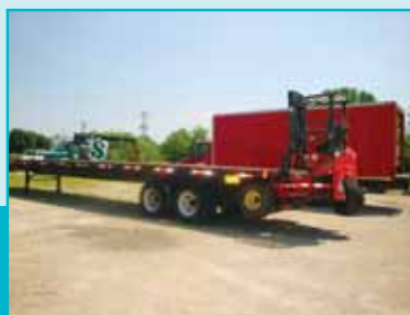
VARIOUS 4-WAY TRAILERS & MOFFETS