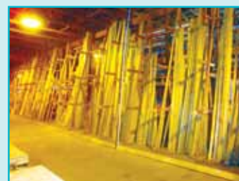
HUGE QTY. OF TRIM & MOULDING