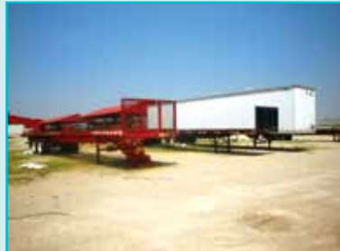
FLATBED & TRUSS TRAILERS