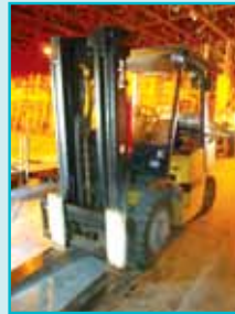
RH SIDE: YALE 5000 LB. LP. FORK TRUCK