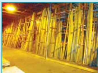
HUGE QTY. OF TRIM & MOULDING