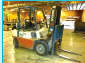
NISSAN 5,000 LB. LP FORK TRUCK