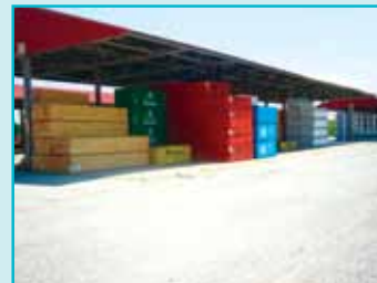
HUGE QTY. OF SHEET GOODS & LUMBER