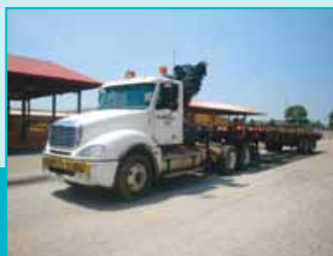
VARIOUS FREIGHTLINER TRUCKS & TRAILERS