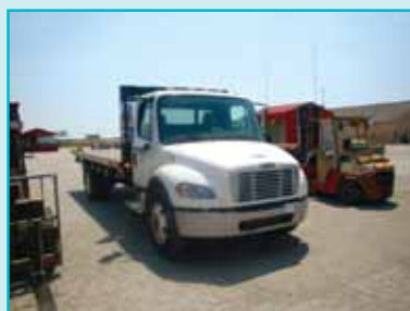
FREIGHTLINER FLATBED TRUCK