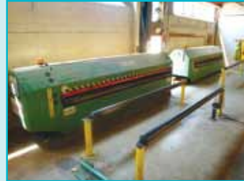
(2 OF 4) TEE-LOK FINISH PRESSES