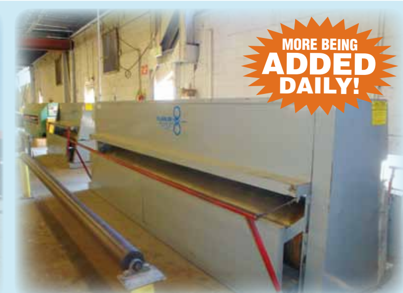
(1 OF 2) 1995 KLAISLER FINISH PRESSES

ON-SIGHT & ONLINE AUCTION BID LIVE @ www.bidspotter.com