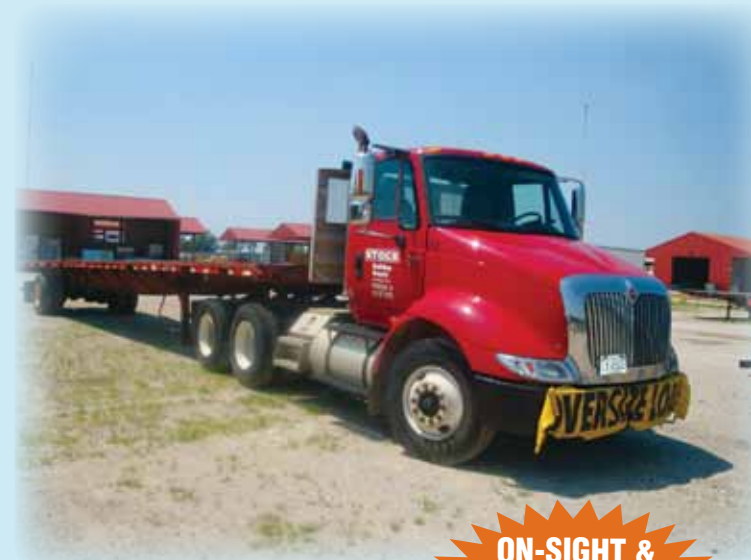
(1 OF MANY) SEMI TRACTORS & TRAILERS

FRIDAY & SATURDAY, AUGUST 14 th & 15 th • BEGINNING @ 9:00 A.M. LOCAL TIME