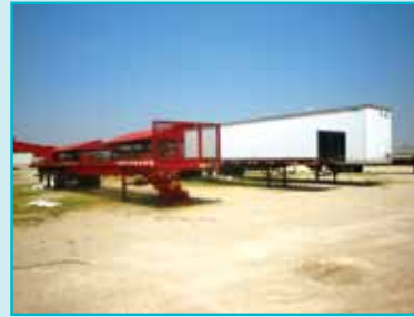
FLATBED & TRUSS TRAILERS