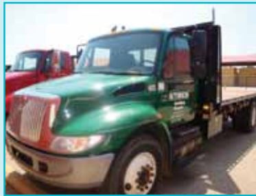
(1 OF 7) LATE MODEL INTERNATIONAL & OTHER MANF. FLATBEDS