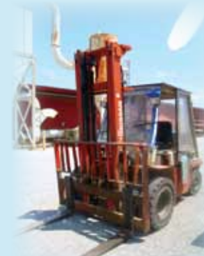
(1 OF 5) NISSAN DIESEL FORK TRUCKS

Super 8—(317) 738-0888 Comfort Inn—(317) 736-0480 Howard Johnson—(317) 738-4448