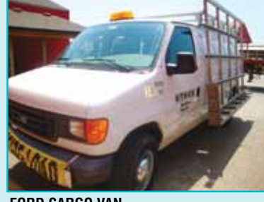
FORD CARGO VAN