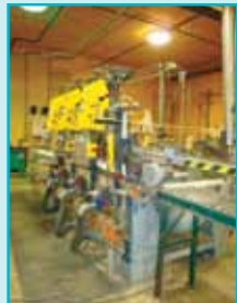
LH SIDE: LATE MODEL DOOR EQUIPMENT