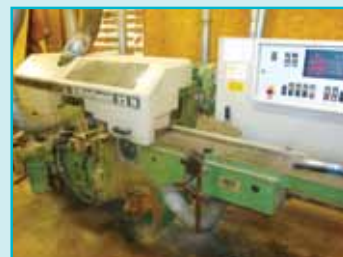
WEINING PROFIMAT 22N MOULDING MACHINE