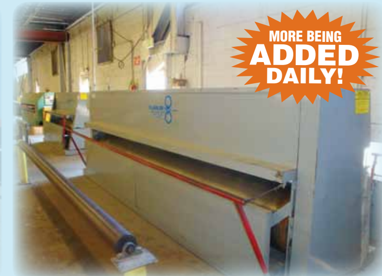
(1 OF 2) 1995 KLAISLER FINISH PRESSES