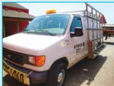
FORD CARGO VAN