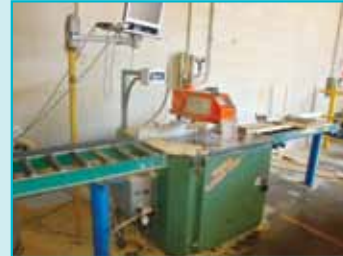
(1 OF 3) VISTA ANGLE BOSS UPCUT SAWS