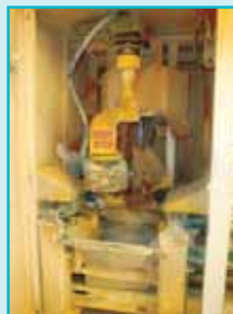
RH SIDE: CNC SPEED CUT SAW