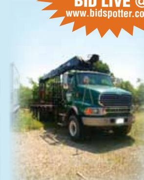
LATE MODEL STERLING BOOM TRUCK