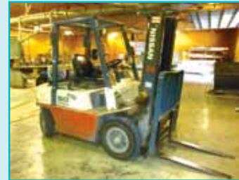
NISSAN 5,000 LB. LP FORK TRUCK