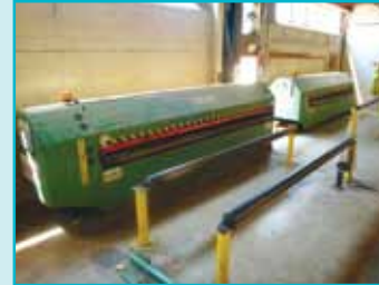
(2 OF 4) TEE-LOK FINISH PRESSES