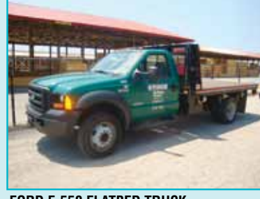
FORD F-550 FLATBED TRUCK