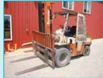
NISSAN 9,000 LB. DIESEL FORK TRUCK