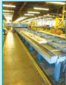
LH SIDE: (1 OF 4) LATE MODEL TRUSS MANF. LINES COMPLETE

Live Internet Bidding BidSpotter.com www.bidspotter.com to register