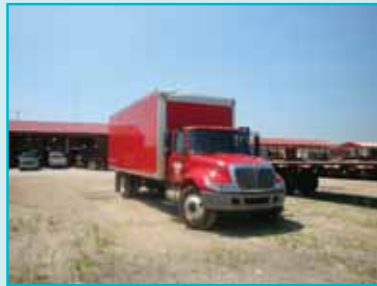
2005 INTERNATIONAL BOX TRUCK