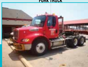
LATE MODEL SEMI TRACTORS