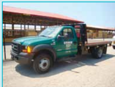
FORD F-550 FLATBED TRUCK