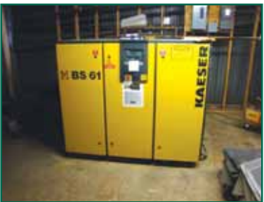
KAESER 25 HP AIR COMPRESSOR