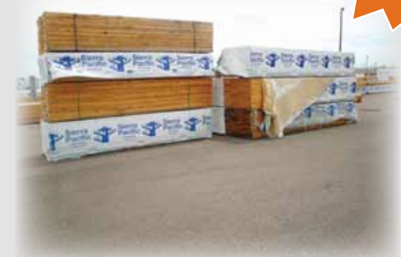
(2 X 4, 6, 8 10 & 12) LUMBER AT VARIOUS LENGTHS