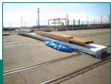
HUNDREDS OF TRUSS PRODUCTS

* FAR TOO MUCH TO LIST-VISIT OUR WEBSITE FOR DETAILED LISTING!!