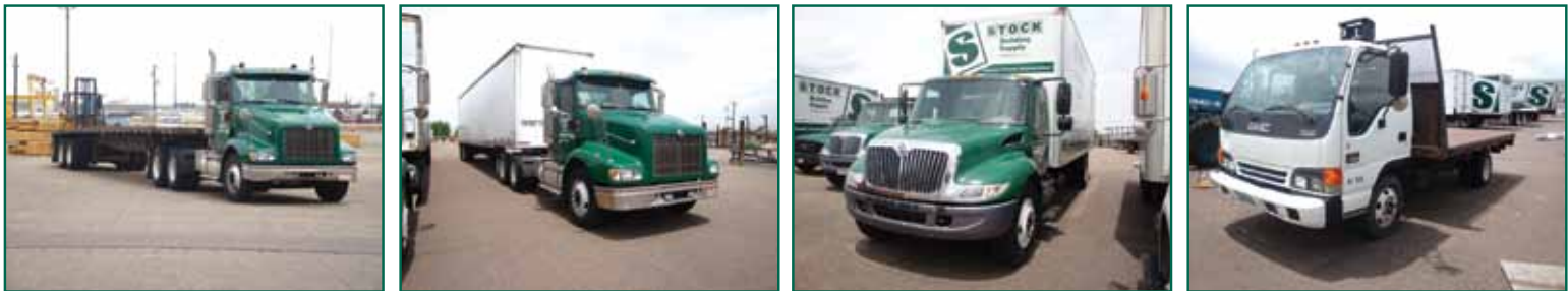
(1 OF 2) INTERNATIONAL TRACTOR TRAILER RIGS WITH ATTACHED MOFFET (1 OF 5) INTERNATIONAL SEMI TRACTORS 2009 INTERNATIONAL BOX TRUCK GMC W4500 FLATBED TRUCK

JET Drill Press, Model JDP-20MF, S/N 6060091