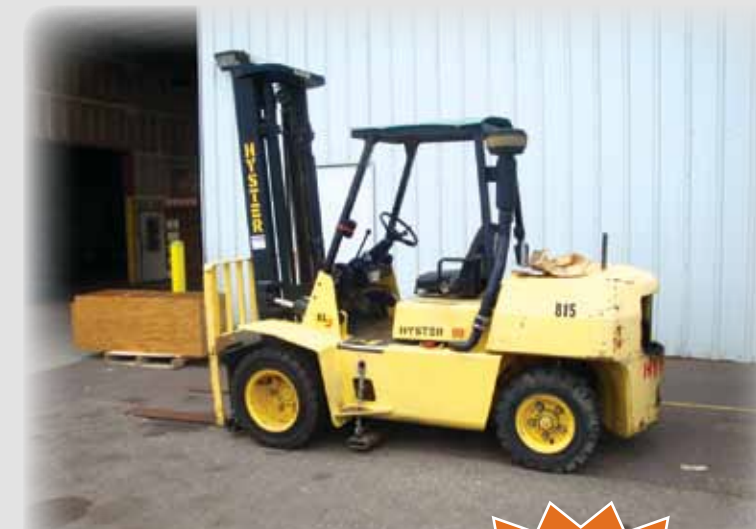
(1 OF OVER 50) VARIOUS FORK TRUCKS

TUESDAY & WEDNESDAY, JULY 14 th & 15 th • 9:00 A.M. LOCAL TIME