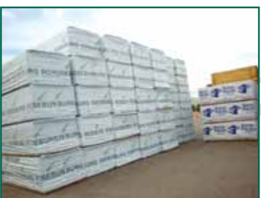
THOUSANDS OF BOARD FEET OF 2 X 4 LUMBER