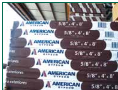
AMERICAN GYPSUM DRYWALL