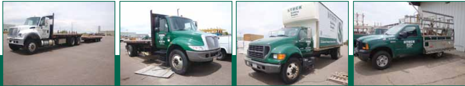
2004 INTERNATIONAL 7600 FLATBED TRUCK 2005 INTERNATIONAL 4300 FLATBED TRUCK FORD F-650 FLATBED TRUCK FORD GLASS PANEL TRUCK

ROCKWELL Drill Press, Model 20, S/N 1757159