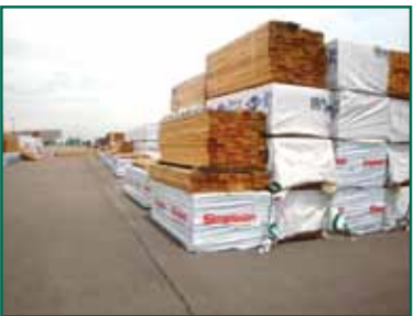
NEED LUMBER? THIS IS THE PLACE TO GET IT