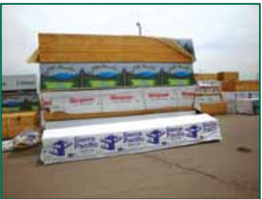
HUGE QTY OF LUMBER