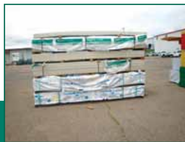
THOUSANDS OF FEET OF HARDIE EXTERIOR TRIM