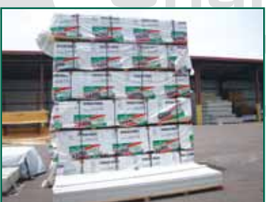
THOUSANDS OF FEET OF HARDIE TRIM