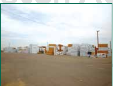
VARIOUS PLYWOOD & LUMBER