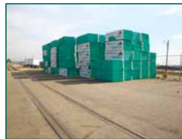
HUGE QTY OF OSB PLYWOOD

Huge Qty. Of New Windows, Dbl. Hung, Glass Block, Decorative Basement – Manufacturers JELD-WEN, PGT WIN GUARD, LAWSON – *All Shapes & Sizes*