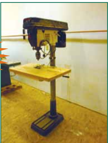
JET DRILL PRESS

FAR TOO MUCH TO LIST!! ADDITIONAL ITEMS BEING ADDED DAILY! WATCH OUR WEBSITE WWW.CHARLESTONAUCTIONS.COM FOR AN UPDATED LISTING!