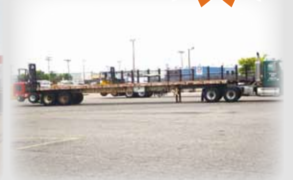
OVER 40 SEMI TRACTORS, TRAILERS, BOX TRUCKS & STAKEBEDS