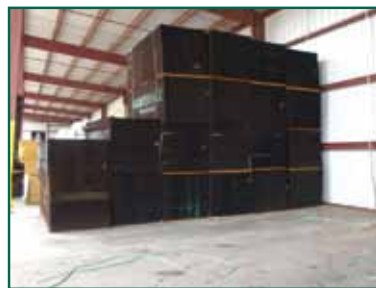
BUNK AFTER BUNK OF FIBER BOARD