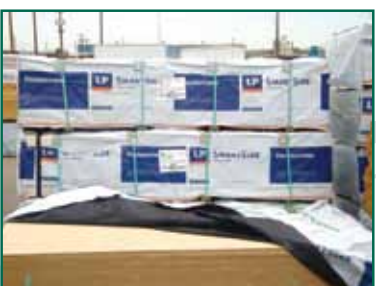
SMARTSIDE EXTERIOR TRIM