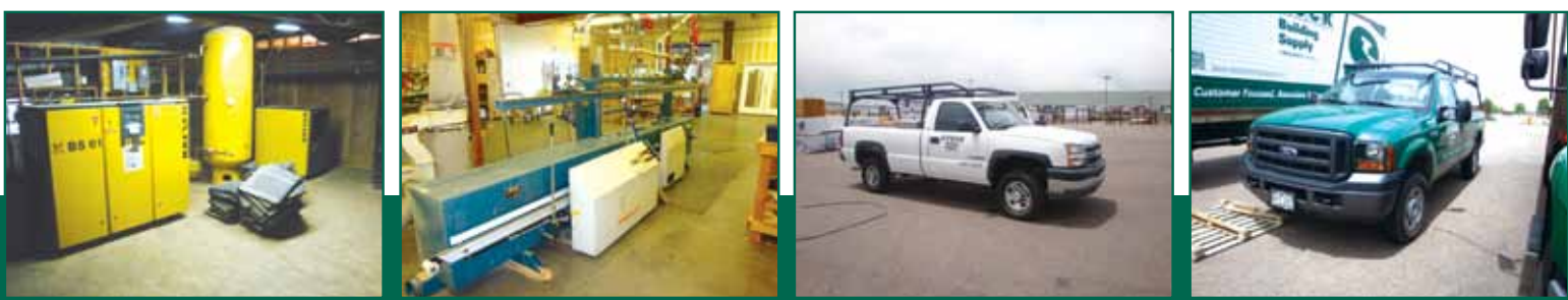
KAESER AIR SYSTEM NORTHFIELD DOOR MACHINE (OVER 5) VARIOUS CHEVY PICK UP TRUCKS (OVER 5) VARIOUS FORD PICK UP TRUCKS

WESTERN FOREST PRODUCTS 2" x 8" x 8', 2" x 8" x 10, 2" x 4" x 16'