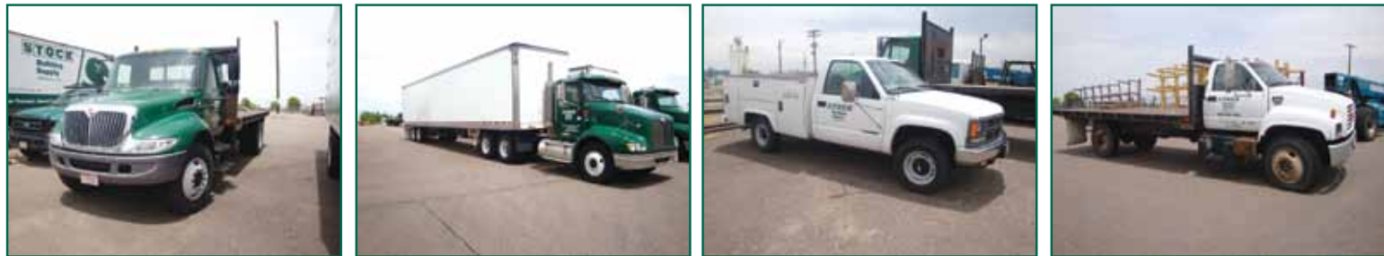
(1 OF 6) 2005 INTERNATIONAL 4300 FLATBED TRUCKS (1 OF 10) VARIOUS SEMI TRACTORS 1999 CHEVY 3500 MAINTANCE TRUCK 1999 GMC FLATBED TRUCK