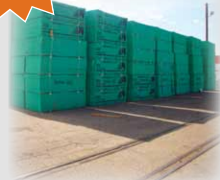
THOUSANDS OF SHEETS OF PLYWOOD, OSB & OTHER VARIOUS SHEET