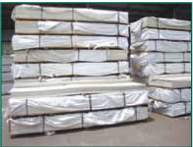
EXTERIOR TRIM & SIDING

Live Internet Bidding BidSpotter.com ® www.bidspotter.com to register