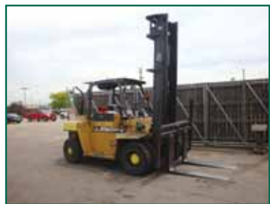
(1 OF MANY) CAT DIESEL FORK TRUCKS