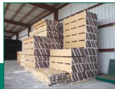
THOUSANDS OF SHEETS OF VARIOUS DRYWALL