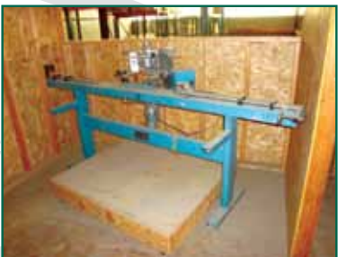
VARIOUS FULLHOUSE DOOR STRIKE MACHINES

Live Internet Bidding BidSpotter.com ® www.bidspotter.com to register