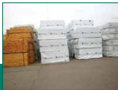
THOUSANDS OF 2 X 4 STUDS