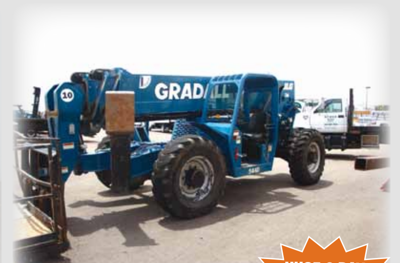
(1 OF OVER 10) GRADALL MATERIAL HANDLERS