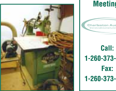
ONSRUD PIN ROUTER