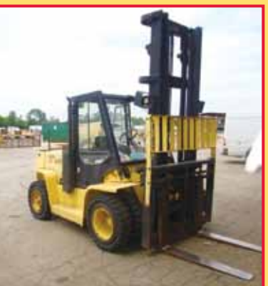
(1 OF 20) VARIOUS HYSTER & TOYOTA FORK TRUCKS

FAR TOO MUCH TO LIST IT ALL! SOMETHING FOR EVERYONE... DONT MISS THE CHANCE TO UPGRADE YOUR OFFICE!