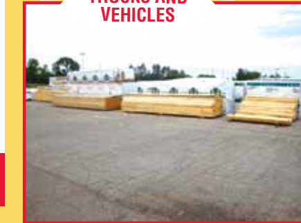
VARIOUS LENGTH 2X6 LUMBER

PREVIEW INSPECTION: Monday, July 20 th 9:00 a.m. - 5:00 p.m.