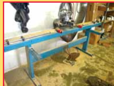
FULLHOUSE DOOR STRIKE MACHINE