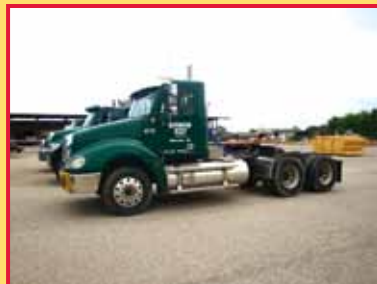
(OVER 10) VARIOUS OVER-THE-ROAD SEMI TRACTORS