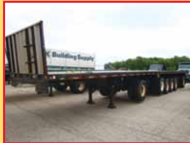
6-AXLE FLATBED TRAILERS