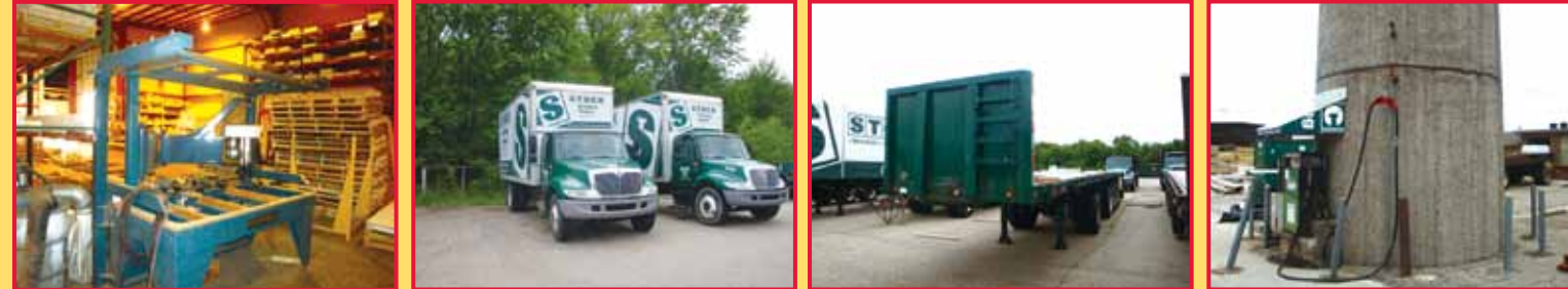
NORFIELD DOOR MACHINE (2) LATE MODEL INTERNATIONAL BOX TRUCKS (1 OF 2) 6-AXLE FLATBED TRAILERS (1 OF 2) 10,000 GAL ABOVE GROUND FUEL TANKS