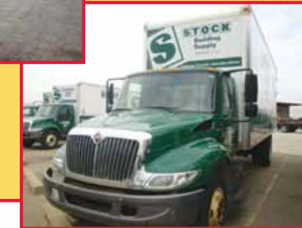
COMPLETE RUVO DOOR MACHINE