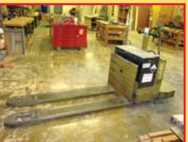
CLARK ELECTRIC PALLET TRUCK