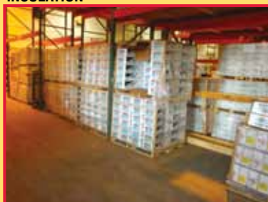
HUGE QTY. OF VARIOUS FASTENERS