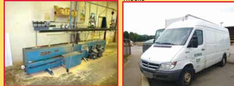
NORFIELD MAGNUM DOOR MACHINE (1 OF 2) DODGE SPRINTER VANS