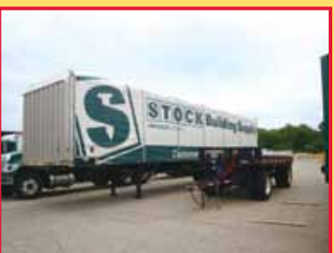
DROP CURTAIN TRAILER