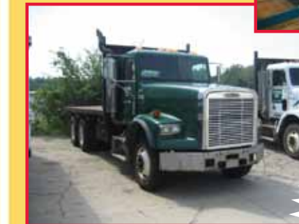
(OVER 50) VARIOUS TRUCKS & VEHICLES

DAY #3 (JULY 23 rd ) BLDG. SUPPLIES TRUCKS AND VEHICLES