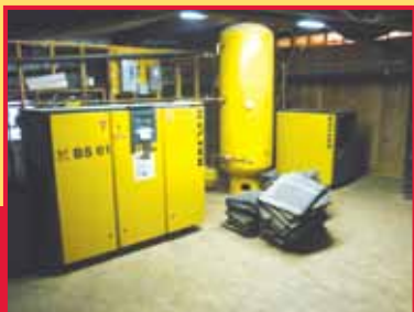
KAESER AIR SYSTEM