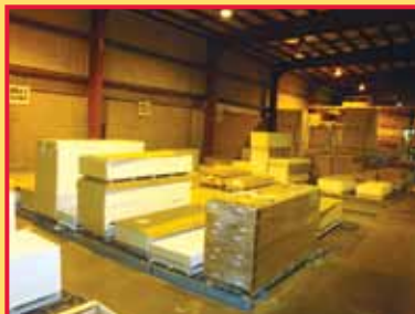
HUGE QTY. OF DOOR SLABS