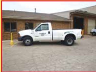
FORD F-350 DUALLY PICK UP TRUCK