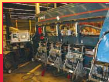
NORFIELD DOOR MACHINE

Visit the marketplace of Charleston Auctions to buy and sell used industrial equipment ... www.charlestonauctions.com