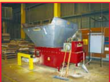
WOOD RECYCLING MACHINE