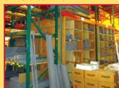
STEEL DOOR JAMBS & SLABS