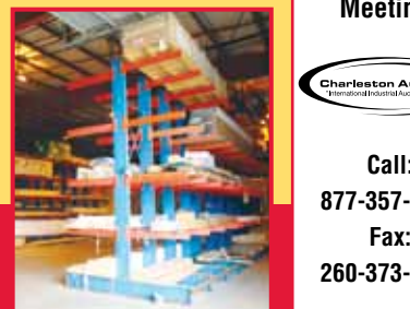
HUNDREDS OF SECTIONS OF "LIKE NEW" RACKING