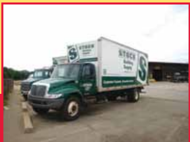
(1 OF MANY) INTERNATIONAL BOX TRUCKS