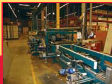
NORFIELD DOOR MACHINE