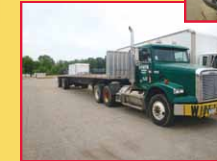
MANY OVER THE ROAD TRACTORS & TRAILERS

WEDNESDAY & THURSDAY, JULY 22 nd - 23 rd BEGINNING @ 9:00 A.M.