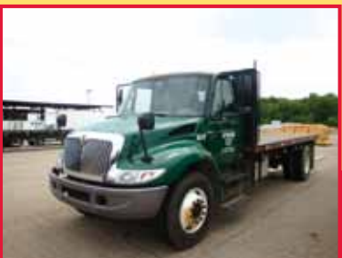
2007 INTERNATIONAL FLATBED TRUCK