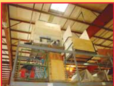
COMPLETE STAND ALONE INSULATION BLOWING UNIT