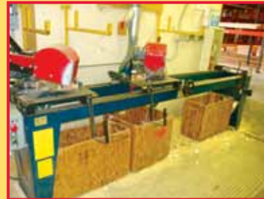
DBL. MITRE MACHINE