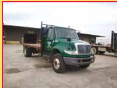
INTERNATIONAL FLATBED TRUCK