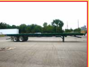
(1 OF 5) VARIOUS TRUSS TRAILERS

NO RESERVE - EXTREMELY SHORT NOTICE SALE!