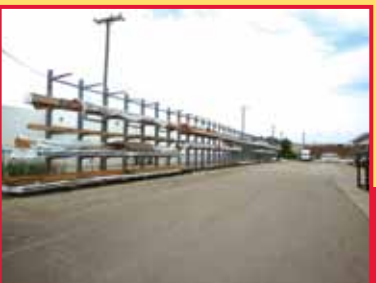
CANTELEVER RACKING & JOIST