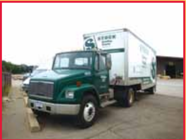
FREIGHTLINER SINGLE AXLE SEMI TRACTOR W/ TRAILER