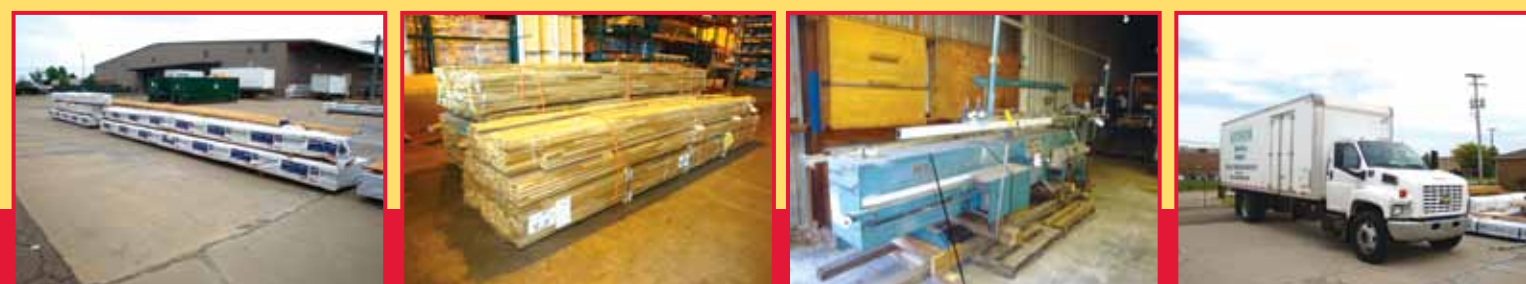
THOUSANDS OF FEET OF JOIST TRIM & MOULDING NORTHFIELD VERTICAL DOOR MACHINE (1 OF 3) INSULATION VEHICLES