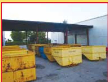
(OVER 50) VARIOUS SIZE DUMP HOPPERS

NO RESERVE - EXTREMELY SHORT NOTICE SALE!