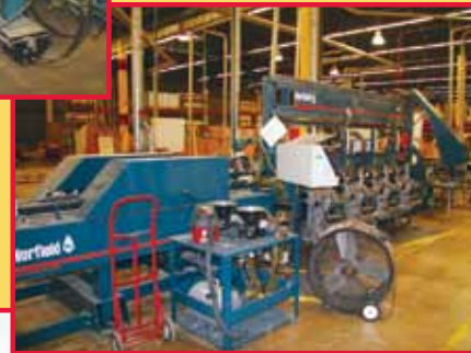
NORFIELD EAGLE DOOR MACHINE