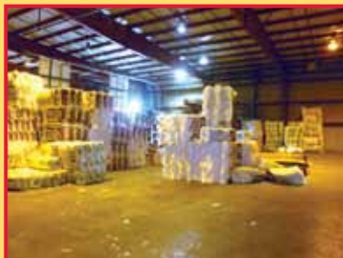
HUGE QTY. OF FIBERGLASS & CELLULOSE INSULATION