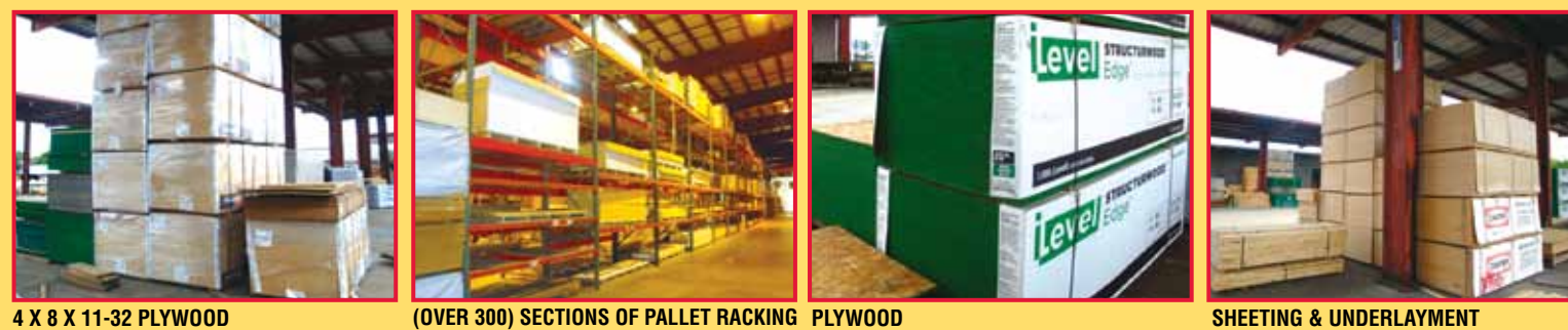
4 X 8 X 11-32 PLYWOOD (OVER 300) SECTIONS OF PALLET RACKING PLYWOOD SHEETING & UNDERLAYMENT

AIRPORT (DETROIT): Detroit Metro AIRPORT (CHICAGO): Midway and O'Hare DETROIT HOTELS: Holiday Inn Express & Suites Chesterfield 45825 Marketplace Boulevard, Chesterfield, MI - (586) 598-4000 Best Western ConCorde Inn 44315 N Gratiot Ave, Clinton, MI - (586) 493-7300 CHICAGO HOTELS: Holiday Inn Hotel & Suites Chicago-Carol Stream (Wheaton) 150 So. Gary Ave., Carol Stream, IL - (877) 863-4780 Hampton Inn 205 W North Ave, Carol Stream, IL - (630) 681-9200 Holiday Inn Hotel & Suites Chicago - Northwest 495 Airport Road, Elgin, IL - (847) 488-9000 Hampton Inn Chicago/Elgin - 405 Airport Rd., Elgin, IL - (847) 931-1940