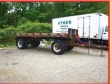
(1 OF 5) PUP TRAILERS