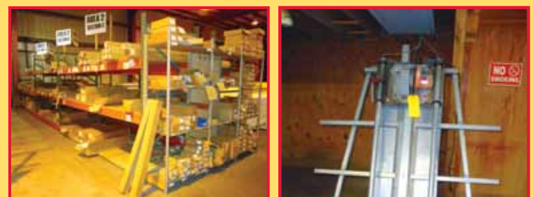
STAIRCASE SUPPLIES MILWAUKEE PANEL SAW