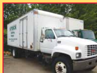
GMC BOX TRUCK