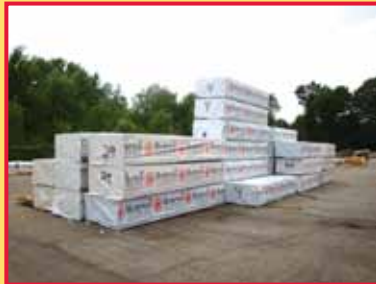
HUGE QTY. OF BUILDING SUPPLIES