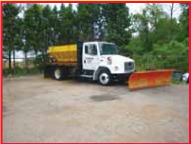
FREIGHTLINER SALT TRUCK W/ SPREADER & PLOW