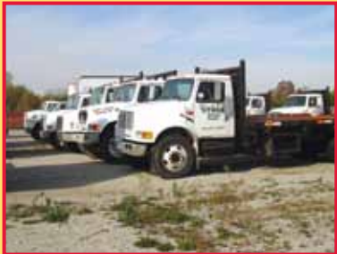
(OVER 50) VARIOUS TRUCKS & VEHICLES