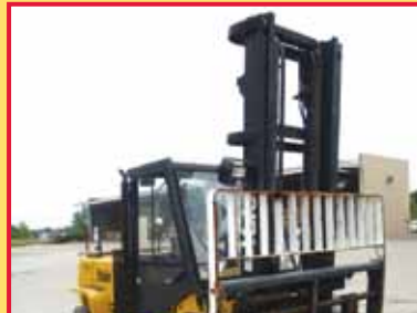
(1 OF 6) 2005 INTERNATIONAL 4300 FLATBED TRUCKS