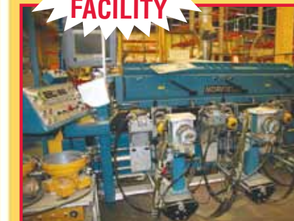
NORFIELD DOOR MACHINE

PREVIEW INSPECTION: Mon. & Tue., July 20 th & 21 st 9:00 a.m. - 5:00 p.m.