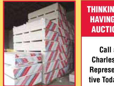
HUGE QTY. OF DRYWALL