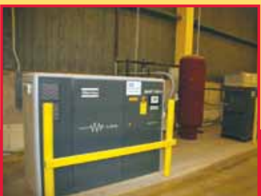
ATLAS COPCO AIR COMPRESSOR