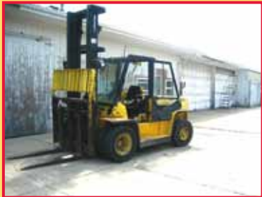
(OVER 25) VARIOUS 5,000 TO 15,000 LB. FORK LIFTS