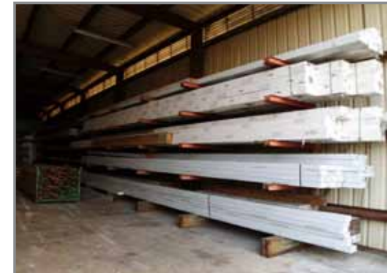
THOUSANDS OF FEET OF TRUSS JOIST