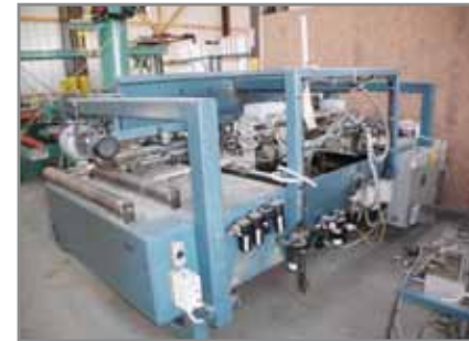
NORFIELD DOOR MACHINES