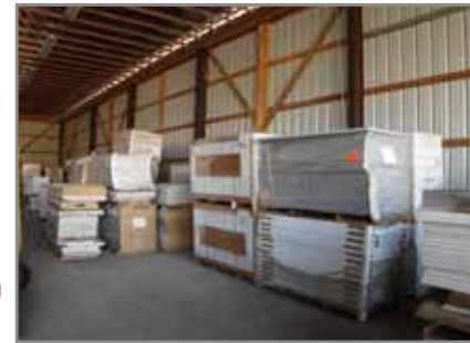
HUGE DOOR INVENTORY