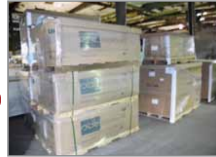
LG QTY OF DOOR GLASS