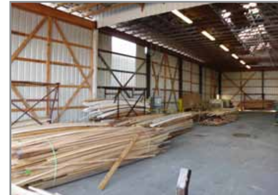
TRIM AND MOULDING