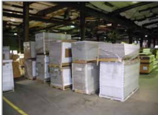
STEEL DOOR SLABS