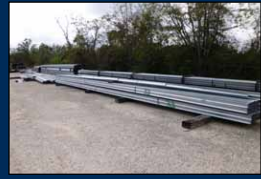
LG QTY OF STEEL BUILDING MATERIAL