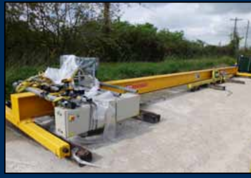
SELF-SUPPORTED 2 TON BRIDGE CRANE