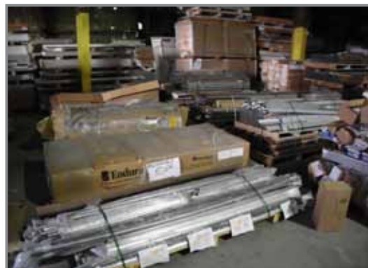
THRESHHOLD AND DOOR SILLS