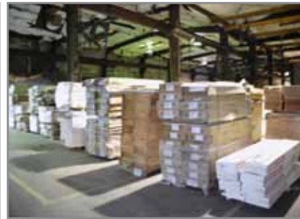
HUNDREDS OF BIFOLD DOORS