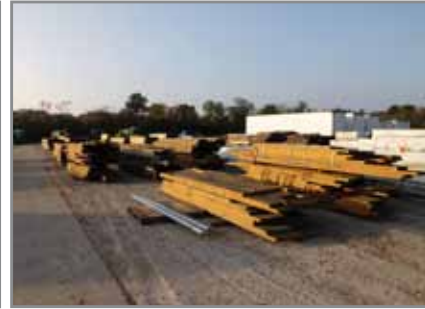
LG QTY OF VARIOUS LUMBER