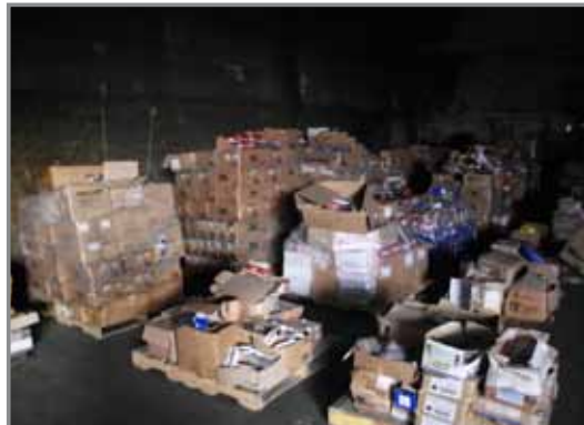
THOUSANDS OF LOCK SETS