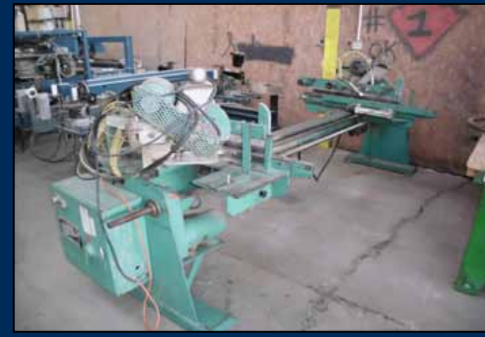
DOUBLE MITRE SAWS

THURSDAY, JANUARY 13th AT 9:00 AM (CST) PREVIEW INSPECTION: Wednesday, January 12th from 9:00 AM - 5:00 PM