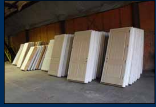
PREHUNG DOORS & DOOR SLABS