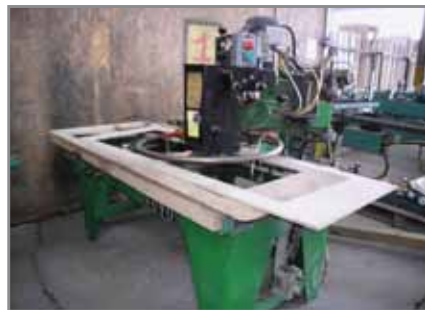
RUVO DOOR ROUTER