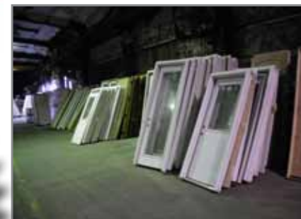
EXTERIOR PREHUNG DOORS