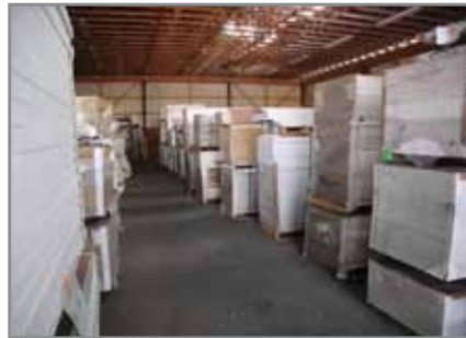
THOUSANDS OF DOOR SLABS