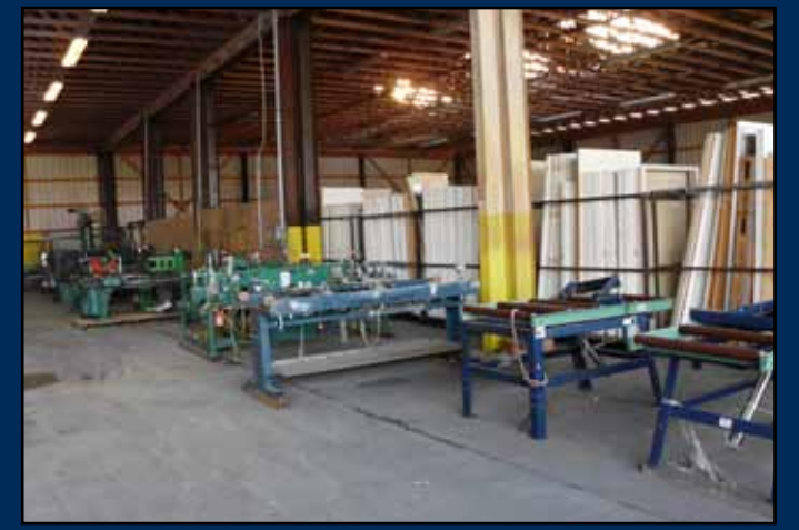
HUGE QTY OF DOOR MANF EQUIPMENT