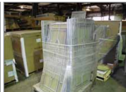
LEADED GLASS INSERTS