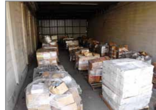
SIMPSON HARDWARE AND ANCHORS