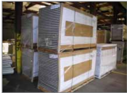
HUNDREDS OF HOLLOWCORE DOOR SLABS