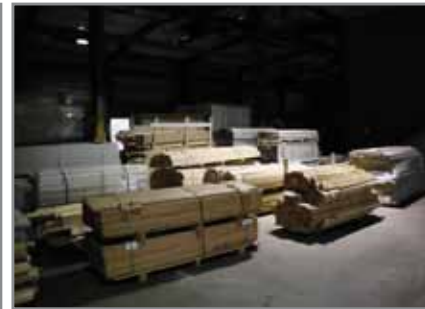
MOULDING AND TRIM