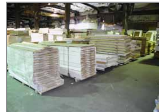
THOUSANDS OF VARIOUS SIZED DOOR SLABS