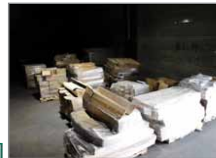
BALISTER AND HANDRAIL PARTS