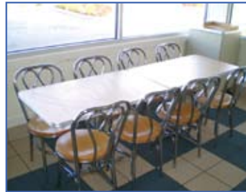
(20+) Various Tables & (40+) Chairs