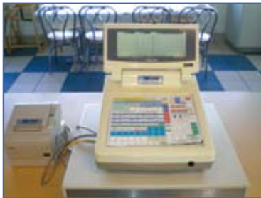
3-Station PANASONIC Cash Register