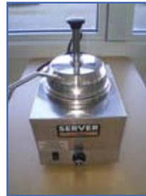
(1 of 8) Hot Fudge Dispenser(s)