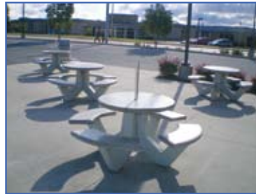
(4 of 10) Granite Top Outdoor Picnic Table(s)