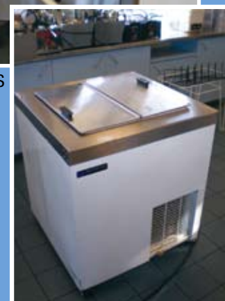
MASTER-BILT Reach-In Freezer