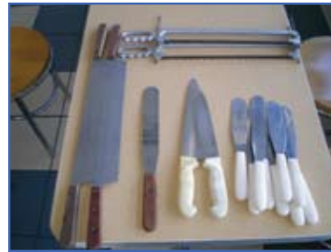
Huge Qty. of Various Kitchen Utensils