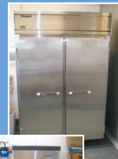
MASTER-BILT Refrigerator/ Freezer