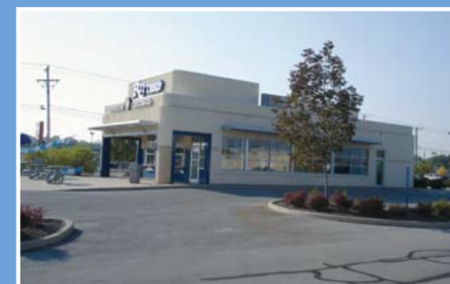
RITTERS Frozen Custard Real Estate