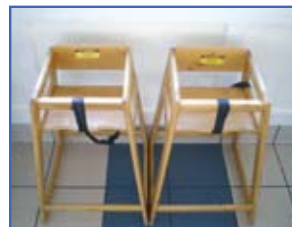
Commercial High Chair(s)