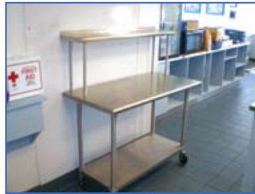
(1 of 2) Stainless Steel Prep Table(s)