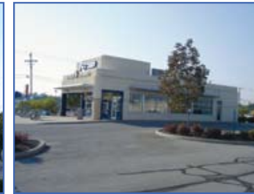
Over 1 Acre Lot