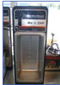
(1 of 4) HAMILTON BEACH Mix n' Chill