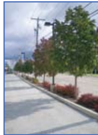
Complete Landscape Package