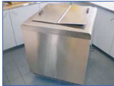
(1 of 4) Various Reach-In Freezers