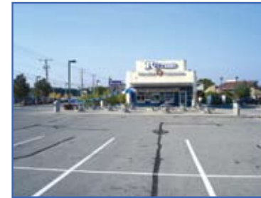
Ritters Frozen Custard Real Estate