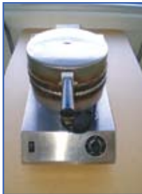
(1 of 5) Commercial Waffle Maker(s)