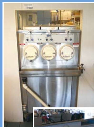
2002 ROSS Custard Machine

Asset Inspection: Monday, October 27 th • 8:00 a.m.-12:00 p.m. (Noon)