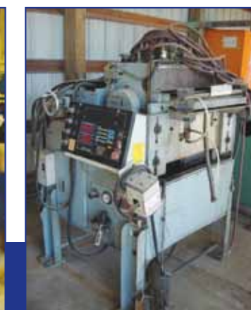
1990 ORI FEEDER