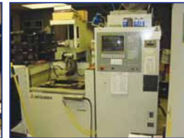
1997 MITSUBISHI FX10 WIRE EDM