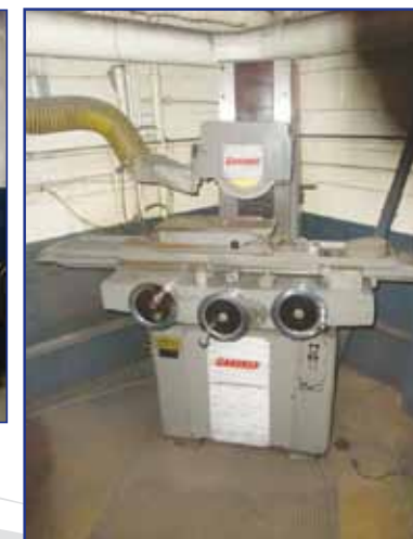
(1 OF 3) GARDENER HAND FEED SURFACE GRINDERS