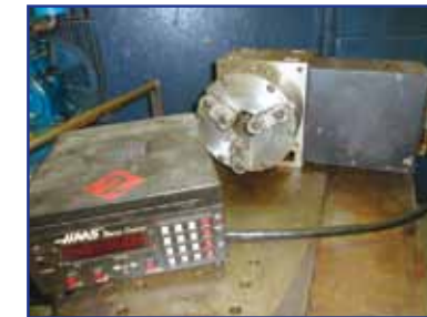
HAAS 4TH AXIS INDEXER