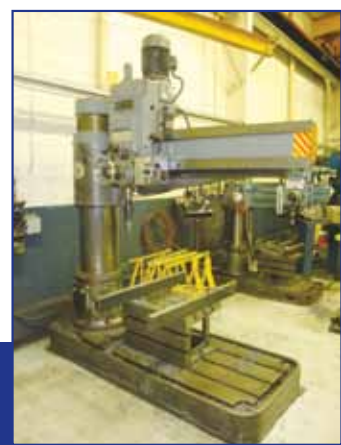
1977 IKEDA RADIAL ARM DRILL