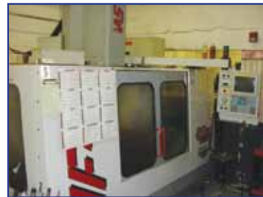
(1 OF 2) 1998 HAAS VF-3 VERTICAL MACHINING CENTERS