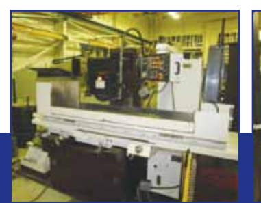
2001 CHEVALIER FSG-1632 AUTOMATIC SURFACE GRINDER