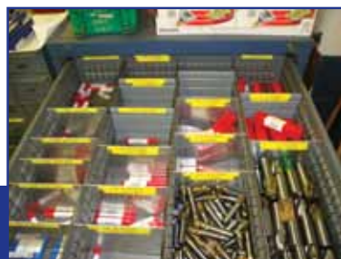
THOUSANDS OF NEW ENDMILLS