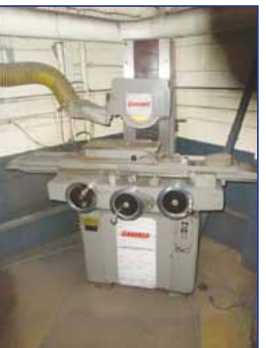
(1 OF 3) GARDENER HAND FEED SURFACE GRINDERS