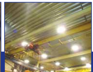
VARIOUS OVER HEAD BRIDGE CRANES AND JIB CRANES