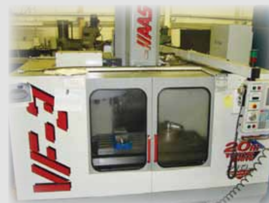
1998 HAAS VF-3 VERTICAL MACHINING CENTER