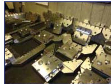
3R EDM TOOLING