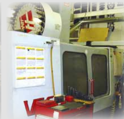
2002 HAAS VF-6 VERTICAL MACHINING CENTER