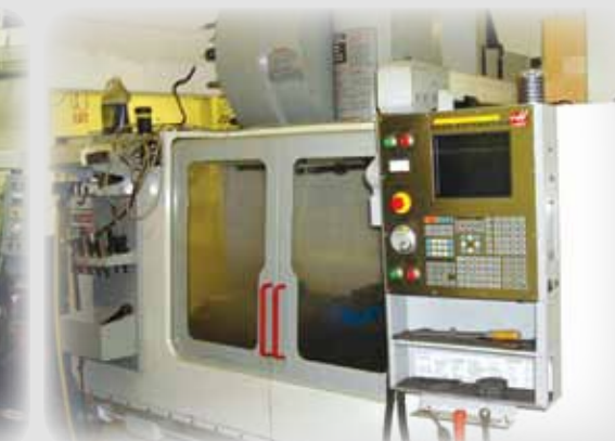
2004 HAAS VF-3S VERTICAL MACHINING CENTER

ALL CNC & EDM'S ARE LASER CERTIFIED ANNUALLY