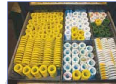
HUGE QTY. OF VARIOUS SIZED DIE SPRINGS