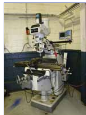
CHEVALIER VERTICAL KNEE MILL