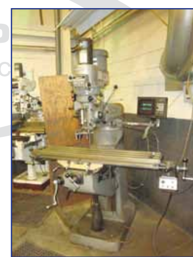
(1 OF 5) VARIOUS VERTICAL MILLING MACHINES