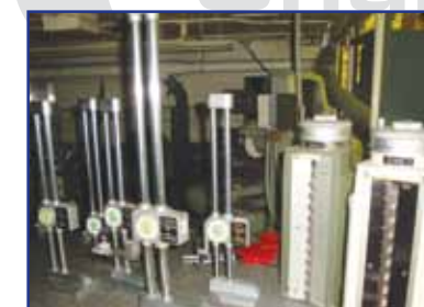
LG. QTY. OF VARIOUS INSPECTION EQUIPMENT