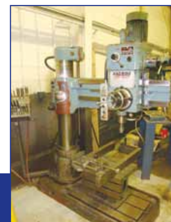
1984 KAO MING RADIAL ARM DRILL