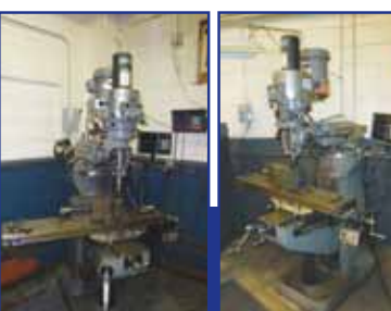
LH PIC: BRIDGEPORT VERTICAL KNEE MILL WITH 4TH AXIS DRO RH PIC: BRIDGEPORT VERTICAL KNEE MILL W/DRO