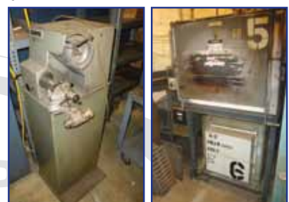
LH PIC: SCRIPTA DRILL SHARPENER