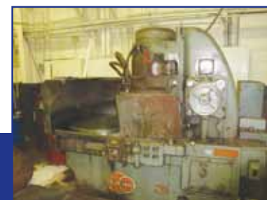
BLANCHARD NO 18 36" ROTARY SURFACE GRINDER