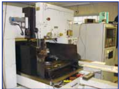
1992 200H1 MITSUBISHI WIRE EDM