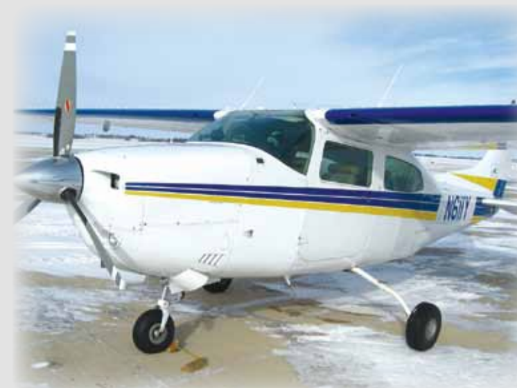
1976 CESSNA T210 AIRCRAFT

THURSDAY, DECEMBER 10 th AT 10:00 A.M. LOCAL TIME