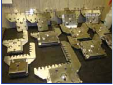
HUGE QTY. OF 3R EDM TOOLING