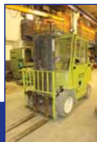
LH PIC: CLARK FORK TRUCK RH PIC: ELECTRA ATMOSPHERIC 2200 DEGREE OVEN