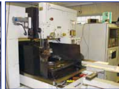
1992 200H1 MITSUBISHI WIRE EDM