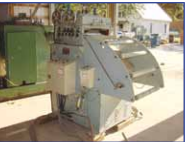
1990 ORI STRAIGHTENER