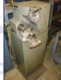
LH PIC: SCRIPTA DRILL SHARPENER