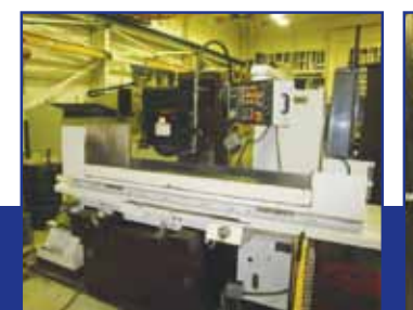
2001 CHEVALIER FSG-1632 AUTOMATIC SURFACE GRINDER