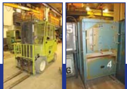
LH PIC: CLARK FORK TRUCK RH PIC: ELECTRA ATMOSPHERIC 2200 DEGREE OVEN