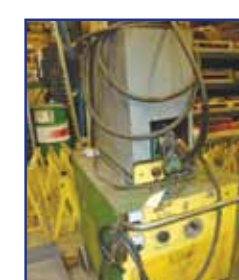
LINDE WIRE WELDER