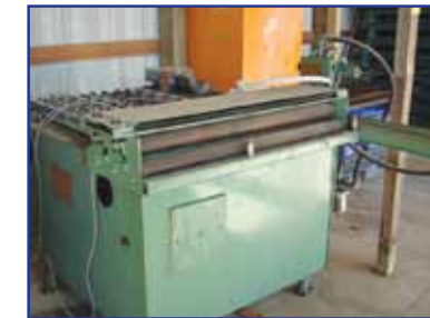
FEED LEASE STRAIGHTENER