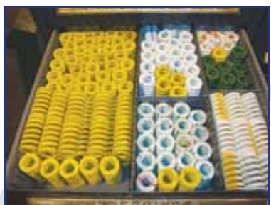
HUGE QTY. OF VARIOUS SIZED DIE SPRINGS