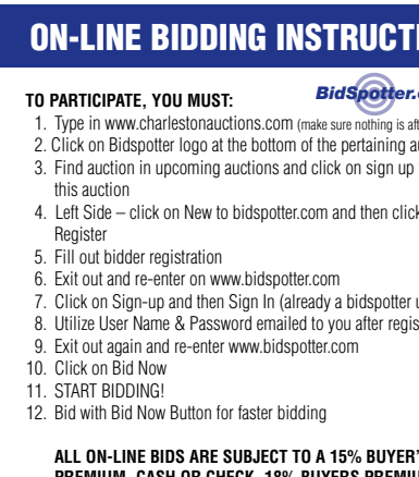
ALL ON-LINE BIDS ARE SUBJECT TO A 15% BUYER'S PREMIUM, CASH OR CHECK, 18% BUYERS PREMIUM IF PAID BY MASTERCARD OR VISA