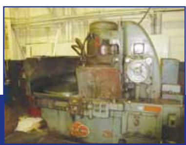
BLANCHARD NO 18 36" ROTARY SURFACE GRINDER