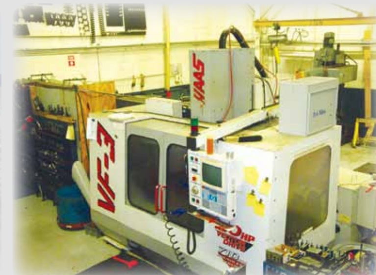
1998 HAAS VF-3 VERTICAL MACHINING CENTER