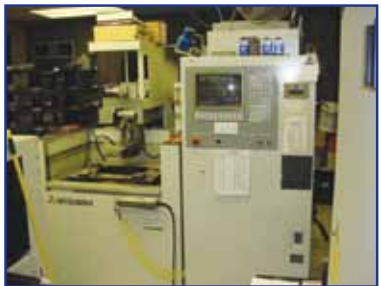
1997 MITSUBISHI FX10 WIRE EDM