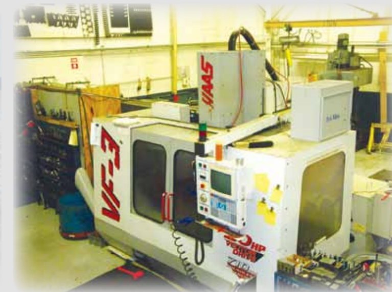
1998 HAAS VF-3 VERTICAL MACHINING CENTER