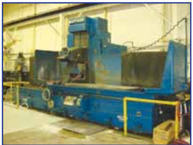
1977 MATTISON GRINDER