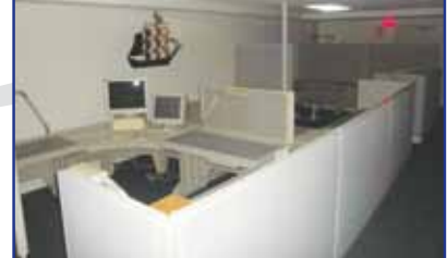
(7) COMPLETE MODULAR WORK STATIONS