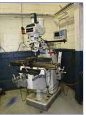
CHEVALIER VERTICAL KNEE MILL