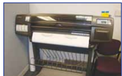
HP DESIGN JET PLOTTER