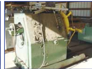
1980 AMERICAN STEEL DECOILER