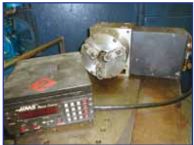
HAAS 4TH AXIS INDEXER