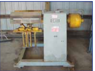
1990 ORI DECOILER