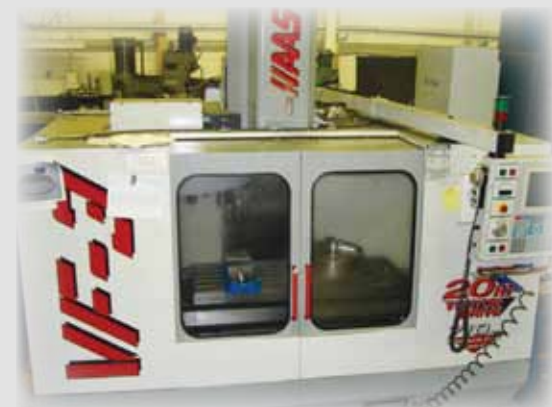
1998 HAAS VF-3 VERTICAL MACHINING CENTER