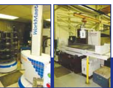
LH PIC: 2000 3R WORK MASTER EDM ROBOT RH PIC: 2004 CHEVALIER FSG-1640 AUTOMATIC SURFACE GRINDER