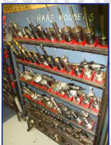
HUGE QTY. OF CAT 40 TOOL HOLDERS