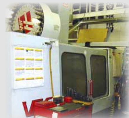
2002 HAAS VF-6 VERTICAL MACHINING CENTER