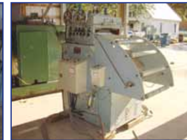
1990 ORI STRAIGHTENER