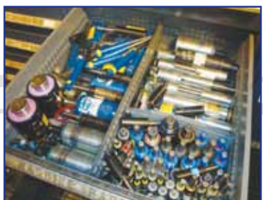
A LARGE QTY. OF NITROGEN CYLINDERS