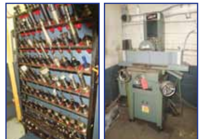
LH PIC: HUNDREDS OF CAT 40 AND 50 TOOL HOLDERS

1987 FORD Flat Bed Truck Model Cargo L/T CF7000 VIN 9BFXH70P6HDM02841 6 Cylinder Engine, 63,779 Miles, 20 Ton Capacity, Diesel