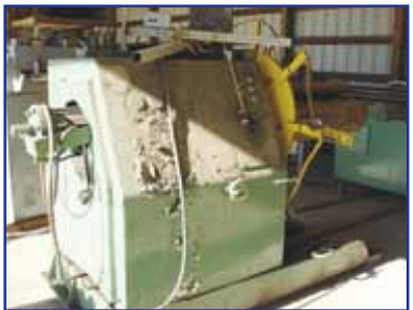
1980 AMERICAN STEEL DECOILER