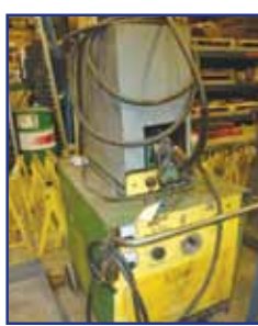
LINDE WIRE WELDER