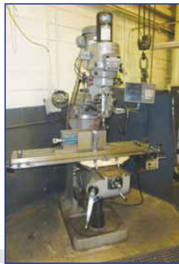
BRIDGEPORT VERTICAL KNEE MILL

Tooling Unlike Anything You Have Seen! Carbide Solid Carbide High Speed Cutters, Mills, Reamers, Counter Bores *New – Never Used* *Hundreds of Lots*