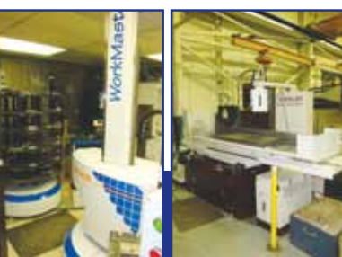
LH PIC: 2000 3R WORK MASTER EDM ROBOT