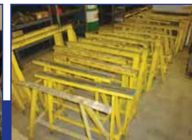
VARIOUS DIE HORSES