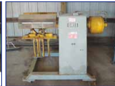
1990 ORI DECOILER