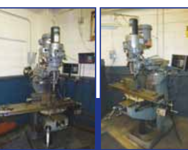
LH PIC: BRIDGEPORT VERTICAL KNEE MILL WITH 4TH AXIS DRO RH PIC: BRIDGEPORT VERTICAL KNEE MILL W/DRO