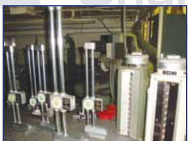
LG. QTY. OF VARIOUS INSPECTION EQUIPMENT