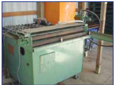
FEED LEASE STRAIGHTENER