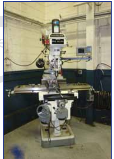
CHEVALIER VERTICAL MILLING MACHINE