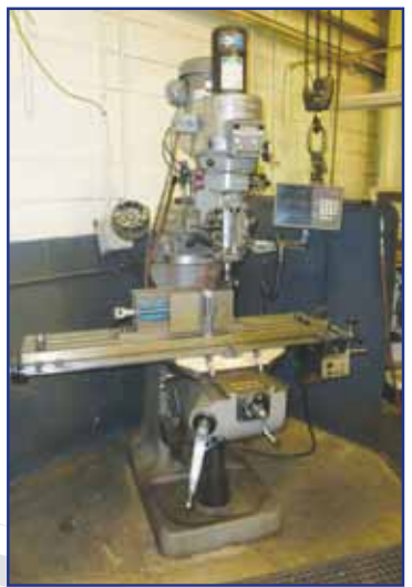
BRIDGEPORT VERTICAL KNEE MILL

Tooling Unlike Anything You Have Seen! Carbide Solid Carbide High Speed Cutters, Mills, Reamers, Counter Bores *New – Never Used* *Hundreds of Lots*