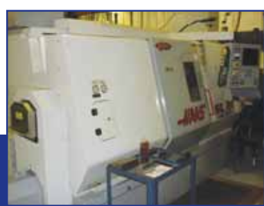
2000 HAAS SL30BB CNC LATHE

1. ALL CNC MILLS HAVE THRU THE SPINDLE COOLANT. 2. ALL CNC MILLS AND WIRE EDM MACHINES ARE LASER CERTIFIED ANNUALLY.