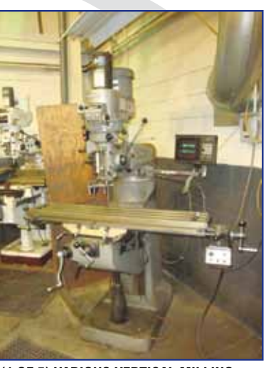
(1 OF 5) VARIOUS VERTICAL MILLING MACHINES