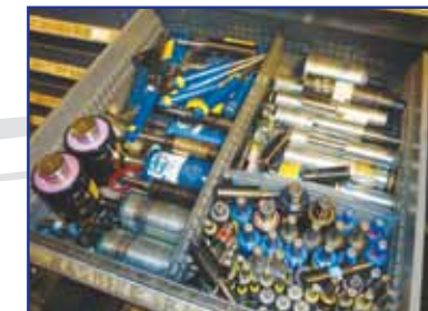
A LARGE QTY. OF NITROGEN CYLINDERS