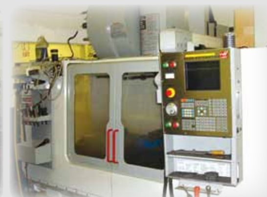
2004 HAAS VF-3S VERTICAL MACHINING CENTER

ALL CNC & EDM'S ARE LASER CERTIFIED ANNUALLY