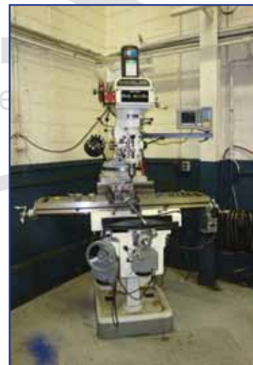
CHEVALIER VERTICAL MILLING MACHINE