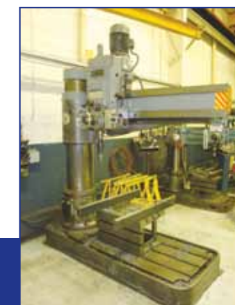
1977 IKEDA RADIAL ARM DRILL