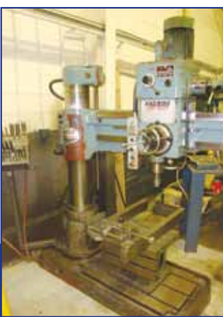
1984 KAO MING RADIAL ARM DRILL