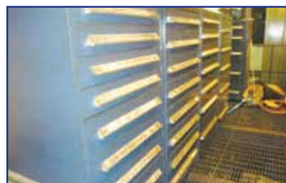
VARIOUS VIDMAR TYPE STORAGE CABINETS