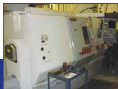
2000 HAAS SL30BB CNC LATHE

1. ALL CNC MILLS HAVE THRU THE SPINDLE COOLANT. 2. ALL CNC MILLS AND WIRE EDM MACHINES ARE LASER CERTIFIED ANNUALLY.