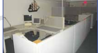
(7) COMPLETE MODULAR WORK STATIONS