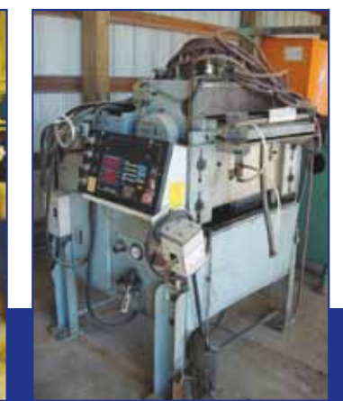
1990 ORI FEEDER