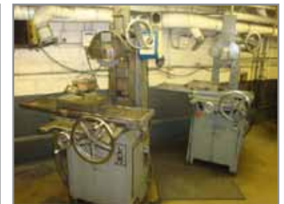
(3) GARDNER SURFACE GRINDERS