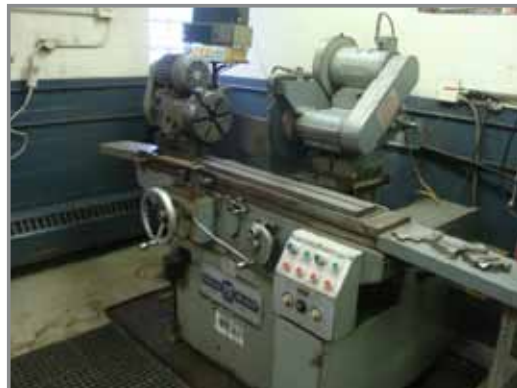
PARKER MAJESTIC OD & ID GRINDER