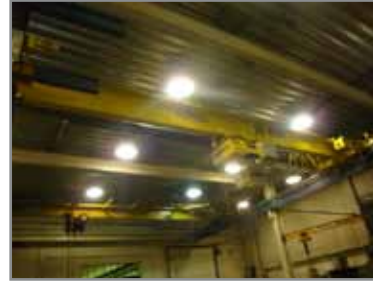
15 TON BRIDGE CRANE