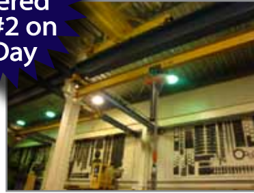
(4) 3 TON CRANES