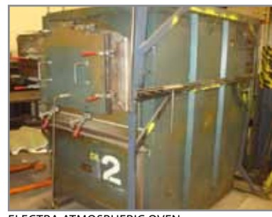
ELECTRA ATMOSPHERIC OVEN