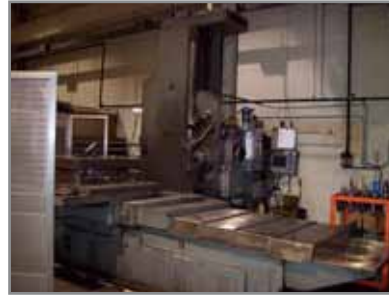
DEVLIEG 4 INCH BORING MILL

Large Qty of Steel Risers Large Qty of CRS Bar Stock Large Qty of Tool Steel Bar Stock Large Qty of Lifting Slings