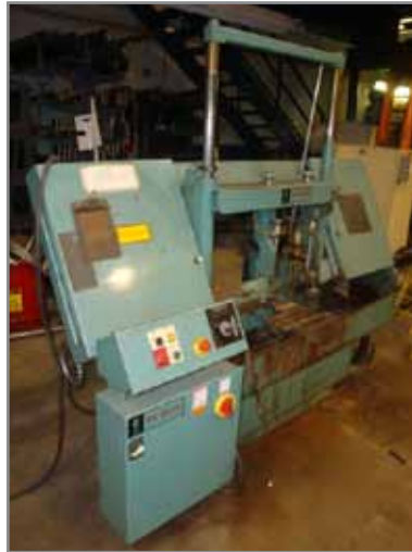
WELL AUTOMATIC HORIZONTAL BANDSAW