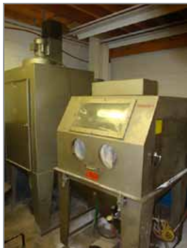
TRINCO DRY BLAST CABINET W/ COLLECTOR