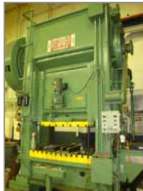
PRECISION 150 TON FLEXOPRESS