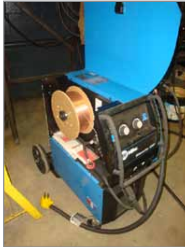
MILLER MILLERMATIC 150P WIRE WELDER