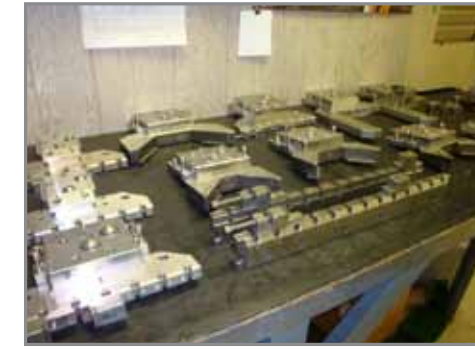
HUGE QTY OF 3R EDM TOOLING