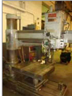
IKEDA RADIAL ARM DRILL