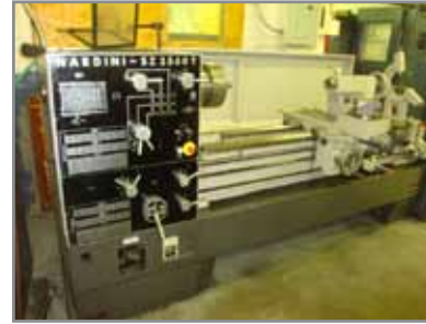
NARDINI SZ-2560T GAP BED LATHE