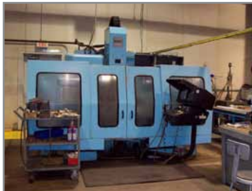
HURCO 3020 CNC VMC