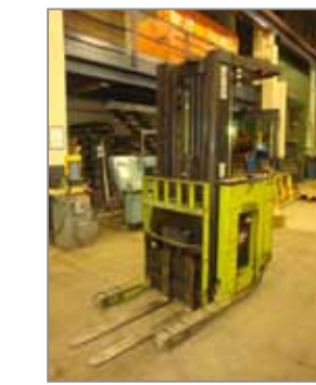
CLARK 4,000 LB PICKER TRUCK