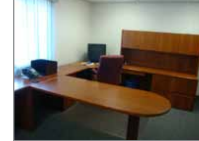
HUGE QTY OF OFFICE FURNITURE