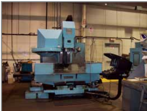
HURCO 4030 CNC VMC