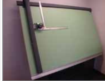
OVER 15 LIKE NEW DRAFTING TABLES