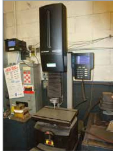
WILSON ROCKWELL 2000 HARDNESS TESTER