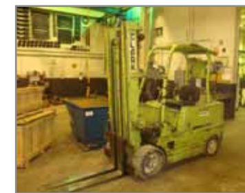
CLARK 8,000 LB FORK TRUCK