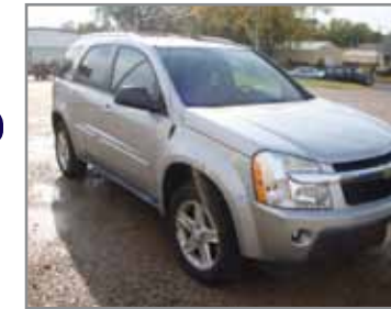
2005 CHEVROLET EQUINOX LT

(3) Banding Carts, Pallet Jacks, Fans, Dump Hoppers, Machine Skates, Large Qty. of VIDMAR Style Cabinets, 2-Door Storage Cabinets, Strong Box Cabinets