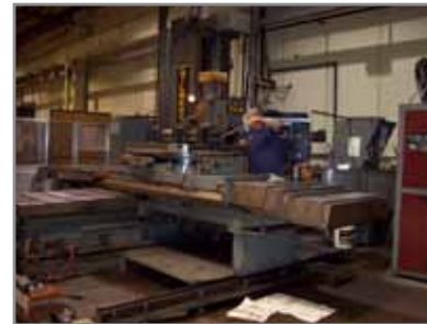
GILBERT 4 INCH CNC BORING MILL