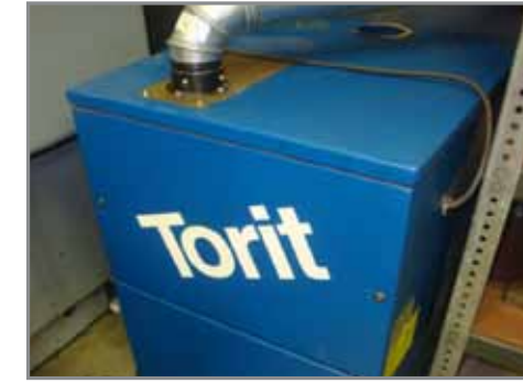
TORIT DUST COLLECTOR