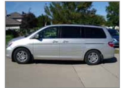
2005 HONDA ODYSSEY

1997 FORD F-250 XLT, VIN-FTFX28L7VKD09198, 123,226 Miles, Auto Transmission, Power Windows/Locks, Club Cab, 4WD 2005 CHEVROLET Equinox LT, VIN-2CND163F556075542, 156,755 Miles, Auto Transmission, Power Locks/Windows, 6 Disc CD Changer, 3rd Row Seating 2005 HONDA Odyssey Van, VIN-5FNRLR387758027092, 135,000 Miles, Auto Transmission, Power Locks/Windows, Power Sliding Side Door, Four Bucket Seats and One Back Bench, Leather Interior, Heated Driver and Passenger Seats, 6 Disc CD Changer