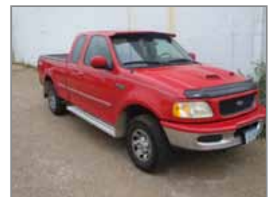
1997 FORD F250 PICK UP TRUCK