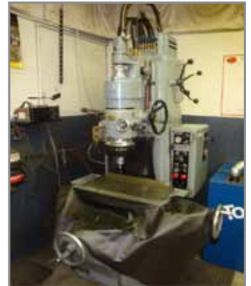
MOORE NO. 3 JIG GRINDER