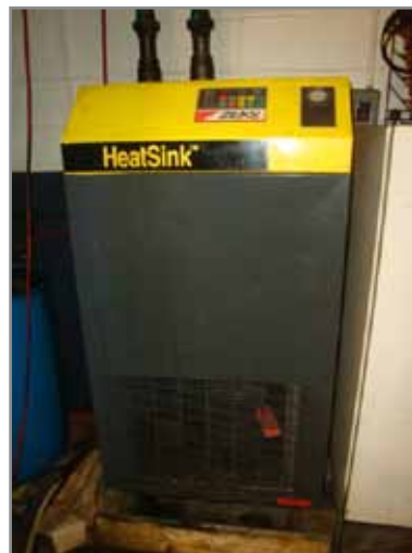
ZEKS AIR DRYER