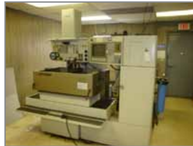
1995 MITSUBISHI SX20 WIRE EDM