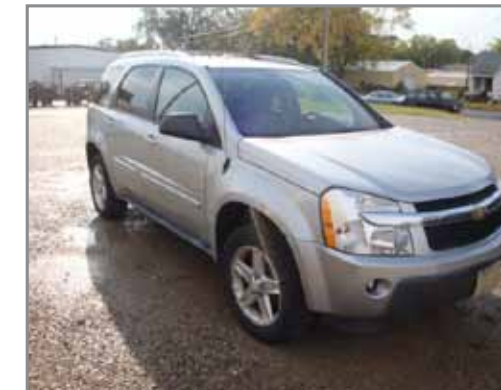
2005 CHEVROLET EQUINOX LT