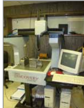
G&L CORDAX DISCOVERY CMM