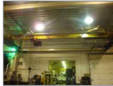
10 TON BRIDGE CRANE

Crane Package to be Offered as Lot #2 on Sale Day