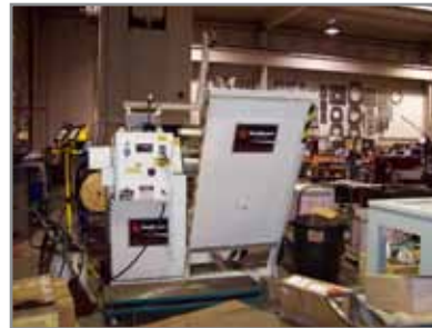
FEED LEASE DECOILER