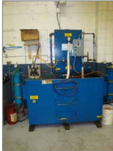
HYDE OIL AND COOLANT RECOVERY SYSTEM