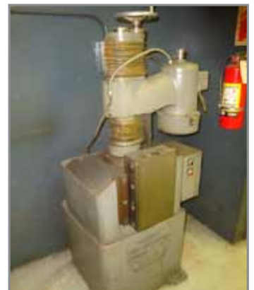
MEDINA END GRINDER