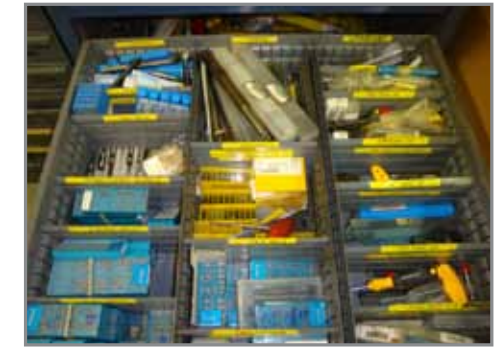
THOUSANDS OF CARBIDE INSERTS