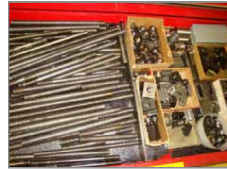
TIE DOWNS AND SET UP TOOLING