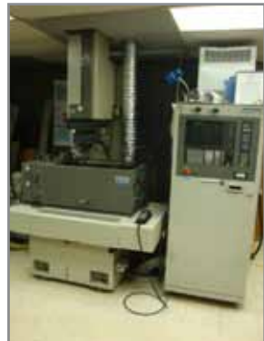
1990 MITSUBISHI SINKER EDM