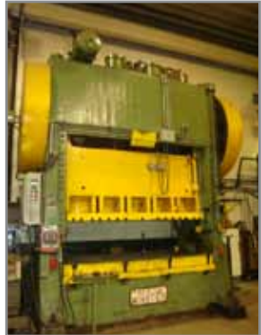
1 OF 2 MINSTER 300 TON PRESSES