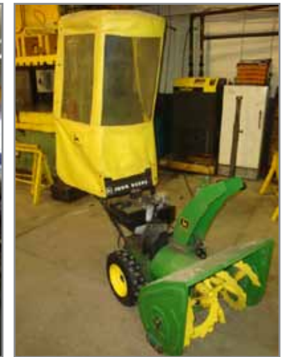
JOHN DEERE SNOW BLOWER