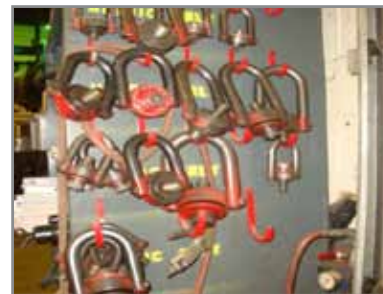
LG QTY OF METRIC SWIVELS