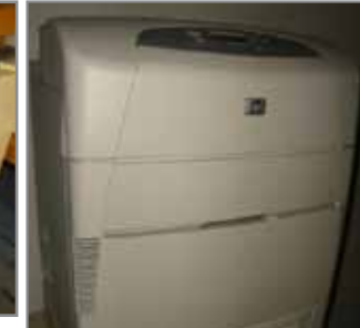
HP COLOR LASER JET 5550DN PRINTER