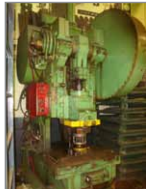
NIAGRA OBI PUNCH PRESS