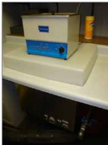
VARIOUS ULTRASONIC WASHERS