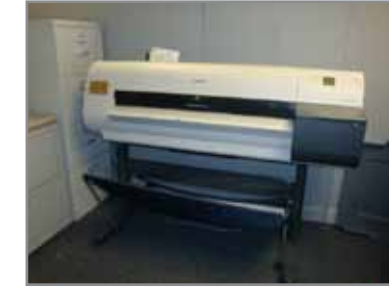
CANON IPF700 COLOR PLOTTER