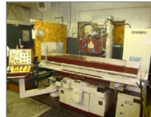
CHEVALIER FSG-1632TX AUTOMATIC GRINDER