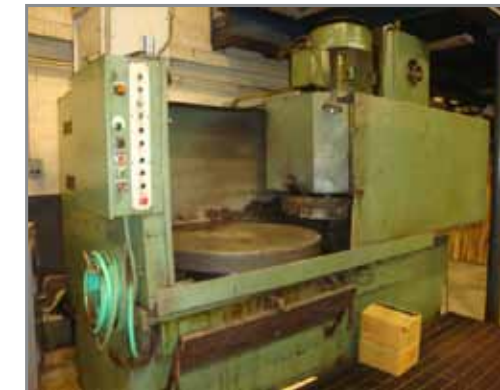
BLANCHARD 48 INCH ROTARY SURFACE GRINDER