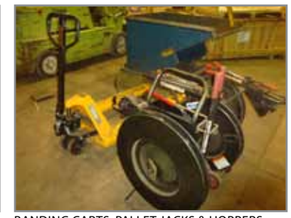
BANDING CARTS, PALLET JACKS & HOPPERS