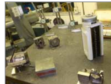
LG QTY OF INSPECTION EQUIPMENT