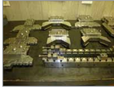
3R EDM TOOLING