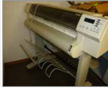
HP DESIGNJET 750C PLUS PLOTTER