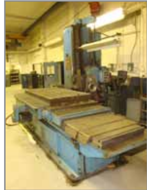
DEVLIEG 3 INCH BORING MILL