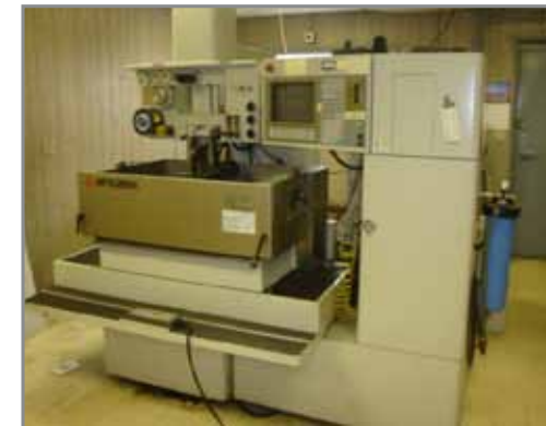
1995 MITSUBISHI SX20 WIRE EDM

View Details for upcoming auctions online at www.CharlestonAuctions.com