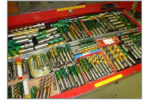
CARBIDE HSS TOOLING