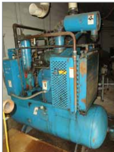
QUINCY ROTARY SCREW AIR COMPRESSOR