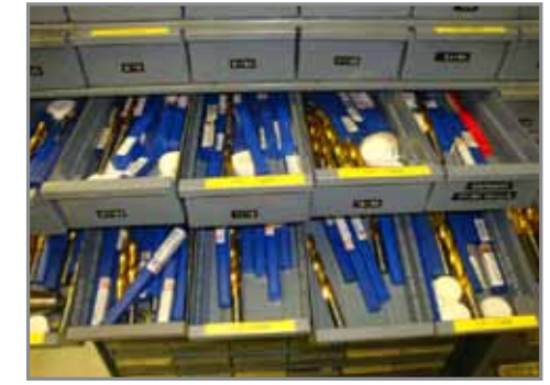
COOLANT THRU CARBIDE CUTTERS & DRILLS