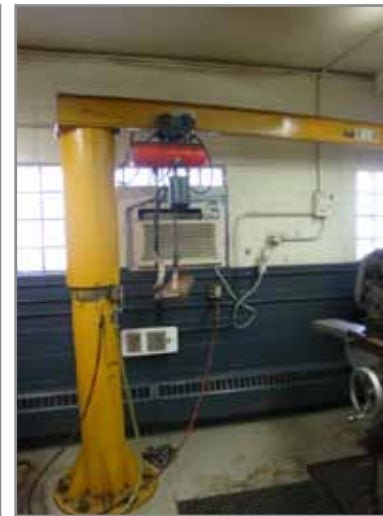
1,000 LB JIB CRANE WITH HOIST