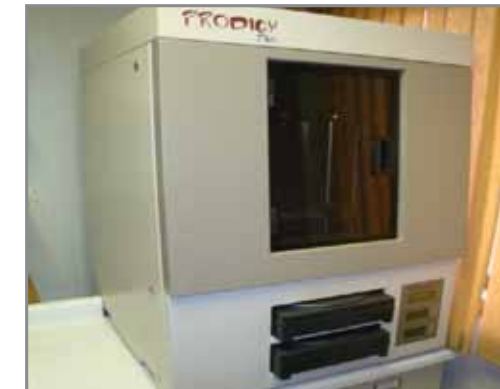
STATASYS PRODOGY PLUS 3D MODELING SYSTEM