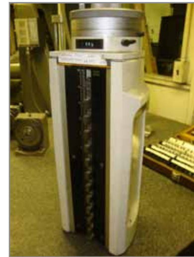
(3) MITUTOYO HEIGHTMASTER HEIGHT GAGES