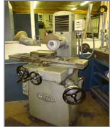
MITSUBI SURFACE GRINDER

AMERICAN FABRICATING & ENGINEERS 15 Ton Bridge Crane, Multi Directional, M-22032, Pendent Controls, 35' Span, Wright 15 Ton Cable Hoist, Top Running 10 Ton Bridge Crane, 35' Span, Wright 10 Ton Cable Hoist, Top Running (4) 3 Ton Bridge Cranes, CM Lode Star 3 Ton Electric Chain Hoist JOHN DEERE Snow Blower, M-828D, TECUMSEH Motor QUINCY Rotary Screw Air Compressor, 14,705 Hrs, S/N-37007QSTHANA33K ZEKS Heat Sink Air Dryer, M-250HSEA400, S/N-128324-1, 460 V, 3-Phase, Digital Controls 1/2 Ton Floor Mounted JIB Crane, CM Lode Star Electric Hoist HYDE Oil/Coolant Recycle System, M-HG25013, S/N-W375 Large Qty. of Tool Steel, Nitrogen Cyc Die Horses, Die Springs, Shim Stock, Brass & Copper Fittings, Work Benches, Material Carts, Ladders, Parts Cleaners