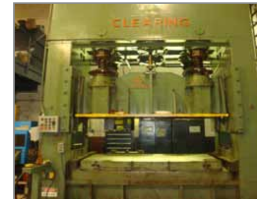
CLEARING 650 TON TRY OUT PRESS