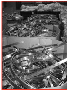
Lg. Qty. Of 304 & 316 Stainless Steel Scrap (Not Blended)