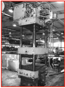
(1) of (2) HYSCO Hydraulic 4-Post Presses