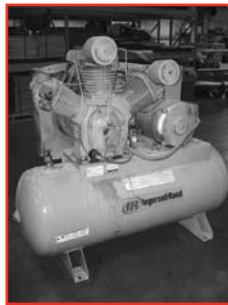
INGERSOLL RAND 30 HP Air Compressor