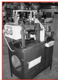
RELIABLE Rubber Mill