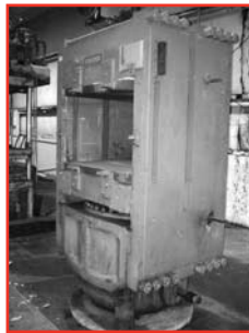
FRENCH Hydraulic Press