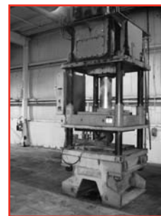
PH HYDRAULICS 4-Post Press

NOTE: While all information contained in this brochure and other advertising has been obtained from sources deemed reliable, neither the auction company, seller, nor publisher shall be liable for any errors or for the correctness of descriptions. All purchases are made "as is, where is" based entirely on the personal inspection and/or opinion of the purchaser and without warranty or guarantee of any kind. Statements made sale day take precedence over printed matter.