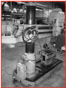
CINCINNATI Radial Arm Drill