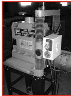
Light Duty Wide Belt Sander