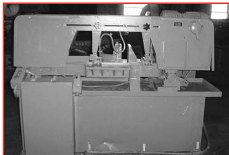
KALAMAZOO Automatic Power Hack Saw