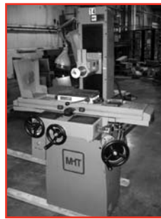
MITSUI Surface Grinder