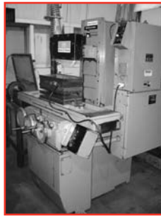
BROWN & SHARPE "Micro-master" Surface Grinder