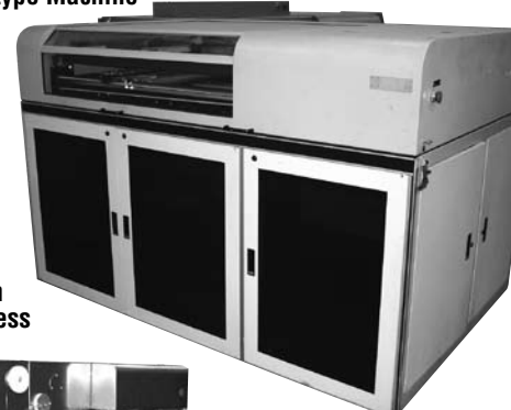
BLISS 75 Ton Stamping Press