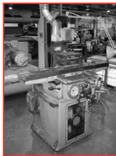
REID Surface Grinder