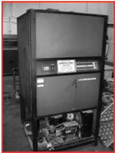
INGERSOLL RAND Air Dryer