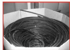
Over 10,000 Lbs. Of Copper Cable