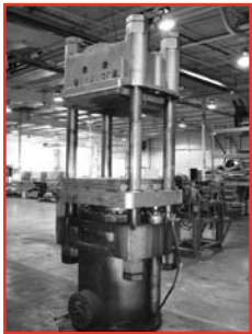
HOLMES Hydraulic 4-Post Press