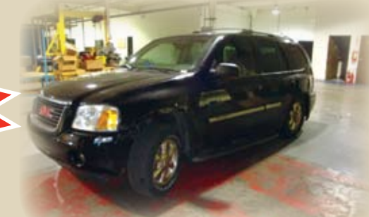
2001 GMC ENVOY SLT