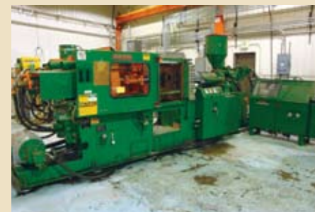
REED 200 TON PLASTIC INJECTION PRESS