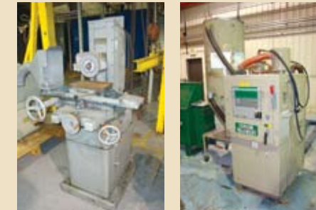
LEFT PIC: (6X18) HANDFEED SURFACE GRINDER RIGHT PIC: CONAIR FRANKLIN VACUUM LOADER