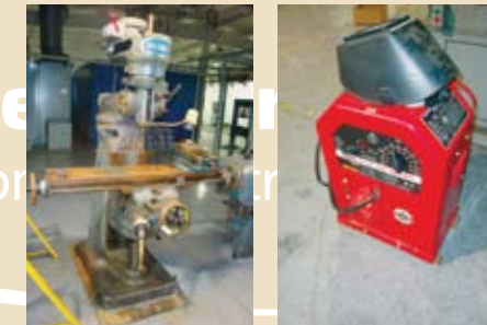
LEFT PIC: INDEX 1 HP VERTICAL MILLING MACHINE RIGHT PIC: LINCOLN ARC WELDER