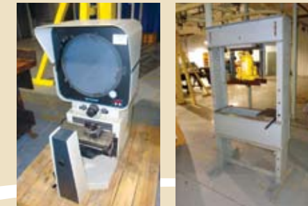
LEFT PIC: DELTRONIC 14" OPTICAL COMPARITOR RIGHT PIC: ENERPAC 30 TON H-FRAME PRESS