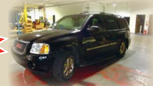
2001 GMC ENVOY SLT