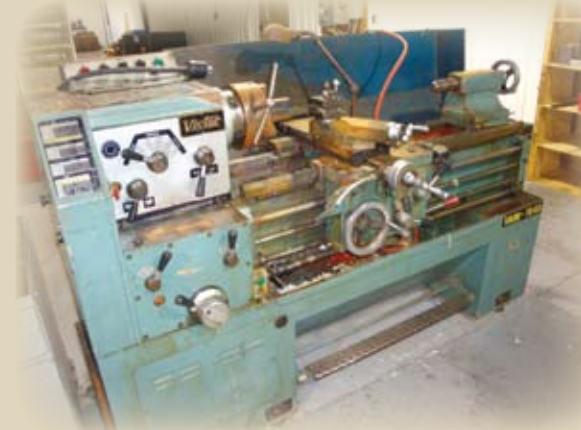
VICTOR TOOL ROOM LATHE

TUESDAY, MARCH 31 st – BEGINNING @ 12 NOON LOCAL TIME