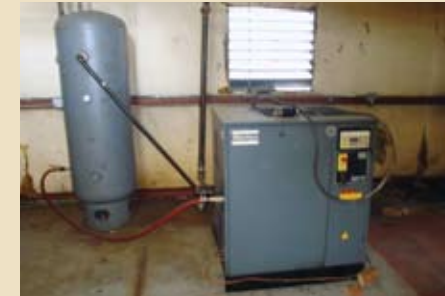
ATLAS COPCO AIR COMPRESSOR & A.R.T.