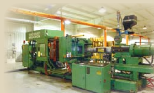
(1 of 8) VARIOUS PLASTIC INJECTION PRESSES