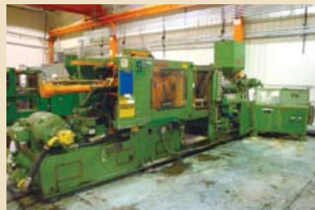
REED 300 TON PLASTIC INJECTION PRESS