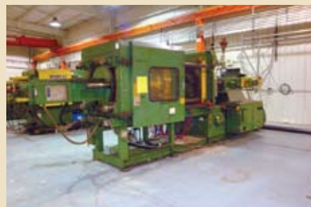
1985 VAN DORN 350 TON PLASTIC INJECTION PRESS