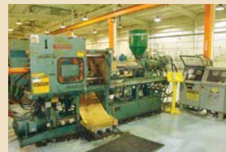
REED 100 TON PLASTIC INJECTION PRESS

2002 BUICK LeSabre, Fully Loaded, Vin. No. 1G4HP52K044119087