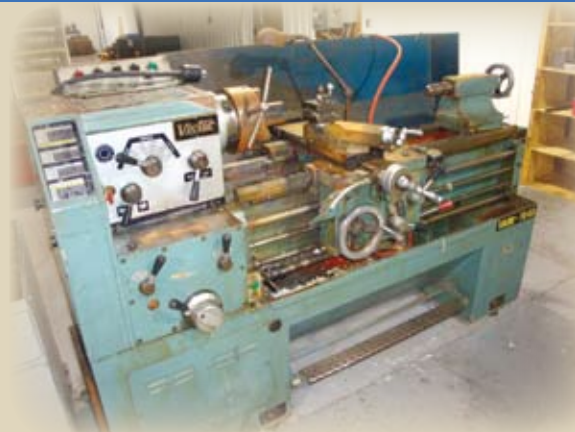
VICTOR TOOL ROOM LATHE

TUESDAY, MARCH 31 st – BEGINNING @ 12 NOON LOCAL TIME