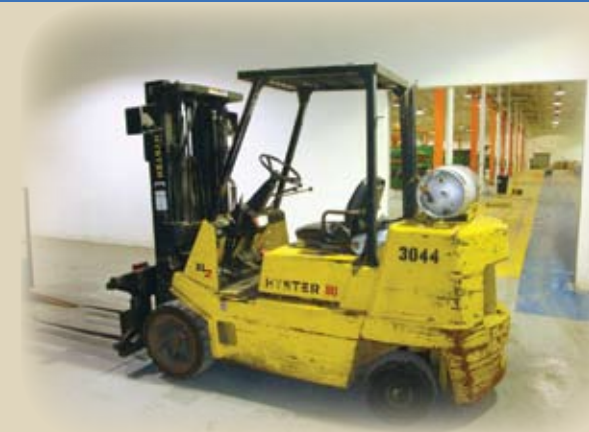
HYSTER 8,000 LB. LP FORK TRUCK