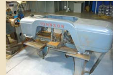
JOHNSON HORIZONTAL BAND SAW