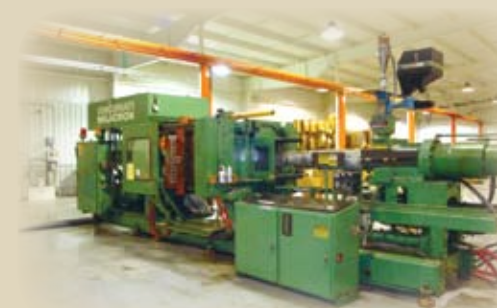
(1 of 8) VARIOUS PLASTIC INJECTION PRESSES