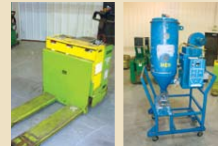
LEFT PIC: CLARK 4,000 LB. ELECTRIC PALLET MULE RIGHT PIC: NOVATEC LOADER