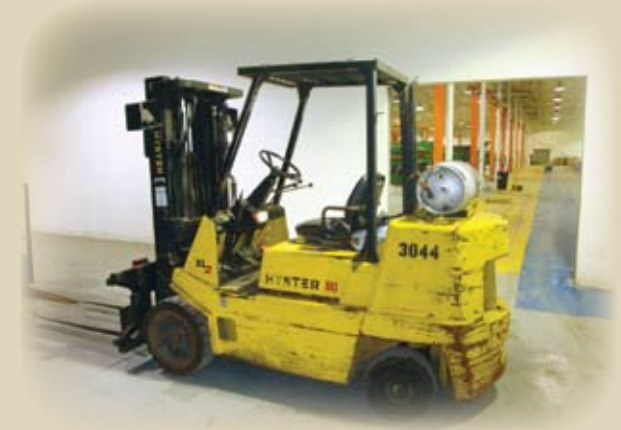
HYSTER 8,000 LB. LP FORK TRUCK