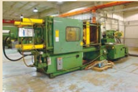
1984 VAN DORN 450 TON PLASTIC INJECTION PRESS