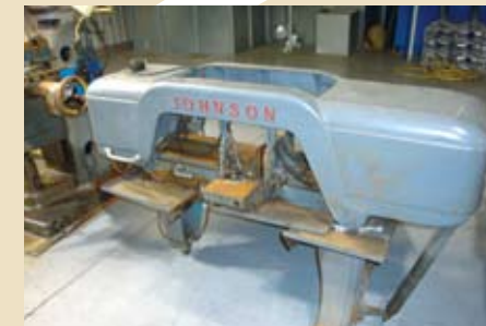
JOHNSON HORIZONTAL BAND SAW