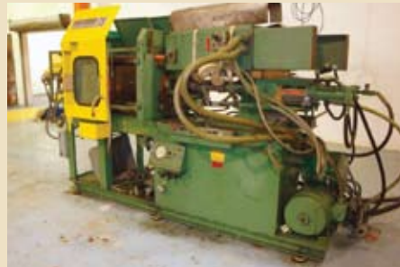
1976 VAN DORN 75 TON PLASTIC INJECTION PRESS