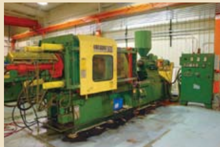
1979 VAN DORN 300 TON PLASTIC INJECTION PRESS