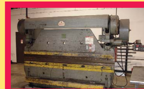
MERCURY MECHANICAL PRESS BRAKE