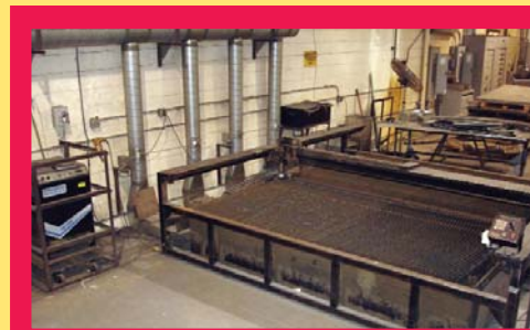
INNERLOGIC DBL BED PLASMA TABLE