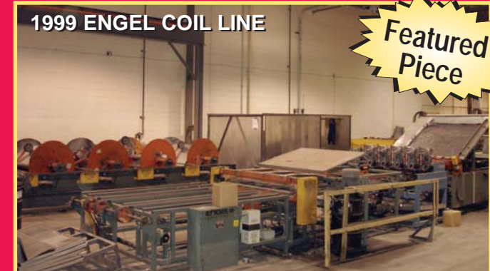
1999 ENGEL COIL LINE