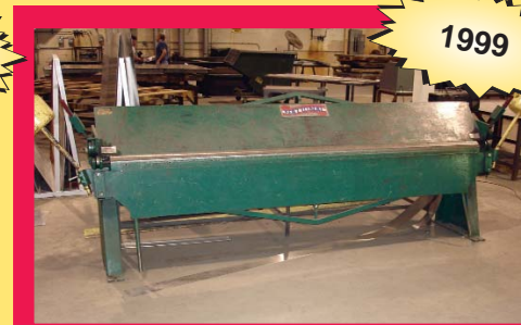
1999 NATIONAL 10' PAN BRAKE