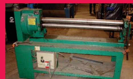
TENNSMITH 4' ELECTRIC SLIP ROLLS