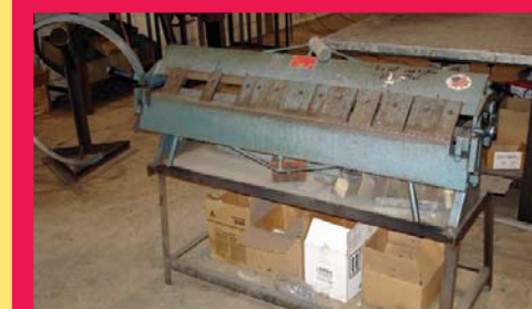
TENNSMITH FINGER BRAKE

Sm. Qty. Office Equipment & Furnishings I.E. Desks, Tables, Chairs, Microwaves, Refrigerators, White Boards, Bookshelves