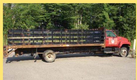
1998 GMC C5500 20' STAKE BED TRUCK