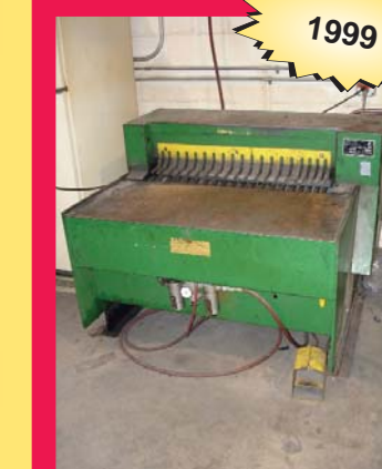
1999 LION CLEAT FORMER