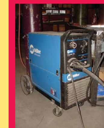
MILLER MIG WELDER