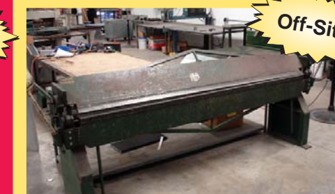
NATIONAL 8' PAN BRAKE