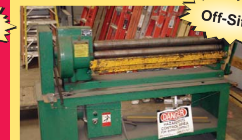
TENNSMITH 4' ELECTRIC SLIP ROLL