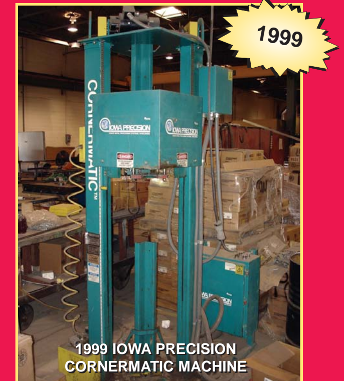
1999 IOWA PRECISION CORNERMATIC MACHINE