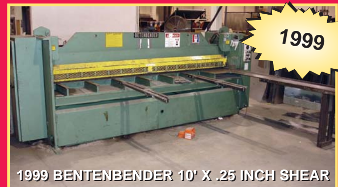
1999 BENTENBENDER 10' X .25 INCH SHEAR