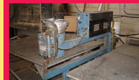
DURO DYNE PINSPOTTER