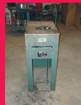
1 OF 2 ENGEL EDGE MASTER FLANGERS