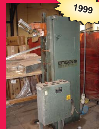
1999 ENGEL 'PITTSBURG' SEAMER

INNERLOGIC Plasma Table, Model SR-1001, Single Head, 15' x 15' Dbl. Bed, Cimtec Controller (2) MILLER Mig Welders, Model 'Millermatic' 210, Single Phase, 200/230 Volts, Hertz 60, KW 5.45, AMP 31/27, S/N LC108895 MILLER Spot Welder, Model SSW-2020ATT, Single Phase, 20 KVA, S/N KK131518 AIRCO 250/AC/DC Heliwelder V, S/N WH607034 (2) Oxygen/Acetylene Torch Carts w/ Hoses, Gages (No Tanks)