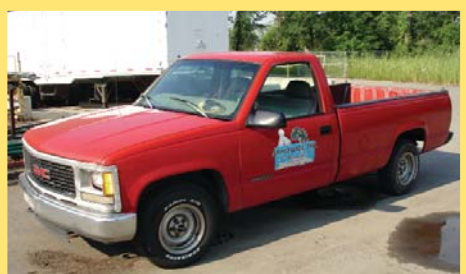
1997 GMC 1500 PICK UP TRUCK