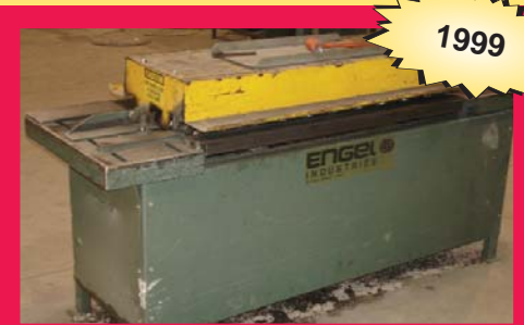
1999 ENGEL 10 ROLL FORMING MACHINE