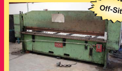
CHICAGO 10' HYDRAULIC BRAKE