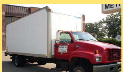
1999 GMC C6500 20' BOX TRUCK

LG. QTY. OF COMPANY VEHICLES, TRUCKS, CARS, ON-SITE OFFICE/JOB TRAILERS – ADDITIONAL VEHICLES BEING ADDED DAILY