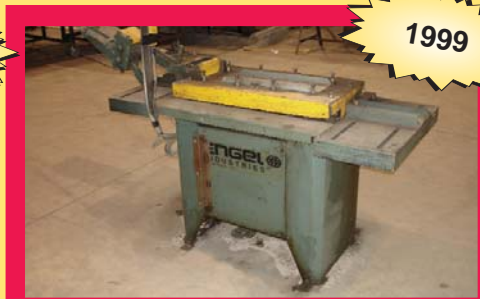
1999 ENGEL 8 ROLL FORMING MACHINE