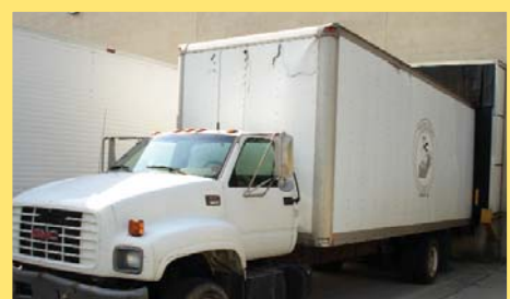
GMC 6500 BOX TRUCK