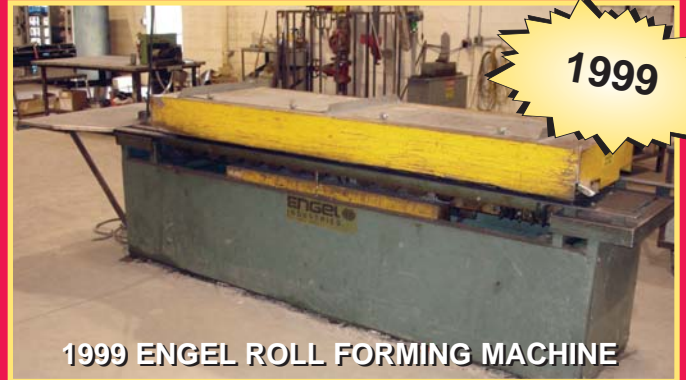
1999 ENGEL ROLL FORMING MACHINE