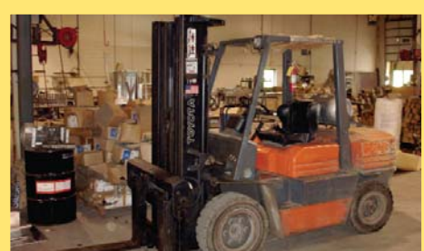
TOYOTA 7000 LB FORK LIFT

LG. QTY. OF COMPANY VEHICLES, TRUCKS, CARS, ON-SITE OFFICE/JOB TRAILERS – ADDITIONAL VEHICLES BEING ADDED DAILY