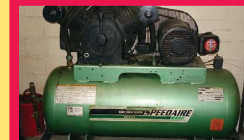
(1 of 2) SPEEDAIRE 25 HP AIR COMPRESSORS