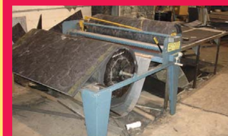
DURO DYNE LINE SIZER