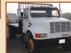
1990 INTERNATIONAL STAKE BED TRUCK