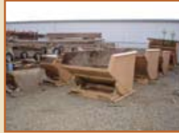
VARIOUS DUMP HOPPERS