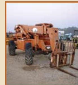
1997 LULL HIGHLANDER MODEL 844C-42

Preview Inspection: Wednesday, September 5th 9:00 A.M. - 5:00 P.M.