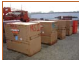
KNAACK GANG BOXES