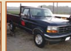
1995 FORD F250 POWER STROKE DIESEL PICK-UP TRUCK