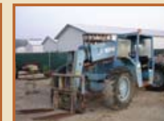
1991 GRADALL 534C-6 ALL TERRIAN MATERIAL HANDLER