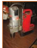
MILWAUKEE MAGNETIC BUSS DRILL