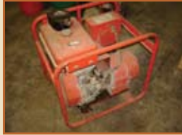
MULTI-QUIP 5.5KW GENERATOR