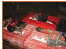
HILTI HAMMER DRILLS