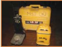
LASER ALIGNMENT LB-10 LASER