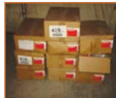
(NEW) HILTI CONCRETE ANCHORS