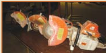
VARIOUS STIHL CHOP SAWS