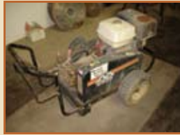
MTM POWER WASHER