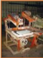
VARIOUS CONCRETE SAWS