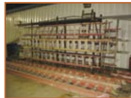
20' & 40' EXTENSION LADDERS

1999 TRAILBOSS Heavy Duty Tandem Axle Trailer, 10 Ton Capacity (Speced Out For 12-Ton), Air Brakes & Adjustable Ramps, 25' Length, Wood Deck