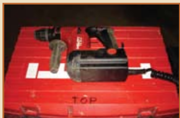
HILTI TE-6-A CORDLESS HAMMER DRILL

US 30 East Crossing Into Ohio – Follow To I 75 South – I 75 South To Exit 78 (County Road 25A) Turn Left and Follow To Fox Drive (1.4 Mi.) 353 Fox Drive Piqua, Ohio 45356. Follow Auction Signs!