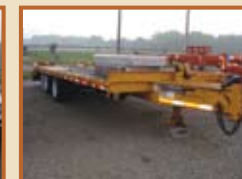
1999 10-TON TRAILBOSS TRAILER

Live Internet Bidding BidSpotter.com ® www.bidspotter.com to register