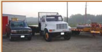
VARIOUS ROLLING STOCK

FIRST CLASS MAIL U.S. POSTAGE PAID Fort Wayne, IN PERMIT #1420