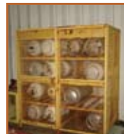
LP STORAGE CAGE