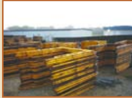
(OVER 300) SECTIONS OF BILJAX SCAFFOLDING