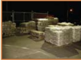
LG. QTY. OF VARIOUS BAGGED INVENTORY