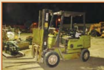
CLARK 4,000 LB FORK LIFT