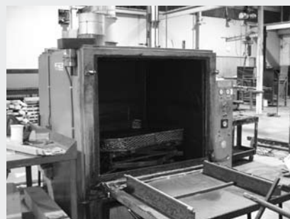
ROTO JET SPRAY WASHER

Live Internet Bidding BidSpotter.com® www.bidspotter.com to register