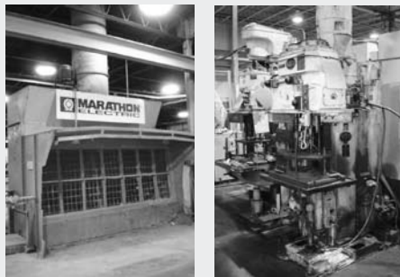
LEFT: (1 OF 2) BINKS PAINT BOOTHS RIGHT: (2) NATCO MULTI-SPINDLE DRILLING MACHINES