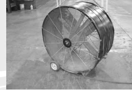
LG. QTY. OF VARIOUS FANS