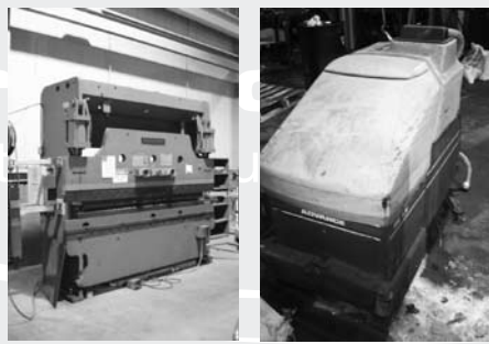
LEFT: CINCINNATI PRESS BRAKE RIGHT: ADVANCE FLOOR SCRUBBER