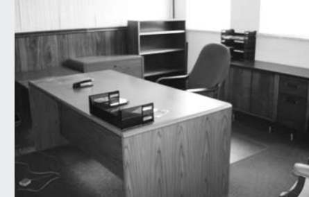
LG. QTY OF VARIOUS OFFICE