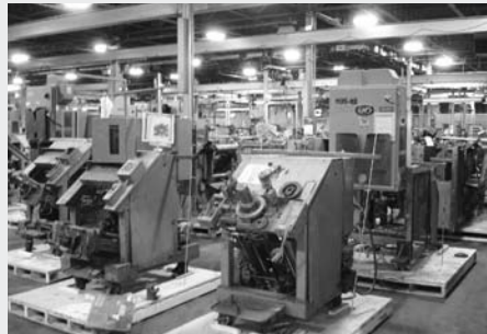
VARIOUS WINDING EQUIPMENT