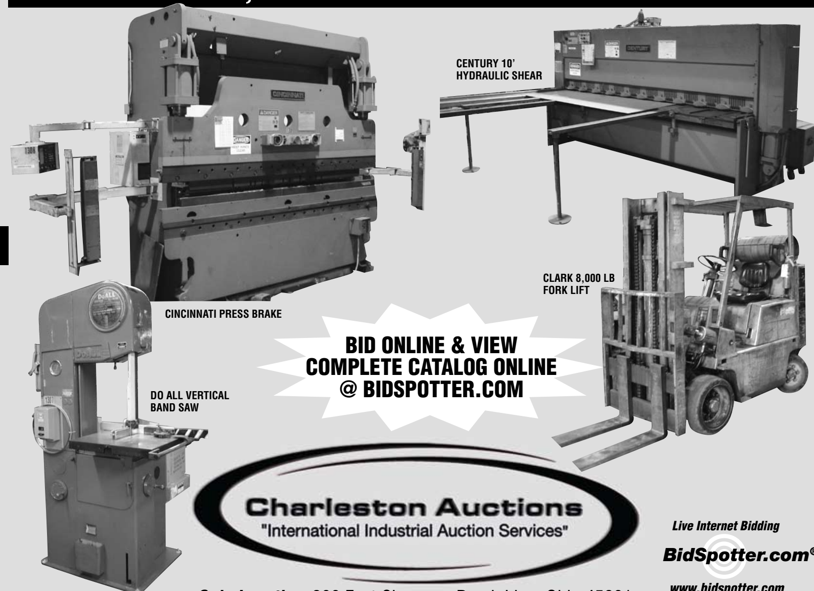
CINCINNATI PRESS BRAKE

STOCK BUILDING SUPPLY - Lansing, Michigan Sale Date & Time: Saturday, September 29th, 2007 10:00 a.m. (Local Time) CONNOR CORPORATION - Fort Wayne, Indiana Sale Date & Time: Wednesday, October 3rd, 2007 10:00 a.m. (Local Time) GE COMPANY - Bridgeport, Connecticut Sale Date & Time: Wednesday, October 11th, 2007 10:00 a.m. (Local Time)