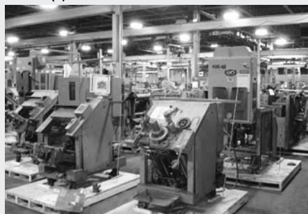
VARIOUS WINDING EQUIPMENT