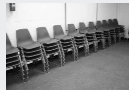
OVER (50) STACKED CHAIRS