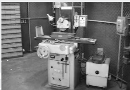
K.O. LEE SURFACE GRINDER