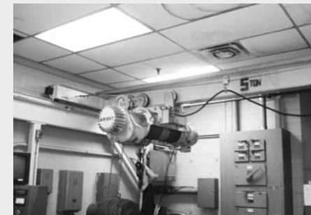
WRIGHT 5-TON CABLE HOIST