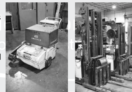
RIGHT: TENNANT FLOOR SWEEPER LEFT: VARIOUS MATERIAL HANDLING EQUIPMENT