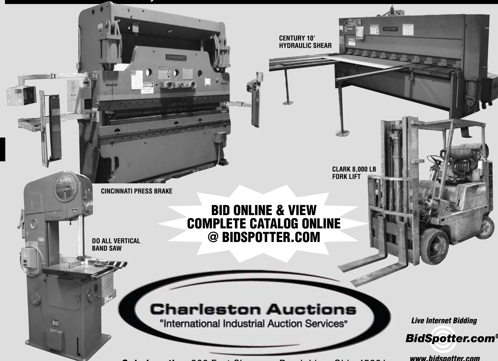
CINCINNATI PRESS BRAKE

View complete on-line catalog at www.charlestonauctions.com . Watch for additional items to be added daily.