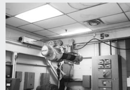
WRIGHT 5-TON CABLE HOIST