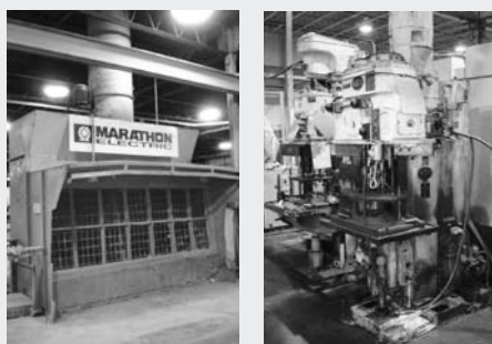
LEFT: (1 OF 2) BINKS PAINT BOOTHS RIGHT: (2) NATCO MULTI-SPINDLE DRILLING MACHINES