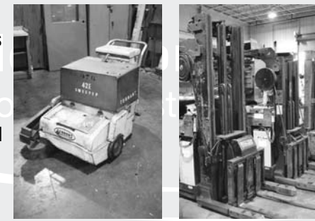
RIGHT: TENNANT FLOOR SWEEPER LEFT: VARIOUS MATERIAL HANDLING EQUIPMENT