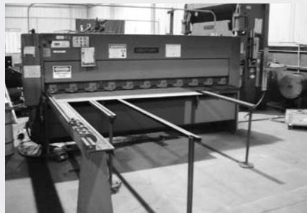
CENTURY 10' HYDRAULIC SHEAR