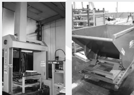
LEFT: BOICE COORDINATE MEASURING MACHINE RIGHT: LG. QTY. OF VARIOUS DUMP HOPPERS