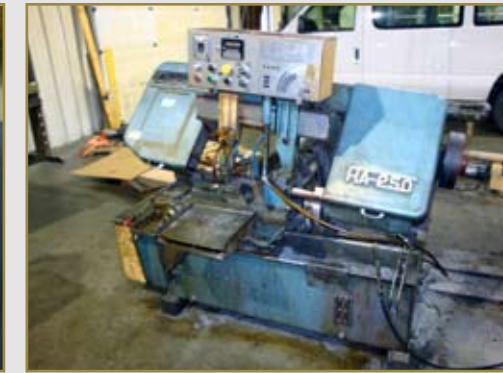
1984 AMADA HA-250 AUTOMATIC BAND SAW