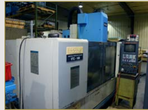
(1 OF 3) MAZAK VTC-16B CNC MACHINING CENTERS

ONLINE ONLY! Live Internet Bidding BidSpotter.com® www.bidspotter.com to register