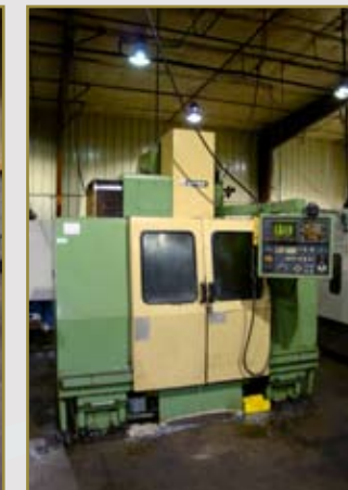
MORI SEIKI MV40 VERTICAL MACHINING CENTER