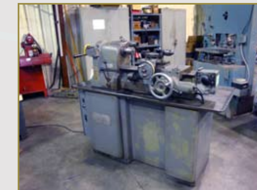
HARDINGE SECOND OPERATION LATHE