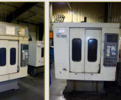
(1 OF 2) BROTHER TC-323 CNC DRILL TAPPING MACHINES

ONLINE ONLY! Live Internet Bidding BidSpotter.com® www.bidspotter.com to register