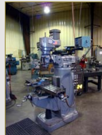
(1 OF 2) BRIDGEPORT VERTICAL MILLING MACHINES