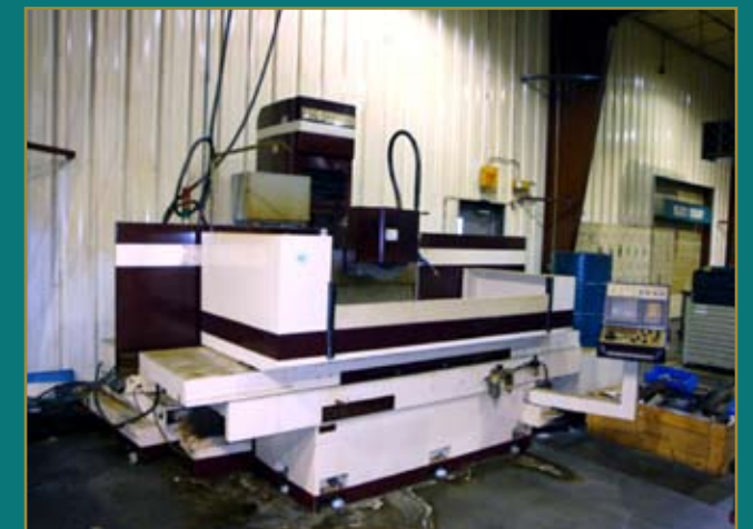
2001 CHEVALIER CNC GRINDER