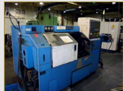
1990 MAZAK QT 15 CNC LATHE

THINKING OF HAVING AN AUCTION? Call a Charleston Representative Today to Schedule a Confidential Meeting.