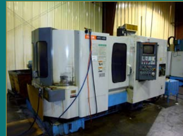
1996 MAZAK HTC-500 CNC MACHINING CENTER

8201 North State Road 9 • Alexandria, IN 46001