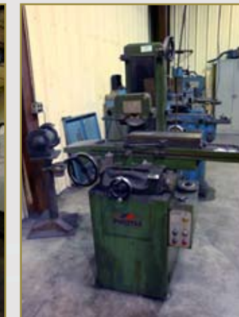
PROTH HAND FEED SURFACE GRINDER

THINKING OF HAVING AN AUCTION? Call a Charleston Representative Today to Schedule a Confidential Meeting.