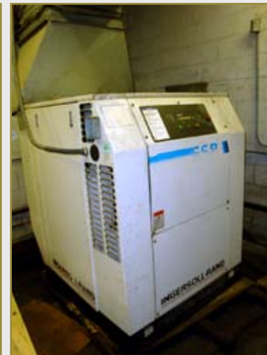
INGERSOL RAND 40HP AIR COMPRESSOR