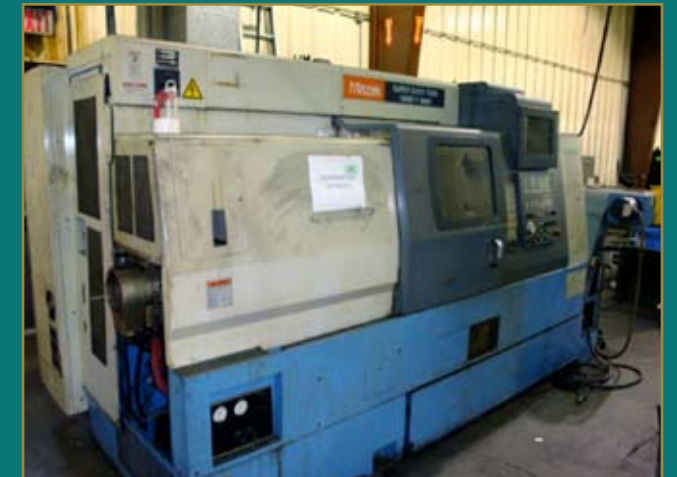
1997 MAZAK SQT 18 MSY MARK II CNC LATHE