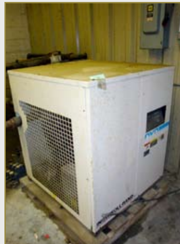
1994 INGERSOL RAND AIR DRYER