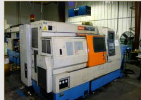
1996 MAZAK SUPER QT 15 MY II LATHE