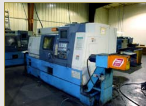
(1 OF 2) MAZAK SQT CNC LATHES