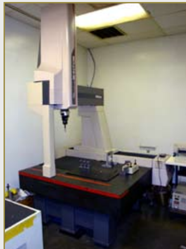
1993 MITUTOYO CMM