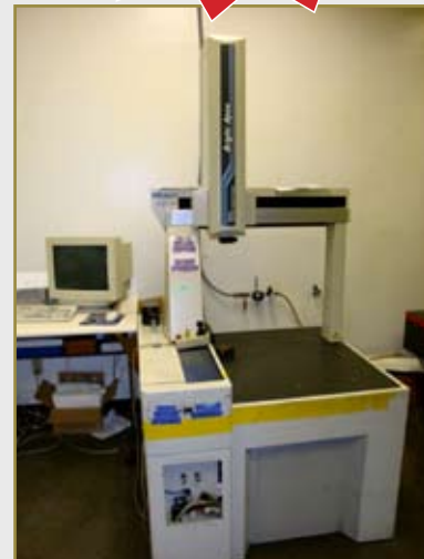
(1 of 2) 1998 MITUTOYO CMM