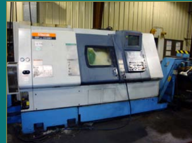
1998 MAZAK SQT 250 MY CNC LATHE