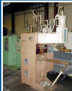
PEER SPOT WELDER