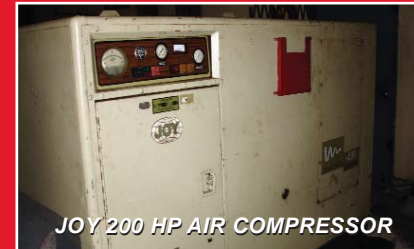
JOY 200 HP AIR COMPRESSOR

Charleston Auctions "International Industrial Auction Services"