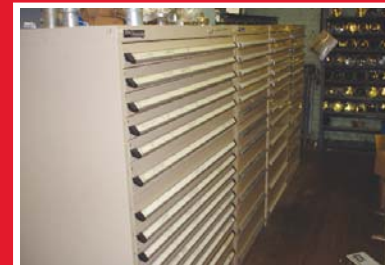
KENNEDY PARTS CABINETS