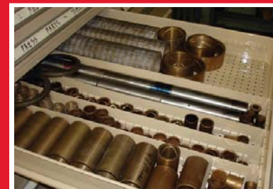
LG QTY OF BRASS AND COPPER FITTINGS AND HARDWARE