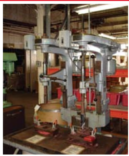
ALLEN 2-HEAD DRILL PRESS