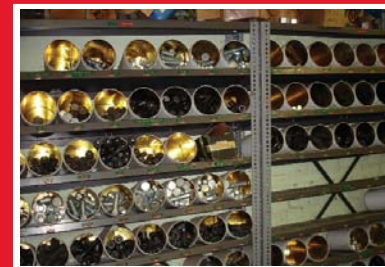
LG QTY OF VARIOUS HARDWARE