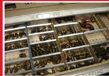
LG QTY OF VARIOUS BRASS FITTINGS