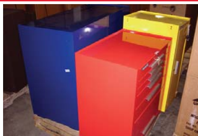
HUGE QTY OF NEW AND USED KENNEDY TOOL BOXES