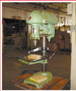
DELTA DRILL PRESS