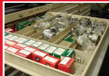
LG QTY OF BEARINGS