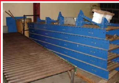
LQ QTY OF VARIOUS CONVEYORS

Complete Parts Crib, Contents Include: Hardware, Belts, PVC, Plumbing, Electrical, Bearings, Brass & Copper Fittings, Regulators & Parts, Valves, Light Bulbs & Ballasts, Pulleys & Gears, Pneumatic Cylinders, Timers, Chain & Links, Pumps & Parts, Fuses, Key Way Blanks, Anchors, (12) KENNEDY Parts Cabinets To Be Sold Separately