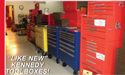
"LIKE NEW" KENNEDY TOOLBOXES!