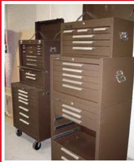
ROLL AROUND KENNEDY TOOLBOXES