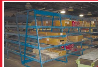
1 OF 3 KINGWAY ORDER SELECTION SYSTEMS