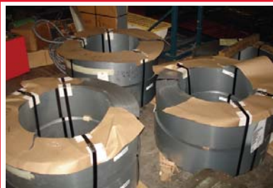
HUGE QTY. OF RAW MATERIAL