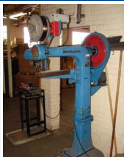
IDEAL BOX STITCHER