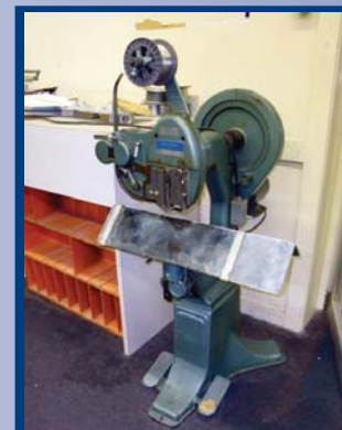
INTERLAKE STITCHING MACHINE