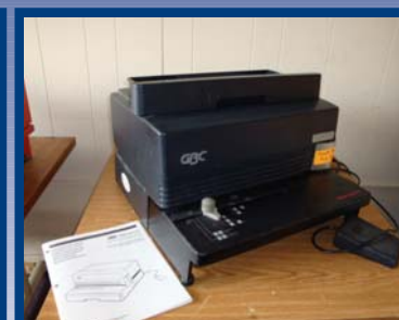
GBC HIGH CAPACITY PUNCH MACHINE