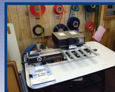
SCOTT PLASTIC INDEX TAB MACHINE