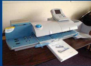
PITNEY BOWES DIGITAL MAILING SYSTEM