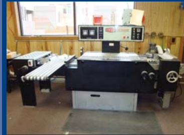
SCOTT TEN THOUSAND SERIES AUTO. TAB MACHINE