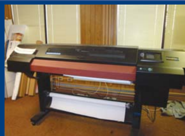
COLORSPAN DISPLAY MAKER