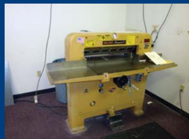
CHALLENGE "CHAMPION" PAPER CUTTER