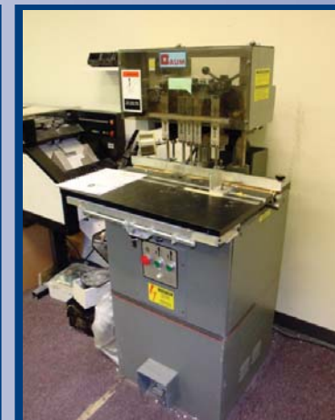
BAUM 5-SPINDLE DRILL