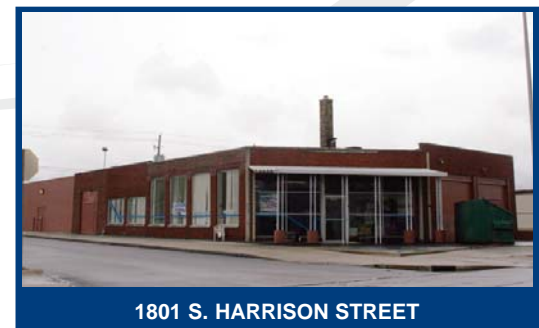
1801 S. HARRISON STREET