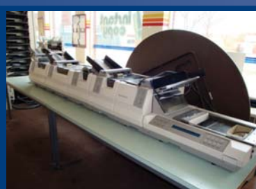
PITNEY BOWES 3 STATION ENVELOPE STUFFER