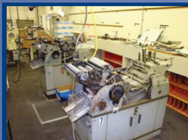
(2) AM MULTILITH OFFSET PRESSES