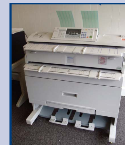
GESTETNER NETWORKABLE A045 ENGINEERING PRINTER