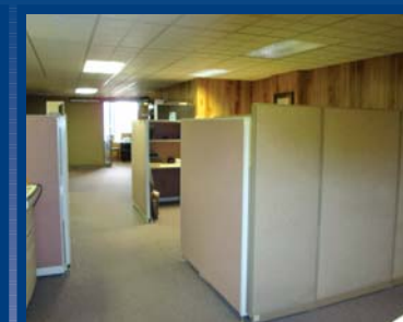
STEELCASE OFFICE PARTITIONS