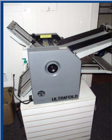
BAUM ULTRAFOLD AIR FEED FOLDER