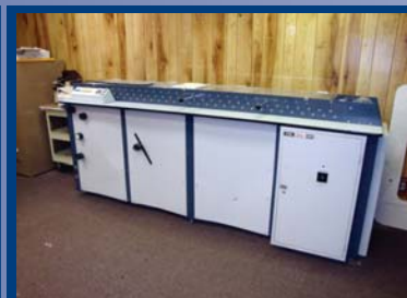
AB DICK COLLATOR