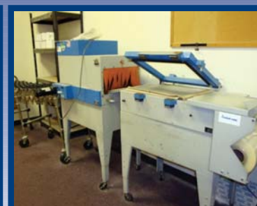
APS SHRINK WRAP SYSTEM