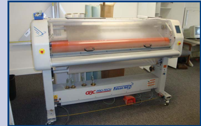
GBC PROTECH FALCON 160 LAMINATOR