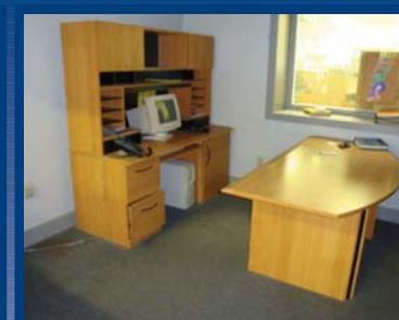
LG. QTY. OF OFFICE EQUIP & FURNISHINGS.