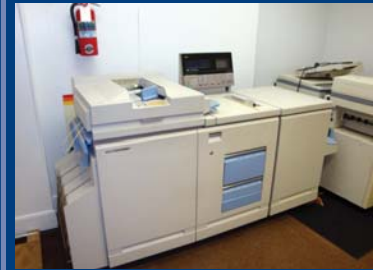
XEROX 1090 MARATHON COPIER