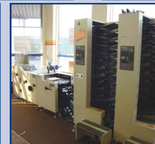
DUPLO COLLATOR COMPLETE SYSTEM W/ (2)-10 TOWERS