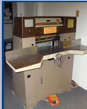
CHALLENGE 19" PAPER CUTTER