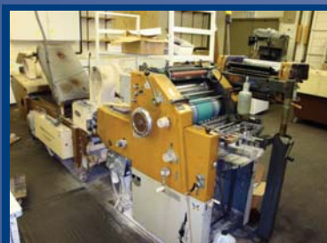
(1 OF 6) ITEK 960 OFFSET PRESSES