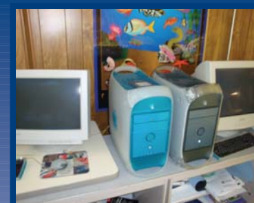
(2 OF 6) APPLE COMPUTERS