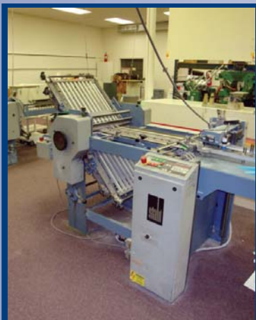
STAHL FOLDING MACHINE W/ RIGHT ANGLE ATTACHMENT