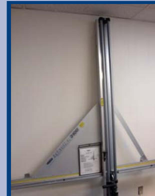
FLETCHER CUTTING MACHINE