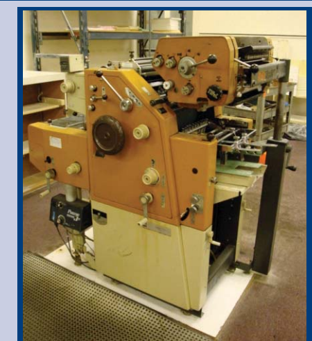
(1 OF 6) ITEK OFFSET PRESSES

Preview Inspection: Wednesday, December 10th • 9:00 A.M. - 5:00 P.M.