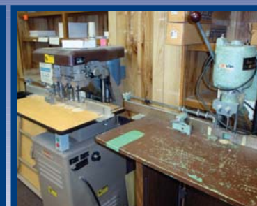
(2) CHALLENGE PAPER DRILLS