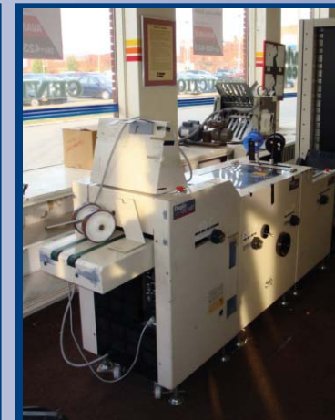
DUPLO DC-48F BOOKLET COLLATOR