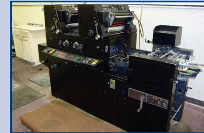
AB DICK 3985 2-COLOR OFFSET PRESS

THURSDAY, DECEMBER 11th • 10:00 A.M. (Local Time)