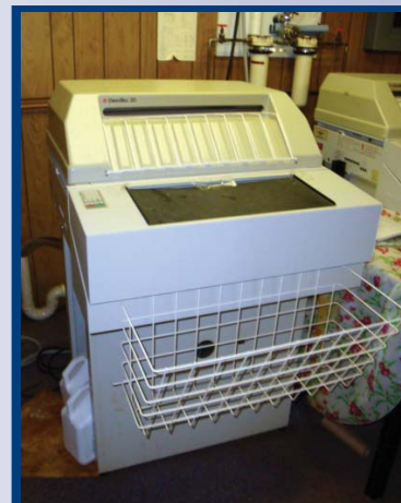
(1 OF 2) DEVOTER 20 FILM PROCESSORS