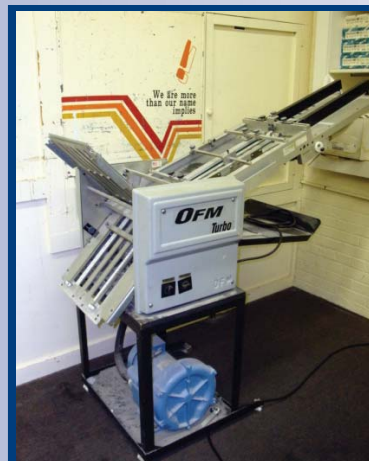
(1 OF 2) OFM TURBO FOLDING MACHINES