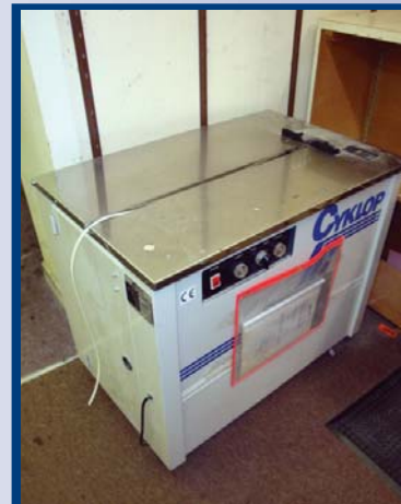
CYKLOP SEMI AUTOMATIC STRAPPING MACHINE