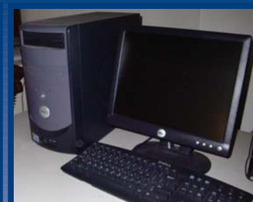
LG. QTY. OF DELL & COMPAQ COMPUTERS