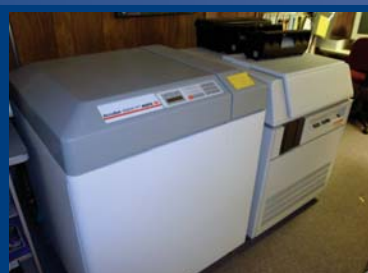
(1 OF 2) AGFA ACCUSET 1000WPLUS IMAGE CENTERS