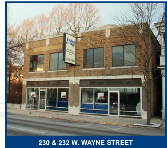
230 & 232 W. WAYNE STREET

Building #3—1801 S. Harrison Street Total Area SF: 6,374 sq. ft Year Built: 1900 Foundation: ¼ basement Construction Type: Brick HVAC: Gas forced air with central cooling Electrical: 800 amps, 120-208 volts, 3 phase Acreage: <.5 acre Zoning: IN-1