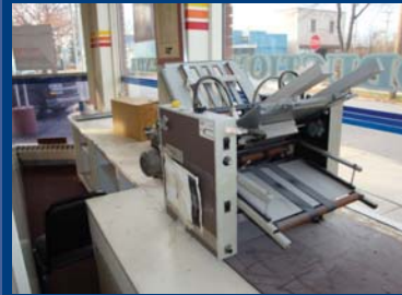
PRO-FOLD VACUUM FEED FOLDER