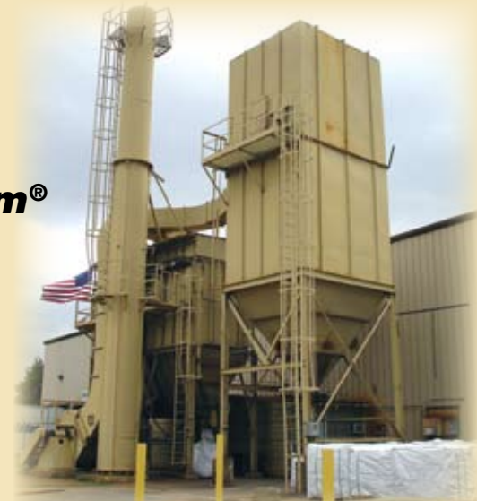
(1 OF 4) COMPLETE DUST COLLECTION SYSTEMS

Live Internet Bidding BidSpotter.com ® www.bidspotter.com to register