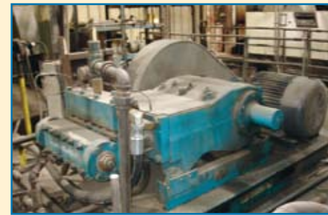
BUTTERSWORTH HIGH PRESSURE PUMP UNIT