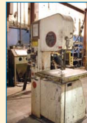
DoALL VERTICAL BAND SAW