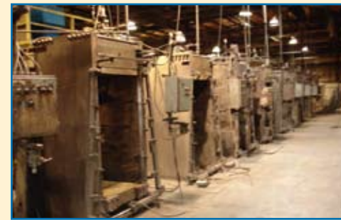
(12) 1997 AMW SLAB SIDE PRESSES