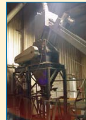
BUFFALO 40 HP HAMMER MILL