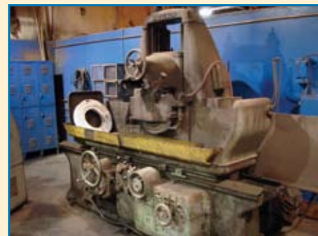
MATTISON SURFACE GRINDER