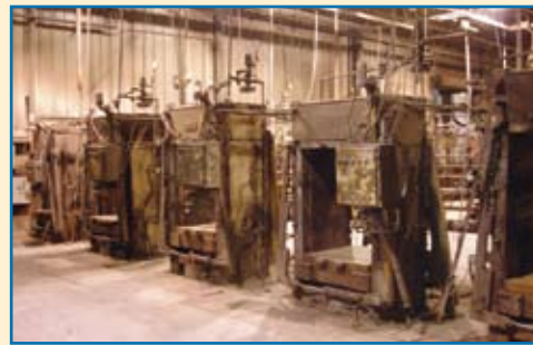
(13) FRENCH SLAB SIDE PRESSES

HAVE SOME ITEMS TO SELL?? Charleston Auctions is now offering a FREE on-line marketplace. Visit www.charlestonauctions.com or call (local) 260-373-0850 or (Toll Free) 877-301-9344 for more details!