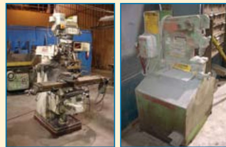
LH PIC: (1 OF 2) ALLIANT VERTICAL KNEE MILL RH PIC: IRONWORKER

Lg. Qty. Of Various Office & Shop Furniture (I.E. Desks, Stools, File Cabinets, Computers, Printers, Tables, Coat Trees, Artwork, Etc.)