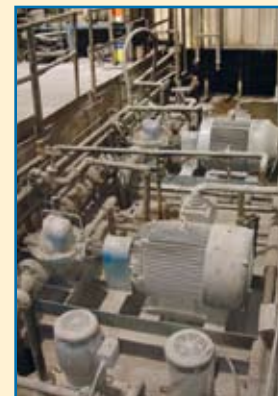
COMPLETE LOW PRESSURE PUMP SYSTEM