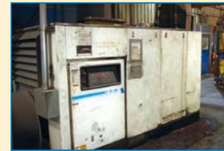
INGERSOLL RAND 200 HP AIR COMPRESSOR