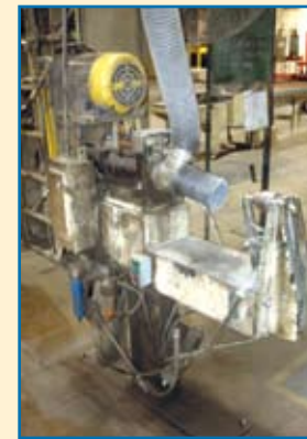
(1 OF 2) HIGHSPEED HORIZONTAL DRILL(S)