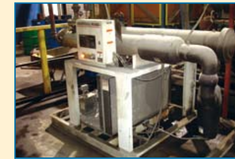
INGERSOLL RAND AIR DRYING SYSTEM