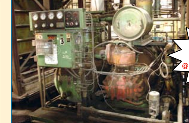
SULLAIR 200 AIR COMPRESSOR