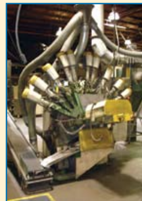
1996 ERLMAN RADIAL DRILL