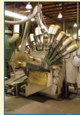
1996 ERLMAN 10 HEAD RADIAL DRILL