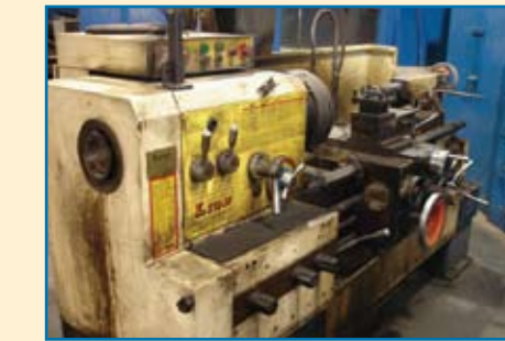
2001 LION LATHE