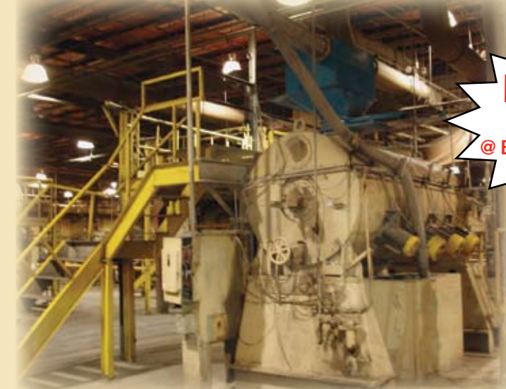
(1 OF 4) LITTLEFORD BROTHERS MIXER(S)