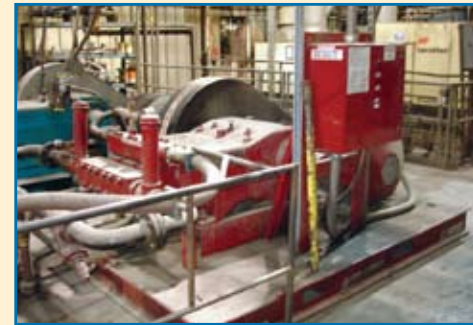
GARDNER DENVER HIGH PRESSURE PUMP UNIT