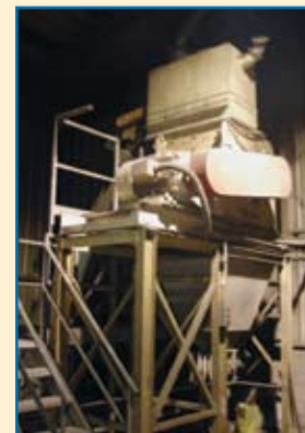
BUFFALO 100 HP HAMMER MILL