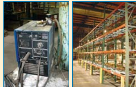
LH PIC: MILLER WELDER RH PIC: (OVER 50) SECTIONS OF VARIOUS PALLET RACKING