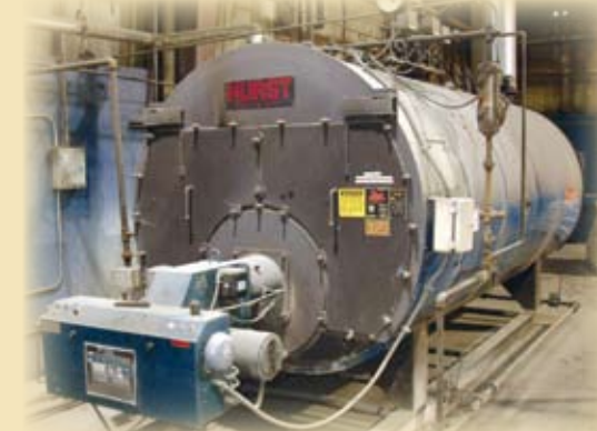
2000 HURST GAS FIRED BOILER