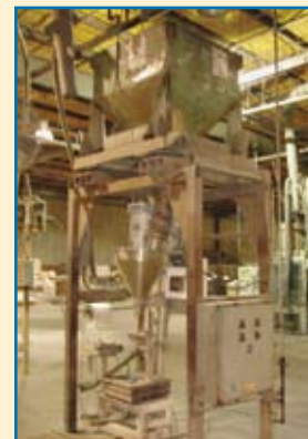
MATEER PNEUMATIC PRE-FORM SCALE BAGGER