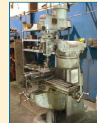
BRIDGEPORT VERTICAL KNEE MILL