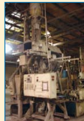
(1 OF 5) 1995 CORESTEEL 150 TON HYDRAULIC PRESSE(S)