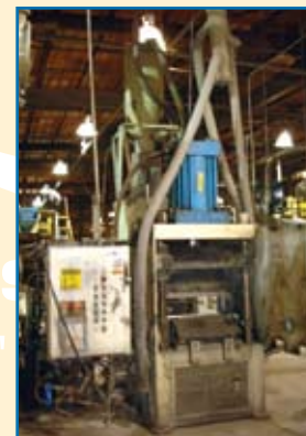
(1 OF 6) ALTECH 180 TON PRESSE(S)