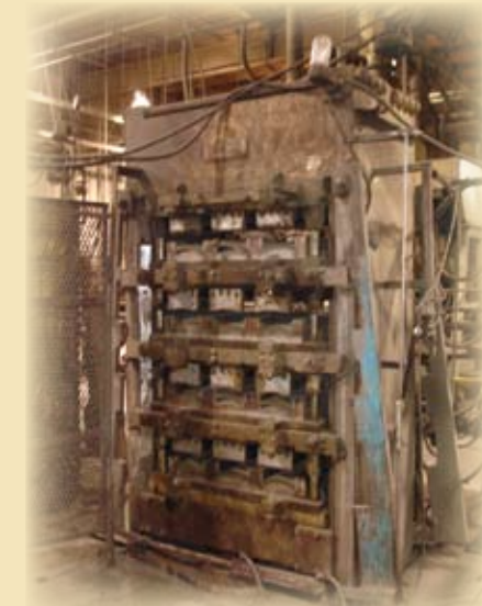
(1 OF 36) FRENCH, AMW, CORESTEEL AND ALTECH PRESSE(S)

WEDNESDAY, APRIL 30 th • BEGINNING AT 10:00 A.M. LOCAL TIME