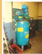
KELLOGG 5 HP AIR COMPRESSOR