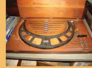
LARGE QTY OF INSPECTION EQUIPMENT