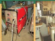
LINCOLN MIG WELDER