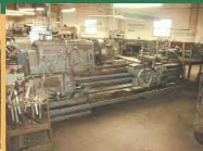
MONARCH ENGINE LATHE