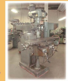
1 of 4 LAGUN VERTICLE MACHINES