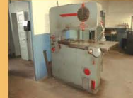
DOALL V36 VERTICAL BANDSAW