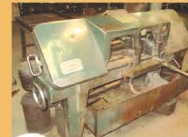
KALAMAZOO HORIZONTAL BAND SAW