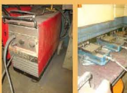
LINCOLN WIRE 250 WIRE WELDER