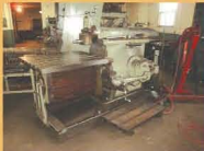
CINCINNATI 36" HD SHAPER