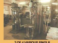
2 OF 4 VARIOUS SINGLE SPINDLE DRILLING MACHINES