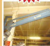
1 of 2 JIB CRANES WITH HOISTS