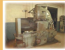
BLANCHARD NO. 18 36 INCH ROTARY SURFACE GRINDER

THURSDAY, FEB. 25th BEGINNING @ 10:00 A.M. LOCAL TIME