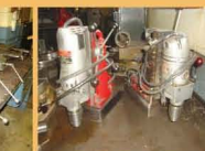
LG QTY OF VARIOUS MACHINE TOOLING