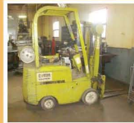
CLARK 3,000 LB LP FORK TRUCK