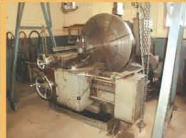
STAR - T- LATHE