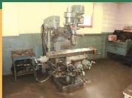
TREE DUPLICATOR MILL