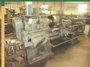
HENDEY 18X54 ENGINE LATHE