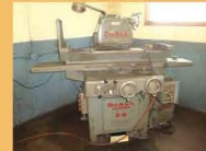
DO ALL D8 HYDRAULIC SURFACE GRINDER