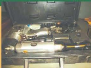
VARIOUS AIR TOOLS