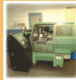
1997 AMERICAN EAGLE CNC LATHE