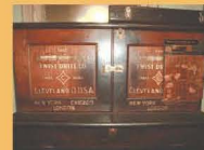
ANTIQUE DRILL CABINET