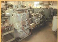
1 of 2 MONARCH ENGINE LATHES