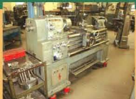
SHARP GAP BED LATHE

SALE: THURSDAY, FEB. 25th BEGINNING @ 10:00 A.M. LOCAL TIME