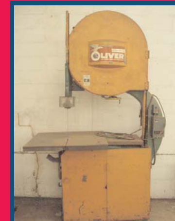
OLIVER VERTICAL WOOD CUTTING BAND SAW

BINKS Paint Booth, Drive-In, Drive-Out Paint Booth w/Oven with Side Draft, Outside Dimensions = 15' x 51', Inside Dimensions = 12' x 49', Power Distribution for the Paint Booth Heater: Manufacturer = INFRATECH, Model ACBP200M, 240 Volt, S/N 298 HUSSMAN Walk-In Cooler w/Compressor, 17,500 Cu. Ft., Outside Dimensions = 36' x 54', Inside Dimensions = 32' x 51' 1987 SAMUEL Strapping Machine, Model TZ923SUP, 110 Volt, 60 HZ BINDER Oven, Model 181153000202, 230 Degrees C, Single Phase, S/N 981140