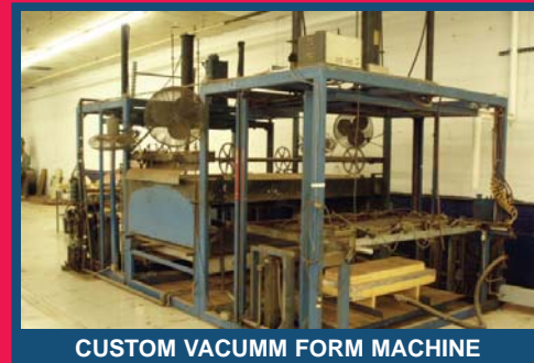
CUSTOM VACUUM FORM MACHINE