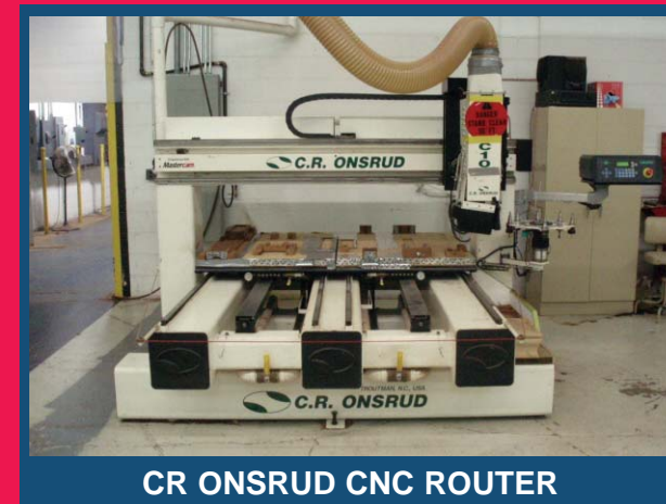
CR ONSRUD CNC ROUTER