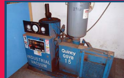
QUINCY VACUUM PUMP