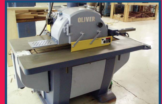
2004 OLIVER STRAIGHT LINE RIP SAW