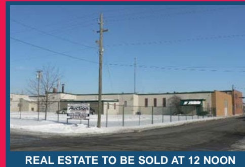
REAL ESTATE TO BE SOLD AT 12 NOON