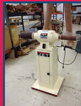
JET 10 INCH BUFFER-SANDER