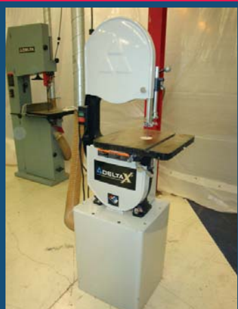
DELTA X5 VERTICAL BAND SAW