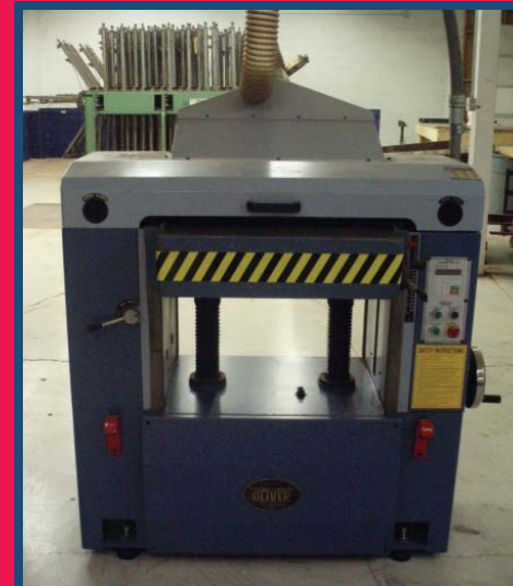
2004 OLIVER PLANNER

TUESDAY, MARCH 3rd • 12:00 Noon (Local Time)