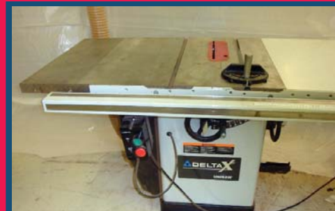
DELTA 5X TABLE SAW