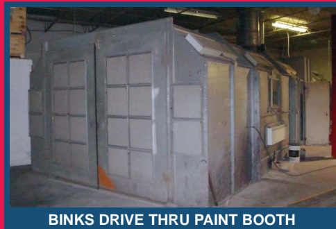
BINKS DRIVE THRU PAINT BOOTH