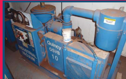
1 OF 2 QUINCY VACUUM PUMPS