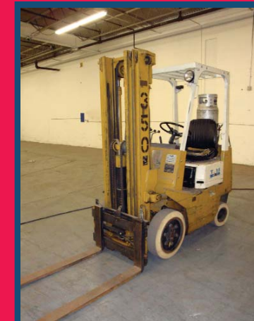
TCM LP FORK LIFT