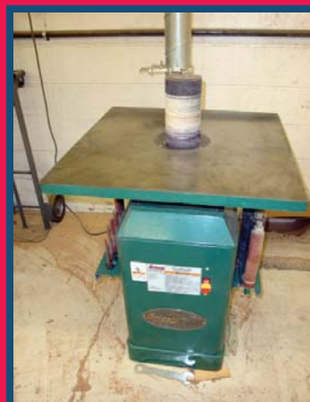
GRIZZLY OSCILLATING SPINDLE SANDER