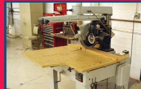
DELTA RADIAL ARM SAW