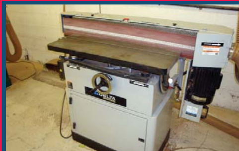
DELTA OSCILLATING EDGE SANDER