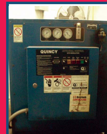
QUINCY AIR COMPRESSOR