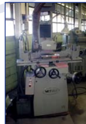
(1 of 2) MITSUI HANDFEED SURFACE GRINDERS