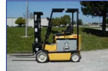
(1 of 4) LATE MODEL ELECTRIC FORK LIFTS

1995 ROMI BRIDGEPORT CNC Lathe, Model 'EZ Path', w/BRIDGEPORT EZ Path Controls, 9"/18" Center Height, DBC = 40", 2" Spindle Hole, S/N 6-92-078871-325 CLAUSING COLCHESTER 21" Gap Bed Lathe, 3 1/2" Spindle Hole, Metric & Standard, S/N 8/0225/06818DD