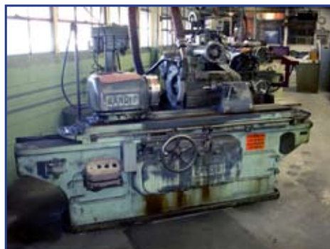
LANDIS UNIVERSAL GRINDER