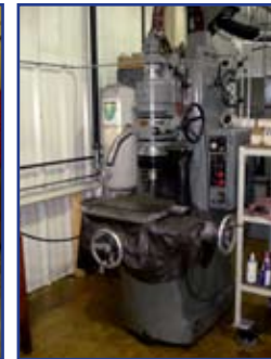
MOORE #2 JIG GRINDER