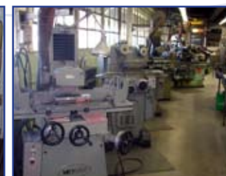
L.G. QTY. OF SURFACE GRINDERS

Live Internet Bidding BidSpotter.com ® www.bidspotter.com to register