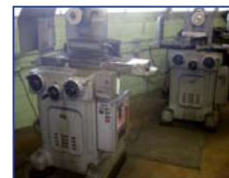
(2) TAFT-PIERCE SURFACE GRINDERS

Lg. Qty. Of Quality Office Equipment (I.E. Desk, Workstations, File Cabinets, Tracing Cabinets, Conference Rooms, Office Partitions, Executive Furniture, Safe, Credenzas, Chairs, Bookshelves, Artwork & Decorations)