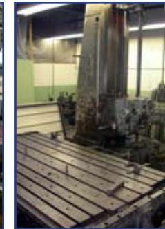
G&I 4" BORING MILL