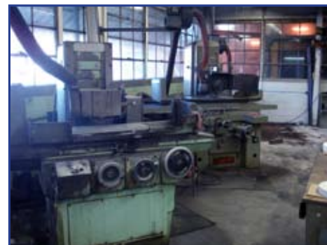
VARIOUS SURFACE GRINDERS