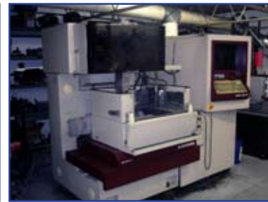
HITACHI ELECTRICAL DISCHARGE MACHINE