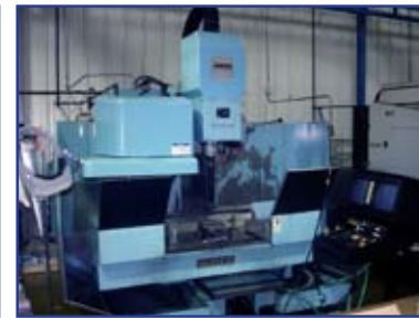
(1 of 2) HURCO CNC VERTICAL MACHINING CENTER(S)