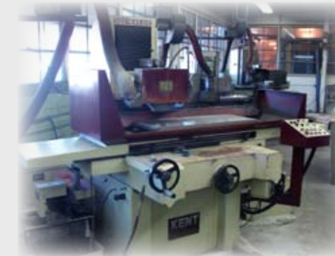
KENT 1640 HYDRAULIC SURFACE GRINDER