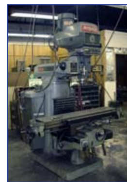
BRIDGEPORT CNC VERTICAL MILLING MACHINE