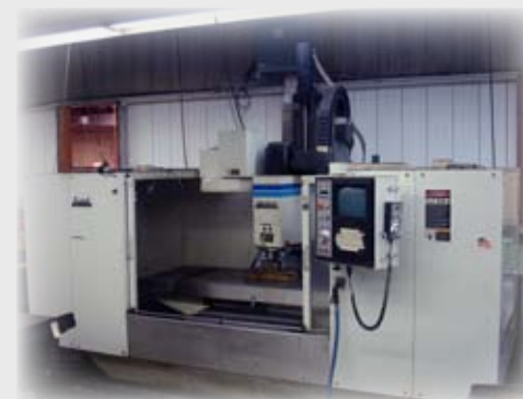
FADAL 6030 CNC MACHINING CENTER