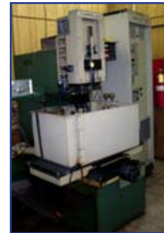
CHARMILLES RAM TYPE EDM