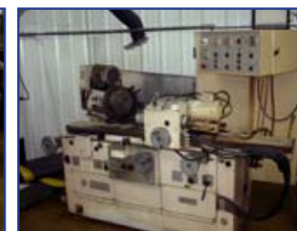
VOUMARD I.D. GRINDER