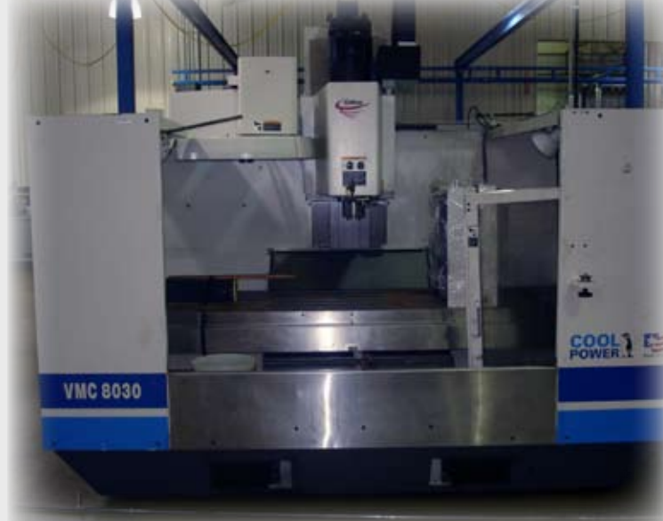
FADAL 8030 CNC MACHINING CENTER

THURSDAY, NOVEMBER 20 th • BEGINNING AT 10:00 A.M. LOCAL TIME