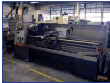
CLAUSING COLCHESTER 21" LATHE