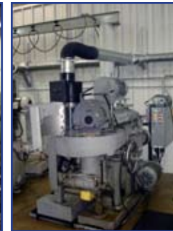
ARTER ROTARY SURFACE GRINDER