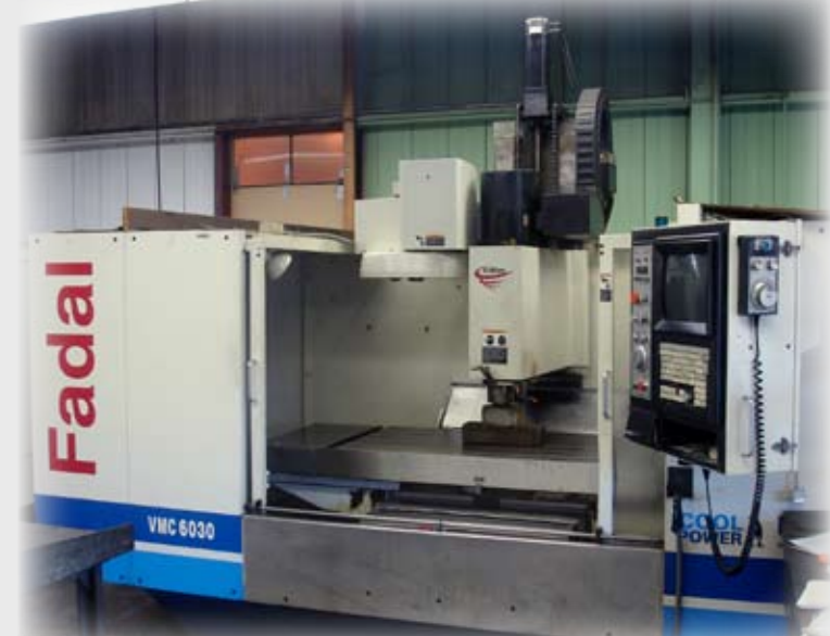
2000 FADAL 6030 CNC MACHINING CENTER