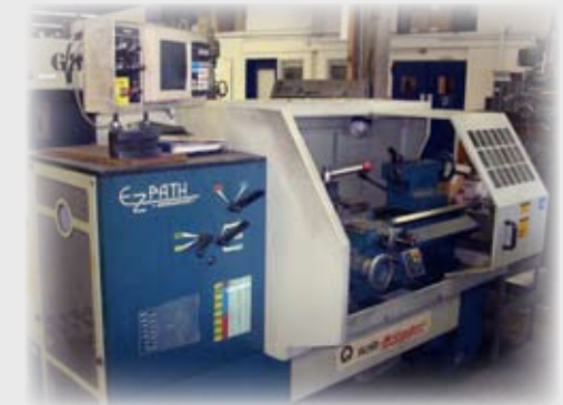
ROMI BRIDGEPORT CNC LATHE