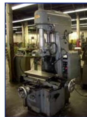
MOORE JIG GRINDER