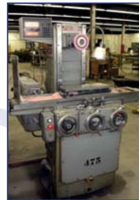
BROWN & SHARPE SURFACE GRINDER