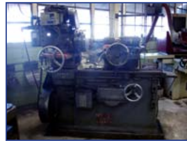
HEALD HORIZONTAL GRINDER