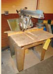
RIGHT PIC: DEWALT RADIAL ARM SAW