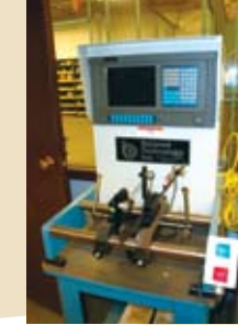
LEFT PIC: BALANCE TECHNOLOGY BALANCER