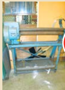
PEXTO 4" MANUAL ROLLS