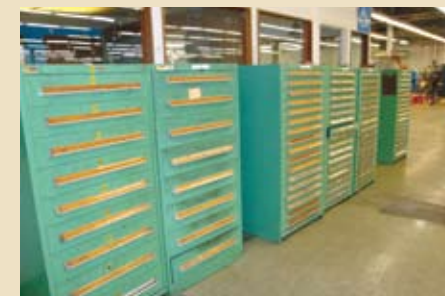
(OVER 20) STANLEY VIDMAR STORAGE CABINETS