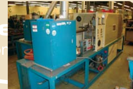
(1 OF 2) CM 4 BORE ANNEAL FURNACES