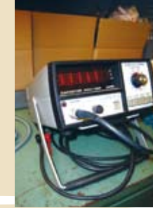
RIGHT PIC: SENCOR CAPACITOR ANALYZER