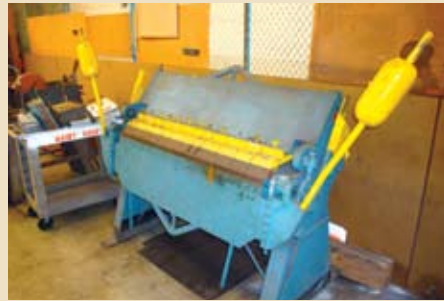
CHICAGO 4" FINGER BRAKE