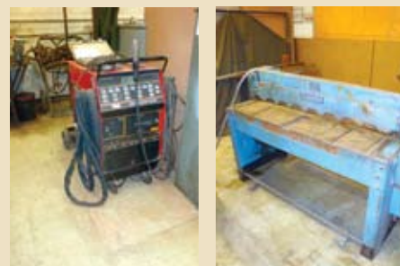
LEFT PIC: LINCLON SQUAREWAVE TIG 225 TIG WELDER

NICKLESHIELD Electric Water Heater, Model 72-N-200-A-E, 200 Ga. Capacity, 3-Phase, S/N 78144820