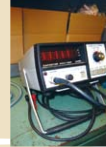
RIGHT PIC: SENCOR CAPACITOR ANALYZER