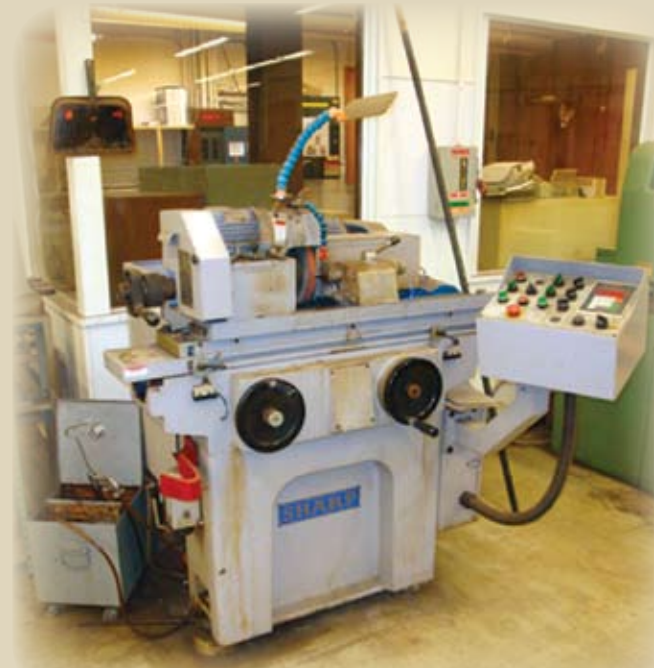
2000 SHARP O.D. GRINDER

SUPER 8 (2.9 Miles from GE Plant) (330) 793-7788 BEST WESTERN (3.1 Miles from GE Plant) (330) 544-2378 SLEEP INN (3.1 Miles from GE Plant) (330) 544-5555 FAIRFIELD INN (3.0 Miles from GE Plant) (330) 505-2173 COMFORT INN (3.1 Miles from GE Plant) (330) 792-9740