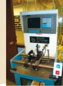
LEFT PIC: BALANCE TECHNOLOGY BALANCER