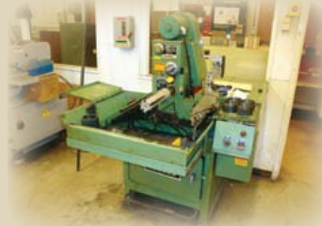
SUNNEN PRECISION HONE