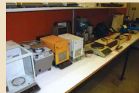
VARIOUS LAB SCALES & INSPECTION

Visit our website for a complete on-line catalog: www.charlestonauctions.com