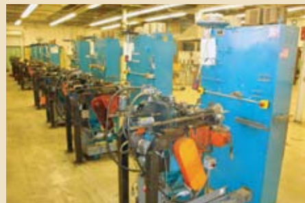
(8) COIL WINDING MACHINES

1976 INGERSOLL RAND 200 HP Air Compressor, Model XLE, Size = 14 1/2 x 9 x 7, RPM = 705, Discharge Pressure = 100 PSI, S/N JN-6345