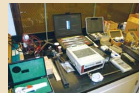
HUGE QTY. OF INSPECTION EQUIPMENT