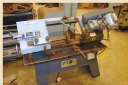
WILTON HORIZONTAL BAND SAW