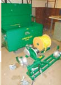
RIGHT PIC: GREENLEE 670 CABLE PULLING SYSTEM