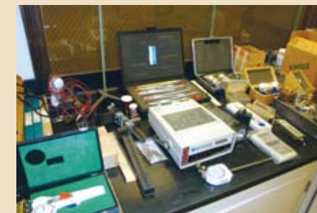
HUGE QTY. OF INSPECTION EQUIPMENT