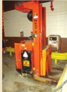
LEFT PIC: (1 OF 2) RAYMOND ELECTRIC STANDUP PICKER TRUCKS