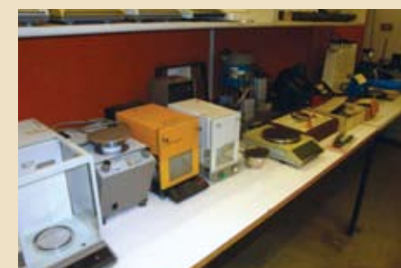
VARIOUS LAB SCALES & INSPECTION

Visit our website for a complete on-line catalog: www.charlestonauctions.com