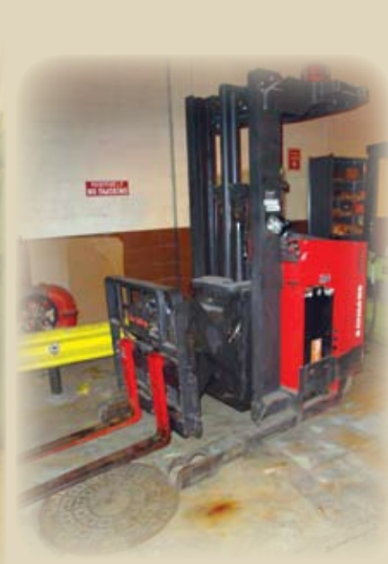
RAYMOND ELECTRIC STANDUP PICKER TRUCK