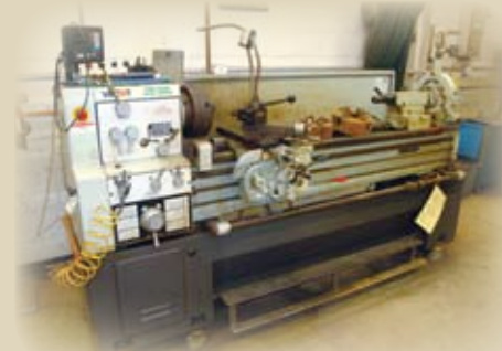
VICTOR HIGH SPEED PRECISION LATHE