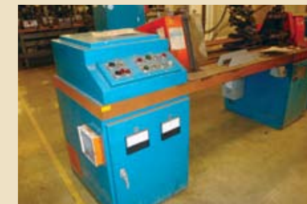
EXONIC SYSTEMS COIL LATHE