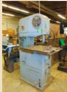
LEFT PIC: DO ALL VERTICAL 16" BAND SAW