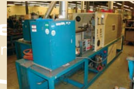
(1 OF 2) CM 4 BORE ANNEAL FURNACES