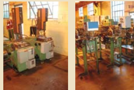
LEFT PIC: (2 OF 4) BRANSON ULTRA SONIC WELDERS RIGHT PIC: (3 OF 4) GE WIRE WINDERS