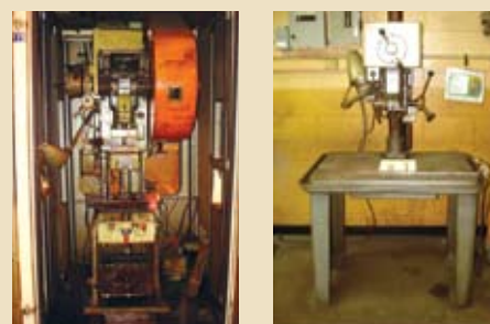
LEFT PIC: NIAGARA OBI PUNCH PRESS RIGHT PIC: ROCKWELL VARIABLE SPEED DRILL PRESS