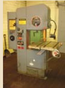
LEFT PIC: (1 OF 2) DOALL 20" VERTICAL BAND SAWS RIGHT PIC: (1 OF 2) HARDINGE 2 ND OPERATION LATHES

THINKING OF HAVING AN AUCTION? CALL TODAY FOR A CONFIDENTIAL MEETING!