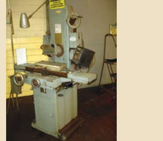
(1 OF 2) PARKER MAJESTIC HAND FEED SURFACE GRINDERS

Huge Qty. Of Banding Carts, Pallet Jacks, Worktables & Benches, Floor Fans, Material Carts, Stands, Trash Cans, Fire Extinguishers, Safety Ladders, Step Ladders, Pan Shelving, Pallet Racking, Parts Totes, Etc.