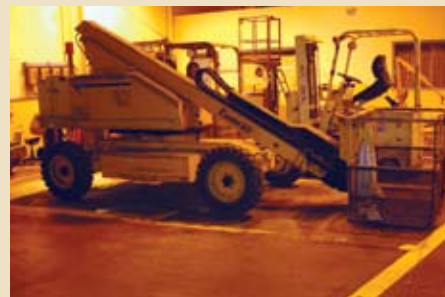
CONDOR ELECTRIC TELESCOPING MAN LIFT