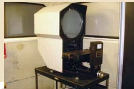
MICRO VU 14" OPTICAL COMPARATOR