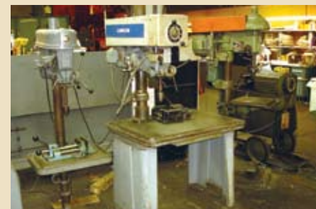
(OVER 10) VARIOUS DRILL PRESSES