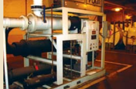
INGERSOLL RAND REFRIGERATED AIR DRYER

BROWN & SHARPE 618 'Micromaster' Grinder, 6" x 18" Electromagnetic Chuck, S/N 523-6181-9364