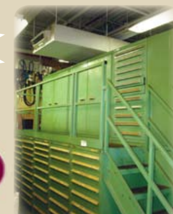
(1 of 3) COMPLETE VIDMAR PARTS CRIB SYSTEM