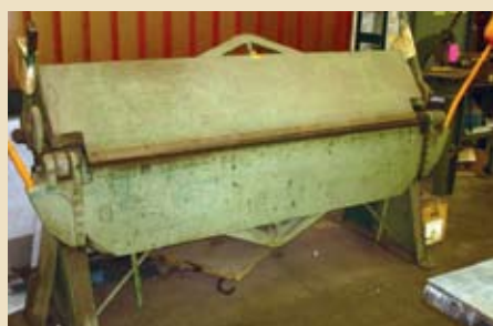
CHICAGO 8' PAN BRAKE