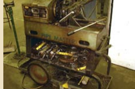
OSTER 655 POWER THREADER

(2) Oxygen/Acetylene Torch Sets, Complete w/Hoses, Guns, Gages – No Tanks