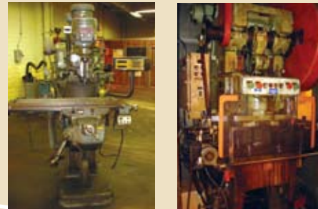
LEFT PIC: BRIDGEPORT 2 HP VERTICAL MILLING MACHINE RIGHT PIC: VARIOUS PRESSES