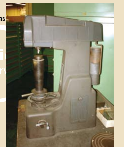
(1 OF 5) ROCKWELL HARDNESS TESTERS

Lg. Qty. Of Office Equipment (I.E. Desks, Dividers, Credenzas, Refrigerators, Folding Tables, Café Seating, Folding Chairs, Mop Buckets, Etc.)