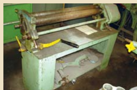
PEXTO MANUAL ROLLS