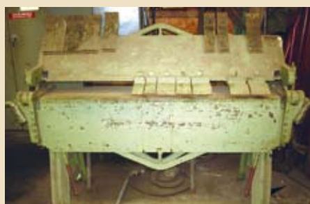
CHICAGO FINGER BRAKE