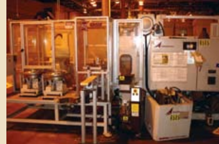
(1 OF 2) MILACRON AUTOJECTORS VERTICAL PLASTIC INJECTION PRESSES

CINCINNATI Shell Washer, Power = 460-3-60, Controls = 115-1-60, Amps = 60, Heat = Natural Gas, S/N D-1223-C165