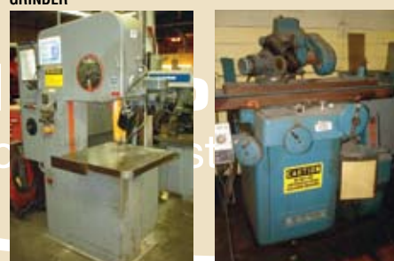
LEFT PIC: DO ALL VERTICAL BAND SAW RIGHT PIC: K.O. LEE TOOL GRINDER