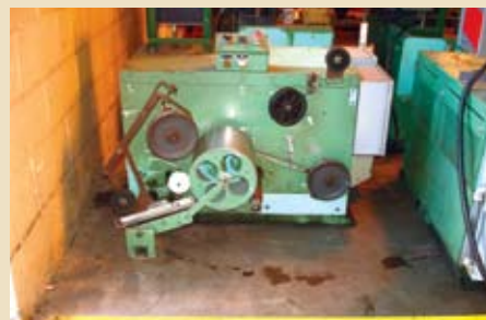
(1 OF 4) WIRE WINDERS