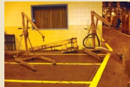
VARIOUS HERCULES LIFTING SYSTEMS & BOOMS