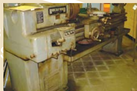
ROCKFORD 17" ENGINE LATHE