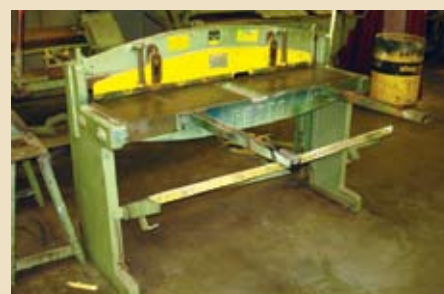
PEXTO 4" STOMP SHEAR