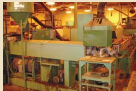
COMPLETE WIRE EXTRUSION LINE