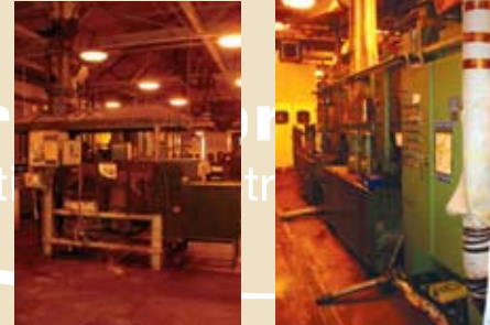
LEFT PIC: RANSOHOFF TUMBLER, GAS FIRED RIGHT PIC: CINCINNATI SHELL WASHER