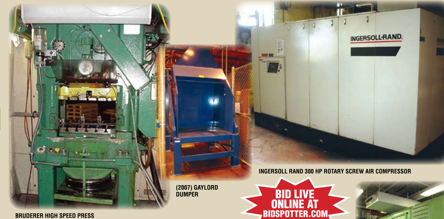
BRUDERER HIGH SPEED PRESS

WEDNESDAY, OCTOBER 22 nd , BEGINNING @ 9 AM LOCAL TIME