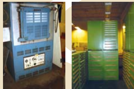
LEFT PIC: BLUE "M" OVEN RIGHT PIC: HUGE QTY. OF STANLEY VIDMAR CABINETS