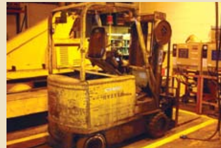
HYSTER 5,500 LB. ELECTRIC FORK LIFT