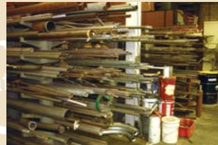
HUGE QTY. OF STEEL STOCK