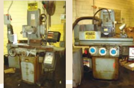
LEFT PIC: (1 OF 2) PARKER MAJESTIC SURFACE GRINDERS RIGHT PIC: BROWN & SHARPE 618 MICROMASTER SURFACE GRINDER