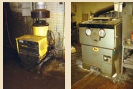
LEFT PIC: LANDA HOT WATER PRESSURE WASHER RIGHT PIC: ZERO BLAST 'N' PEEN BLAST CABINET