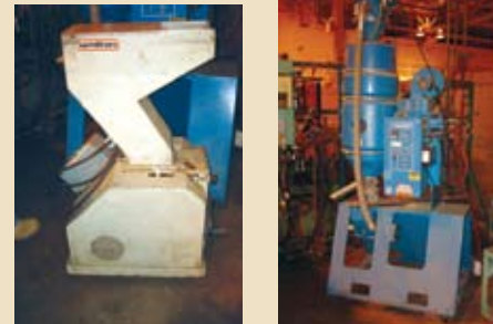
LEFT PIC: (1 OF 2) HAMILTON GRANULATORS RIGHT PIC: (1 OF 2) NOVATEC PLASTIC FEEDER SYSTEMS FEEDERS