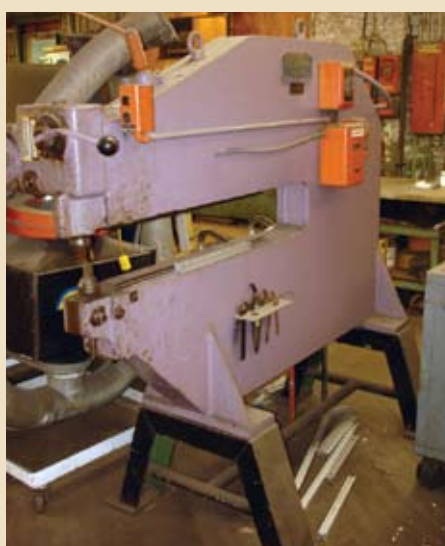
RIGHT PIC: PULLMAXCIRCLE SHEAR