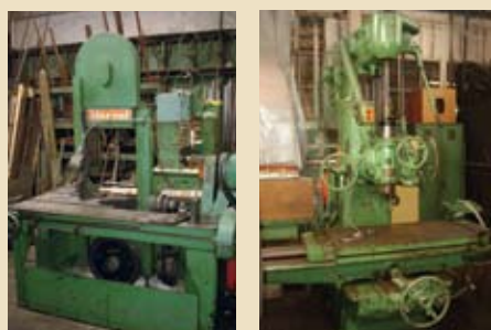
LEFT PIC: MARVEL 'SERIES 8' VERTICAL BAND SAW RIGHT PIC: MOORE JIG BORE