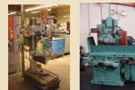
LEFT PIC: WILTON RADIAL ARM DRILL RIGHT PIC: G & L HYDRAULIC SURFACE GRINDER