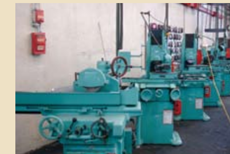
VARIOUS REID, COVELL & BROWN & SHARPE SURFACE GRINDERS