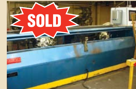
(1 of 2) PAVE VARIFORM AUTO BENDERS