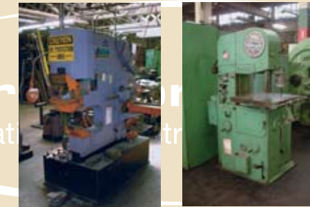
LEFT PIC: HILL ACME IRON WORKER RIGHT PIC: DOALL VERTICAL BAND SAW