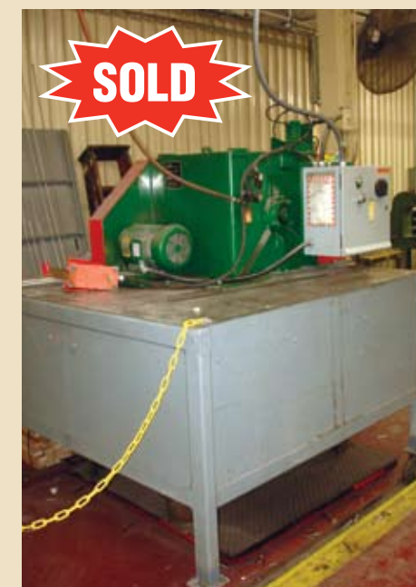
HEAVY DUTY SCRAP CHOPPER