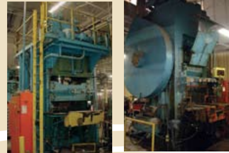
LEFT PIC: (OVER 20) VARIOUS BLISS, CLEARING, CLEVELAND, VERSON AND MINSTER RIGHT PIC: (1 of 2) CLEVELAND 1,000 TON PRESSES