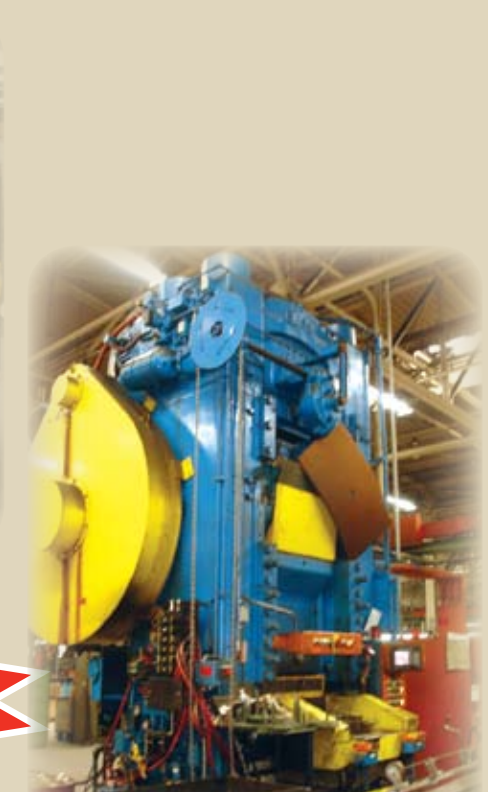
(1 of 30) VARIOUS TONNAGE PRESSES