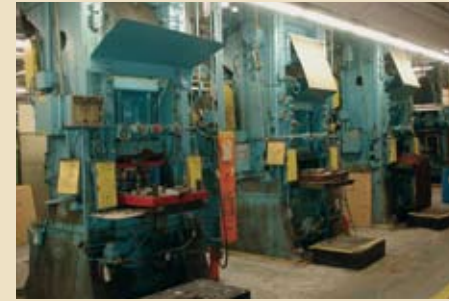
(OVER 10) CLEVELAND 200-400 TON STAMPING PRESSES