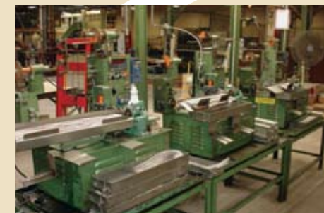
(3 of 19) OAKLEY HELIX WINDERS