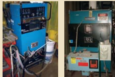
LEFT PIC: (1 of 2) BURNHAM GAS FIRED BOILERS RIGHT PIC: HUGE QTY. OF VARIOUS TIG, MIG & ARC WELDERS