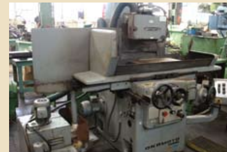
OKAMOTO HYDRAULIC SURFACE GRINDER