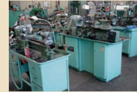
(OVER 5) HARDINGE & SOUTH BEND SECOND OPERATION LATHES