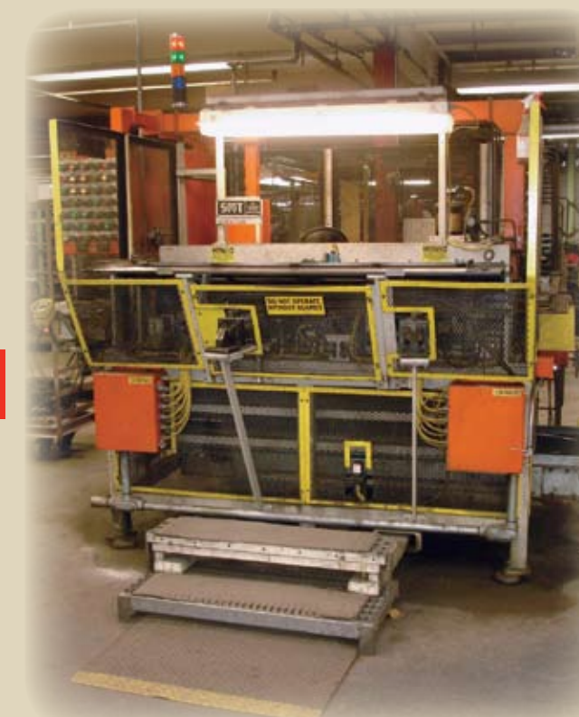
(1 of 6) SMT AUTO BENDERS

THURSDAY, NOVEMBER 6th, BEGINNING @ 9 AM LOCAL TIME