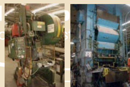
LEFT PIC: (1 of 4) ROUSSELLE 45 TON OBI PUNCH PRESSES RIGHT PIC: CLEVELAND 1,000 TON PRESS

(3) AVEY Drill Presses, 30" x 30" Table Size, Model 3397