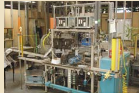
HELIX WELDING STATION

THINKING OF HAVING AN AUCTION? CALL TODAY FOR A CONFIDENTIAL MEETING!