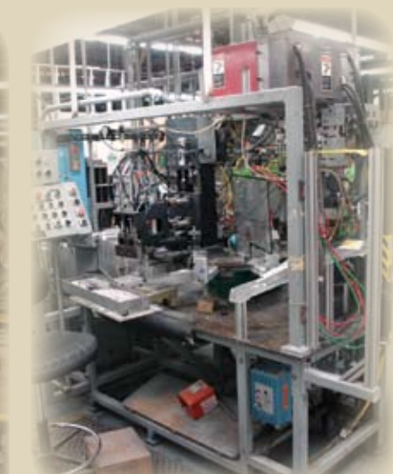
ROTARY PIN TO COIL WELDER