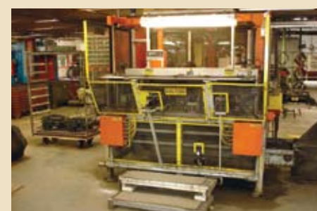
(1 of 6) SMT AUTO BENDERS

28 x 18 Bolster, 180 SPM, 4" Stroke, Shut Height = 12 1/2" w/2 3/4" Adjustment, S/N 520041 & 5-19965