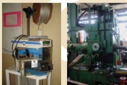
LEFT PIC: (3) 2006 AMP MACHINES RIGHT PIC: KERNEY TRECKER 4" HORIZONTAL BORING MILL