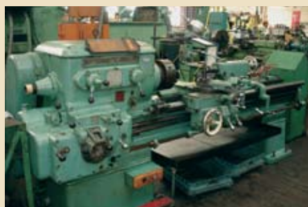
LODGE & SHIPLEY 14" LATHE