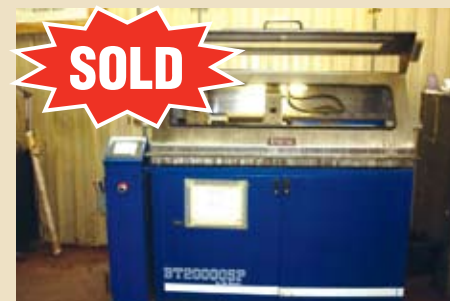
MILL MASTER MODEL BT200000SP BURST TESTER