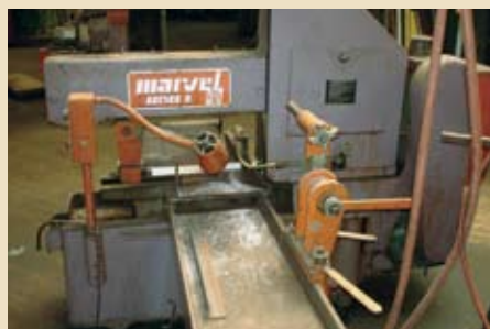
MARVEL 'SERIES 9' POWER HACK SAW