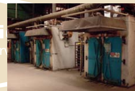
(OVER 20) VARIOUS DISPATCH TYPE OVENS & FURNACES