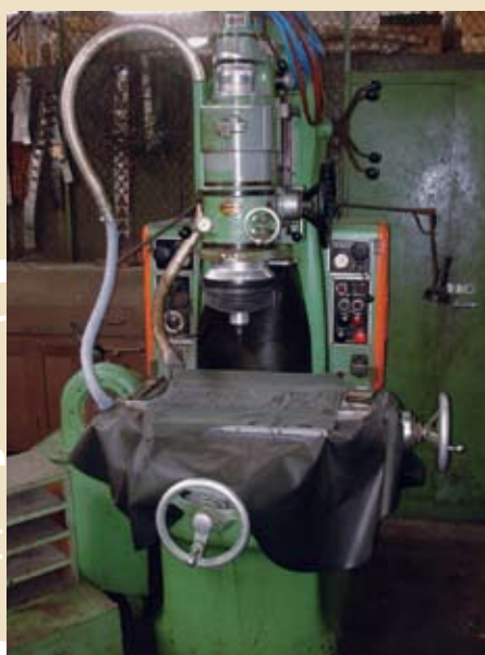
LEFT PIC: MOORE JIG GRINDER