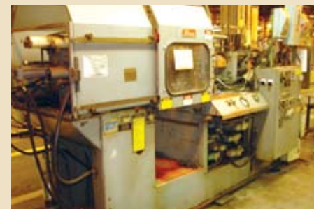
STOKES 75 TON INJECTION MOLDING MACHINE