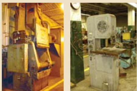
LEFT PIC: (1 OF 3) WHEELABRATOR TUMBLAST SYSTEMS RIGHT PIC: DO ALL 16" VERTICAL BAND SAW