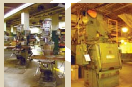
LEFT PIC: (2) BRIDGEPORT (SERIES 1) 2HP VERTICAL MILLING MACHINES RIGHT PIC: (1 OF 3) WHEELABRATOR TUMBLAST SYSTEMS