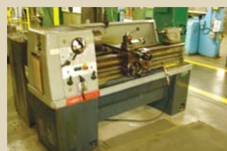
CLAUSING COLCHESTER 13" LATHE