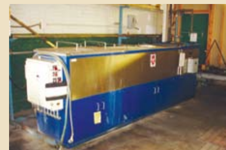
2000 POLYCHEM PARTS CLEANING SYSTEM (COMPLETE)