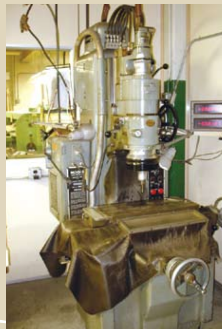
MOORE NO. 3 JIG GRINDER

(2) V & O OBI Punch Presses, 25 Ton, Automat Auto Level Controls, Air Clutch, Palm Button Controls, S/N's 25ST-603 & 30T-129