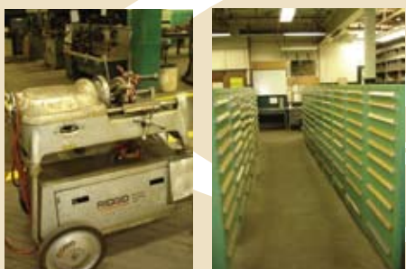
LEFT PIC: RIDGID 535 POWER THREADER RIGHT PIC: (OVER 50) VIDMAR CABINETS