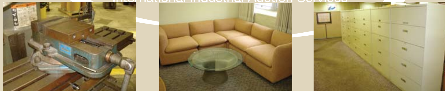
LG. QTY. OF MACHINE TOOLING HIGH END EXECUTIVE FURNITURE (OVER 30) LIKE NEW LATERAL FILE CABINETS