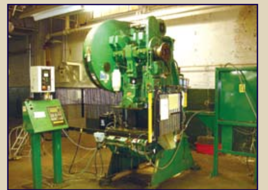
NIAGARA 60 TON OBI PUNCH PRESS