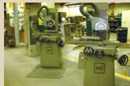
(2) MHT SURFACE GRINDERS