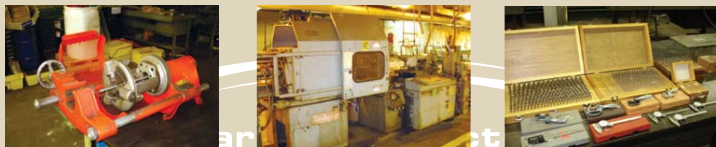
AEROQUIP POWER THREADER VAN DORN INJECTION MOLDING MACHINE LG. QTY. OF INSPECTION EQUIPMENT