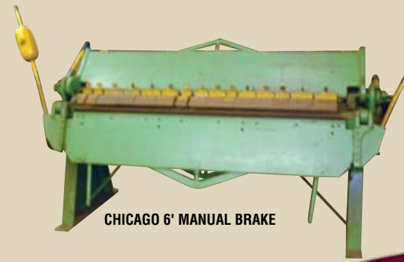
CHICAGO 6' MANUAL BRAKE