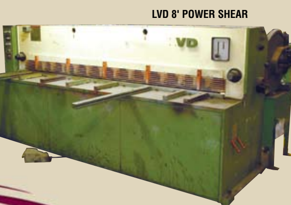
LVD 8' POWER SHEAR