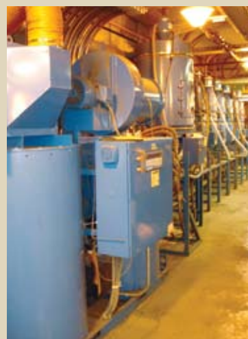
1995 NOVATEC PLASTIC FEED SYSTEM (COMPLETE)