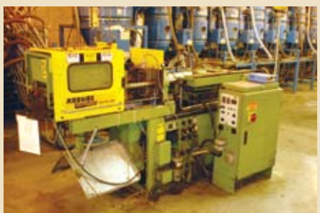
(1 OF 3) ARBURG INJECTION MOLDING MACHINES

Visit the marketplace of Charleston Auctions to buy and sell used industrial equipment - www.charlestonauctions.com