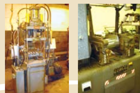
LEFT PIC: (1 OF 30) STOKES COMPRESSION MOLDING MACHINES RIGHT PIC: EEMCO LAB MILL