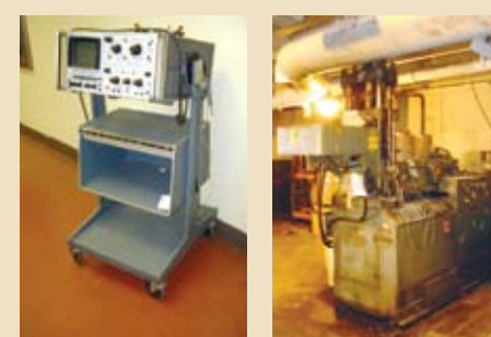
LEFT PIC: HP 141B OSCILLOSCOPE RIGHT PIC: STOKES VERTICAL MOLDING MACHINE