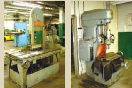
LEFT PIC: MARVEL VERTICAL BAND SAW RIGHT PIC: MOORE JIG BORER, NO.3