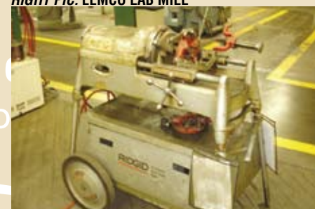
RIDGID 535 POWER THREADER