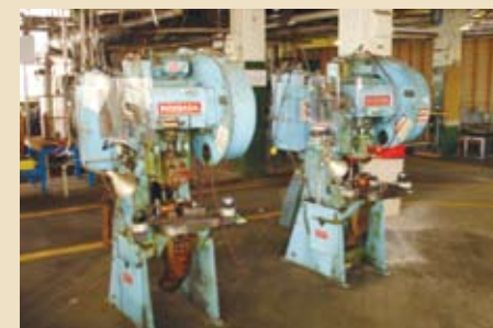
(2) NIAGARA A15 PUNCH PRESSES

Live Internet Bidding BidSpotter.com® www.bidspotter.com to register