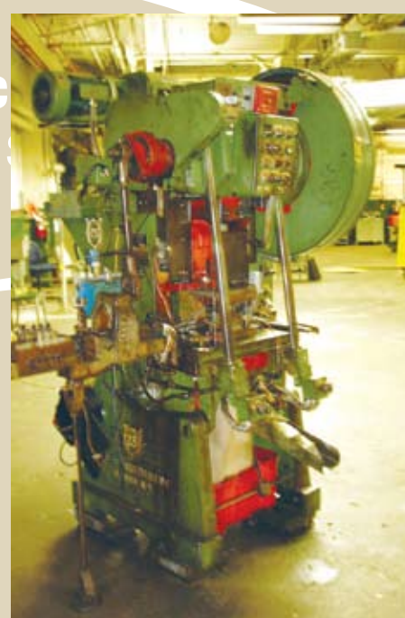
V & O 25 TON PUNCH PRESS