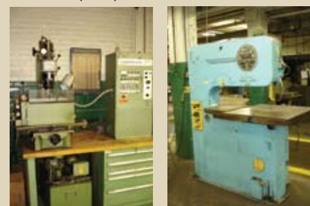
LEFT PIC: CHARMILLES D-10 SINKER EDM RIGHT PIC: DO ALL 36" VERTICAL BAND SAW