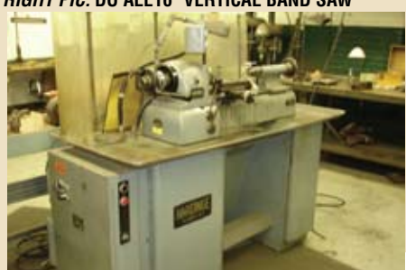
(1 OF 2) HARDINGE DV-59 SPEED LATHES