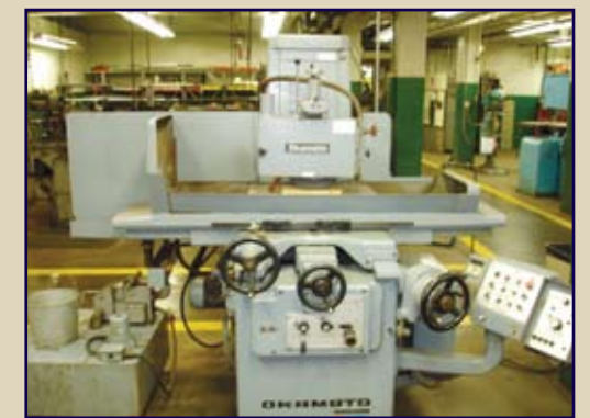
OKAMOTO HYDRAULIC SURFACE GRINDER

THURSDAY, OCTOBER 11th • 10:00 AM (LOCAL TIME)