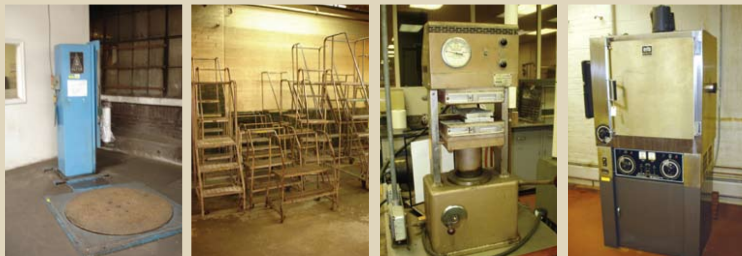
ALTEK PALLET WRAPPER LG. QTY. OF VARIOUS ROLL AROUND SAFETY LADDERS PASADENA LAB PRESS VARIOUS LAB OVENS

THINKING OF HAVING AN AUCTION? CALL TODAY FOR A CONFIDENTIAL MEETING!