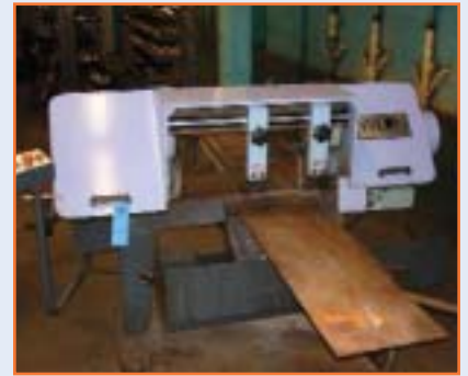
WILTON HORIZONTAL BAND SAW