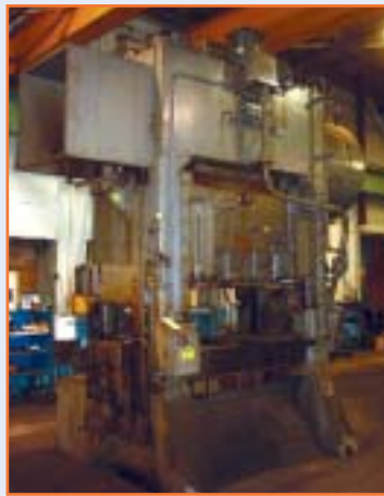
DANLEY 200 TON PRESS