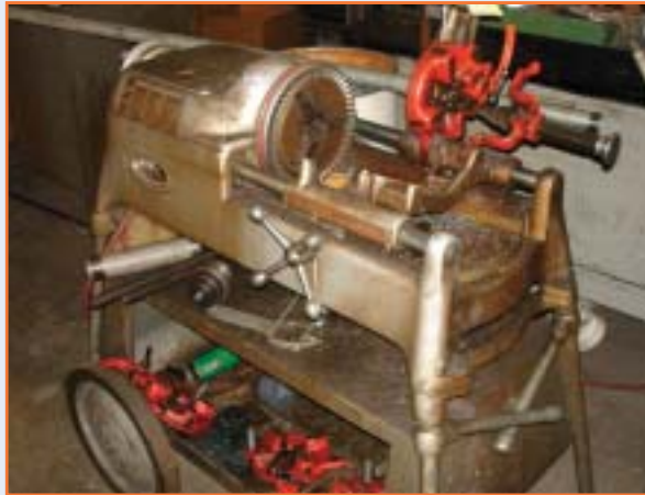
RIDGID PIPE THREADER