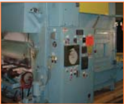
L.T.G. ROTOR HEAT SHOCK ANNEAL OVEN