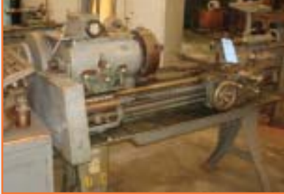
LEBLOND TOOL ROOM LATHE