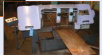
Wilton Horizontal Band Saw