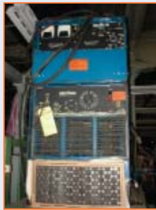
(2) MILLER TIG WELDERS LOCKFORMER