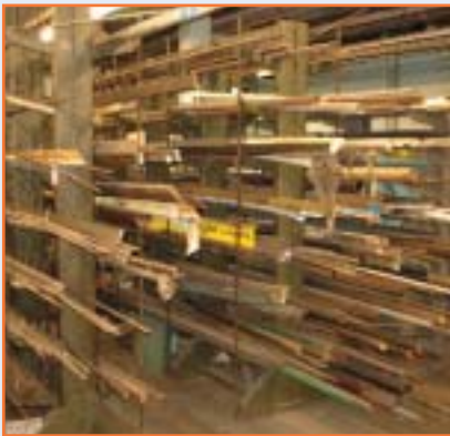
LG. QTY. OF CANTILEVER RACKS AND VARIOUS STEEL