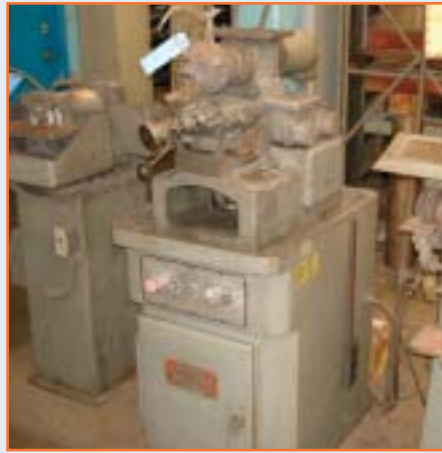
VARIOUS TOOL GRINDERS