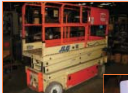
JLG Scissors Lift