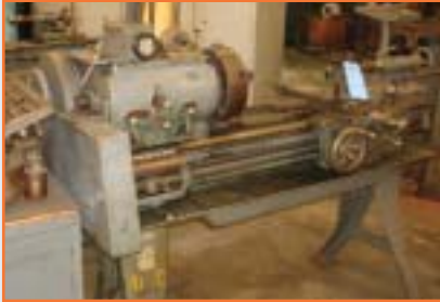
LEBLOND TOOL ROOM LATHE