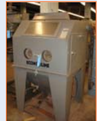
ECONOLINE BLAST CABINET