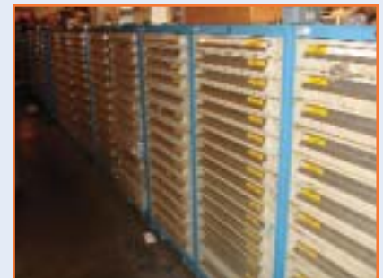
LYONS STORAGE CABINETS