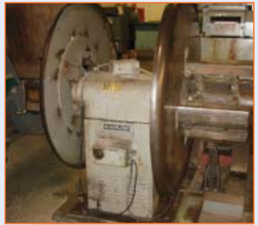
PERFECTO AUTO CENTERING REEL