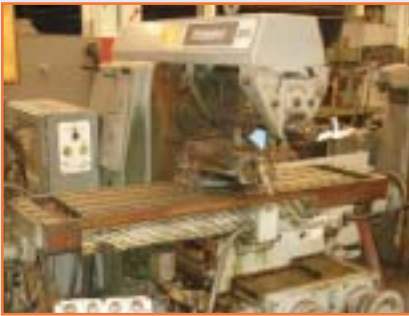
BRIDGEPORT UNIVERSAL MILLING MACHINE