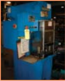
HANNIFIN MULTI PRESS