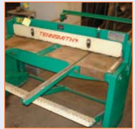
TENNSMITH STOMP SHEAR