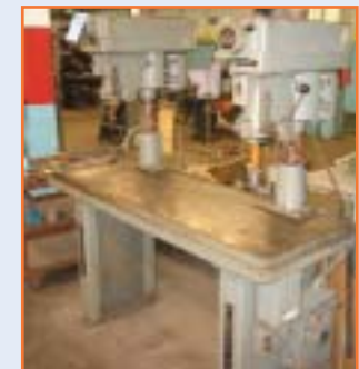
CLAUSING 2-HEAD GANG DRILL