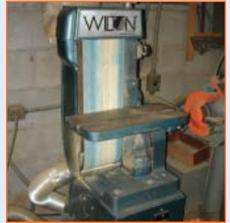
WILTON 6" BELT SANDER