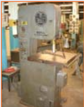
DOALL VERTICAL BAND SAW