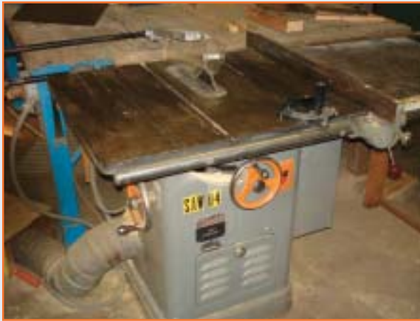
ROCKWELL 10" TABLE SAW