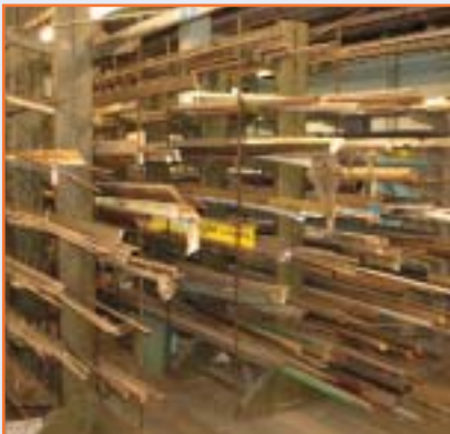
LG. QTY. OF CANTILEVER RACKS AND VARIOUS STEEL