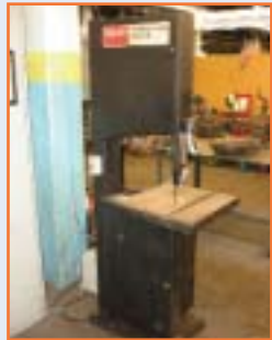
DAYTON VERTICAL BAND SAW