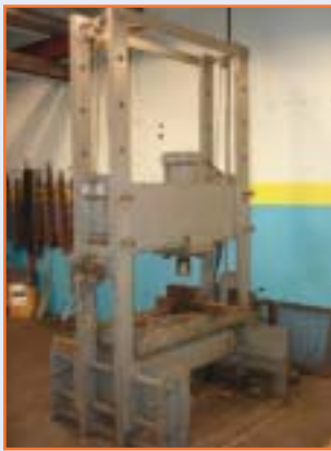
150 TON SHOP HYD. SHOP PRESS