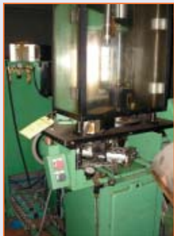
Fort Wayne 42FR Stader Winder

LIVE INTERNET BIDDING Visit www.bidspotter.com for registration