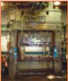
MINSTER 300 TON PRESS