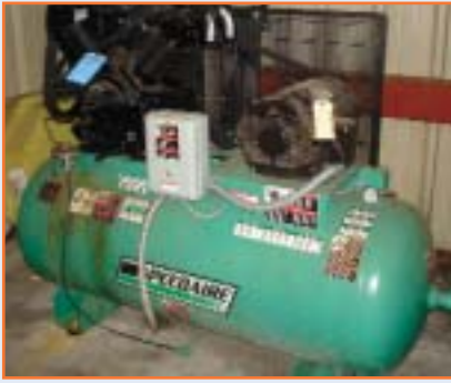
SPEEDAIRE HORIZONTAL AIR COMPRESSOR