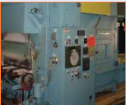
L.T.G. ROTOR HEAT SHOCK ANNEAL OVEN