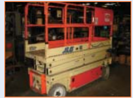
JLG SCISSORS LIFT