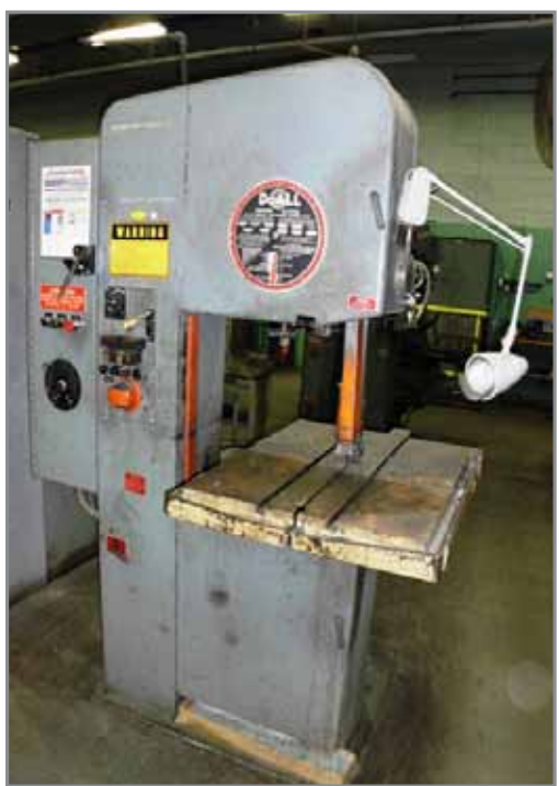
DOALL VERTICAL BANDSAW