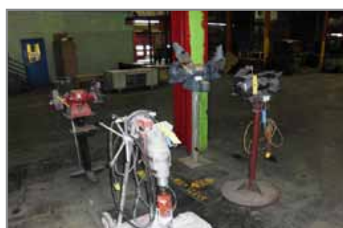
CORE DRILLS AND GRINDERS