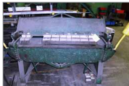
MANUAL FINGER BRAKE