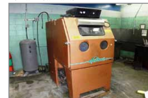
ABRASIVE BLAST CABINETS