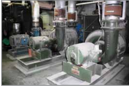
HOFFMAN BLOWER UNITS