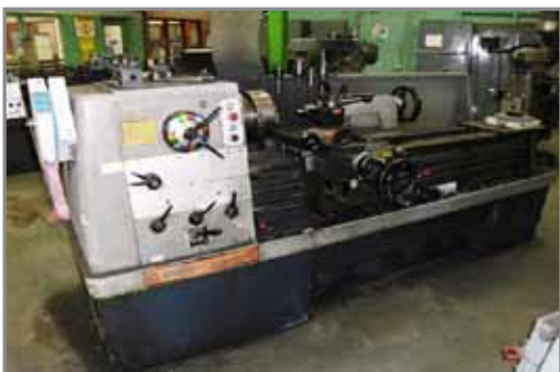
CLAUSING COLCHESTER LATHE