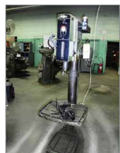
DOALL VERTICAL DRILL PRESS