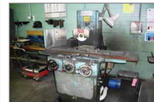
BROWN AND SHARPE SURFACE GRINDER