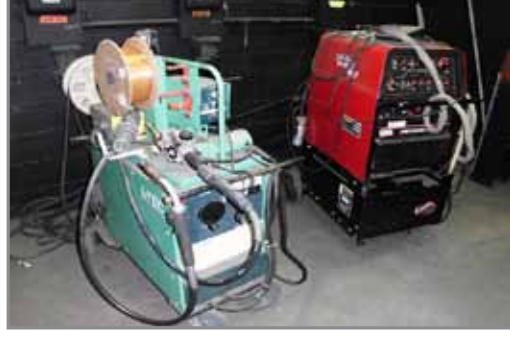
(OVER 25) MIG & TIG WELDERS