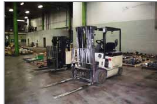
VARIOUS CROWN FORK LIFT TRUCKS