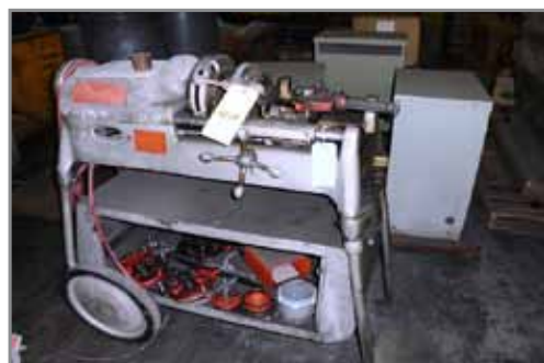
RIDGID POWER THREADERS