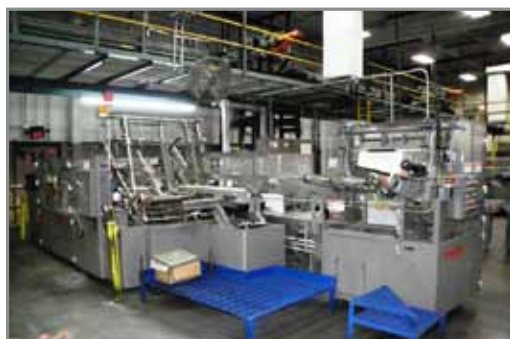
DOUGLAS TRAY PACKER