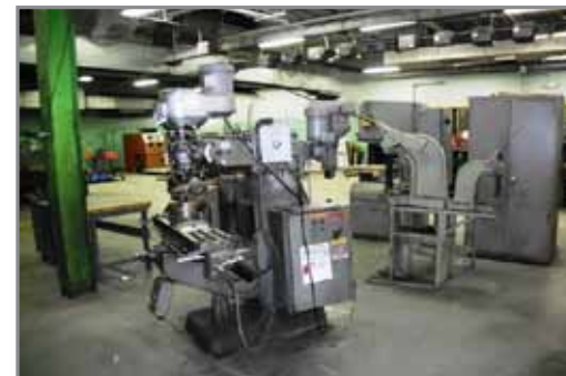
BRIDGEPORT MILL WITH SHAPER HEAD ATTACHMENT