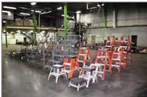
LG QTY OF SAFETY AND STEP LADDERS