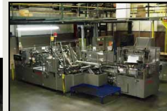
(2) DOUGLAS BOX PACKING SYSTEMS

PREVIEW INSPECTION: Tuesday, March 15th from 9:00 AM - 5:00 PM 125 Apple Valley Road, Winchester, VA 22602