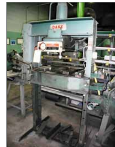
DAKE 50 TON H FRAME SHOP PRESS