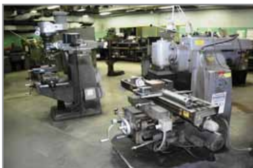
CINCINNATI & BRIDGEPORT MILLING MACHINES