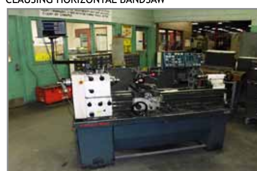
HARRISON M300 LATHE