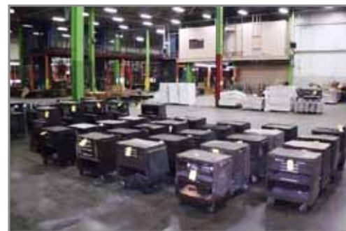
LG QTY OF ROLLING TOOL CHESTS

M.R.O. Online Auction March 7th - March 11th SALE LOCATION: Online bidding at Bidspotter.com EQUIPMENT LOCATION: 125 Apple Valley Road, Winchester, VA 22602 DATE & TIME: Timed, online auction begins on Monday, March 7th at 10:00 a.m. (EDT) Lots will begin closing on March 11th at 12:00 p.m. (EDT) PREVIEW INSPECTION: By appointment only (260)452-7820 TERMS OF SALE: A 15% Buyer's Premium will be charged on all purchases. An 18% Buyer's Premium will be charged if using a credit card. For auction terms & conditions, please visit Bidspotter.com. REMOVAL DATES & TIMES: Saturday, March 12th and Monday, March 14th from 9:00 a.m. to 5:00 p.m. EDT