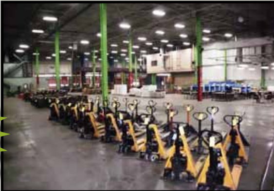
LG QTY OF ELECTRIC PALLET JACKS

M.R.O. Online Auction March 7th - March 11th