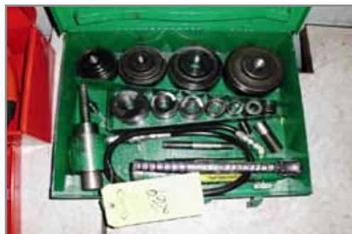
(OVER 10) GREENLEE KNOCKOUT SETS