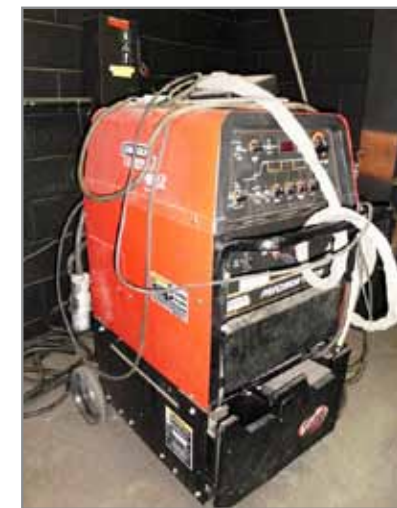
LINCOLN PLASMA CUTTER