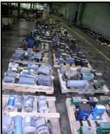
LG QTY OF ELECTRIC MOTORS