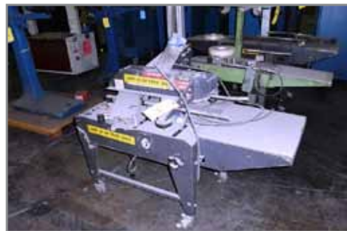
3M CASE SEALERS

M.R.O. Online Auction March 7th - March 11th SALE LOCATION: Online bidding at Bidspotter.com EQUIPMENT LOCATION: 125 Apple Valley Road, Winchester, VA 22602 DATE & TIME: Timed, online auction begins on Monday, March 7th at 10:00 a.m. (EDT) Lots will begin closing on March 11th at 12:00 p.m. (EDT) PREVIEW INSPECTION: By appointment only (260)452-7820 TERMS OF SALE: A 15% Buyer's Premium will be charged on all purchases. An 18% Buyer's Premium will be charged if using a credit card. For auction terms & conditions, please visit Bidspotter.com. REMOVAL DATES & TIMES: Saturday, March 12th and Monday, March 14th from 9:00 a.m. to 5:00 p.m. EDT