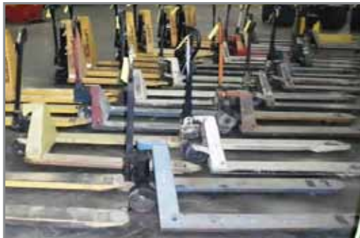
(OVER 30) VARIOUS PALLET JACKS