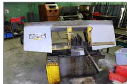
CLAUSING HORIZONTAL BANDSAW