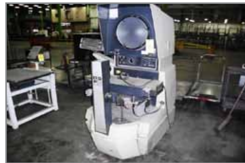
OGP 14 INCH OPTICAL COMPARATOR