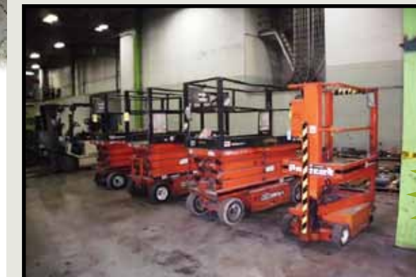
(4) WILDCAT SCISSOR PLATFORM LIFTS

M.R.O. Online Auction March 7th - March 11th