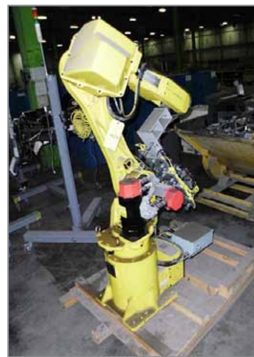
(1 OF 3) FANUC ROBOTS