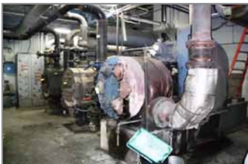
(3) VARIOUS BOILERS