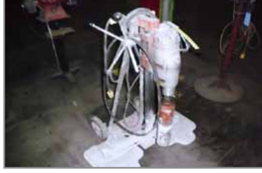
MILWAULKEE CORE DRILL