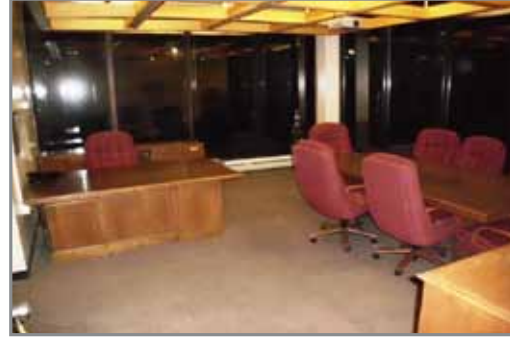
HUGE QTY OF OFFICE FURNITURE