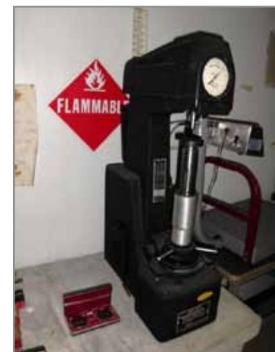
ROCKWELL WILSON HARDNESS TESTER