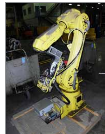
(1 OF 3) FANUC ROBOTS