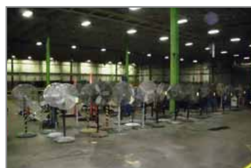
(OVER 100) FLOOR FANS