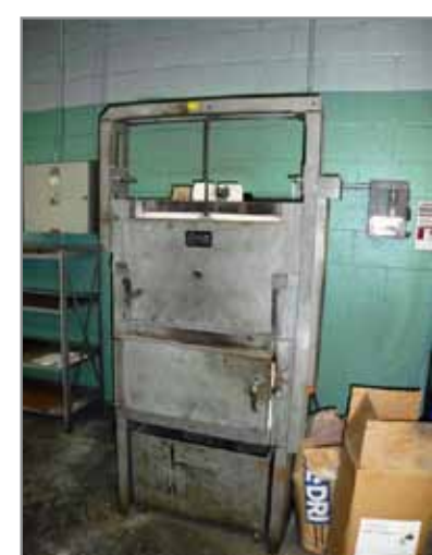
VARIOUS ELECTRIC FURNACES