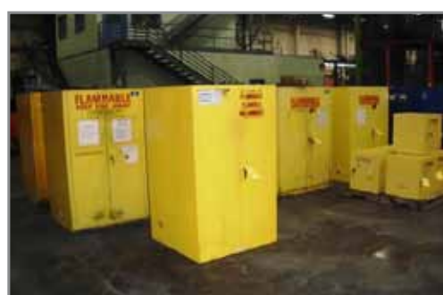
(OVER 30) FLAMMABLE LIQUID STORAGE CABINETS