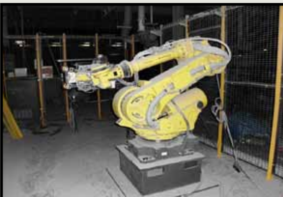
FANUC R-2000A ROBOT