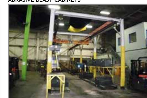
COMPLETE BATTERY HANDLING SYSTEM