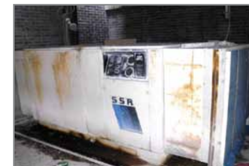
INGERSOLL RAND 75 HP AIR COMPRESSOR