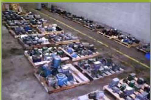
MOTORS AND REDUCERS