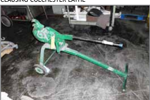
GREENLEE 1818 TUBE BENDERS