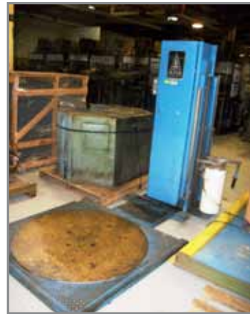
ALTEK PALLET WRAPPER