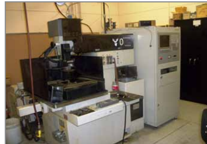
1 OF 4 MITSUBISHI WIRE EDMS