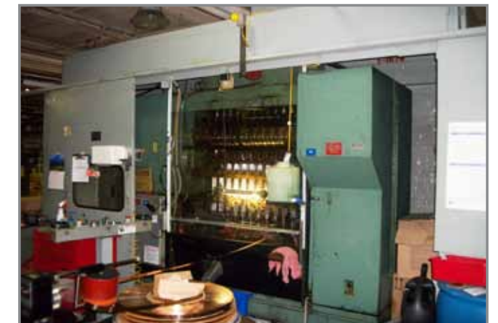
WATERBURY FARREL NO. 15-12 I.C.O.P. PRESS