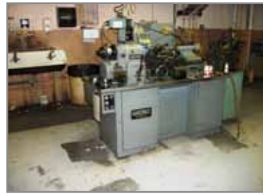
(1 OF 10) HARDINGE LATHES