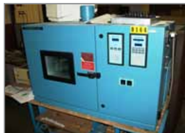
OVER (20) THERMOTRON OVENS