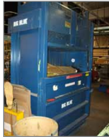
(3) CRAM A LOT CARDBOARD BAILERS