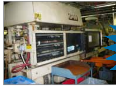
1985 HPM PLASTIC INJECTION PRESS