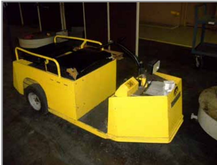
(10) CUSHMAN ELECTRIC MAINT CARTS