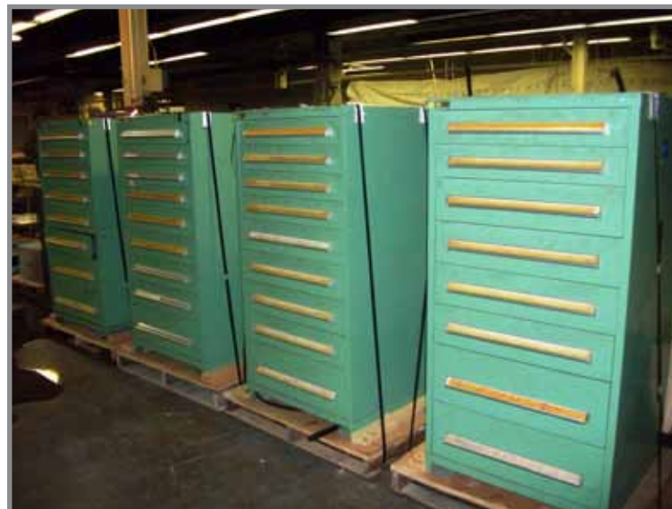
OVER (25) VIDMAR STORAGE CABINETS