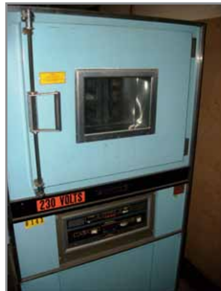
OVER (30) BLUE M OVENS