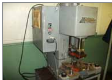
OVER (30) VARIOUS DENISON PRESSES