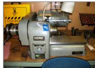
HARDINGE SPEED LATHE