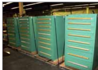
OVER (25) VIDMAR STORAGE CABI-