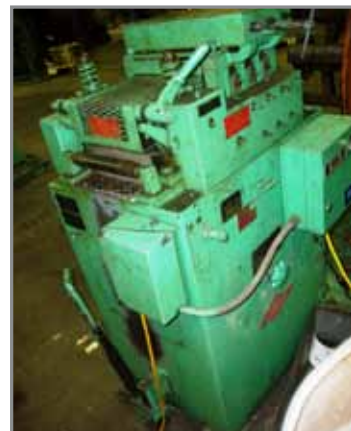
HUGE QTY OF PRESS SUPPORT EQUIP.