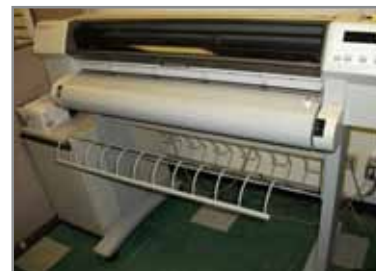
OFFICE EQUIPMENT & FURNISHINGS