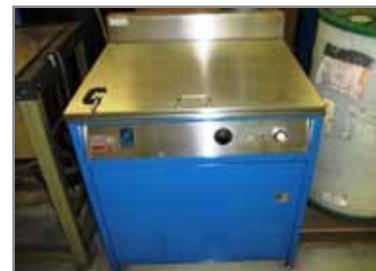
LAB FREEZERS AND EQUIPMENT