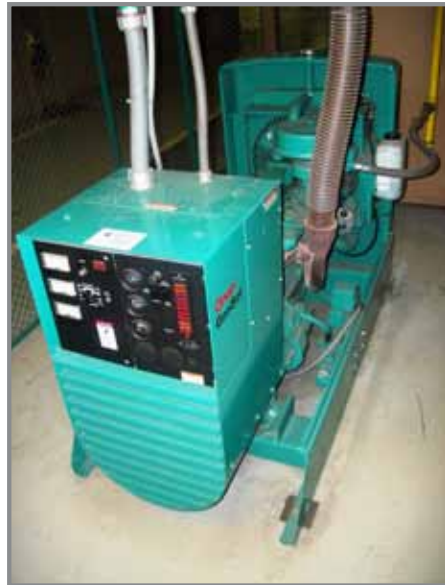
ONAN GENSET GENERATOR