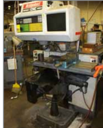
BRIDGEPORT SERIES 2 CNC VMM