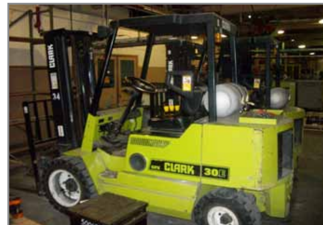
CLARK 3000 LB LP FORK TRUCK