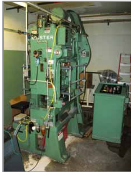
OVER (10) MINSTER PRESS LINES