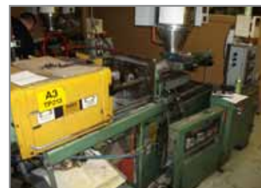
OVER (10) ARBURG INJECTION PRESSES