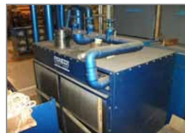
PIONEER AIR DRYER