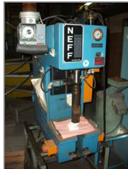
OVER (25) VARIOUS NEFF PRESSES