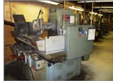
BROWN & SHARPE 1024 SURFACE GRINDER