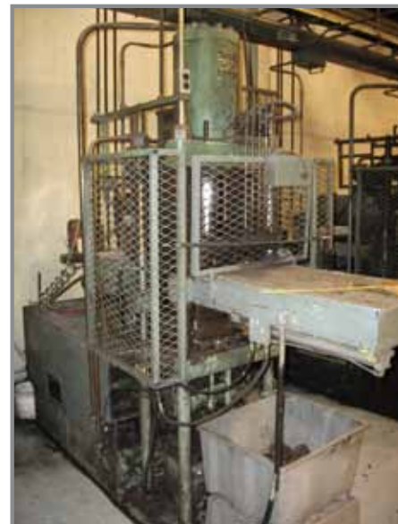
OVER (20) STOKES INJECTION PRESSES