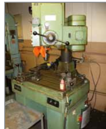
DO ALL DRILL PRESS