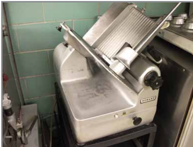
HOBART MEAT SLICER AND OTHER RESTAURANT EQUIPMENT