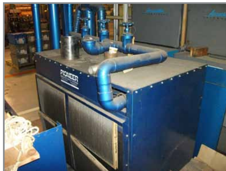
PIONEER AIR DRYER