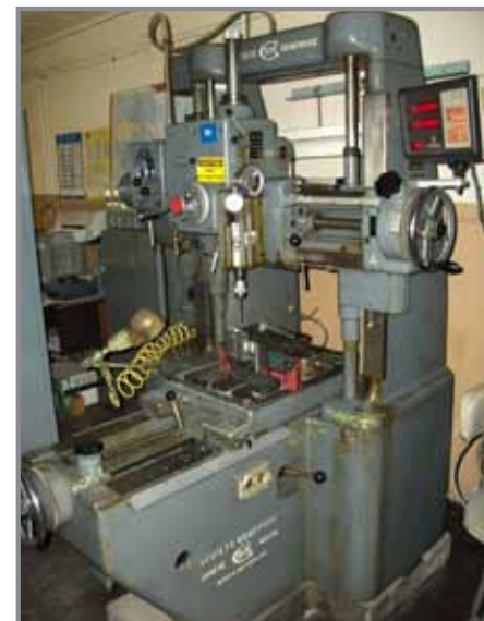
SOCIETE GENEVOISE BRIDGE MILL