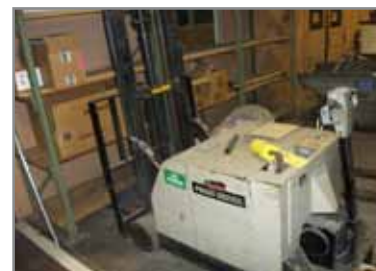
MATERIAL HANDLING EQUIPMENT