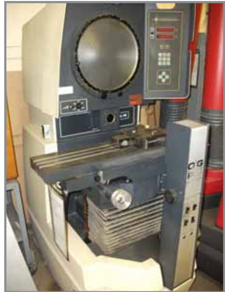
OGP 14 INCH COMPARITOR