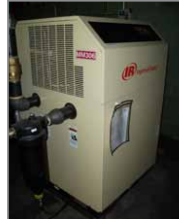
INGERSOLL RAND AIR DRYER