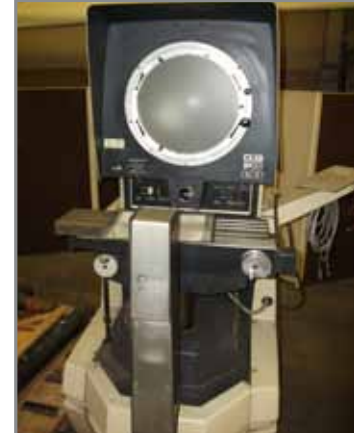
(1 OF 10) OPTICAL COMPARITORS