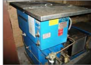
BRANSON ULTRASONIC CLEANERS

FAR TOO MUCH TO LIST! View Auction Catalog at CharlestonAuctions.com