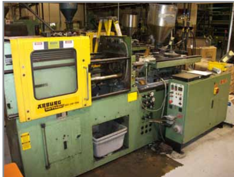
OVER (10) ARBURG PRESSES