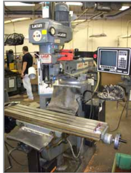
BRIDGEPORT, LAGUN & SUPER MAX VERTICAL MILLS