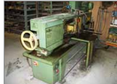
DO ALL HORIZONTAL BAND SAW