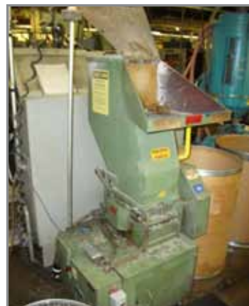
(1 OF 10) PLASTIC GRANULATORS