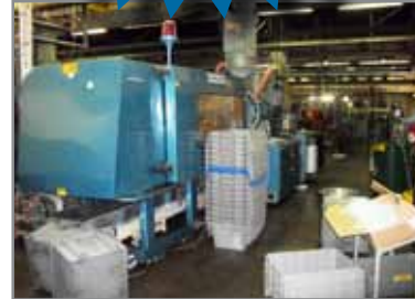
CINCINNATI MILACRON INJECTION PRESS