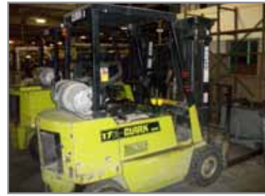
(2 OF 10) VARIOUS FORK TRUCKS