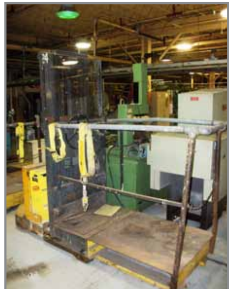
PLANT SERVICING EQUIPMENT