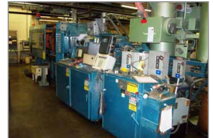
1 OF 5 CINCINNATI MILACRON PLASTIC INJECTION PRESSES