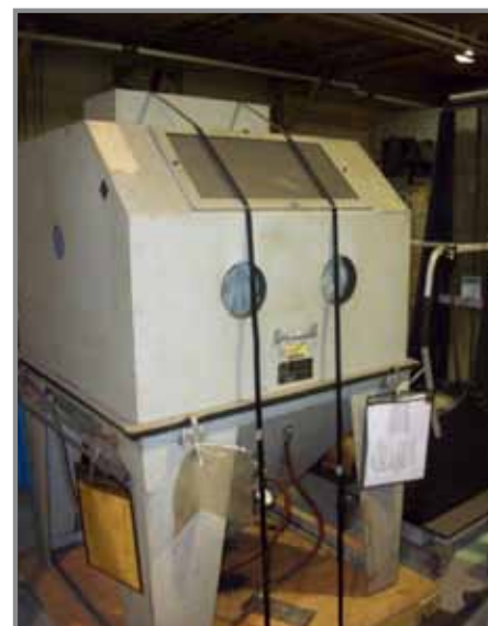
TRINCO DRY BLAST CABINET