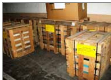
OVER (20) IN THE CRATE MULTI PRESSES