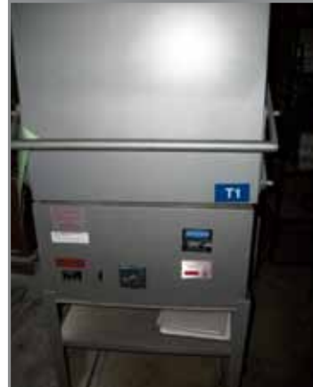
CRESS ELECTRIC FURNACE