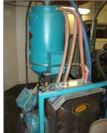
PLASTIC SUPPORT EQUIPMENT