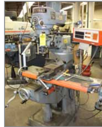
(3) COMPLETE MACHINE SHOPS