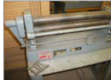
DI ARCO MANUAL ROLLS