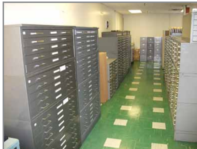
BLUEPRINT STORAGE CABINETS