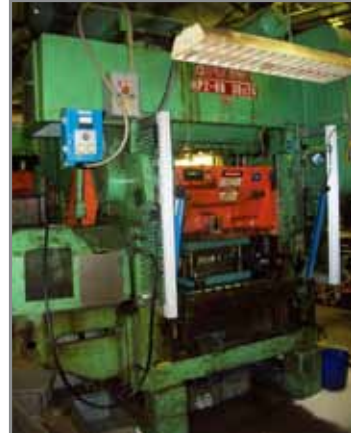
OVER (50) VARIOUS PRESSES