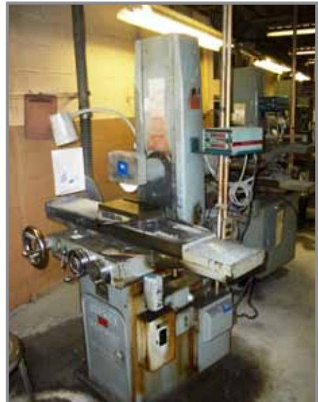
OVER (30) VARIOUS HAND FEED SURFACE GRINDERS