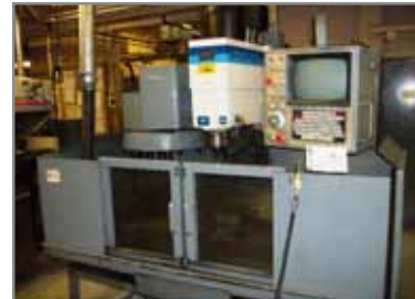
FADAL 40 CNC VMC