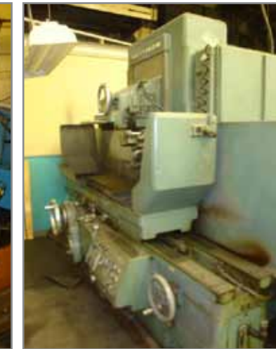
MATTISON SURFACE GRINDER