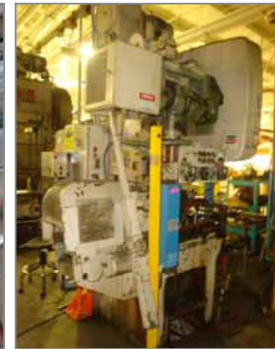
VARIOUS HIGH SPEED PRESSES