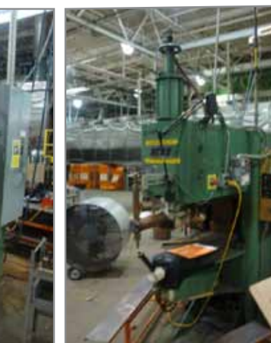
(2 OF 2) ACRO SPOT WELDERS

HUGE AUCTION! PLAN NOW TO ATTEND! ONLINE BIDDING INSTRUCTIONS TO PARTICIPATE, YOU MUST: 1. Type in www.CharlestonAuctions.com. Live Internet Bidding 2. Click on the "View Catalog" button. Bidspotter.com 3. Click the blue box directly above the catalog that says "Sign up for this auction". 4. If you are new to bidspotter.com, click on "Register" otherwise skip to step 8. 5. Fill out bidder registration. 6. Exit out and re-enter on www.bidspotter.com 7. Click on Sign-up and then Sign In (already a bidspotter user). 8. Utilize User Name & Password emailed to you after registering. 9. Exit out again and re-enter www.bidspotter.com. 10. Click on Bid Now. 11. START BIDDING! 12. Bid with Bid Now Button for faster bidding. ALL ON-LINE BIDS ARE SUBJECT TO A 15% BUYER'S PREMIUM. 18% BUYER'S PREMIUM IF PAID BY CREDIT CARD