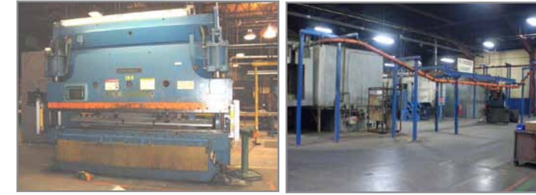
230 TON CINCINNATI PRESS BRAKE COMPLETE POWDER COAT LINE