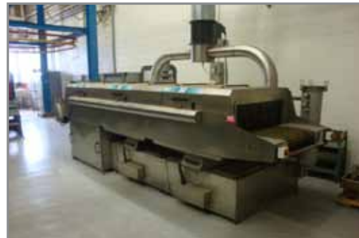
CUDA PARTS WASHER

Fabrication Equipment CINCINNATI 225 Ton Press Break, 9 Series x 10' 3" Stroke, S/N-38555 HURCO Auto Bend 7 Back Gage CINCINNATI 225 Ton Press Break, 9 Series x 10' 3" Stroke, S/N-37702 HURCO Auto Bend 5E Back Gage CINCINNATI 225 Ton Press Break, 9 Series x 8' 3" Stroke, S/N-32918 HURCO Auto Bend 5E Back Gage (3) WARNER SWASEY Mach II Torrent Punches (2) WARNER SWASEY Opti Shears Huge Qty. of Punch Tooling Blades WYSONG 10 x .25" Shear, Model-1025 S/N-P37+215, 1/4" Capacity Over 10 Screw Machines WARNER SWASEY 1 1/4 - 6 + 1 3/4 - 5 (5) ACME GRIDLEY 7/16 - PAC6 (2) ACME GRIDLEY 9/16 - PA 6 BROWN & SHARPE 2, 3/4 in