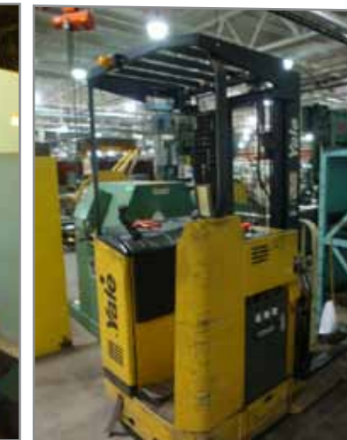
(1 OF 3) YALE ELECTRIC FORK TRUCKS