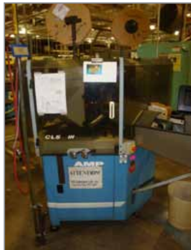
VARIOUS AMP INSERT STATIONS