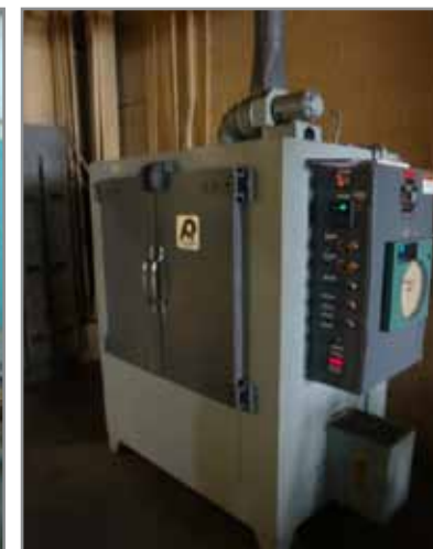
(OVER 10) LAB OVENS