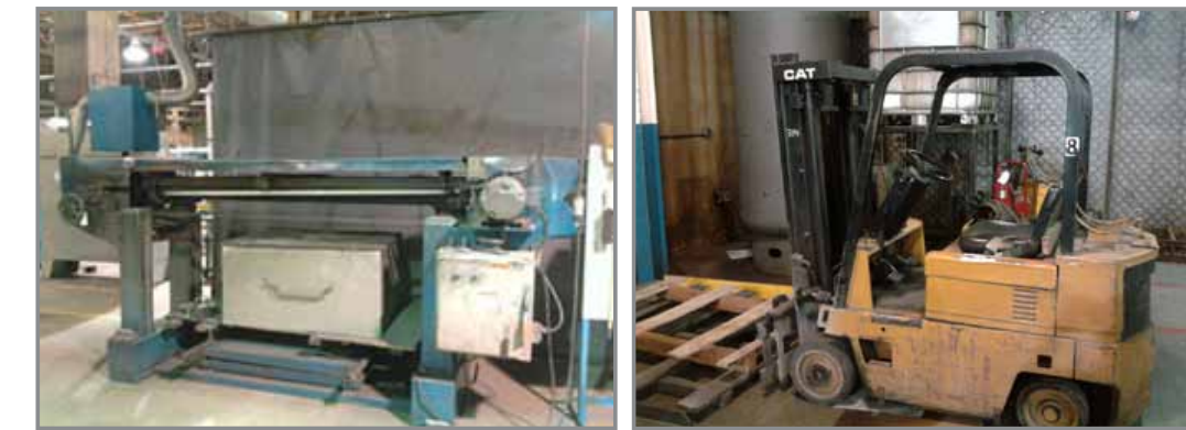
(5) STROKE SANDERS CAT 3,000 LB LP FORK TRUCK