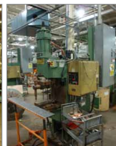
(1 OF 2) FEDERAL SPOT WELDER