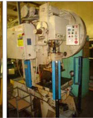
(1 OF 5) DANLEY OBI PUNCH PRESSES