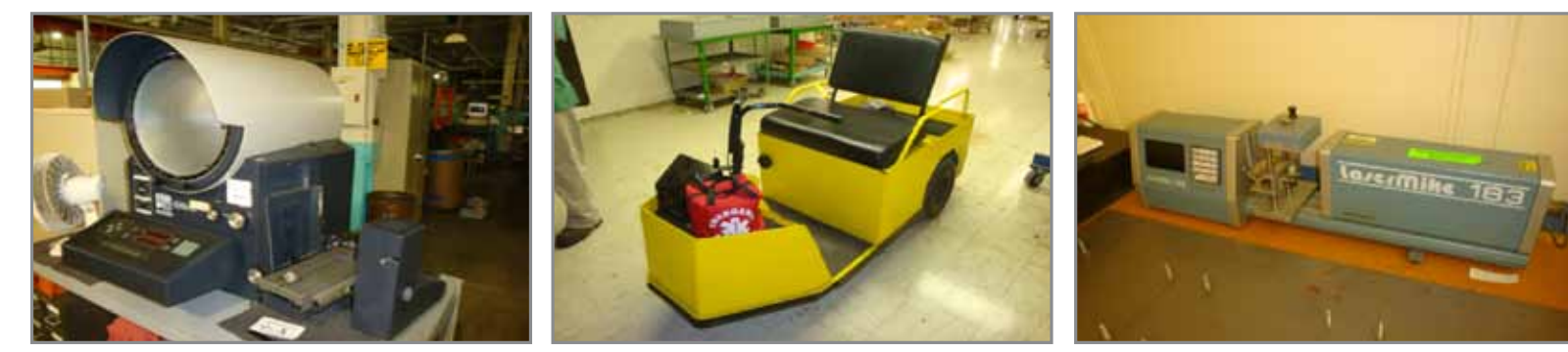
HUGE QTY OF INSPECTION EQUIPMENT (1 OF 4) CUSHMAN 3 WHEEL SHOP CARTS LASER MICROMETER

Surplus to the Ongoing Needs of: Koester Metals Inc. Tuesday, November 30th at 10AM - Thursday, December 2nd at 12PM