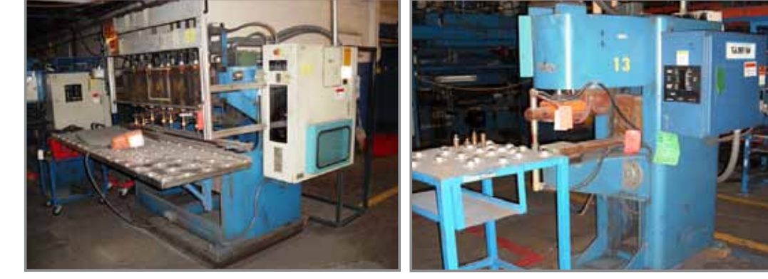
LORS MULTIGUN SPOT WELDER ACRO SPOT WELDER