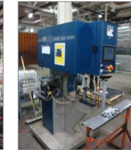
SERIES 2000 PEM SERTOR