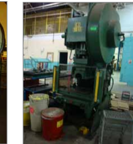
BLISS AND NIAGRA OBI PUNCH PRESSES