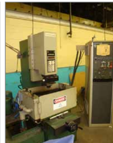
(1 OF 2) CHARMILLIES EDM