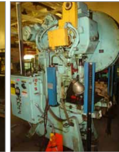
(OVER 10) OBI PUNCH PRESSES