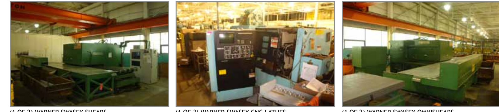
(1 OF 2) WARNER SWASEY SHEARS (1 OF 3) WARNER SWASEY CNC LATHES (1 OF 2) WARNER SWASEY OMNISHEARS