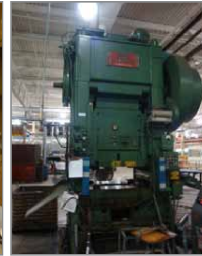
PRECISION FLEX O PRESS