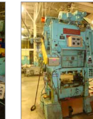
PRECISION 60 TON PRESS