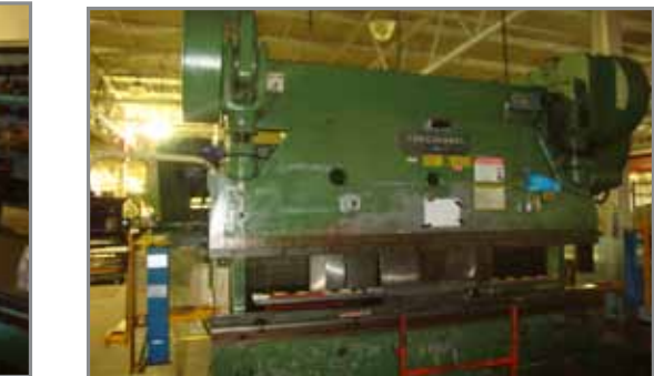
(1 OF 3) CINCINNATI PRESS BRAKES