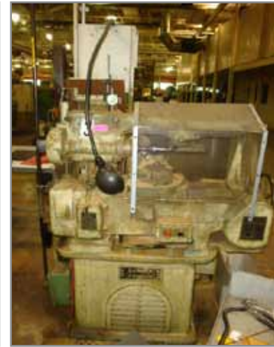
BARBER COLMAN GEAR HOBBER