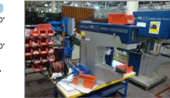
SERIES 4 PEM SERTOR