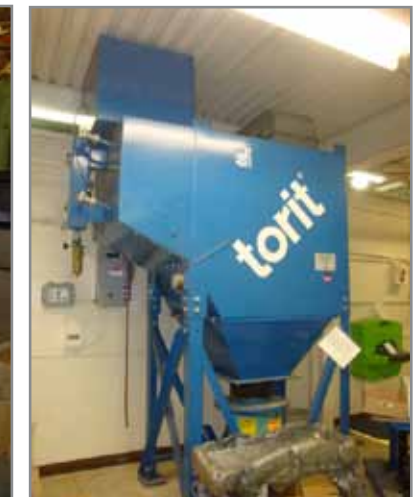
VARIOUS DUST COLLECTION SYSTEMS