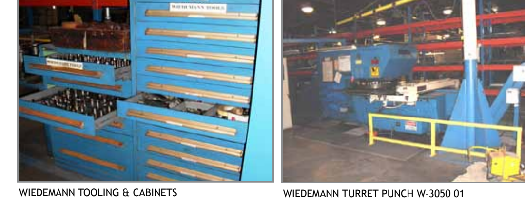
WIEDEMANN TOOLING & CABINETS WIEDEMANN TURRET PUNCH W-3050 01