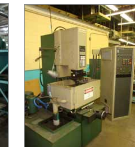
(1 OF 2) CHARMILLIES EDM