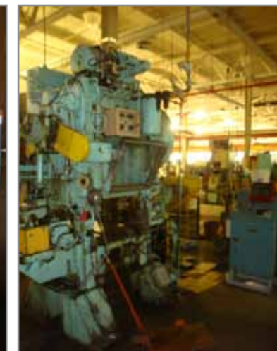
PRECISION 60 TON PRESS