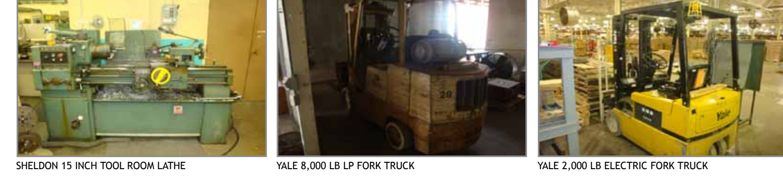
SHELDON 15 INCH TOOL ROOM LATHE YALE 8,000 LB LP FORK TRUCK YALE 2,000 LB ELECTRIC FORK TRUCK