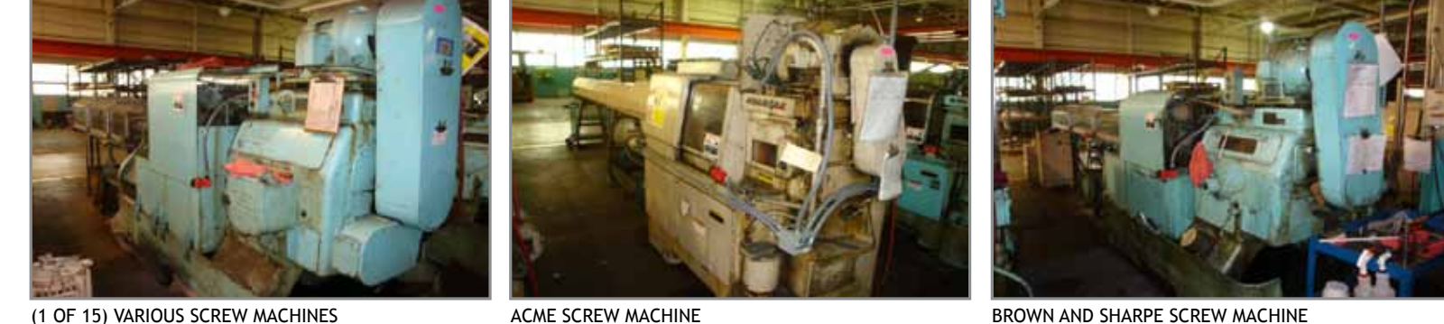
(1 OF 15) VARIOUS SCREW MACHINES ACME SCREW MACHINE BROWN AND SHARPE SCREW MACHINE