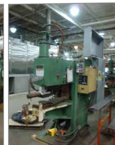
(1 OF 2) ACRO SPOT WELDER