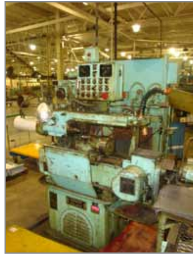
(1 OF 2) BARBER COLMAN GEAR HOBBER