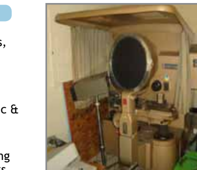
J AND L 36 INCH OPTICAL COMPARITOR