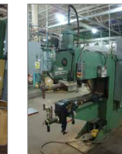
(2 OF 2) FEDERAL SPOT WELDERS