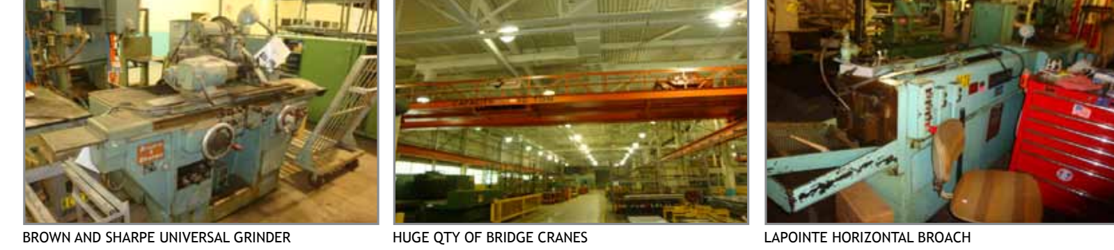
BROWN AND SHARPE UNIVERSAL GRINDER HUGE QTY OF BRIDGE CRANES LAPOINTE HORIZONTAL BROACH