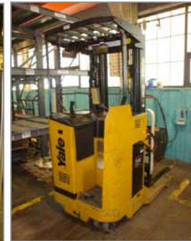
YALE 3,000 LB ELECTRIC PICKER TRUCK