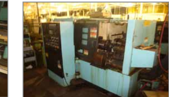
(1 OF 3) WARNER SWASEY 5430 NC LATHES

Machine Shop Equipment 2008 AGIECHARMILLE Cut 20 EDM, 300 Hrs, S/N-022-004, 3 Phase, Complete System Under Power & Operational as of Nov. 8th 2010 WARNER SWASEY QCM-6 Turning Machine, Model-M-5100, S/N-C-183052/3192963 DO ALL Vertical Bandsaw w/ Blade Welder, Tilt Table 18" Throat, Model-1612-1, S/N-148-65848 Well Saw Horizontal Bandsaw, Model-9 S/N-33899 SHELTON 15" Tool Room Lathe, S/N-31500 2.5 Spindle Hole, 30h BTC, All Toolod Up, Bridgeport Series 1, 2 HP VMM, S/N-229751, Anilam Spirit Control, 9"x46" T-Slot Table, Power Feed w/ BP Shaping Head Bridgeport series 1, 2 HP VMM, S/N-229755, Anilam Wizard 211 DRO, 9"x46" T Slot Table Power Feed, Kurt BR1000 Draw Bar Over 100 LISTA Parts Cabinets Thousands of Hand Tools, Pneumatic Tools, Wrenches, Etc. Huge Qty. of Bench & Pedestal Grinders and Buffers