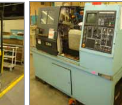
WARNER SWASEY QCM-6 CNC LATHE