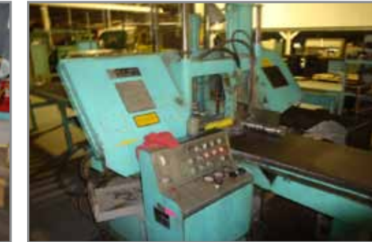
WELLS AUTOMATIC HORIZONTAL BAND SAW