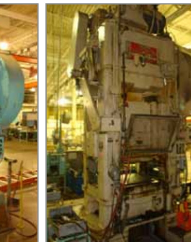
PRECISION FLEX O PRESS