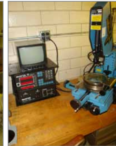
MICRO VU INSPECTION SYSTEM