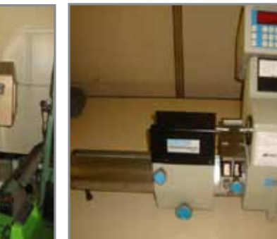
PRATT AND WHITNEY SUPER MIC