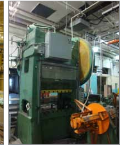
(1 OF 10) FLEX O PRESSES