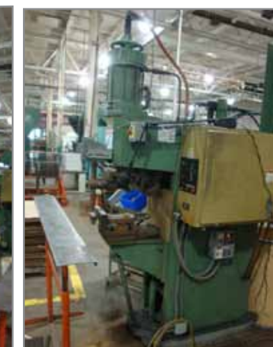
(1 OF 5) SPOT WELDERS