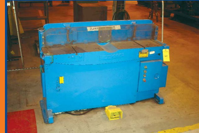
WYSONG 52 INCH SHEAR