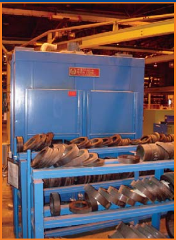
1993 WISCONSIN BATCH OVEN