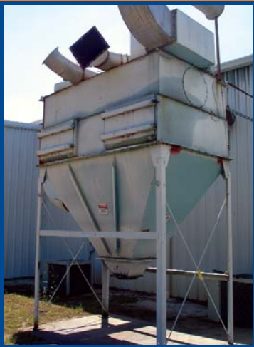
16 ROW TORIT DUST COLLECTOR