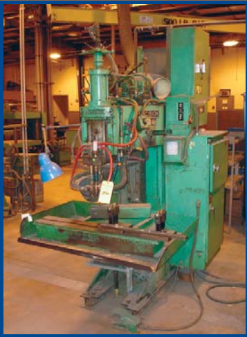
(1) OF (2) PRECISION WELDERS