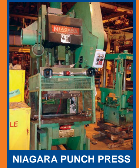
NIAGARA PUNCH PRESS

Preview Inspection: Wednesday, May 10th • 9:00 A.M. - 5:00 P.M.