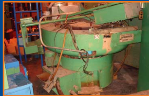
ROTO-FINISH DEBURRING MACHINE

Baggett Road to Napier Field to 231 South Follow to Ross Clark Circle Go Right to Hodgesville Road (Approx. 10 Miles) FOLLOW AUCTION SIGNS!!