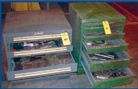
SM. QTY. OF TOOLS & TOOLING