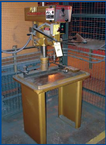
POWERMATIC VARIABLE SPEED DRILL PRESS