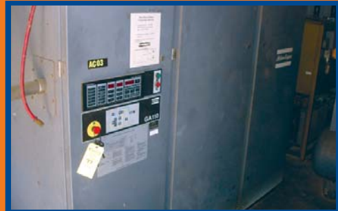
1994 ATLAS COPCO 150 HP ROTARY AIR COMPRESSOR