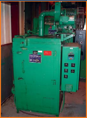
(1) OF (2) YOUNG BROS. ELECTRIC OVENS