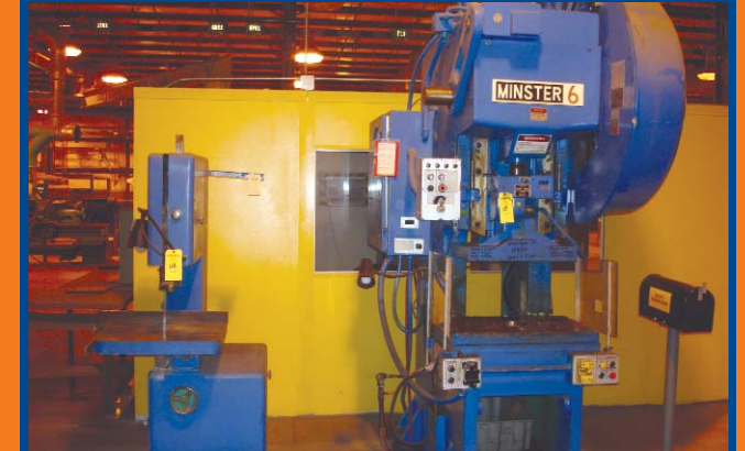
MINSTER 60 TON PUNCH PRESS & POWERMATIC VERTICAL BAND SAW