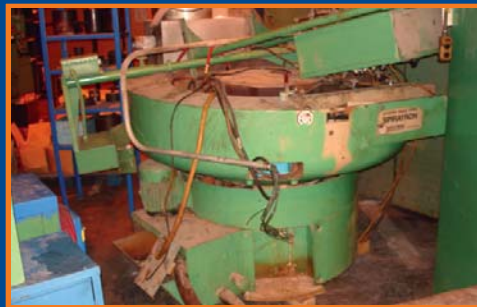
ROTO-FINISH DEBURRING MACHINE

Baggett Road to Napier Field to 231 South Follow to Ross Clark Circle Go Right to Hodgesville Road (Approx. 10 Miles) FOLLOW AUCTION SIGNS!!