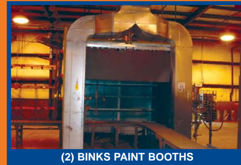
(2) BINKS PAINT BOOTHS