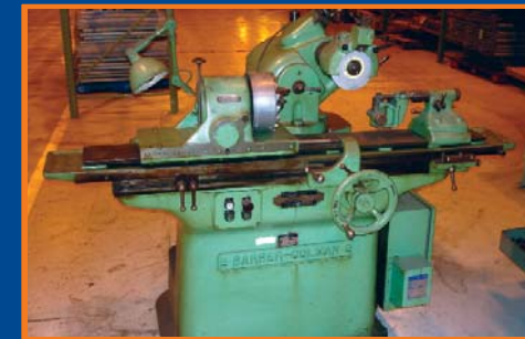
BARBER-COLEMAN HOB SHARPENER