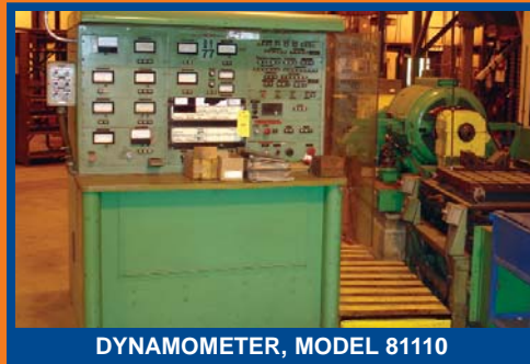
DYNAMOMETER, MODEL 81110