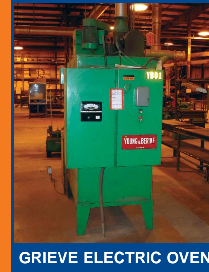
GRIEVE ELECTRIC OVEN