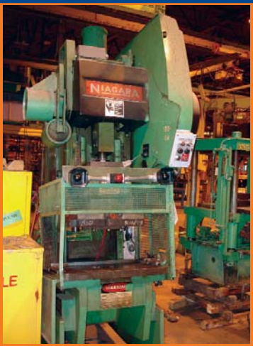
(2) NIAGARA PUNCH PRESSES

OFF-SITE ITEMS WILL BE AVAILABLE FOR PREVIEW & INSPECTION ONE DAY PRIOR TO AUCTION. THESE ITEMS WILL BE SOLD LIVE VIA A PROJECTION SCREEN & THROUGH WWW.BIDSPOTTER.COM.