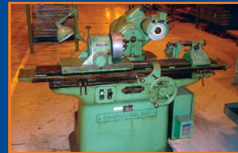
BARBER-COLEMAN HOB SHARPENER