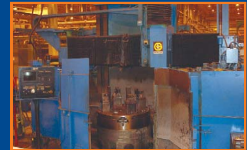
1985 G & L 48 INCH VERTICAL TURRET LATHE