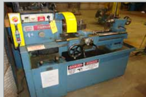
SOUTH BEND GAP BED LATHE