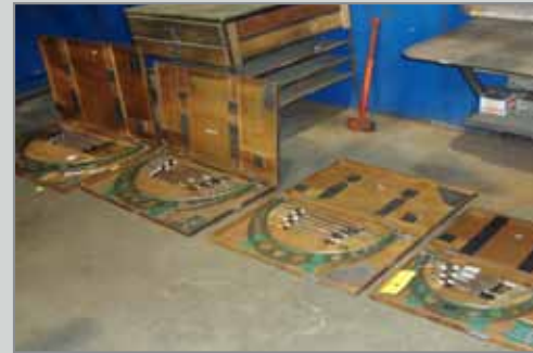
MICROMETERS RANGING FROM 1" TO 36"