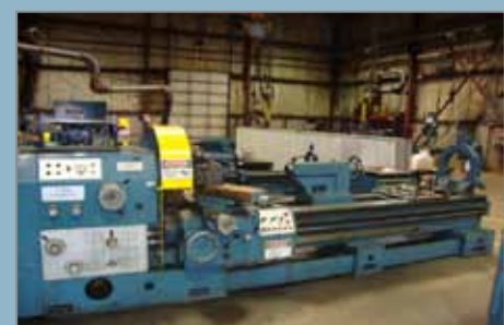
PBR T-400 GAP BED LATHE

EQUIPMENT LOCATION #2: 2033 Dugald Road, Winnipeg, MB