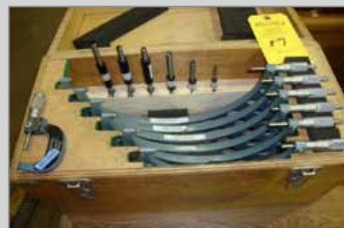
QUALITY CONTROL EQUIPMENT

PREVIEW INSPECTION: Tuesday & Wednesday June 7th & 8th from 10AM - 3PM (ADT)