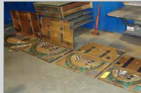
MICROMETERS RANGING FROM 1" TO 36"