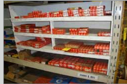
HUNDREDS OF FAG BEARINGS