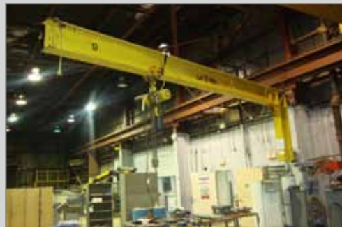
(10) 2 TON JIB CRANES