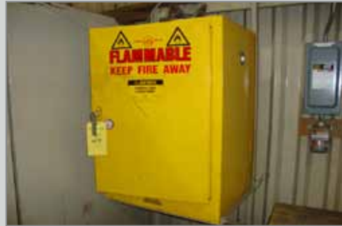
FLAMMABLE STORAGE CABINETS