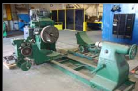
PEERLESS BANDING MACHINE