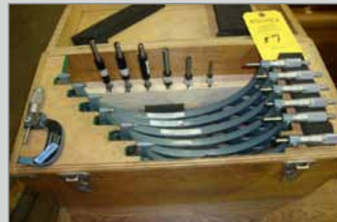
QUALITY CONTROL EQUIPMENT

PREVIEW INSPECTION: Tuesday & Wednesday June 7th & 8th from 10AM - 3PM (ADT)