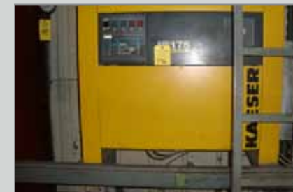
KAESER KRD 175 AIR DRYER