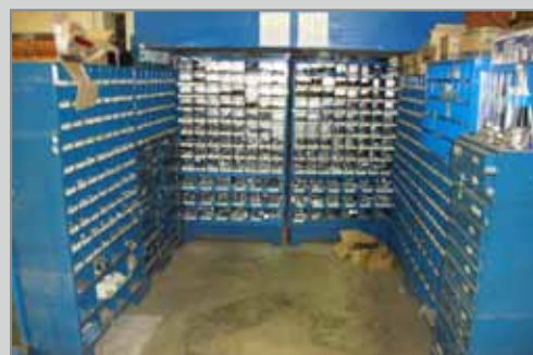
STORAGE UNITS FULL OF HARDWARE