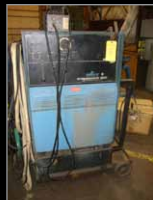
MILLER ARC WELDER