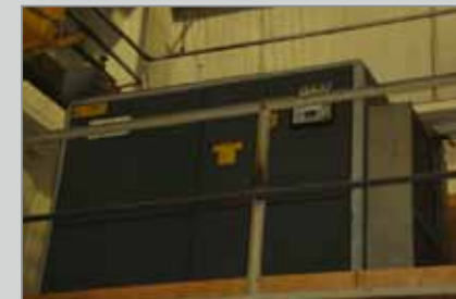
ATLAS COPCO GA37