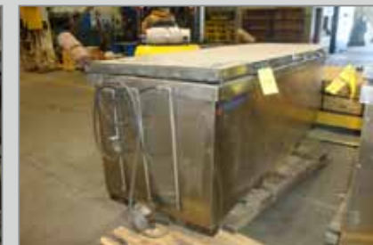
STAINLESS STEEL PARTS WASHER