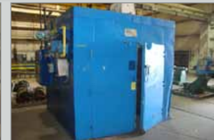
DRY THERM BATCH OVEN