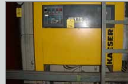
KAESER KRD 175 AIR DRYER