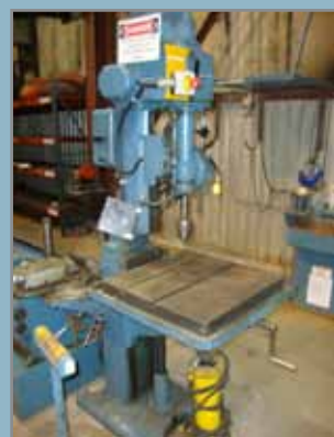
HERBERT DRILL PRESS