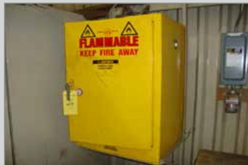
FLAMMABLE STORAGE CABINETS