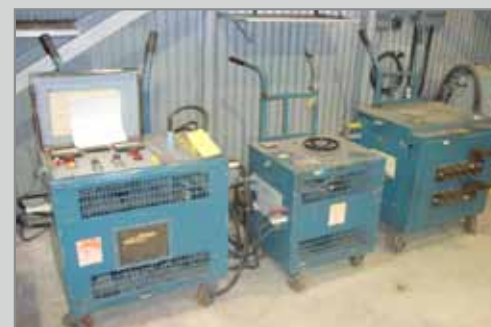
HIGH CURRENT TEST SETS