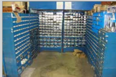
STORAGE UNITS FULL OF HARDWARE