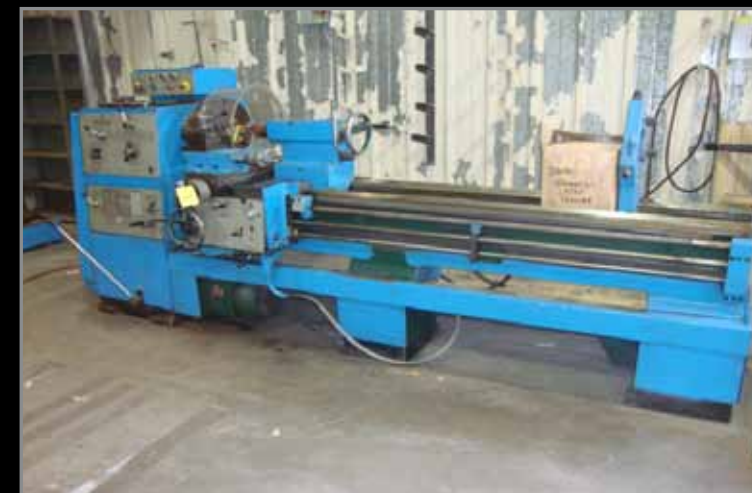
108' GAP BED LATHE

PREVIEW INSPECTION: Tues. & Wed., June 7th & 8th 10AM - 3PM (ADT)