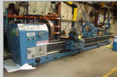
PBR T-600 GAP BED LATHE