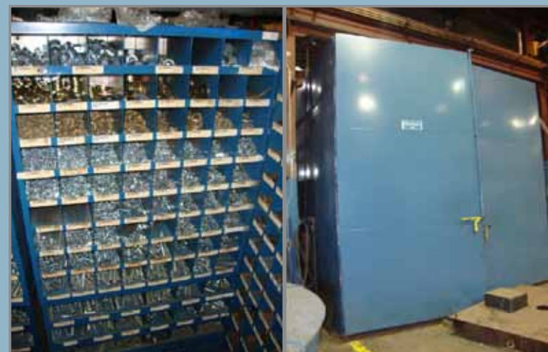
HARDWARE INVENTORY MULTIPLE BAKE OVENS