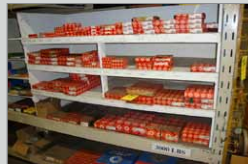
HUNDREDS OF FAG BEARINGS