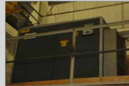
ATLAS COPCO GA37