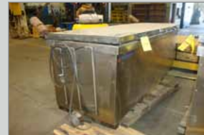
STAINLESS STEEL PARTS WASHER