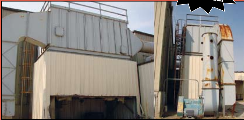
ETA Dust Collector (front and side views)