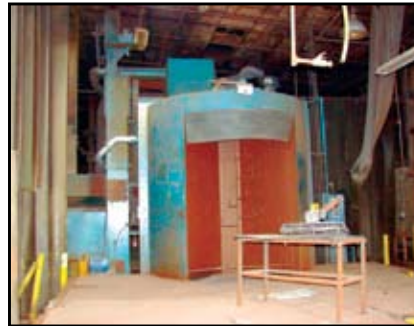
BRONCO Spinner Hanger Blast Machine