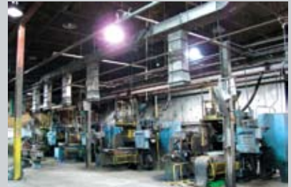
SHALCO Mdl 4101E's Cold Box Core Blow Blowers