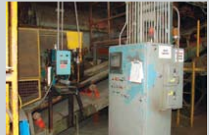
HARTLEY Model 17PC Bond Diereminator