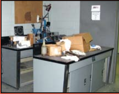
Lab Equipment & BUEHLER Furniture