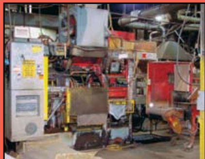
HUNTER HMP20E Auto. Mold Machine

(off Hunter Lines) GK Model SC30x73 Mold Conv. (under Hunters), GK Model SCRT Spiral Conv., 120', S/N C8231.1, W/Cooling Blower, New '98, GK Model VD84.28 Vibradrum, S/N C8231.3, New '98, GK Model SCR 42/54x 8/29 MoldDump Conveyor, S/N C8231.4, New '98