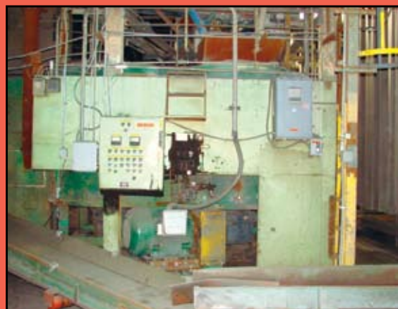
SIMPSON Model 22G Multimull