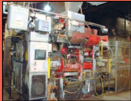
HUNTER Model HMP20C Auto. Mold Machine