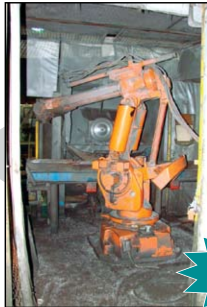
Process Work Cell With ABB Robot & Circular Saw (2 Available)

(3)Shaker Type Dust Collectors, Approx. 2500 CFM Ea.