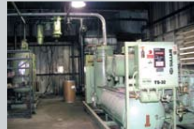
SULLIAR 400 HP Rotary Screw Air Compressor