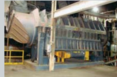
GK VIBRADRUM Model VD84.28, New 1998

Preview Inspection: Wednesday, December 3 rd • 9 a.m.-5 p.m.