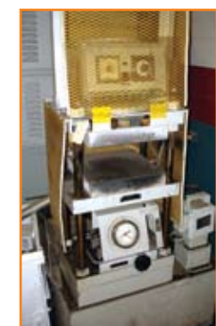
CLIFTON STANDARD 4-POST LAB PRESS

CLIFTON Standard 4-Post Lab Press, Model 30H, Heated Platen, 30 Ton Max. Capacity, 14" x 14" Platen, 6" Max. Stroke, S/N 042