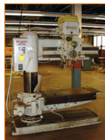
FOSDICK 'SENSITIVE' RADIAL ARM DRILL

FOSDICK 'Sensitive' Radial Arm Drill, 4' Arm x 12" Column, 24" x 48" Tilting Table, 5 HP, S/N 21277