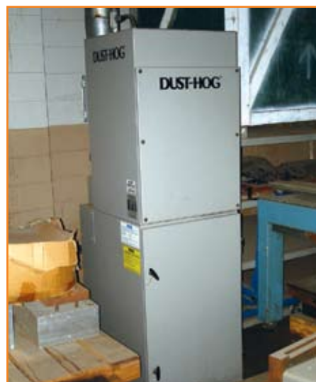
DUST HOG DUST COLLECTOR