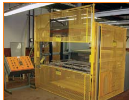
1996 AAA PLASTICS VACUUM FORM MACHINE

ALLEN 2-Head Drilling Machine, 21.5" x 36" Table Size, w/(2) 1 HP Motors, Foot Pedal Controls