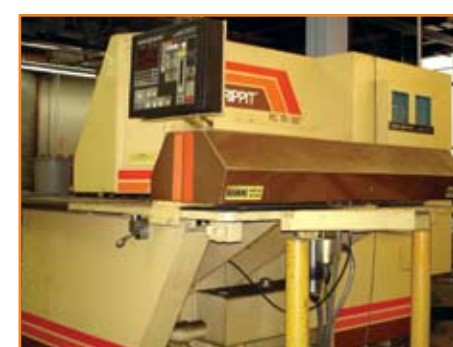
HOUDAILLE STRIPPIT 75/30 TURRENT PUNCH