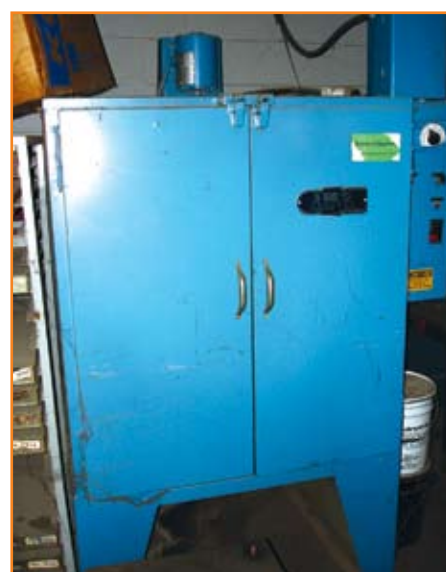
IMS CURING OVEN