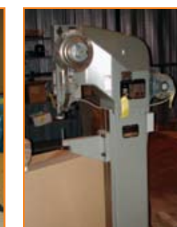
NATIONAL RIVET MACHINE