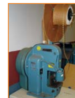
AMP-O-LECTRIC TERMINAL MACHINES