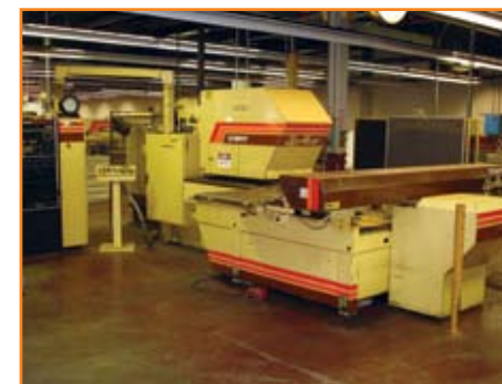
1981 HOUDAILLE STRIPPIT CNC LASER CENTER TURRENT PUNCH