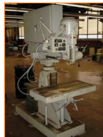
JOHANSSON DRILLING MACHINE

JOHANSSON Radial Arm Drilling Machine, 17" x 36" Table Size, 1800 RPM, S/N 22837