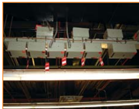
100'+ GE 400 AMP, 3-PHASE, BUSS DUCT