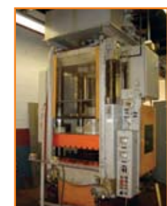
ROGERS 400 TON 4-POST DOWNACTING HYDRAULIC PRESS

ROGERS 400 Ton 4-Post Downacting Hydraulic Platen Press, Single Ram, Air Cushion, 40" x 40" Bolster, 40.5" L-R, 23" F-B BTTB, M-MD400-4040B-7E