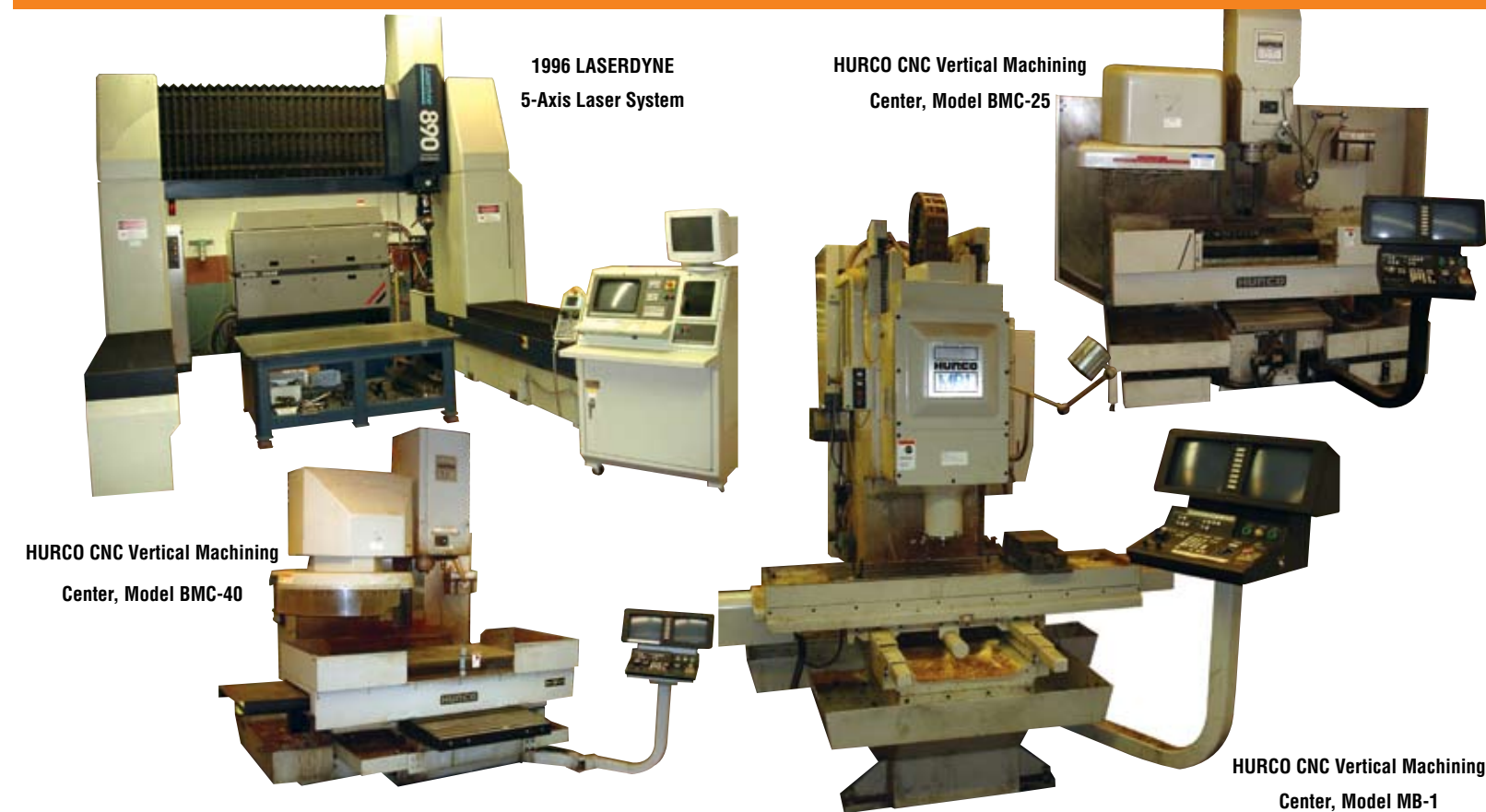
1996 LASERDYNE 5-Axis Laser System

SALE LOCATION:APPLIANCE PARK, LOUISVILLE, KY