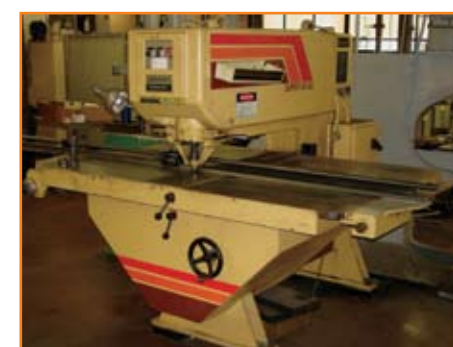
HOUDAILLE STRIPPIT FABRICATOR SUPER 30/30 TURRENT PUNCH