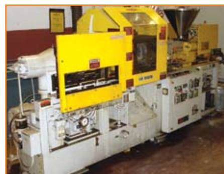
1979 TOSHIBA HORIZONTAL INJECTION PRESS