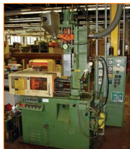
NEWBURY 25 TON VERTICAL INJECTION MOLDER PRESS