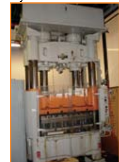
ROGERS 1000 TON 4-POST DOWNACTING HYDRAULIC PRESS

ROGERS 1000 Ton 4-Post Downacting Hydraulic Platen Press, Dual Ram