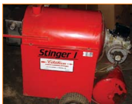
STINGER HOT PLATER PRESSURE WASHER