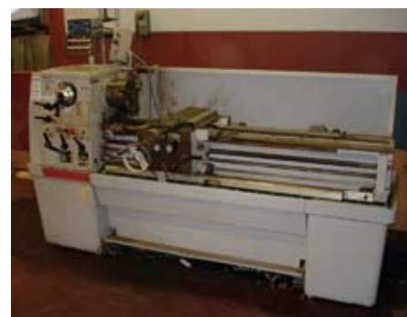
CLAUSING COLCHESTER LATHE

ALLEN 3-Head Drilling Machine, w/ (1) Tapping Head, 5 HP, 21" x 46"