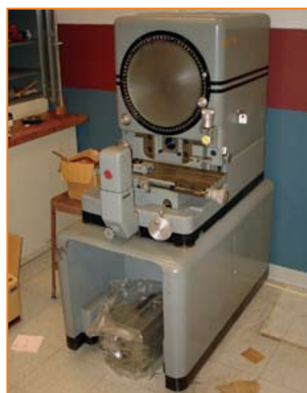
KODAK 14" OPTICAL COMPARATOR