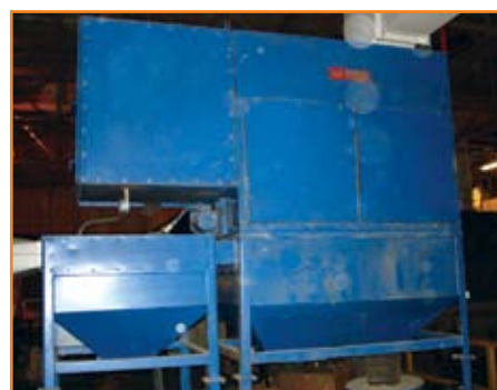
1984 ARRESTALL SELF CONTAINED DUST COLLECTOR

Lg. Qty. Of Office Equipment & Furnishings (I.E. Desks, Bookshelves/Cases, File Cabinets, Display Cases, Office Partitions, Swivel Chairs, Floor Mats, Tables, Conference Tables, Whiteboards, Etc.)