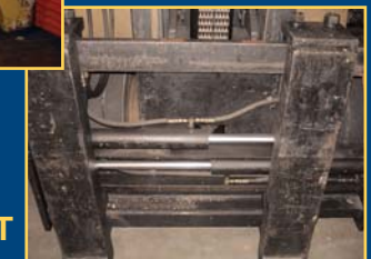
SIDE SHIFT ATTACHMENT

Model FKS13, 30,000# Capacity, FP-SS Side Shift Attachment, Hard Tire, Dbl. LP Tank, R.O.P.S., S/N 69811