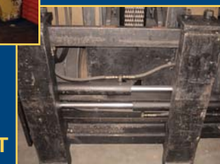
SIDE SHIFT ATTACHMENT

Model FKS13, 30,000# Capacity, FP-SS Side Shift Attachment, Hard Tire, Dbl. LP Tank, R.O.P.S., S/N 69811