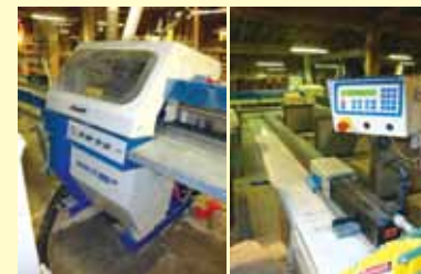
LH PIC: 2005 OMGA CNC UP-CUT CHOP SAW RH PIC: (1 OF 3) 2007 OMGAGI CNC PUSH PULL FEEDERS