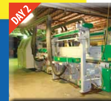
2001 FLETCHER CNC DBL END TENONER

Sale Location: 505 Fulton St., Berne, IN 46711 Preview Inspection: Tuesday, April 28th - 9:00 a.m. - 5:00 p.m.