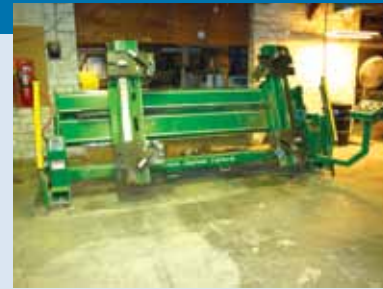
1998 CARLSON DOOR PINNING MACHINE