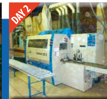
2002 WEINING UNIMAT 23E CNC MOLDER