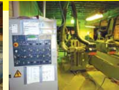
(1998) SCMI CNC DBL END TENONER