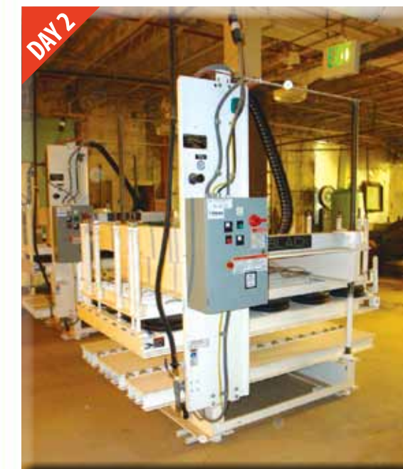
(1 OF 3) 2007 BLACK BROTHERS COLD PRESSES