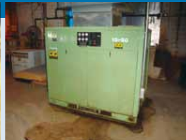
SULLAIR 50HP ROTARY SCREW AIR COMPRESSOR