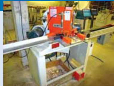
PISTORIUS DBL MITER SAW W/ CNC FEED