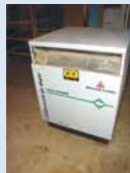
LH PIC: DOMNICK HUNTER ECO-SMART AIR DRYER RH PIC: EXTREMA LIMITED EDITION INLINE RIPSAW