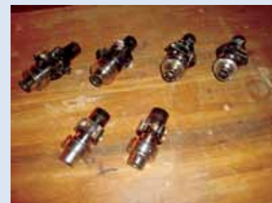
QUICK CHANGE TOOLING