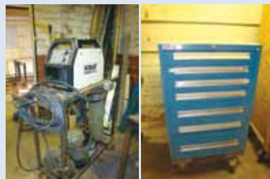
LH PIC: HOBART WIRE WELDER RH PIC: LYON ROLL AROUND PARTS CABINET