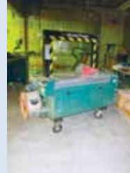
LH PIC: SIGNODE AUTOMATIC STRAPPING MACHINE RH PIC: 1985 DELTECH AIR DRYER

Sale Date: THURSDAY, APRIL 30th • Beginning @ 10:00 a.m. Preview Inspection: TUESDAY, APRIL 28th • 9:00 a.m. - 5:00 p.m.