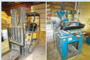
LH PIC: CATERPILLAR 5,000 LB, LP FORK TRUCK RH PIC: NIELSEN TOOL GRINDER