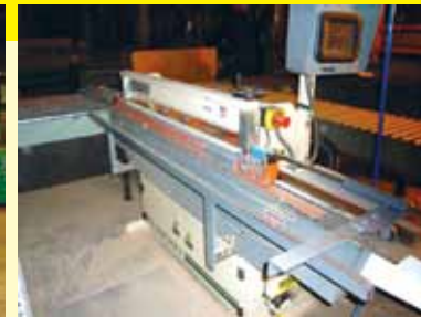
(1 OF 2) 2004 VOORWOOD EDGE SHAPER & SANDING MACHINES