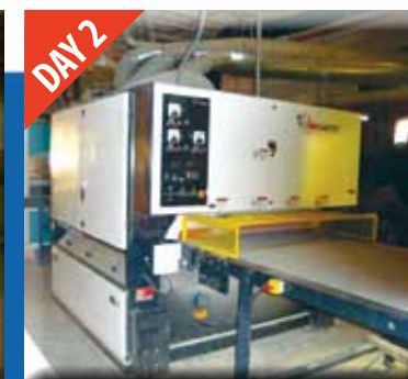
2008 TIMESAVER SERIES 3000 CNC 3 HEAD ORBITAL SANDER 52"