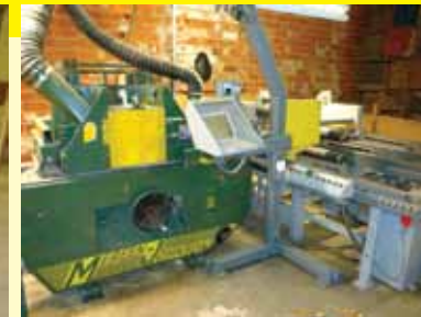
1999 MEREEN-JOHNSON STRAIGHTLINE MULTIPLE RIP SAW W/ TAYLOR OPTIMIZER