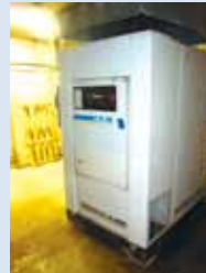
LH PIC: INGERSOLL RAND 50HP ROTARY SCREW AIR COMPRESSOR RH PIC: KO LEE UNIVERSAL TOOL CUTTER GRINDER