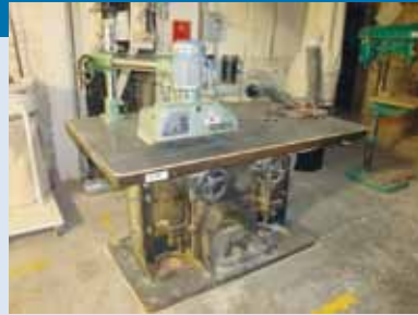
(1 OF 2) BAXTER HF DBL SPINDLE SHAPER