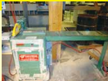
PISTORIUS UP-CUT CHOP SAW