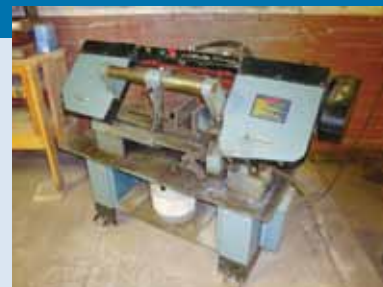
DELTA HORIZONTAL BAND SAW