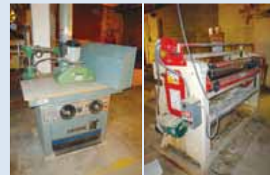
LH PIC: 1999 INVICTA SINGLE SPINDLE SHAPER WITH POWER FEED RH PIC: BLACK BROTHERS 5' DBL. ROLL GLUE APPLICATOR