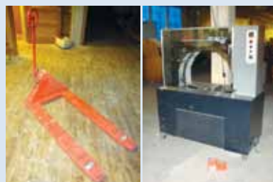
LH PIC: VARIOUS PALLET TRUCKS AND HANDCARTS RH PIC: 2004 FELINS STRETCH FILM BUNDLER