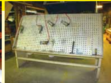
(1 OF 4) 2002 RITTER SLANT CLAMP TABLES