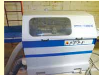
2004 OMGA 2010 CNC UP-CUT CHOP SAW