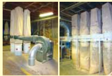
LH PIC: OVER 25 REES-MEMPHIS, NORTHTECH, JET AND DUSTEK 2, 4 AND 6 BAG RH PIC: (1 OF 2) DUSTEK 4 BAG WHISPURR DUST COLLECTORS