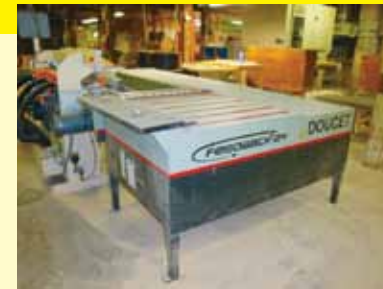
(1 OF OVER 5) DOUCET POWER RETURNS