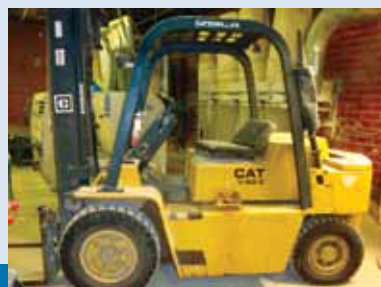
CATERPILLAR 9,000 LB DIESEL INDOOR, OUTDOOR FORK TRUCK