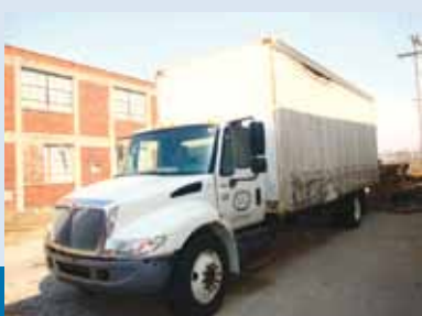
2003 INTERNATIONAL CURTAIN SIDE BOX VAN