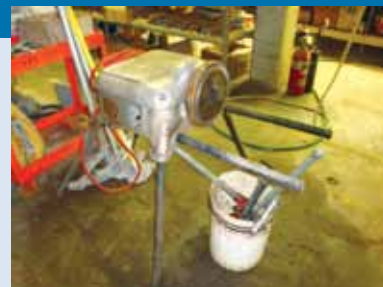
RIDGID 400A POWER THREADER