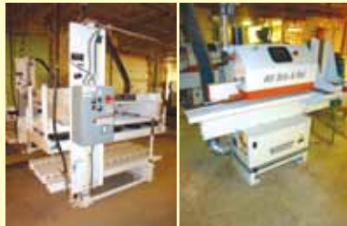
LH PIC: (1 OF 2) 2007 BLACK BROTHERS 3X7 COLD PRESS RH PIC: (1 OF 2) 2007 VOORWOOD A15 STILE AND RAIL MACHINES