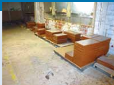
VARIOUS FINISHED IN PROCESS CABINET DOORS & PANELS

RIDGID Power Pipe Threader, Model 400A, w/Tooling & Dies