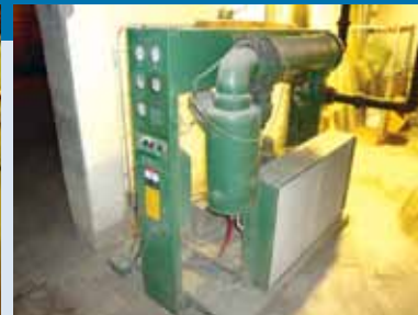
PURE-AIRE AIR DRYER