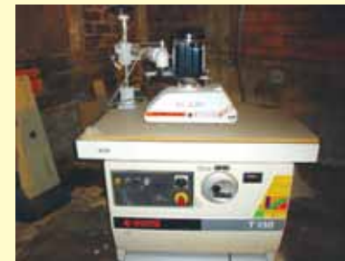
2003 SCMI DBL. SPINDLE PROFILE SHAPER