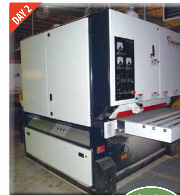
2008 TIMESAVER 3000 SERIES CNC 52" 3 HEAD WIDE BELT SANDER