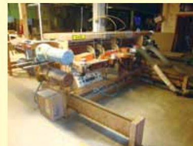
1985 VOORWOOD FOIL LAMINATOR

(5) 2004 REES-MEMPHIS 4-Bag 15 HP Dust Collectors, Model CX1530-4, S/N's 04-13246-2728, 04-13685-2689, 04-13164-2721, 04-13164-2722, 04-13164-2729