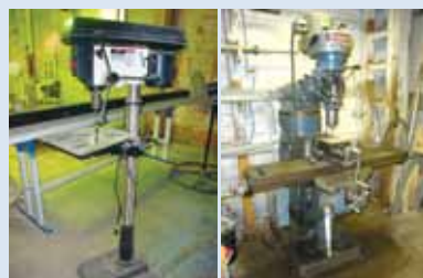
LH PIC: (1 OF 3) JET 15 & 17" DRILL PRESSES RH PIC: BRIDGEPORT VERTICAL MILLING MACHINE