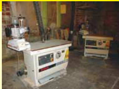
(2) SCMI T-130 SHAPERS W/ POWERFEEDS