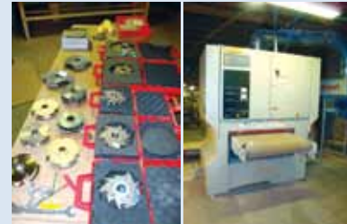
LH PIC: LG. QTY. OF PROFILE, DIAMOND, INSERT & CARBIDE TIPPED TOOLING RH PIC: TIMESAVER PLANER SANDER 36 INCH