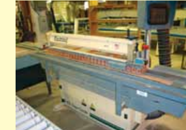
2003 VOORWOOD A125 SHAPER SANDER