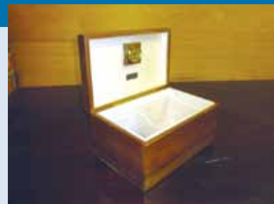
HUGE QTY. OF FINISHED PRODUCT INVENTORY