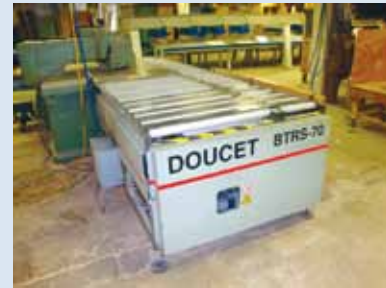
DOUCET BTRS-70 POWER RETURN

Live Internet Bidding BidSpotter.com ® www.bidspotter.com to register