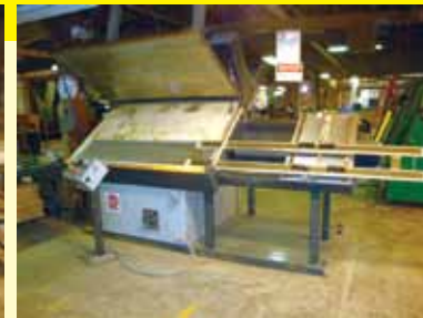
(1 OF 2) 2004 ROSENQUIST RF DOOR ASSEMBLY PRESSES