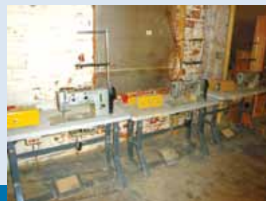
(3) DURKOPP ALDER SEWING MACHINES