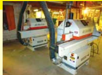
(2) 2007 VOORWOOD A15 STILE & RAIL MACHINES