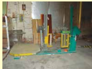
SIGNODE AND ITW PALLET WRAPPING MACHINES