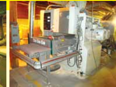
1999 TIMESAVER 200 2-HEAD BOTTOM SANDER