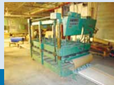
TYLER POWER POD COLD PRESS

Sale Date: THURSDAY, APRIL 30th • Beginning @ 10:00 a.m. Preview Inspection: TUESDAY, APRIL 28th • 9:00 a.m. - 5:00 p.m.