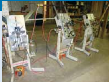
(3) PISTORIUS V-NAIL MACHINES