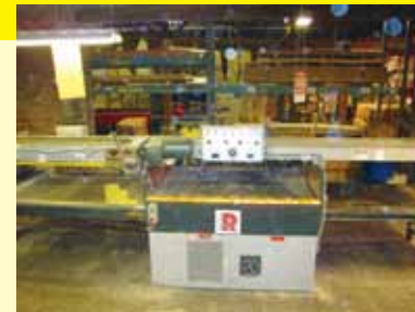
(1 OF 2) 1995 ROSENQUIST RF PANEL GLUING MACHINES