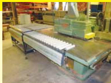
MATTISON 404 INLINE RIP SAW WITH POWER RETURN

USMC Clicker Press, Model B, S/N 4167-305