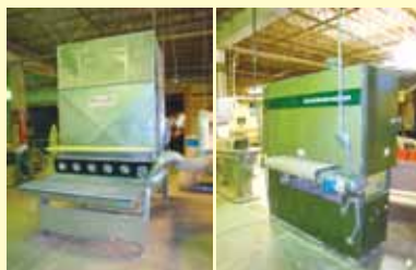
LH PIC: (1 OF 2) HONEYWELL SELF-CONTAINED SANDING STATIONS RH PIC: 1994 SANDING MASTER WIDE BELT SANDER