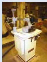
LH PIC: (1 OF 2) JET SINGLE SPINDLE SHAPERS WITH DELTA POWER FEEDS RH PIC: 2007 GRIGGIO PNEUMATIC LOUVER GROOVER