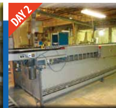
2004 CAMERON OPTI-MATCH OPTIMIZER