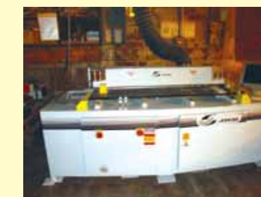
2005 JENKINS CNC DBL SPINDLE DOOR MACHINE

GENEROUS REFERRAL FEES! Please ask a Charleston Auctions Representative for more details.