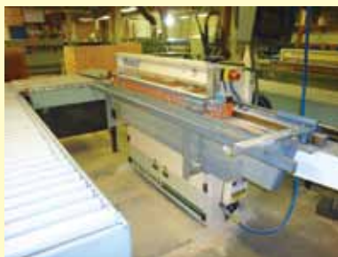
2004 VOORWOOD A525 SHAPER/SANDER

2007 Complete DEIMCO Automated Finish Line, S/N 1882, UL S/N BL331291, Solvents Used – NAPHTHA, Solvents Volatiles Entering Ovens – 6.2 Gal./Hr., Purging Intervals – 3.5 Min., Oven Temperature – 200 Degrees F, Power Reqs. – 460 Vac/3 Phase/60 HZ/125 Amp, System Full Load Amps – 96.7, ALLEN BRADLEY Panel View 550 Controls, Capacity 10' per Min., 2000 Perts/Shift, Consists of (2) Horseshoe Conveyors, (1) Spray Booth, (3) IR Ovens, (1) Dri-Quik Ostrich Feather Brush System, Less Than 4,000 Hrs.