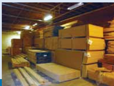
VARIOUS MAPLE, POPLAR, OAK, CEDAR HARDWOODS, LUMBER & PLYWOOD

BRIDGEPORT Vertical Milling Machine, 1 HP, 9" x 42" T-Slot Table, S/N BR96084