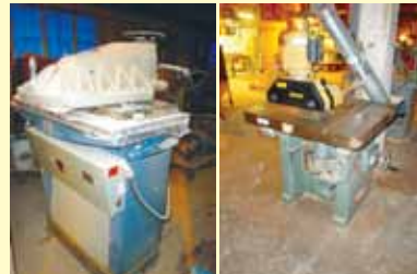
LH PIC: USMC CLICKER PRESS RH PIC: WADKIN SINGLE SPINDLE SHAPER WITH POWERFEED