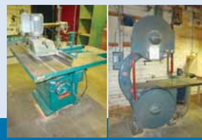
LH PIC: OLIVER TABLE SAW WITH POWERFEED RH PIC: TANNEWITZ 36 INCH VERTICAL BANDSAW

Lg. Qty. Of Roller, Skate & Power Conveyor, Various Lengths, Widths, Types & Manufacturers