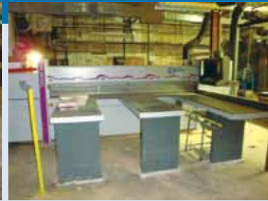
2002 HOLZMA CNC 10' PANELSAW