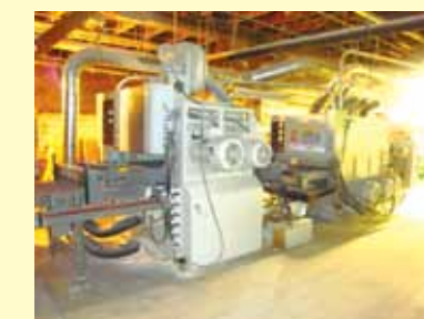
COMPLETE 1999 TIMESAVER SANDING LINE