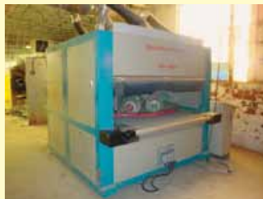
(1 OF 2) 2004 QUICKWOOD SEAL SANDING SYSTEMS