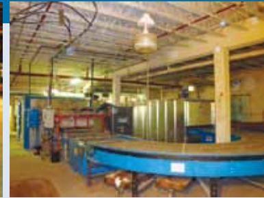
(COMPLETE) 2007 DEIMCO AUTOMATED FINISHING LINE