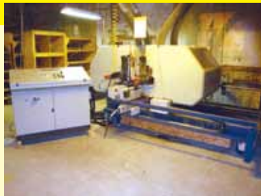
(1 OF 2) 2004 FRIULMAC TENONERS