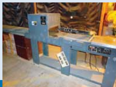
HEAT SEAL SHRINK PACKAGING SYSTEM