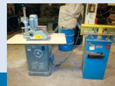
VARIOUS SHAPERS GRINDERS & TEMPLATE CUTTERS