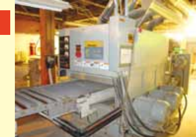
1999 TIMESAVER 2003 HEAD 36" TOP HEAD SANDER W/ TRANSFER CONVEYOR HEAD

2004 VOORWOOD Profile Shaper/Sander Edge Machine, Model A525BT, S/N 2304, w/Digital Readout, Dual Floating Heads & Sanders, Variable Speed, Doucet Power Return, Model FB-24-3-11-G, S/N 7004-09-022, (2,176 Hrs.)