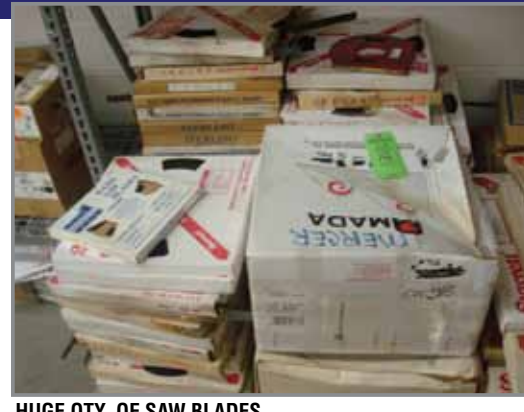
HUGE QTY. OF SAW BLADES