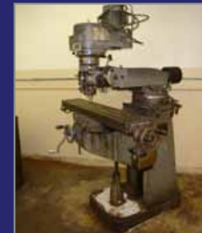
SUPERMAX VERTICAL MILLING MACHINE

Live Internet Bidding BidSpotter.com www.CharlestonAuctions.com to register