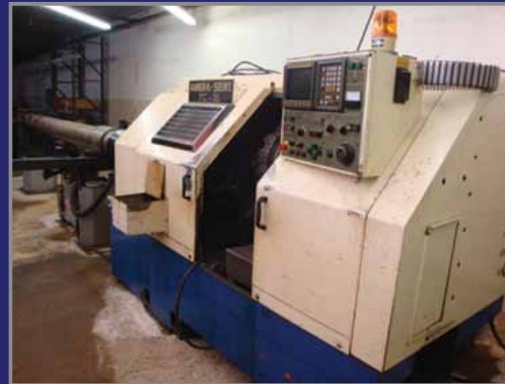
1993 AMERA SEIKI TC-3L CNC LATHE

PREVIEW INSPECTION: Monday, June 7 th from 10:00 AM - 4:00 PM Eastern