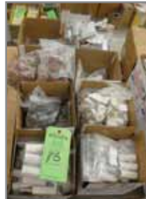
ABRASIVES & GRINDING