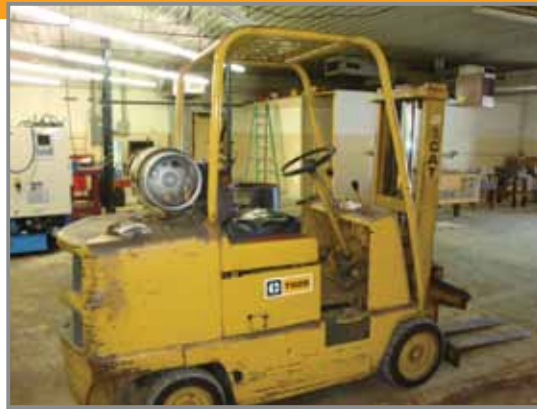
CAT 6,000 LB. LP FORK TRUCK