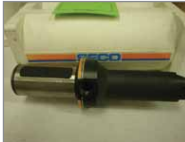
VARIOUS Senco TOOL HOLDERS