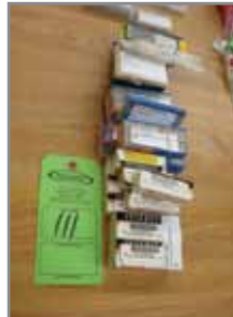
LG. QTY. OF CARBIDE INSERTS