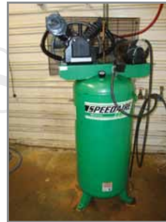
SPEED AIRE 5 HP VERTICAL AIR COMPRESSOR