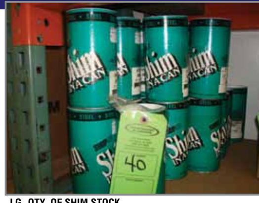
LG. QTY. OF SHIM STOCK