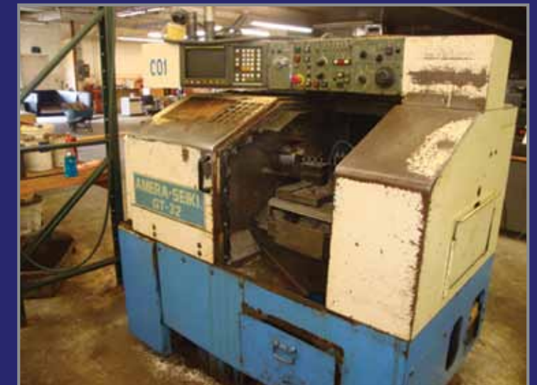
1996 AMERA SEIKI GT-32 CNC LATHE