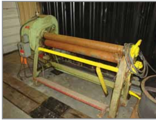
LOWE POWER ROLLS