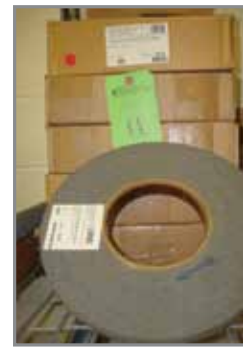
VARIOUS ABRASIVES & GRINDING WHEELS