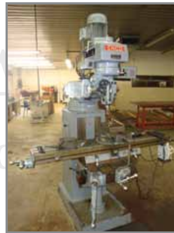
ENCO VERTICAL MILLING MACHINE