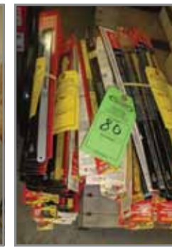
VARIOUS BAND SAW BLADES