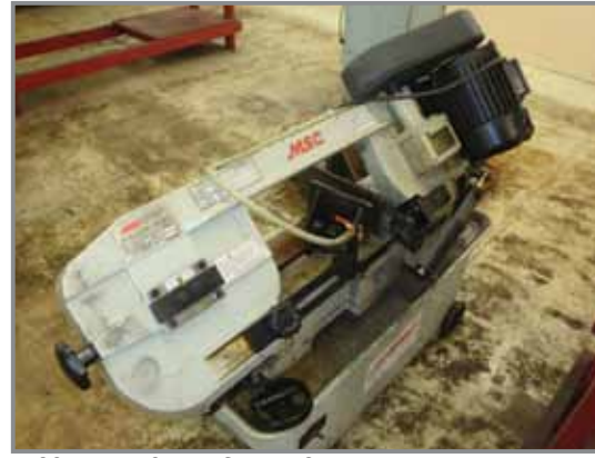
MISC. METAL CUTTING BAND SAW