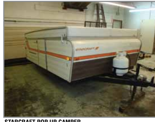
STARCRAFT POP UP CAMPER