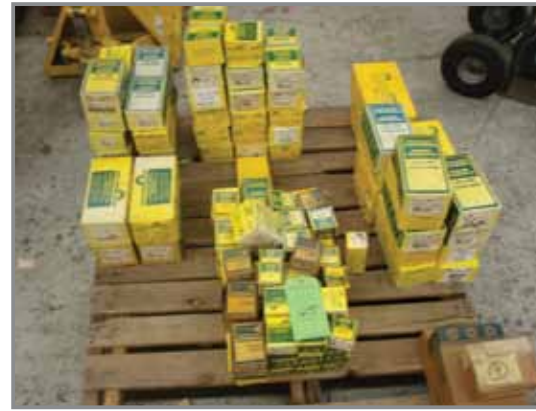
HUGE QTY. OF NUTS & BOLTS HARDWARE