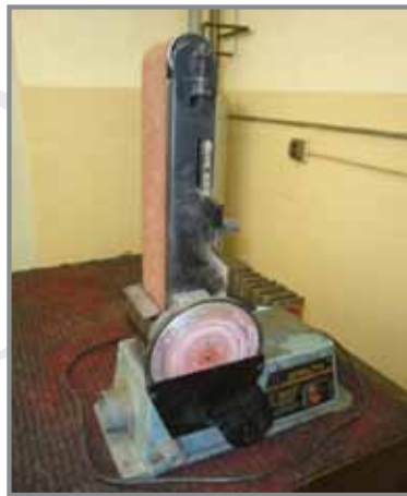
DELTA UNIVERSAL SANDING MACHINE