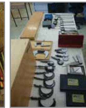
VARIOUS QC AND INSPECTION EQUIPMENT