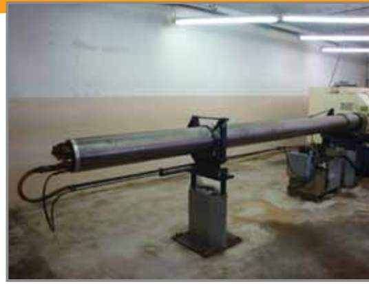
LNS HYDRO BAR FEEDER