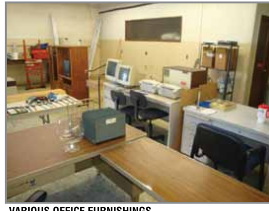
VARIOUS OFFICE FURNISHINGS