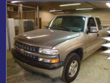
1999 CHEVY 1500 PICK UP TRUCK