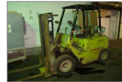
CLARK 5,000 LB LP FORK LIFT TRUCK