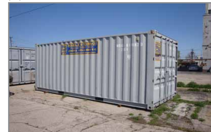
(2) STEEL SHIPPING CONTAINERS