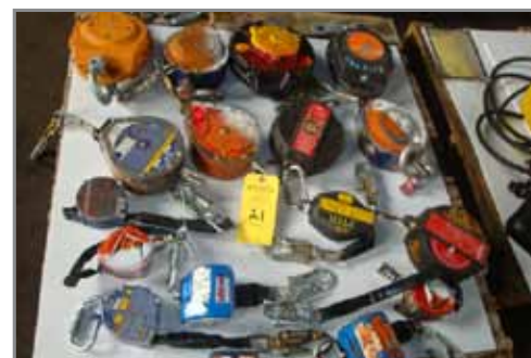
LG QTY OF RETRACTABLE LANYARDS