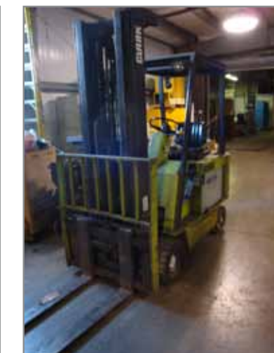
CLARK 4,000 LB FORK LIFT TRUCK