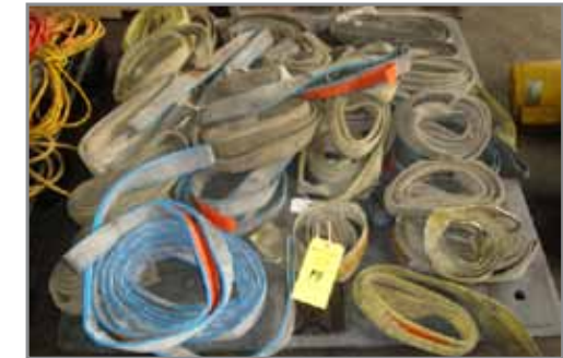
LG QTY OF RIGGING STRAPS