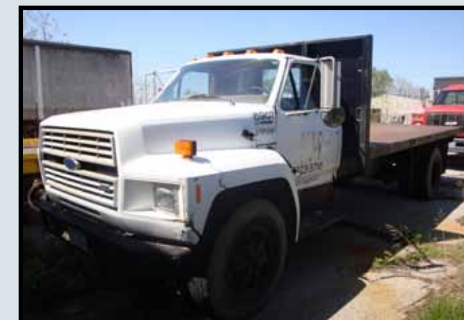
1989 FORD F-700 FLAT BED DUMP TRUCK

AUCTION LOCATION: 359 Hamilton Street, Toledo, OH 43604