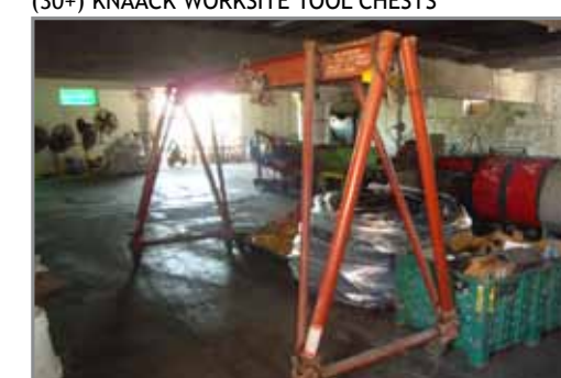
ROLLING A-FRAME GANTRY WITH HOIST