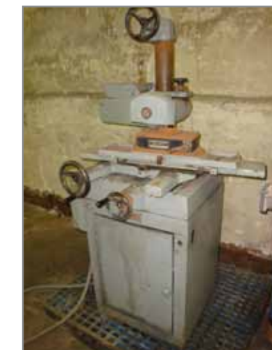
BROWN AND SHARPE SURFACE GRINDER