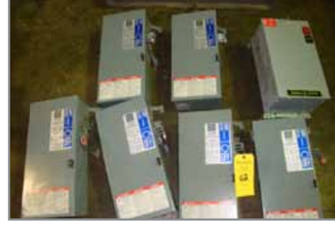
LG QTY OF SWITCHES