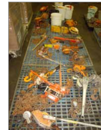
(50+) CHAIN COME-A-LONGS