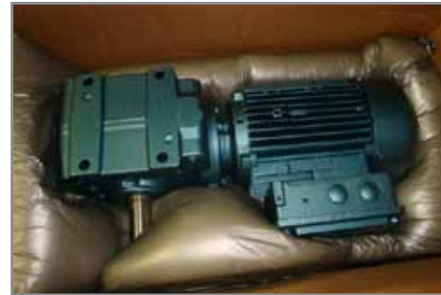
LG QTY OF MOTORS