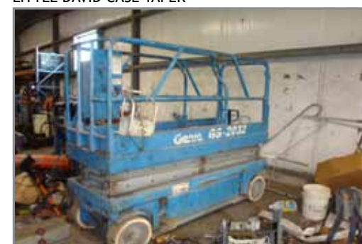
GENIE GS-2032 SCISSOR LIFT