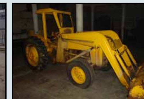
MASSEY FERGUSON FRONT LOADER