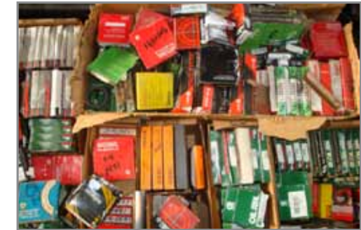
THOUSANDS OF BEARINGS