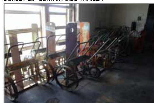
(20+) TORCH CARTS