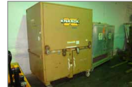
(30+) KNAACK WORKSITE TOOL CHESTS