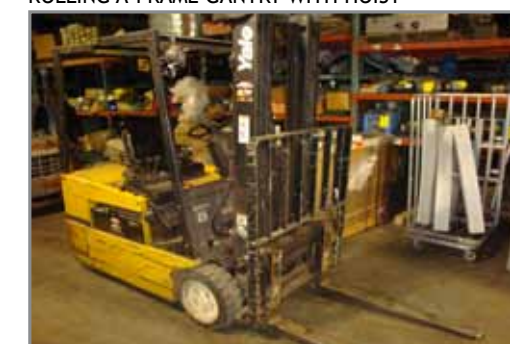
YALE 3,500 LB ELECTRIC FORK LIFT TRUCK