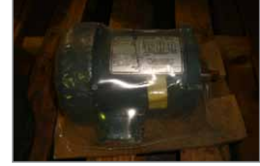
LG QTY OF MOTORS