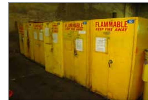
(30+) FLAMMABLE STORAGE CABINETS