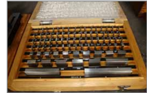
LG QTY OF QC EQUIPMENT