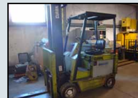
CLARK 4,000 LB ELECTRIC FORK LIFT