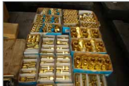
LG QTY OF BRASS FITTINGS

Tuesday, June 21st at 10AM - Thursday, June 23rd at 12PM