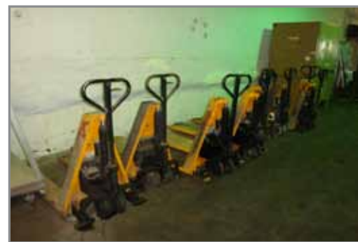
8) LIFT-RITE ELECTRIC PALLET JACKS