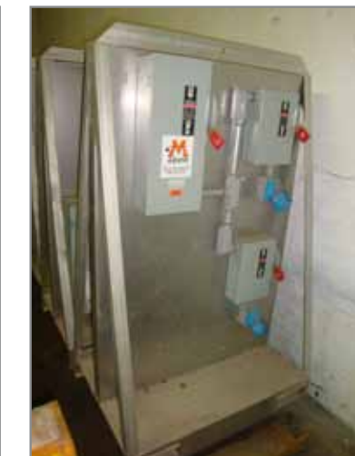
(10) CIRCUIT BREAKER CARTS