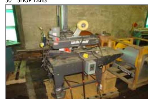
LITTLE DAVID CASE TAPER