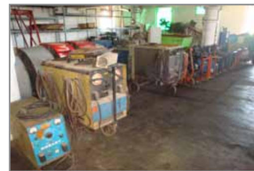
(20+) VARIOUS WELDERS