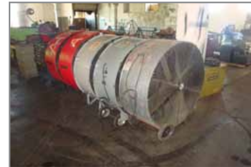
50" SHOP FANS