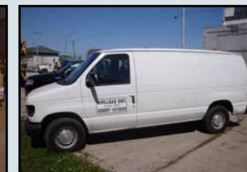
2002 FORD E-150 CARGO VAN