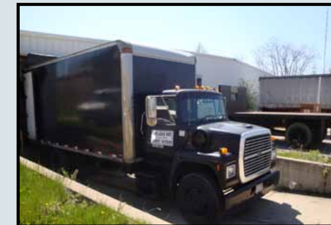
1996 FORD BOX TRUCK