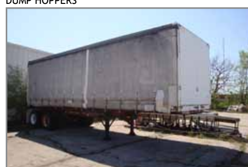
DORSEY 28' CURTAIN-SIDE TRAILER