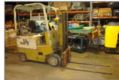
YALE 1,000 LB FORK LIFT TRUCK