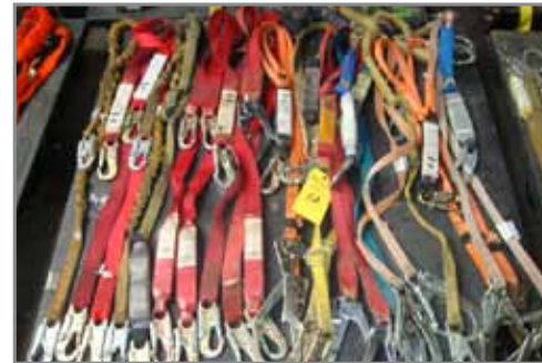
LG QTY OF SAFETY LANYARDS

DRIVING DIRECTIONS FROM: INTERSTATE 75 1. Take exit 201A toward OH-25 S/Collingwood Ave 0.1 mi 2. Merge onto Logan St 0.1 mi 3. Turn left onto Collingwood Blvd 0.4 mi 4. Take the 1st right onto Hamilton St 5. The auction site will be on the right LOOK FOR AUCTION SIGNS!