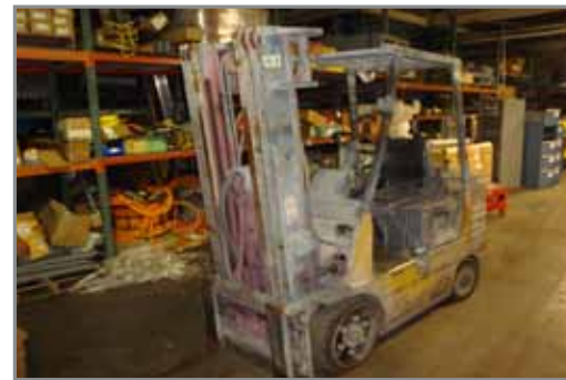
CAT 5000 LB FORK LIFT TRUCK