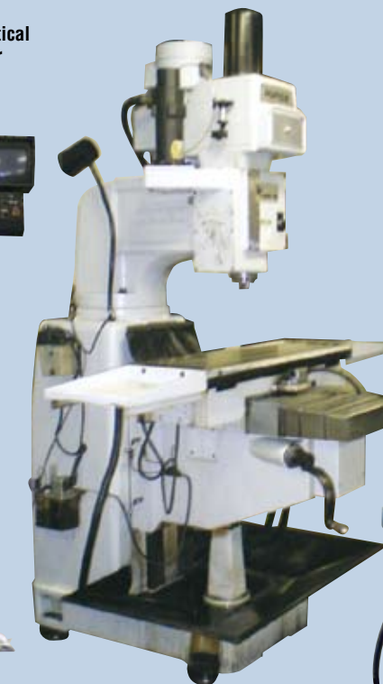
HURCO CNC HAWK 5 Vertical Milling Machine