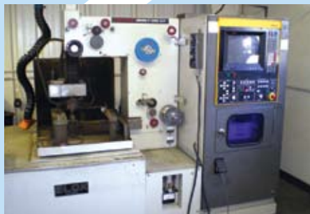
ELOX Wire EDM