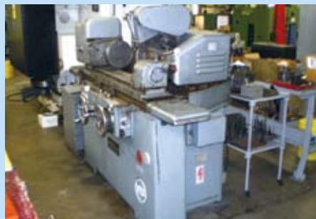
MSO O.D./I.D. Grinder