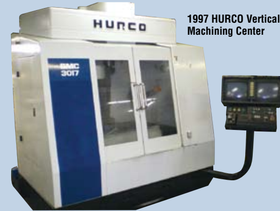
1997 HURCO Vertical Machining Center

WEDNESDAY, DECEMBER 6th • 10 AM LOCAL TIME