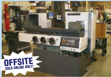
BROWN & SHARPE '818 Techmaster' Surface Grinder