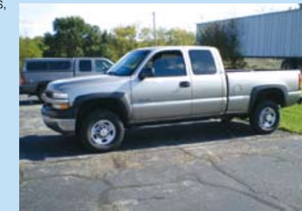
2001 CHEVY 3/4 Ton 2500 Crew Cab