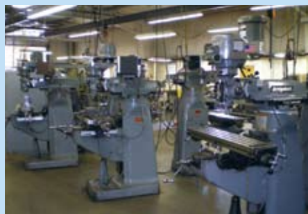
(3 of 6) BRIDGEPORT Vertical Milling Machines