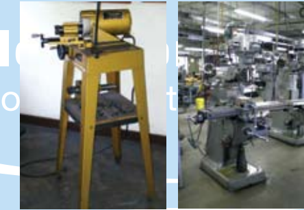
LEFT PIC: DAREX End Mill Sharpener RIGHT PIC: Various BRIDGEPORT Milling Machines