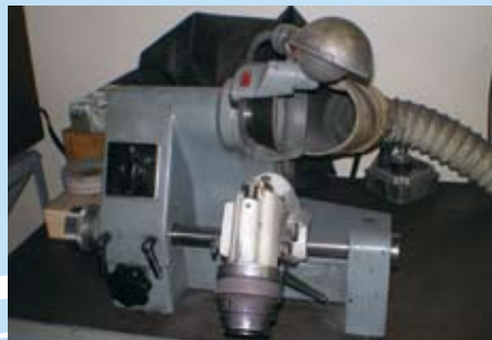
AEG Tool Sharpener