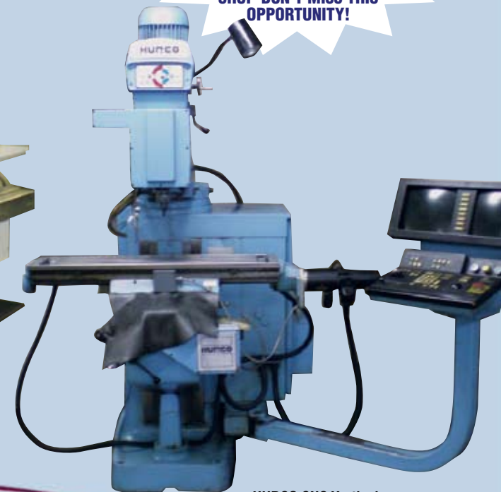
HURCO CNC Vertical Milling Machine

INDUSTRIAL AUCTION COMPLETE TOOL & MOLD SHOP-DON'T MISS THIS OPPORTUNITY!