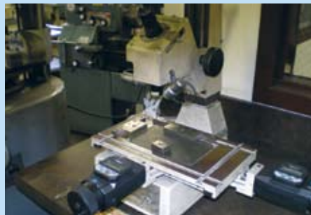
MITUTOYO Toolmakers Microscope