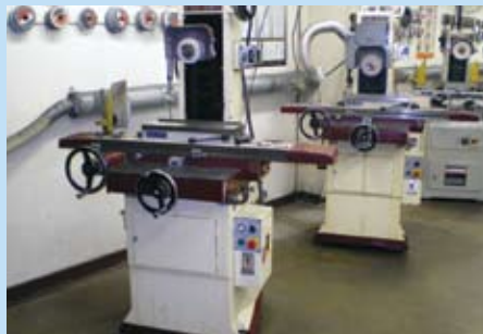
Lg. Qty. of Various Surface Grinders