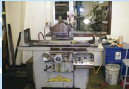
ELB Wet Type Surface Grinder