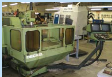
1998 DECKEL CNC Universal Milling Machine