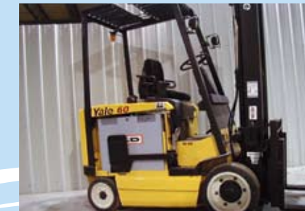
Various Late Model Electric Fork Lifts

Various Office Furnishings & Equipment To Include: Desks, Chairs, Tables, Bookshelves, White & Bulletin Boards, Refrigerators, Microwaves, Etc.