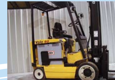
Various Late Model Electric Fork Lifts

Various Office Furnishings & Equipment To Include: Desks, Chairs, Tables, Bookshelves, White & Bulletin Boards, Refrigerators, Microwaves, Etc.