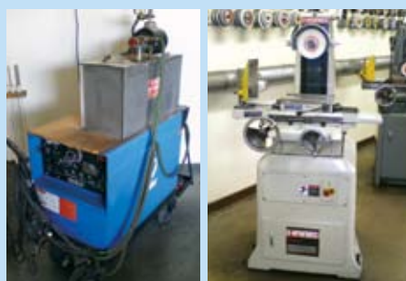
LEFT PIC: MILLER Dialarc HF Welding Unit RIGHT PIC: HARIG Surface Grinder