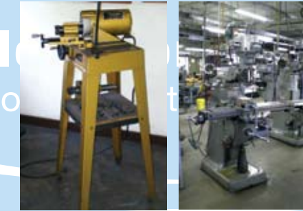
LEFT PIC: DAREX End Mill Sharpener RIGHT PIC: Various BRIDGEPORT Milling Machines