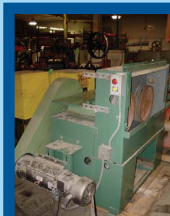
DS DUAL REEL CAPSTAN