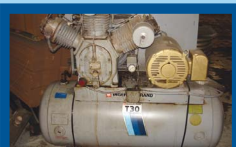
INGERSOLL RAND 30 HP AIR COMPRESSOR