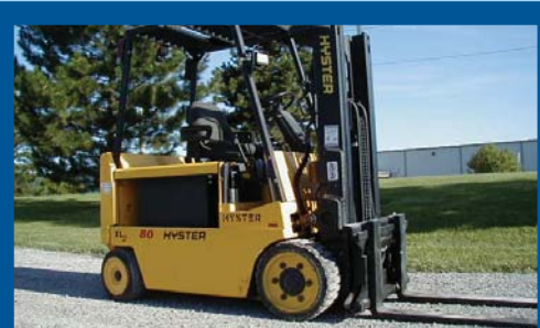
2000 HYSTER 8,000 LB FORK LIFT