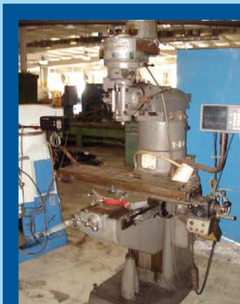
BRIDGEPORT VERTICAL MILL