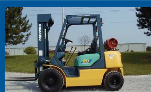
1998 KOMATSU 4,000 LB FORK LIFT