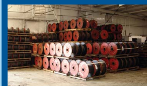
LG QTY VARIOUS SPOOLS