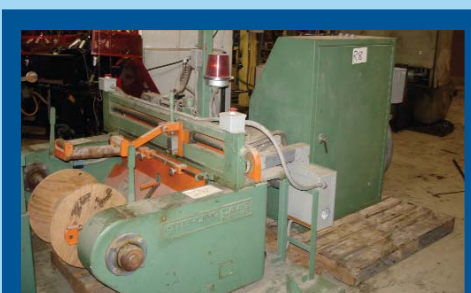
STERLING DAVIS DUAL TAKE-UP