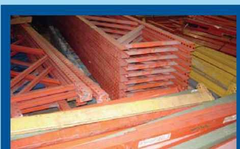
LG QTY OF VARIOUS PALLET RACKING OVER 50 SECTIONS