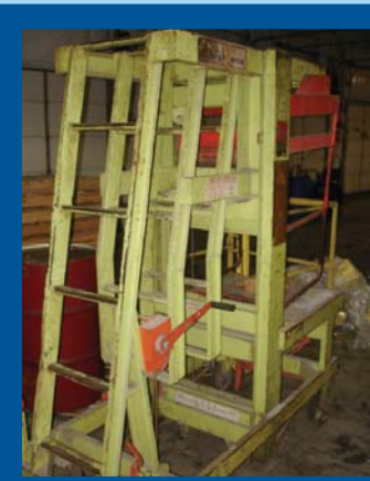
1 OF 3 HIGH HORSE MANUAL PERS LIFTS