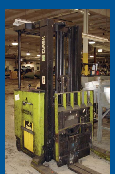
CLARK ELECTRIC STAND UP PICKER TRUCK