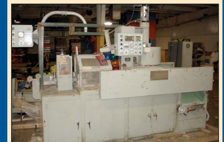
OHMIYA SEIKE RING COILER

WED., SEPT. 20TH & THURS. SEPT. 21ST - 10:00 AM