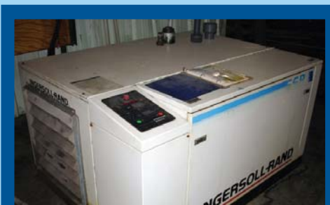
INGERSOLL RAND 50 HP ROTARY SCREW AIR COMPRESSOR