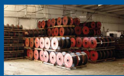
LG QTY VARIOUS SPOOLS