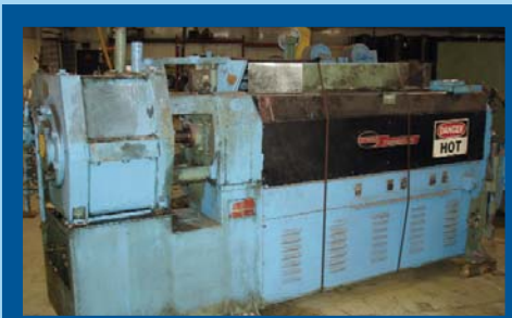
(1) OF (3) VARIOUS ENTWISTLE EXTRUDERS