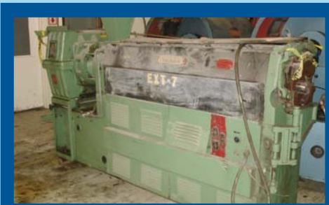
DAVIS STANDARD EXTRUDER