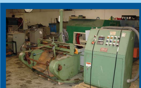
STERLING DAVIS DUAL TAKE-UP