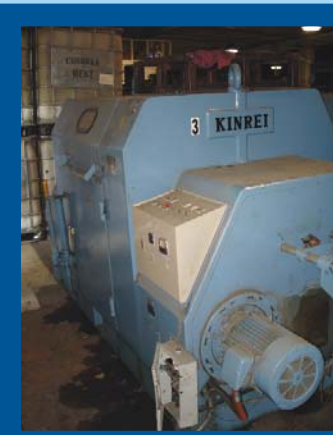
KINREI B650 BUNCHER