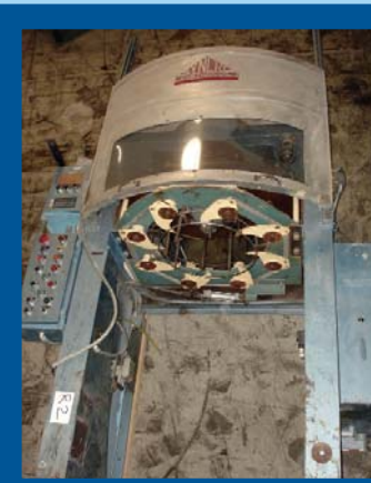
SYNCRO BARREL PACKER