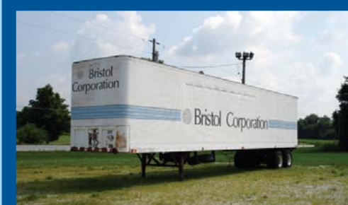
FRUEHAUF OVER THE ROAD BOX TRAILER