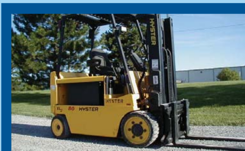
2000 HYSTER 8,000 LB FORK LIFT