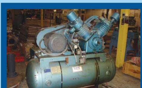
TRI-STATE 20 HP AIR COMPRESSOR