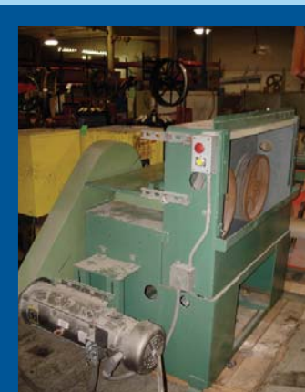
DS DUAL REEL CAPSTAN