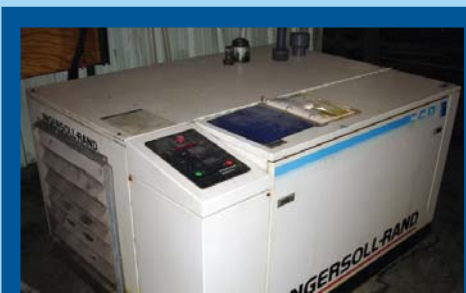
INGERSOLL RAND 50 HP ROTARY SCREW AIR COMPRESSOR