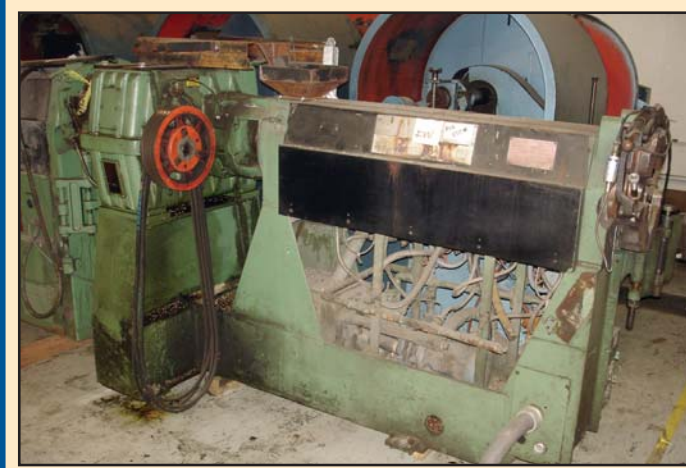
DAVIS STANDARD EXTRUDER

Day 2: 7222 Engle Road, Fort Wayne, IN 46804