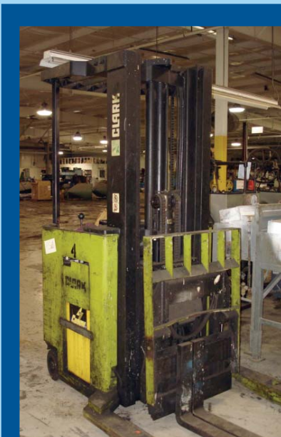
CLARK ELECTRIC STAND UP PICKER TRUCK