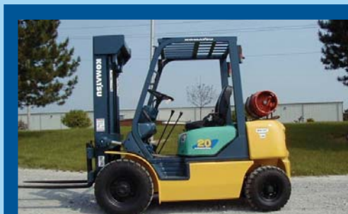
1998 KOMATSU 4,000 LB FORK LIFT