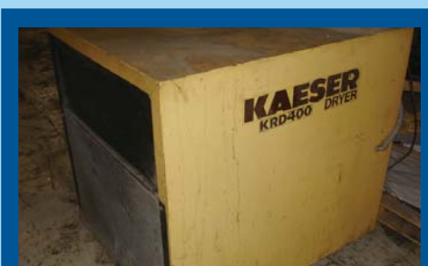
KAESER AIR DRYER