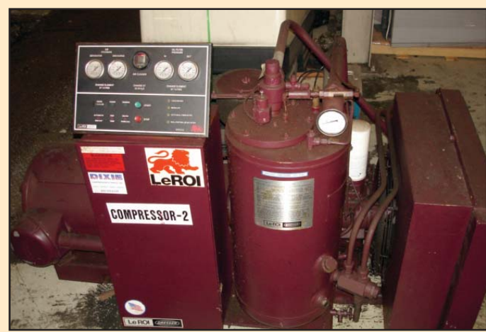
(1) OF (3) LEROI ROTARY SCREW AIR COMPRESSORS