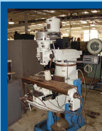
BRIDGEPORT VERTICAL MILL