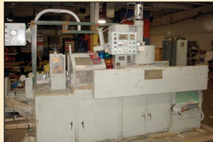
OHMIYA SEIKE RING COILER

DAY 2: HIGH END EXECUTIVE OFFICE FURNITURE & EQUIPMENT