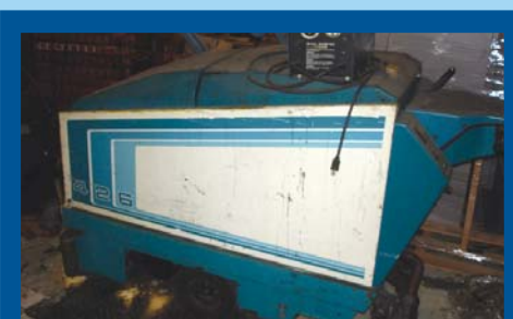
1 OF 3 TENNANT FLOOR SCRUBBERS