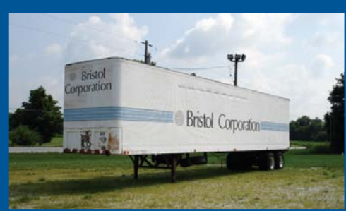
FRUEHAUF OVER THE ROAD BOX TRAILER