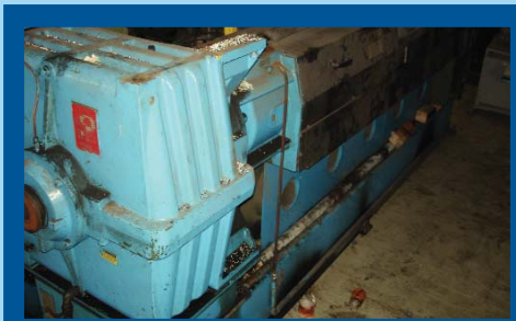
DAVIS STANDARD EXTRUDER