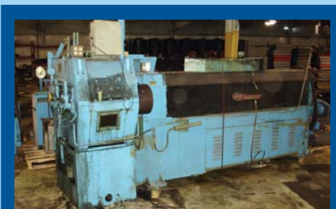
ENTWISTLE 4.5 EXTRUDER