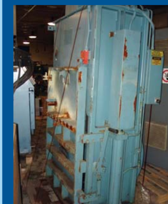
(1) OF (3) CARDBOARD BALER