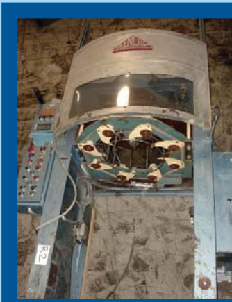
SYNCRO BARREL PACKER