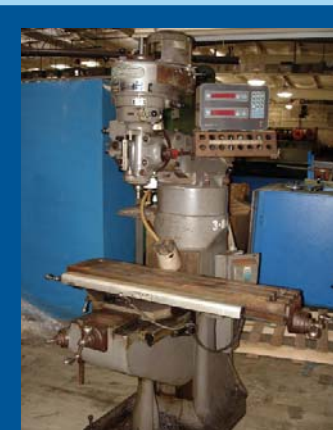
BRIDGEPORT VERTICAL MILL