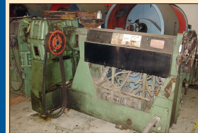
DAVIS STANDARD EXTRUDER

Day 2: 7222 Engle Road, Fort Wayne, IN 46804