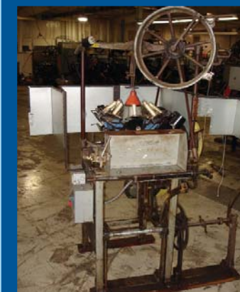
OVER 30 16-C BRAIDERS